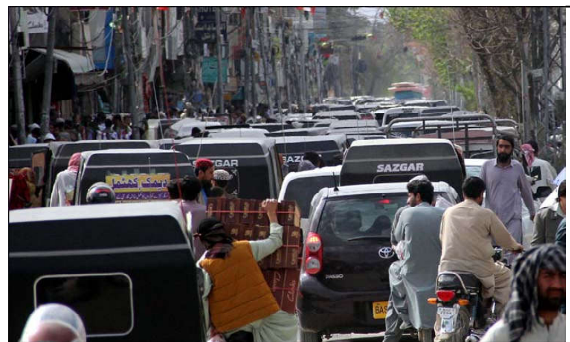
QUETTA: A large number of vehicles stuck in traffic jam at Bacha Khan Chowk while people busy in shopping as they are preparing for the occasion of Eid-ul-Fitar coming ahead, in Quetta.