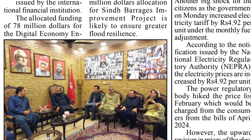
PESHAWAR: Peoples Party (PPP) Chairman, Bilawal Bhutto Zardari concedes with Aimal Wali Khan, KPK President Awami National Party (ANP) over the death of his mother during meeting held in Charsadda.

enhancement Project is expected to enhance financial management through technology-driven solutions and data-driven decision-making. The investment in digital economy is also likely to streamline public services, increase transparency and foster economic growth. Simultaneously, the 71.7 million dollars allocation for Sindh Barrages Improvement Project is likely to ensure greater flood resilience.