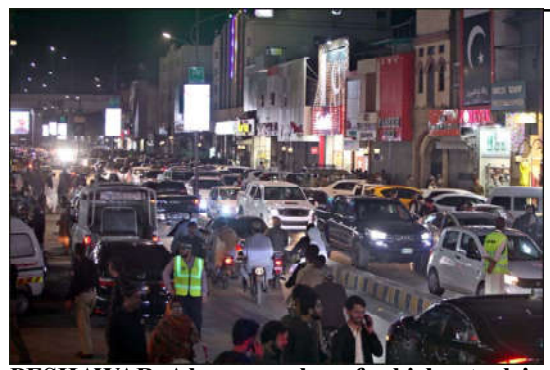
PESHAWAR: A large number of vehicles stuck in traffic jam at Saddar market while people busy in shopping as they are preparing for the occasion of Eid-ul-Fitar coming ahead, in Peshawar.

KARACHI (APP): The largest Namaz-e-Eidul Fitr gathering under the management of Karachi Metropolitan Corporation (KMC) will be held in Gulshan-e-Jinnah (Old Polo Ground), here at 8 a.m. The flags of different Muslim countries are being raised to express solidarity. Apart from cleanliness around the Eid Gah, the entrance and exit routes are also being made better for the faithfuls. Strict security arrangements have been made for Eid prayers. Along with arrangements for abatement for the citizens coming for Eidgah, cleaning and disinfecting spray will also be performed.