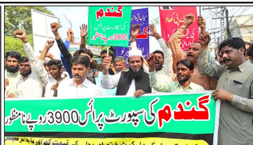
LAHORE: Members of Kissan Board Pakistan are holding protest demonstration against wheat support price, in Lahore.

ISLAMABAD (APP): Pakistani Rupee on Monday witnessed a devaluation of 02 paise against the US dollar in the interbank trading and closed at Rs277.94 against the previous day's closing of Rs277.92.