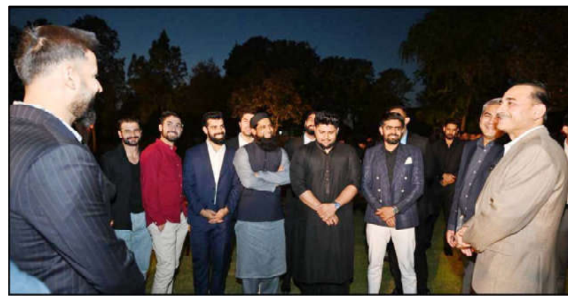
RAWALPINDI: General Syed Asim Munir, NI (M), Chief of Army Staff (COAS) interacting with players of Pakistan cricket team during an Iftar dinner hosted by him

As a result, Ramadan will continue until April 9, completing 30 days, and Eidul Fitr will be celebrated on April 10 in Saudi Arabia.