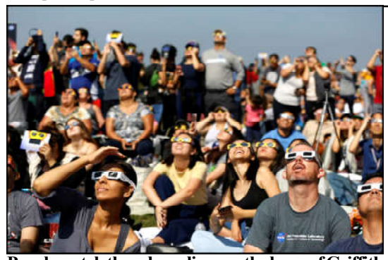
People watch the solar eclipse on the lawn of Griffith Observatory in Los Angeles, California, U.S.

Monitoring Desk MOSCOW: Russia said Ukraine struck the Zaporizhzhia nuclear power station controlled by Russian forces three times on Sunday and demanded the West respond, though Kyiv said it had nothing to do with the attacks. The International Atomic Energy Agency, which has experts at the site, said it was the first time the nuclear plant, Europe's largest, was directly targeted since November 2022 and said the attack had endangered nuclear safety. Russian forces took control of the plant in 2022 shortly after their full-scale invasion of Ukraine. Both Moscow and Kyiv have repeatedly accused each other of risking a nuclear accident by attacking the plant. Russia's state nuclear corporation, Rosatom, said Ukraine attacked the plant three times on Sunday with drones, first injuring three near a canteen, then attacking a cargo area and then the dome above reactor No 6. "Zaporizhzhia nuclear power station has been subjected to an unprecedented series of drone attacks, a direct threat to the safety of the plant," Rosatom said. "The radiation levels at the plant and the surrounding area have not changed," it said. A Ukrainian intelligence official said Kyiv had nothing to do with any strikes on the station and suggested they were the work of Russians themselves. "Russian strikes, including imitation ones, on the territory of the Ukrainian nuclear power plant ... have long been a well known criminal practice of the invaders."