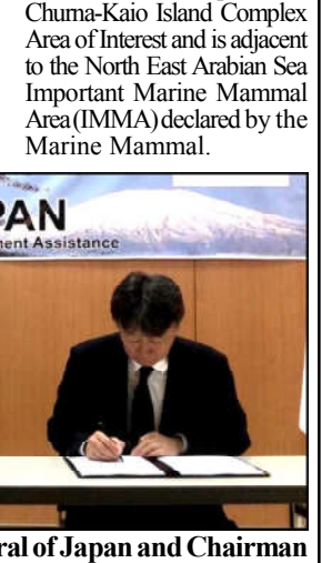
QUETTA: Consul General of Japan and Chairman Kuchlak Welfare Association signing a MoU