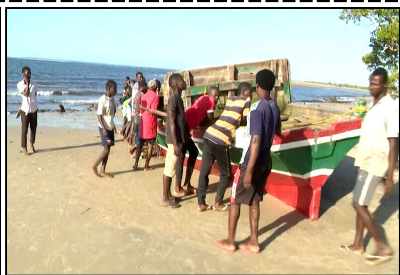
Boat that sunk off the north coast of Mozambique killing 96 people on the Island of Mozambique.