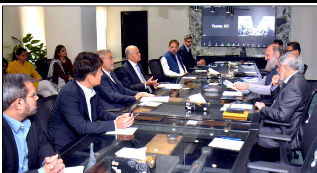
KARACHI: Federal Minister for Commerce, Jam Kamal Khan meeting with Pakistan Business Council.

He urged the philanthropists to provide financial assistance to the Shuhada Forum so as to help the families of martyrs in big way.