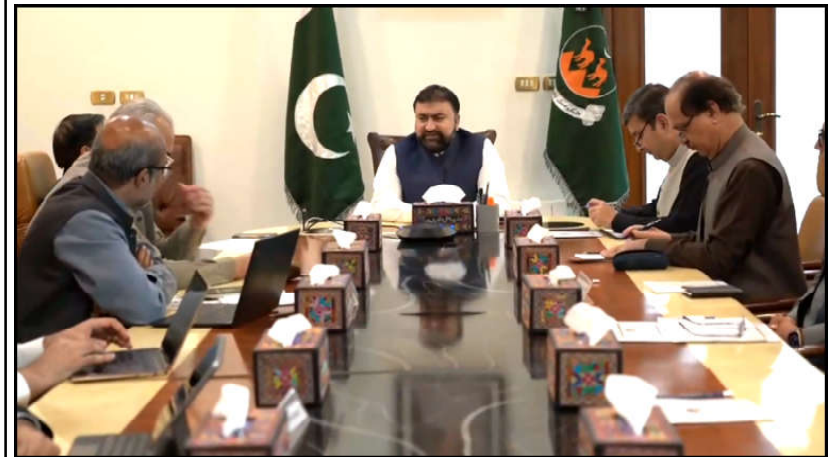
QUETTA: Chief Minister Mir Sarfraz Bugti chairing first meeting of Reforms Committee