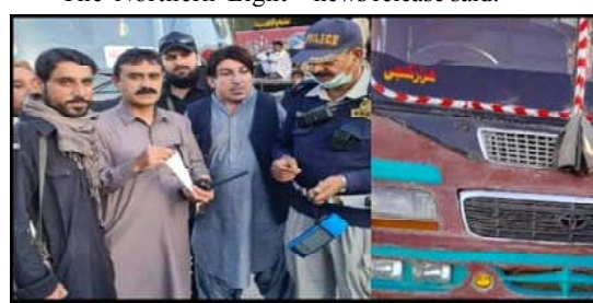
QUETTA: On the directives of Commissioner Quetta Division staff of RTA and Traffic Police taking action against transports who charged extra fares

Infantry (NLI) battalion headquarters was completely destroyed in the tragedy while none of the people present could be rescued alive as 129 soldiers were martyred when an avalanche struck the military unit, an Inter Services Public Relations (ISPR) news release said.