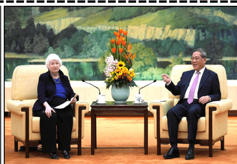
US Treasury Secretary Janet Yellen meets with Chinese Premier Li Qiang at the Great Hall of the People in Beijing.

"Local governments play a critical role, from boosting consumption to addressing overinvestment and Beijing of course has particular importance," she said. A senior treasury official told reporters on Saturday that Washington believes household spending needs to be a bigger part of China's economy. Speaking to professors from the Peking University National School of Development, Yellen said she was keen to hear their perspectives on "the potential long-term impacts of today's policy decisions".