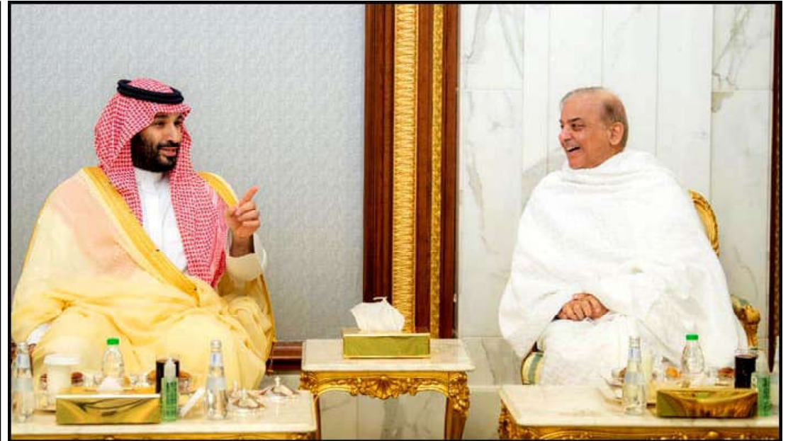
MAKKAH: Prime Minister Shehbaz Sharif meeting with Crown Prince Mohammed Bin Salman at Al-Safa Palace

Roza-e-Rasool (PBUH). He especially prayed for progress and prosperity of Muslim Ummah and nation. He also made special prayers for oppressed Muslims of Palestine and Indian Illegally Occupied Jammu and Kashmir.