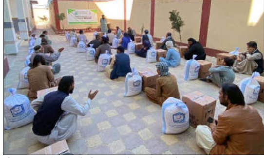
QUETTA: Relief goods is being distributed among needy persons during food aids distribution ceremony organized by charitable organization during the Holy Month of Ramadan-ul-Mubarak.