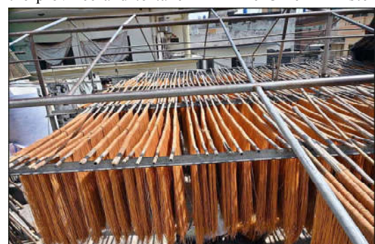
RAWALPINDI: A worker hanging vermicelli for dry at his workplace as demand increased for upcoming Eidul Fitr Festival.

The head office received a total of 313 complaints against Islamabad Electric Supply Company, 268 Peshawar Electric Supply Company, 223 Hyderabad Electric Supply Company, 419 K-Electric, 133 Sukkur Electric Supply Company.