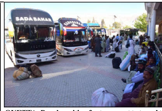
QUETTA: People waiting for transport to travel to hometowns to celebrate Eid ul Fitr with their loved ones at a local bus stand

Independent Report QUETTA: The dead body of labourer killed by unknown armed men in Panjgur on Saturday was dispatched to the native area, Rajanpur (Punjab) from Quetta on Sunday. The body of slain labourer was brought to Quetta from Panjgur on late Saturday night. According to the Commissioner Quetta, the ambulance and financial assistance was provided for sending the body of labourer to Rajanpur. The Chief Minister Balochistan, Mir Sarfraz Ahmed Bugti had issued directives for making arrangements in this regard.