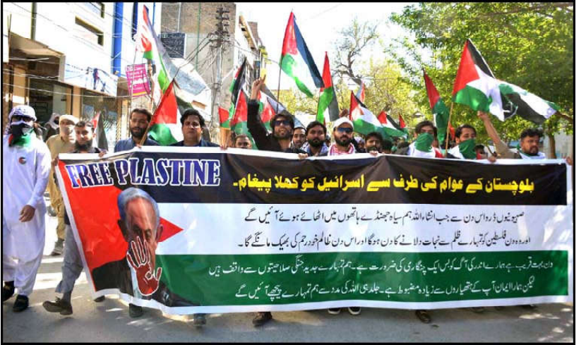
QUETTA: Members of Civil Society Balochistan are holding protest demonstration against Israeli cruel and inhumane acts and express unity with the innocent people of Palestine, at Quetta press club.

She said that it is included in our priority to engage the women in all sectors especially health, education and vocational training so that they are able to play their vital role in the country's development and prosperity.