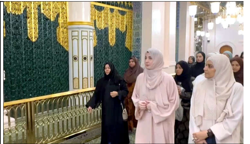
MADINA MUNAWWARAH: Chief Minister Punjab Maryam Nawaz Sharif paying respect at Roza-e-Rasool (SAWW)

activities and criminal elements. The provincial government had failed miserably in protecting the lives and property of people, he noted. The law and order was worsening in not just Karachi but also in the entire province, he added — a clear reference to the dacoits operating freely in the Katcha area located along Indus River in upper Sindh. Subzwari also mentioned that the mobile phones and bikes snatched or stolen in Karachi were not "airlifted" to other parts of the country. The goods were transported by road, he said and questioned how and why the police were not able to confiscate the same.