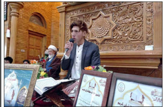
SKARDU: A participant reciting Holy Quran during the Husn-e-Qiraat and Hafiz Quran competition at Jamia Masjid Skardu-Baltistan in the Holy Month of Ramadan.