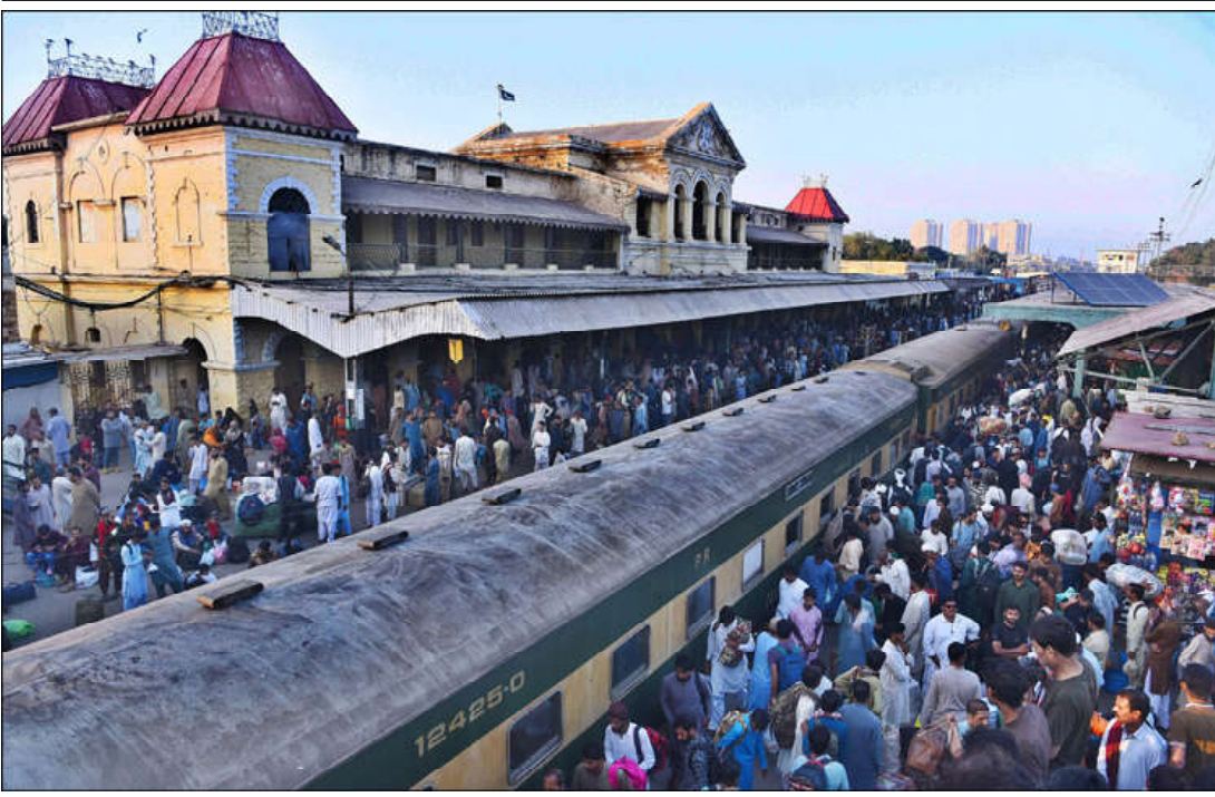
KARACHI: A large number of people getting board on Eid Special Train at Cantt Railway Station, departing to their home towns to celebrate Eidul Fitr, festive with their loved ones.