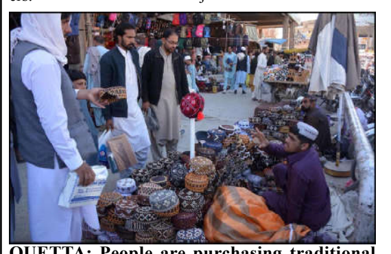
QUETTA: People are purchasing traditional Baloch caps fro Eid from the roadside vendor.

The participants strongly condemned the harassment of the senior journalist by the Medical Superintendent of Civil Hospital and the lab Assistant. They said that the media persons are being harassed through different tactics on doing reporting based on facts. Due to the situation, the real media persons are going to be unsafe, which is condemnable, they said. They said that an application had been submitted in the police station against harassment of the journalist but instead of taking action on it, a bogus case was registered against the journalist.