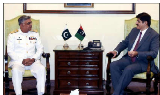
KARACHI: The Chief of Naval Staff Admiral Naveed Ashraf called on the Sindh Chief Minister Syed Murad Ali Shah at Chief Minister House.

KARACHI (INP): Murders over resistance during robberies continue in the metropolis and 54 citizens have been killing across the city in last three months. In recent incident, armed robbers gunned down two citizens over resistance in Manghopir area of Karachi. A cop in plain dress was shot injured during a robbery near nursery at Shahrah-e-Faisal. In another CCTV footage, robbers were seen looting people at a hotel in Gulistan-e-Johar while doing Sehri. Two accused of looting electronic shop in Buffer Zone were arrested during a joint raid of police and Sindh Rangers in Orangi Town. The citizens expressing grave concerns over surge in killing over resistance during robberies have demanded of the authorities for taking notice and directing strict action.