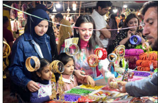
ISLAMABAD: Women busy in shopping for upcoming Eid ul Fitr Festival at a local market, in Federal Capital.

About Eid Shopping trends, Noori also revealed a dilemma that customers,