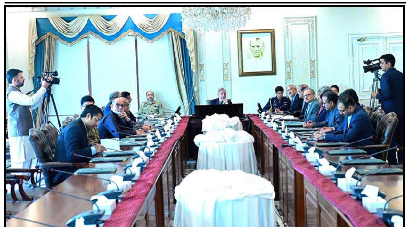
ISLAMABAD: Prime Minister Muhammad Shehbaz Sharif chairs a meeting regarding security situation in the country.

The meeting expressed the resolve to stamp out the scourge of terrorism with the support of the nation.