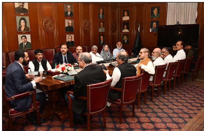
KARACHI: Mr. Attaullah Tarar, Federal Minister for Information and Broadcasting in a meeting with a delegation of CPNE.