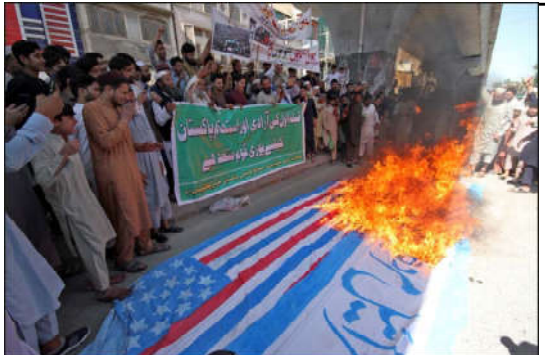
PESHAWAR: Participants are holding demonstration against USA and Israel as they are marking Youm-ul-Quds to show solidarity with people of Palestine, organized by National Ulama and Mashaikh Council outside Sunehri Mosque.

He further directed that the defective and useless vehicles, currently parked at the warehouse of the Excise department, should also be auctioned in a transparent manner, and made it clear that these vehicles should not be handed over to anyone on political recommendation.