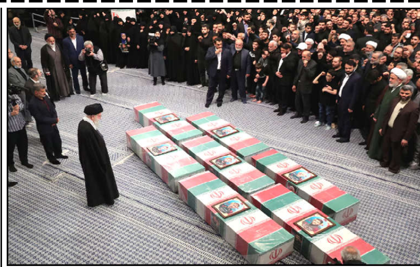
Iran's Supreme Leader, Ayatollah Ali Khamenei looks at the coffins of members of the Islamic Revolutionary Guard Corps who were killed in the Israeli airstrike on the Iranian embassy complex in the Syrian capital Damascus, during a funeral ceremony in Tehran, Iran.

ing, saying it would not help the cause of peace in the South Caucasus, a strategic region criss-crossed by oil and gas pipelines. Speaking to journalists in Brussels, Blinken and EU president Ursula Von der Leyen and the bloc's foreign policy chief, Josep Borrell, said economic integration between countries in the South Caucasus region - in particular in the energy and telecoms sectors - was vital for ensuring the zone's stability. "The European Union and Armenia are increasingly aligned in values and interest", Von der Leyen said, referring to the bloc's efforts to help Armenia boost its security capabilities and efforts "to make sure that lethal equipment and technologies do not end up in the hands of the Russian military".