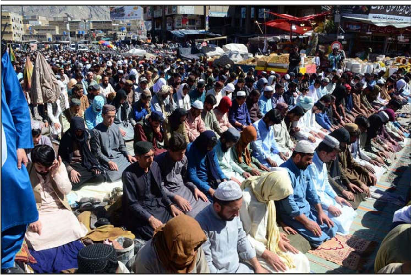
QUETTA: A large number of faithful offering Namaz-e-Jumma Tul Wida during Holy Fasting Month of Ramzanul Mubarak at Meezan Chowk.