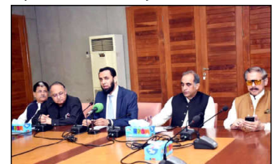
KARACHI: Mr. Attaullah Tarar, Federal Minister for Information and Broadcasting in a meeting with office-bearers of APNS.

He said health cards for medical treatment of journalists would be issued soon. Nobody would be allowed to violate rights of journalists and media work-