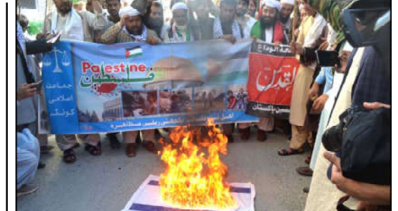
QUETTA: Participants are holding demonstration against USA and Israel as they are marking Yom-ul-Quds to show solidarity with people of Palestine, organized by Jamat-e-Islami (JI), in Quetta.

Meanwhile, participants of the seminar called for enforcing the RTI Act in true letter and spirit besides establishing the Information Commission at the earliest.