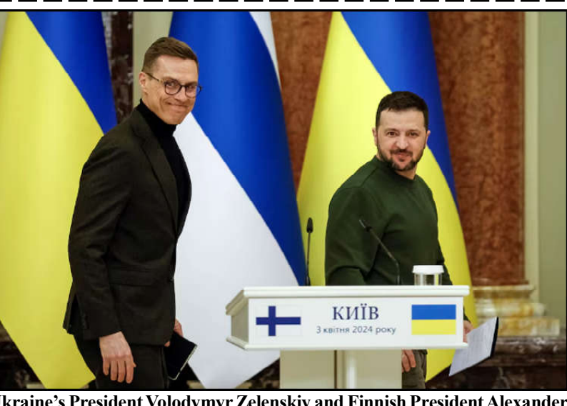
Ukraine's President Volodymyr Zelenskiy and Finnish President Alexander Stubb appear after a joint press conference, amid Russia's attack on Ukraine in Kyiv, Ukraine.

Fires are common in India, where builders and residents often flout building laws and safety codes. In 2019, a fire caused by an electrical short circuit engulfed a building in the Indian capital and killed 43 people. In 2022, a fire in a four-story commercial building in New Delhi killed at least 27