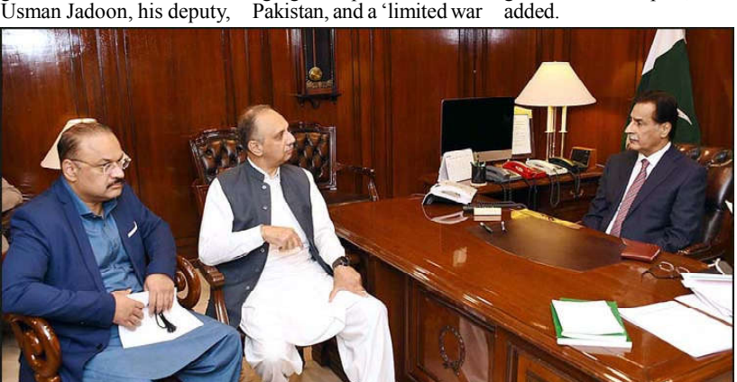
ISLAMABAD: Speaker National Assembly Sardar Ayaz Sadiq met with Leaders of Opposition Parties in National Assembly at Parliament House.

sador Akram said "Unless determined steps are taken by the international community to address this situation, it could emerge as the proximate cause of a regional and global catastrophe," he