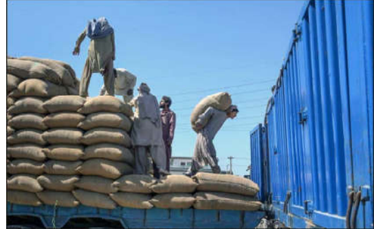
ISLAMABAD: Laborers busy unloading wheat sacks from delivery truck at grain Market in the Federal Capital.