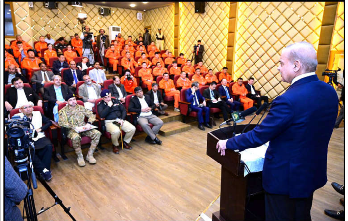
DAASU: Prime Minister Muhammad Shehbaz Sharif addresses the Chinese Engineers and government officials at Kass camp of China Gezhouba Group Company (CGGC).

He also assured the Chinese leadership, the people and the Chinese ambassador that all foolproof security arrangements would be made for the Chinese people working and supporting a prosperous and developing Pakistan.