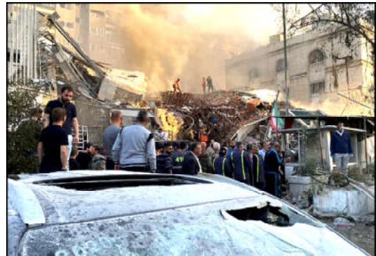
Smoke rises after what the Iranian media said was an Israeli strike on a building close to the Iranian embassy in Damascus, Syria.