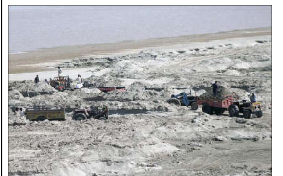
MULTAN: Labourers are busy loading sand on the tractor trolleys from the dry bed of the Chenab River.

supply, green urban spaces and integrated solid waste management. Besides Peshawar, the project is also going on in four cities of the KP including Mingora, Kohat, Mardan and Abbottabad. "Water Sanitations Services Peshawar (WSSP) is working in 5 operational zones of Peshawar. In these zones, there are 34 water tanks (water reservoirs) in which 23 will be reconstructed while 10 will be rehabilitated" said in the briefing. However, for collection of garbage, small and large loaders will be used aimed at cleaning the city, no waste touching the ground and for climate friendly disposal of solid waste. The ministers were further informed that those water reservoirs will be solarized where there is no issue of space.