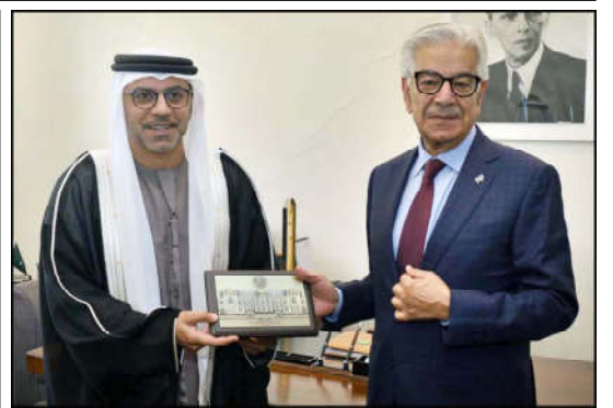
ISLAMABAD: Minister for Defence, Khawaja Muhammad Asif presenting a souvenir to Ambassador of the United Arab Emirates (UAE), H.E. Hamad Obaid Ibrahim Salem Al Zaabi.