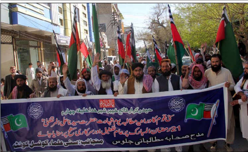
QUETTA: Members of Sunni Ulema Council (SUC) are holding protest demonstration for demanding public holiday on the occasion of Youm-e-Ali (A.S), the day of martyrdom 21st Ramadan-ul-Mubarak, at Quetta Press Club.