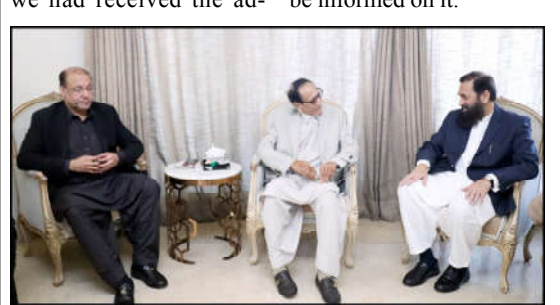
LAHORE: Governor Punjab Muhammad Balighur Rehman meeting with Chaudhry Shujaat Hussain at his resident. Provincial Minister Chaudhry Shafay Hussain is also present