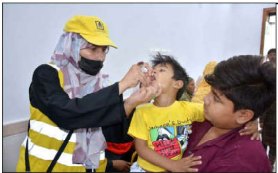
FAISALABAD: A lady health worker administering polio drops to a child during 7-days anti polio campaign in the city.

Speaking on this occasion, he said that UET Narowal Campus was his dream for which he had worked hard to achieve. "Behind the development of the modern world is the hard work of engineers. The solution of most of the problems of all sectors of life, including health, food, and industry is related to the field of engineering. Today we are living in the era of technology, today's era is the era of artificial intelligence," he added. He said, "If you want to establish your place in the world of education and research, you need to go through the process of continuous learning. We have established departments like National Center for Satellite Technology.