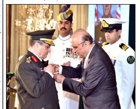
Monday conferred Nishan-i-Imtiaz (Military) upon Commander of the Turkish Land Forces General Selcuk Bayraktaroglu, in a special investiture ceremony held at the Aiwan-e-Sadr.

ISLAMABAD (APP): President Asif Ali Zardari on