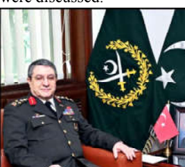
Commander Turkish Land Forces General Selcuk Bayraktaroglu meeting with Chief of Army Staff General Asim Munir at General Headquarters in Rawalpindi

Earlier on arrival at GHQ, the Commander Turkish Land Forces, laid wreath at Yadgar-e-Shuhada. A smartly turned out contingent of Pakistan Army presented the guard of honour to the visiting dignitary.