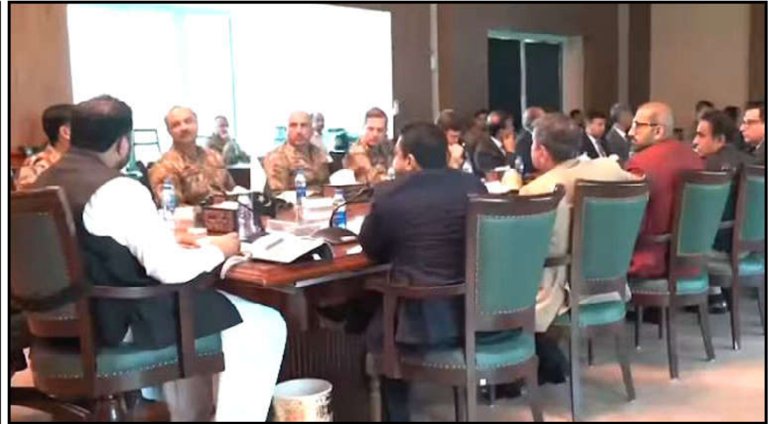
QUETTA: Balochistan Chief Minister Mir Sarfraz Ahmed Bugti presiding over 16th meeting of Provincial Apex Committee

The process of repatriation of more illegal immigrants to their country as per the guideline and decision of federal government was made conditional with the timeline decided.