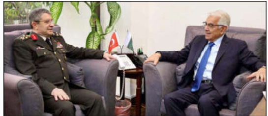
ISLAMABAD: H.E. General Selcuk Bayraktaroglu, Commander of Turkish Land Forces called on Minister for Defence & Defence Production, Khawaja Muhammad Asif.

(iii) in sub-section (4), for the expression "a Special Bench, constituted", the expression "Special Bench or the Special Benches, as the case may be, to be constituted by the Chief Justice.