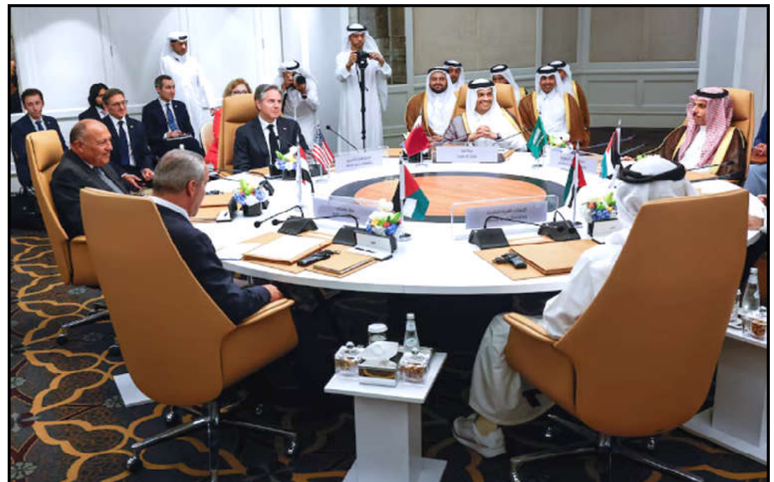
U.S. Secretary of State Antony Blinken attends the U.S.-Arab Quint Meeting with representatives from Egypt, Jordan, Saudi Arabia, Qatar, the United Arab Emirates and the Palestinian Authority, at the Four Seasons Hotel in Riyadh, Saudi Arabia.

U.S. Secretary of State Antony Blinken said Monday that Israel must still do more to increase the flow of humanitarian aid into the besieged Gaza Strip and that he would use his current Middle East trip - his seventh to the region since the Israel-Hamas war started in October - to press that case with Israeli leaders.