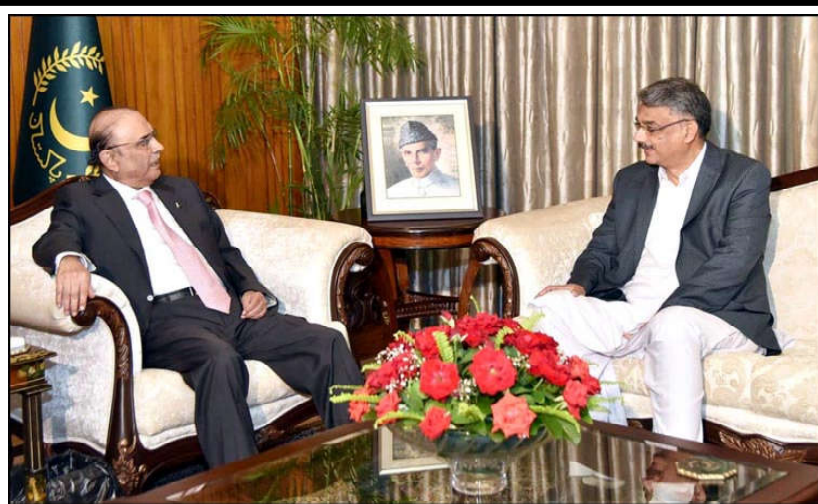
ISLAMABAD: Prime Minister of Azad Jammu and Kashmir (AJK), Anwar-ul-Haq called on President Asif Ali Zardari at Aiwan-e-Sadr.

the art hospital according to the world standard. The hospital is equipped with modern technology offering 24 hour emergency services.