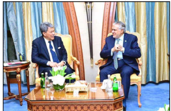
the sidelines of the Special Meeting of the World Economic Forum (WEF) being held here, two sides agreed to hold the next round of Joint Ministerial Commission meeting in Islamabad during the year.

In the Joint Ministerial Commission meeting, the two sides will study the markets and take full advantage of the opportunities offered in various sectors for tangible economic