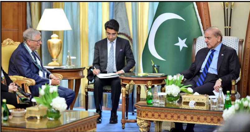
RIYADH: Founder and Co-chair of the Bill and Melinda Gates Foundation Bill Gates calls on Prime Minister Muhammad Shehbaz Sharif on the sidelines of a special meeting of the World Economic Forum.

Condemning the human rights violations and the atrocities being committed by the Indian occupation forces in IIOJK, he called upon the international community to put pressure on India to end human rights violations being committed by its security forces and implement the UN Security Council resolutions.