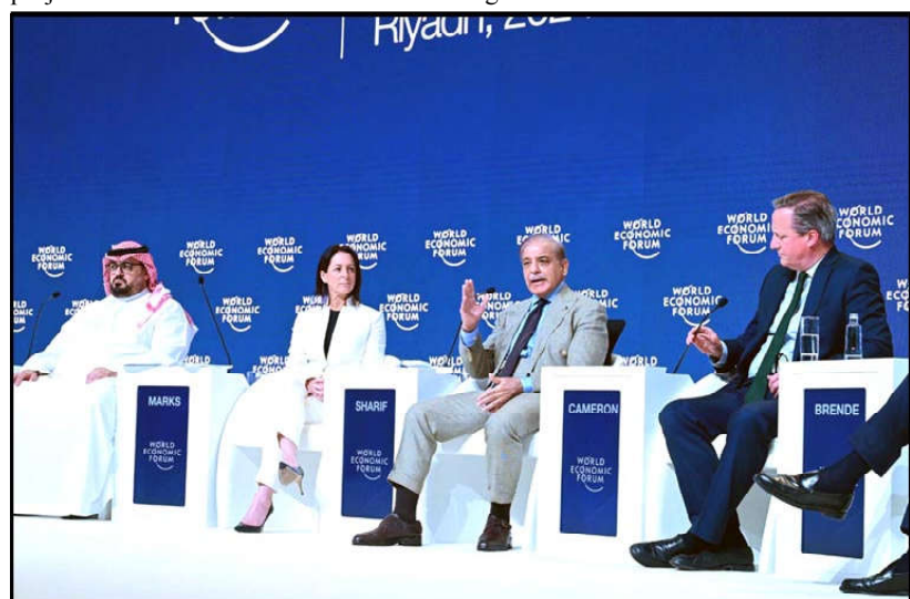
RIYADH: Prime Minister Muhammad Shehbaz Sharif speaks at a Closing Plenary-Rejuvenating Growth, at a Special Meeting of the World Economic Forum.