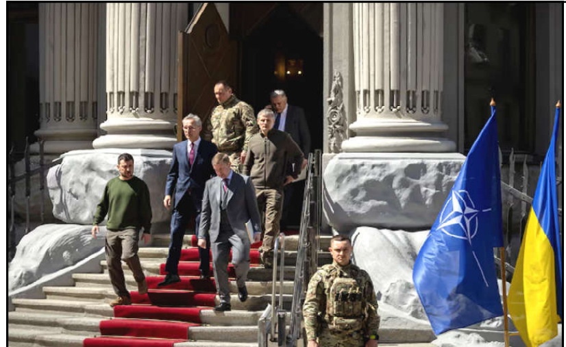
Ukraine's President Volodymyr Zelenskyy and NATO Secretary-General Jens Stoltenberg arrive for a press conference, amid Russia's attack on Ukraine, in Kyiv, Ukraine.