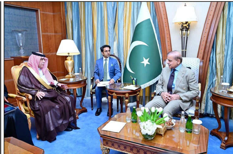
RIYADH: Saudi Minister for Commerce H.E. Majid Al Kasabi calls on Prime Minister Muhammad Shehbaz Sharif.

Finance Minister Muhammad Aurangzeb, Commerce Minister Jam Kamal Khan, Information and Broadcasting Minister Attallah Tarar, Petroleum Minister Dr Musaddik Malik and Special Assistant to PM Tariq Fatemi also attended the meeting.