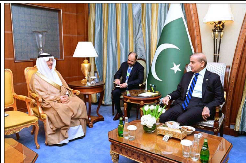
RIYADH: President of Islamic Development Bank Dr. Muhammad Sulaiman Al Jasser calls on Prime Minister Muhammad Shehbaz Sharif.

As the weather warmed up and the Chinese New Year holiday ended in February, China's e-commerce logistics market logged steady expansion, said the federation.