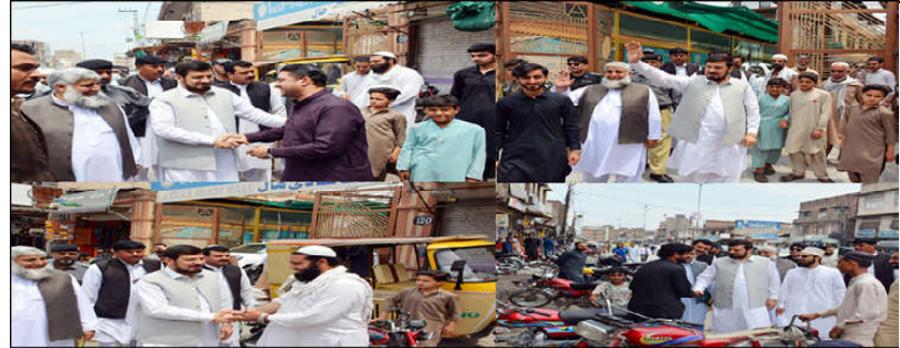
PESHAWAR: Khyber Pakhtunkhwa Governor Haji Gulam Ali meeting with people and shopkeepers during his visit to interior city Peshawar.