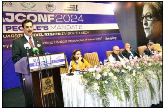
LAHORE: Chairman Senate, Syed Yusuf Raza Gillani addressing to Asma Jahangir conference.

He pledged to make Balochistan the land of peace by eliminating the terrorists.