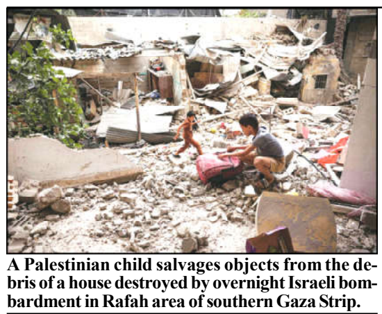
A Palestinian child salvages objects from the debris of a house destroyed by overnight Israeli bombardment in Rafah area of southern Gaza Strip.

put out fires at several energy facilities in the western regions of Lviv and Ivano-Frankivsk, which border Nato members Poland and Romania. After strikes on energy facilities in the central Dnipropetrovsk region, running water supplies were disrupted in President Volodymyr Zelensky's hometown of Kryvyi Rih, officials said. Ukrainian air defences brought down 21 of the 34 incoming missiles, the commander of the air force said in a statement. None of the facilities hit was identified by name, a security measure intended to prevent Russia quickly assessing the impact of its strikes. Russia denies targeting civilians, but says the Ukrainian energy system is a legitimate military target.