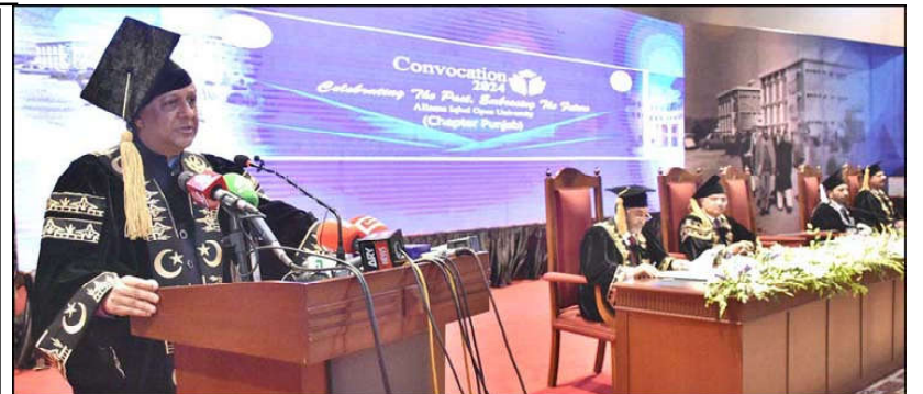
LAHORE: Federal Minister for Law and Justice Senator Azam Nazeer Tarar addressing at 37th Convocation of Allama Iqbal Open University (AIU).