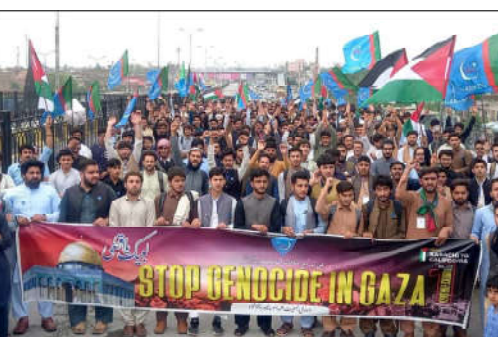
PESHAWAR: Members of Islami Jamiat Tulba are holding protest rally against Israeli cruel and inhumane acts and express unity with the innocent people of Palestine, at GT road in Peshawar.