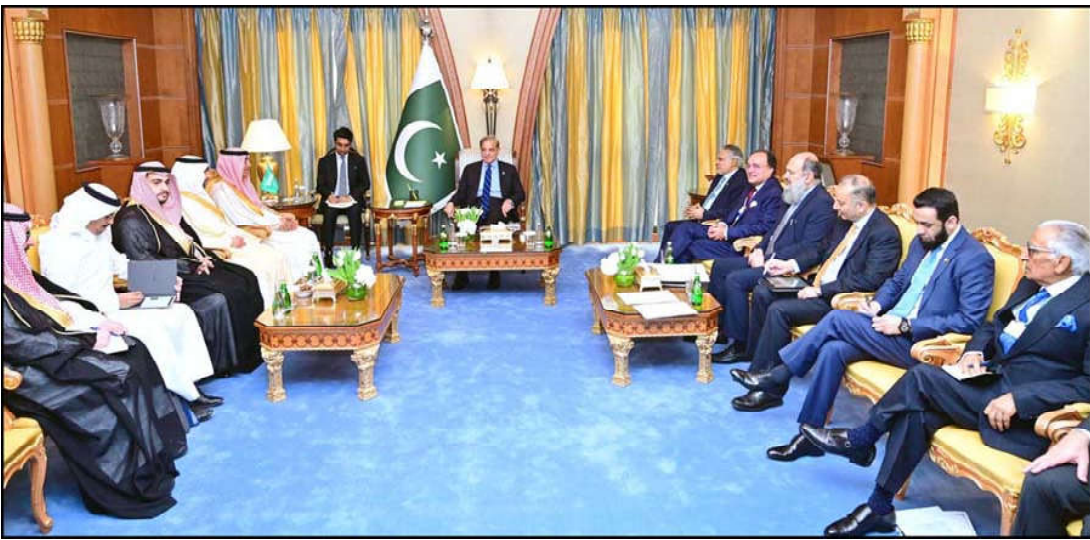
RIYADH: Saudi Minister for Finance H.E. Mohammad Al Jadaan calls on Prime Minister Muhammad Shehbaz Sharif on the sidelines of a Special Meeting of the World Economic Forum.