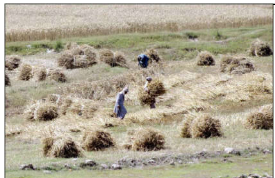
MULTAN: Farmers are busy making bundles after harvesting wheat crop in their field for drying.

He observed that IDB's beneficial partnership with Pakistan was not only providing job opportunities and assisting in reconstruction efforts but also supporting the government's endeavours for achievement of objectives of sustainable progress.