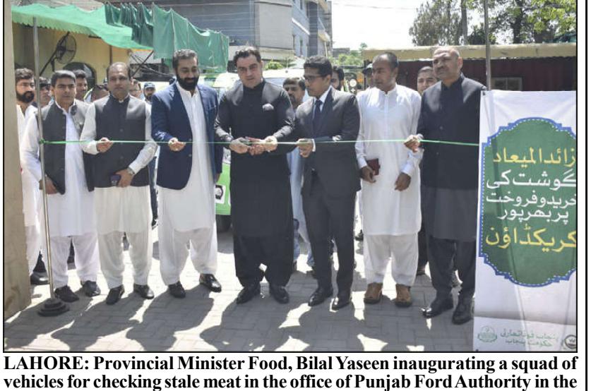
vehicles for checking stale meat in the office of Punjab Ford Authority in the provincial capital, along with DG Food Authority, Asim Javed and others in the Provincial Capital.