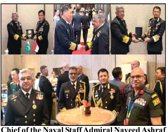
Chief of the Naval Staff Admiral Naveed Ashraf interacting with Naval Heads of various Navies during 19th Western Pacific Naval Symposium in Qingdao China.

The spokesperson said the report clearly demonstrated the double standards thus undermining the international human rights discourse.