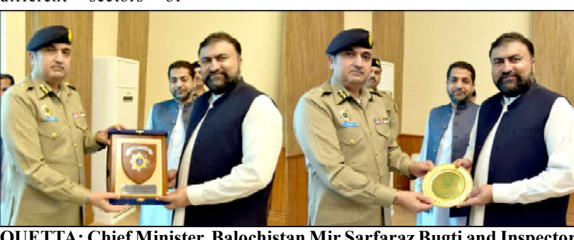
QUETTA: Chief Minister Balochistan Mir Sarfaraz Bugti and Inspector General Motorway Police Salman Chaudhry exchanging souvenirs

She mentioned that we are assisting the government in resettlement of the flood He also pointed out to- affected people as well as wards the potential of in- alternative sources of entainable development goals (SDGs) in the province under UNDP.