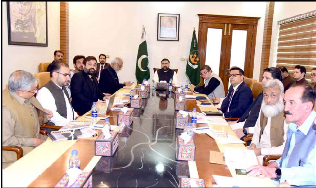
QUETTA: Balochistan Chief Minister Mir Sarfaraz Bugti presiding over a meeting review progress of Mangi Dam

Ph: 2841470/2841473 Vol: XIX No. 303, Shawwal 16, 1445 AH Thursday April 25, 2024, Pages 04, Price Rs.15