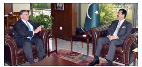
ISLAMABAD: Chairman Senate Syed Yousuf Raza Gillani (right) meeting with US Ambassador to Pakistan Donald Blome (left) on Wednesday.

enhancing public and legislative engagement.