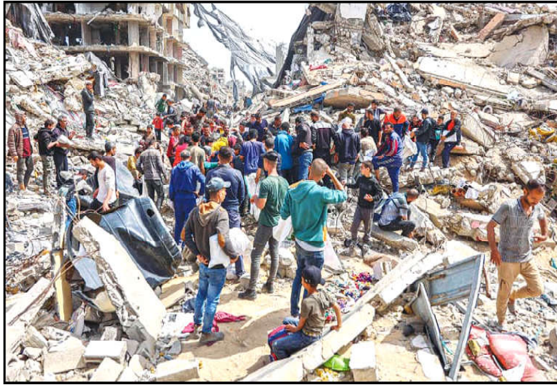
People gather by a destroyed building at the site of a drop of humanitarian aid in the northern Gaza Strip.

claims it had buried Palestinian bodies were "baseless and unfounded", without directly addressing allegations that Israeli troops were behind the killings.