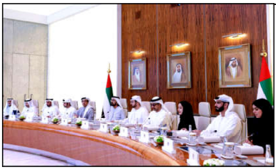
United Arab Emirates announced $544 million to repair the homes of Emirati families in a cabinet meeting.

the world's busiest for international passengers. "A ministerial committee was assigned to follow up on this file [...] and disburse compensation in cooperation with the rest of the federal and local authorities," said Sheikh Mohammed, who is also the ruler of Dubai, which was one of the worst hit of the UAE's seven sheikhdoms.