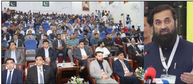
LAHORE: Governor Punjab Muhammad Balighur Rehman addressing the opening session of the International Climate Change Conference organized by a private university in Sialkot.