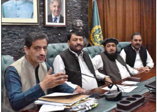
GILGIT: Provincial Minister Gilgit-Baltistan addressing a press conference after cabinet meeting at CM Secretariat.

The cabinet approved the rehabilitation and restoration of the 17-megawatt (MW) Ranolia Hydropower Project in Kohistan Lower.