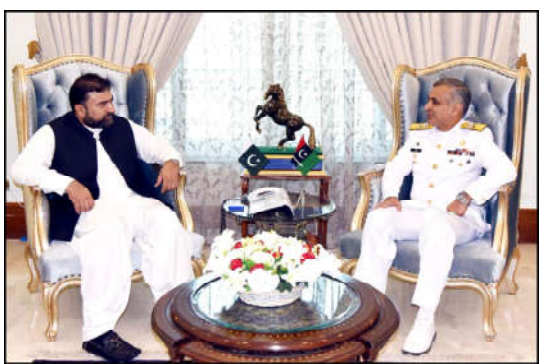
QUETTA: Commander West Pakistan Navy Rear Admiral Adnan Majeed (SI-Military) meeting with Chief Minister Balochistan Mir Sarfaraz Bugti