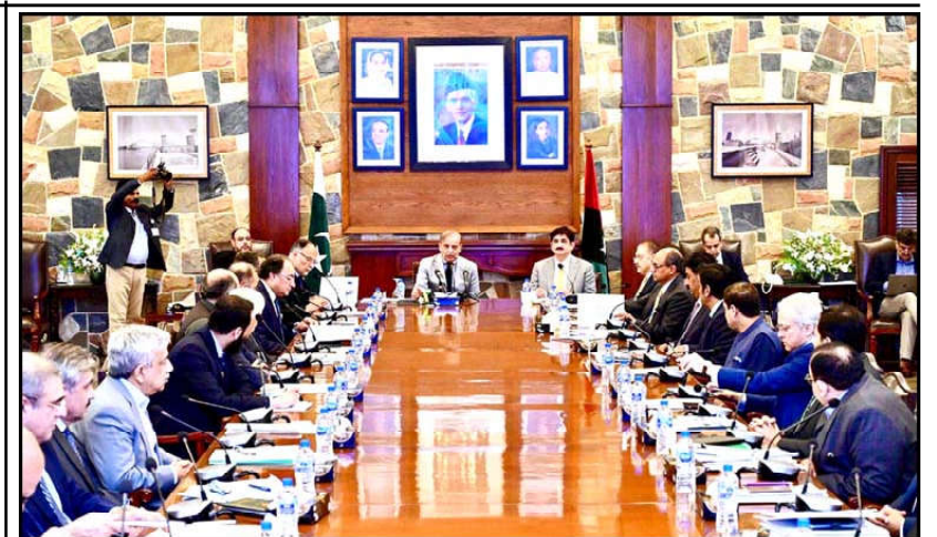
KARACHI: Prime Minister Muhammad Shehbaz Sharif chairs a briefing regarding various developmental projects of the Sindh Government.