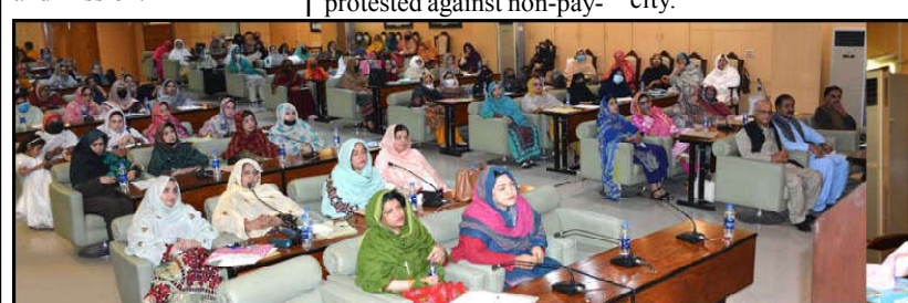
QUETTA: Provincial Education Minister Raheela Hameed Khan Durrani addressing introductory session of female Principals. Secretary Education Salah Muhammad Nassar is also present.

Meanwhile, traffic jam was occurred due to protest of WASA employees at main intersection of the city.