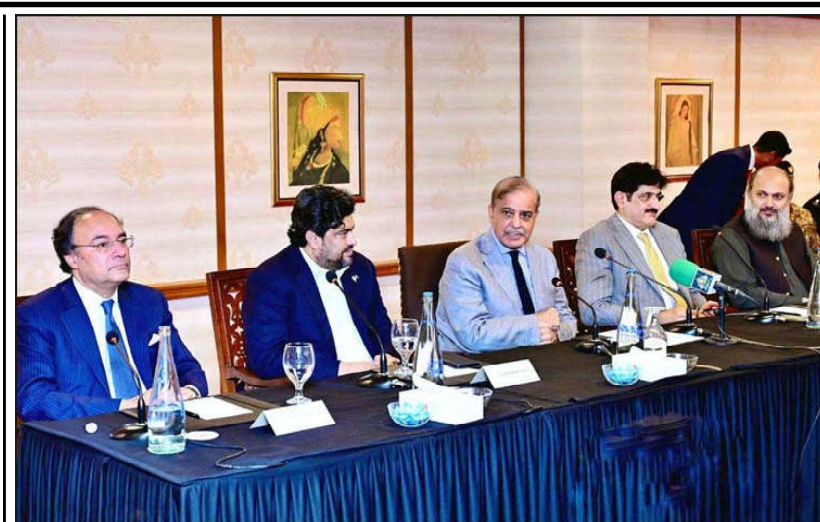
KARACHI: Prime Minister Muhammad Shehbaz Sharif addressing business community during his visit to Karachi.

There was no change in the price Emirates Dirham as it closed at Rs75.79, and the Saudi Riyal increased by 01 paise to at Rs74.22.