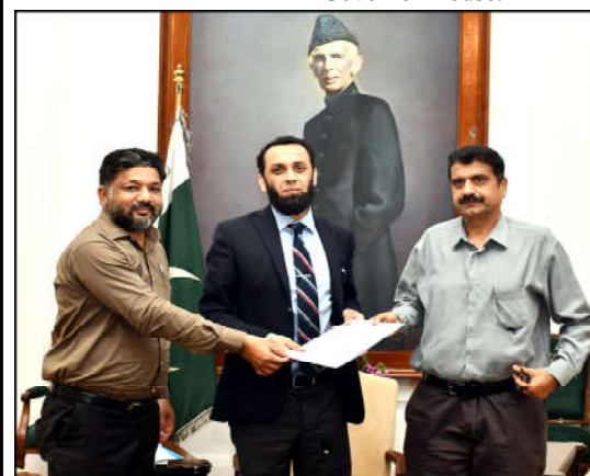
Federal Minister for Information and Broadcasting Mr. Attaullah Tarar handing over a cheque to Karachi Press Club at Governor House Karachi.

The minister handed over the cheque of Rs one million to KPC President Saeed Sarbazi at the Sindh Governor House.