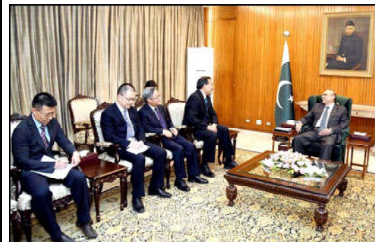
ISLAMABAD: Chairman of China International Development Cooperation Agency, Luo Zhaohui, along with his delegation call on President Asif Ali Zardari, at Aiwan-e-Sadr.

During his three-day visit, the Iranian President held meetings with the President, Prime Minister, Chief of the Army Staff, Chairman Senate, Speaker of the National Assembly, and the chief ministers and governors of Sindh and Punjab.