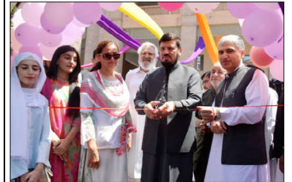
PESHAWAR: Governor Khyber Pakhtunkhwa Haji Ghulam Ali inaugurates Blossom Festa Fun Fair during his visit to Khyber Girls Medical College.

The Governor also distributed medals, appreciation certificates and cash prizes to the first, second and third position holders besides giving away trophies and certificates to the position holders of the pet show.