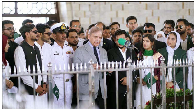
KARACHI: Prime Minister Muhammad Shehbaz Sharif reads a pledge to serve the country with the youth of the nation during his visit to Mazar-e-Quaid.

Earlier, Prime Minister Shehbaz Sharif arrived on a day long visit to Karachi and was received by Sindh Governor Kamran Khan Tessori and Chief Minister Syed Murad Ali Shah at Karachi Airport.