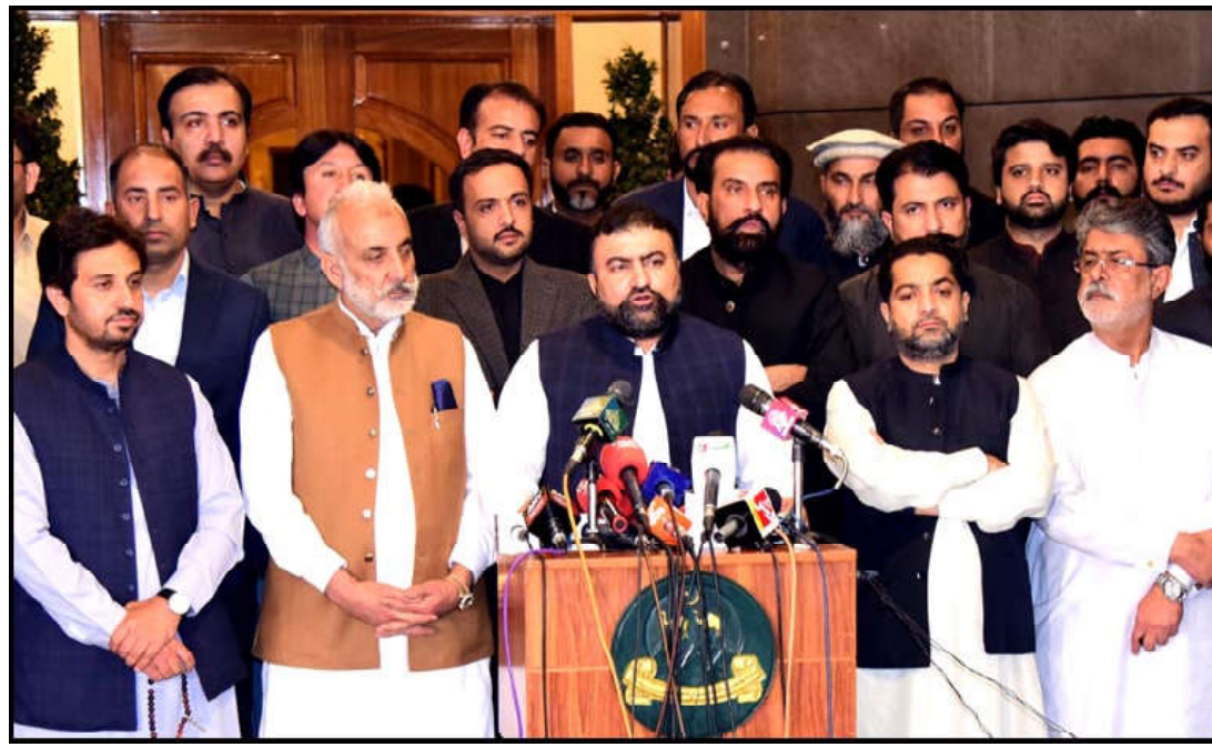
QUETTA: Chief Minister Balochistan Mir Safaraz Bugti talking with mediapersons. Provincial Ministers are also present