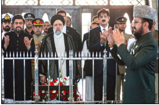
KARACHI: Iranian President Dr. Seyyed Ebrahim Raisi along with others paying homage to Quaid-e-Azam Muhammad Ali Jinnah during ceremony held at Jinnah Mausoleum in Karachi.

LAHORE (APP): Iranian President Dr Seyyed Ebrahim Raisi says Pakistan and Iran are keen to develop centers of arts and learning besides promotion of arts and sciences. Addressing students and faculty at Government College University in Lahore, he said it is need of the hour to pay special attention to arts, sciences and technology to shine among the comity of nations. President Raisi said that universities should be centers of learning and research and a comprehensive strategy in the education sector may pay dividends. On Allama Iqbal, the Iranian President said the poetry of Allama Dr Muhammad Iqbal enjoys special acceptance in Iran. He said Pakistan and Iran maintain the same stance on Palestine issue. Dr Raisi said Iran would further enhance its cooperation with Pakistan in the energy and other sectors. The Iranian President thanked Prime Minister Muhammad Shehbaz Sharif and Chief Minister Punjab Maryam Nawaz Sharif for the cordial hospitality during his visit.