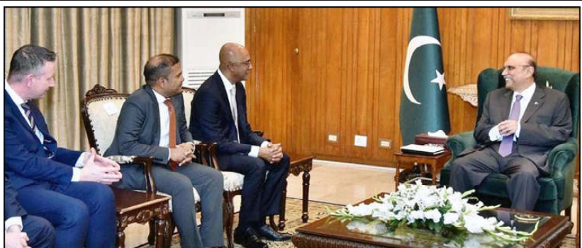
ISLAMABAD: A delegation of Air Asia Aviation Group (AAAG) called on President Asif Ali Zardari at Aiwan-i-Sadr.