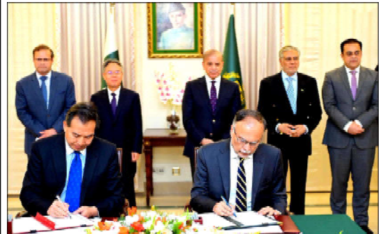
ISLAMABAD: Prime Minister Muhammad Shehbaz Sharif witnesses the signing of different agreements between China and Pakistan regarding cooperation in various fields.