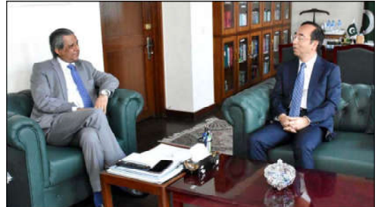
ISLAMABAD: H.E. WADA Mitsuhiro, Ambassador of Japan to Pakistan paid a courtesy call to Minister for Law and Justice Senator Azam Nazeer Tarar.

KARACHI (INP): Iranian President Ebrahim Raisi met Sindh Chief Minister Syed Murad Ali Shah on Tuesday during his visit to Karachi and had a detailed discussion on Pakistan-Iran economic opportunities, including issues concerning investment. Raisi is currently on a three-day visit to Pakistan and had arrived a day ago.