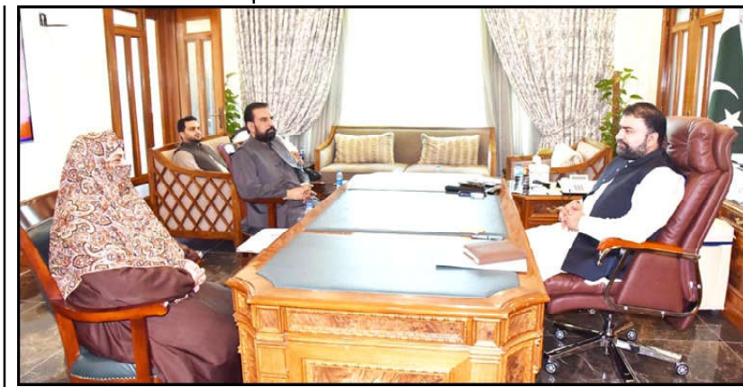
QUETTA: Provincial Minister Mir Ali Madam Jattak and Advisor Dr. Rubaba Khan Buledi meeting with Chief Minister Balochistan Mir Safaraz Bugti

Waziristan district, the Army troops effectively engaged the terrorists' location as a result of which one more terrorist was sent to hell. The terrorists were found involved in numerous criminal activities in the area against security forces as well as the innocent civilians. Arms and ammunition were also recovered after the operation. "Locals of the area appreciated the operations conducted by the Security Forces, who are determined to eliminate the menace of terrorism from this country," the ISPR said.