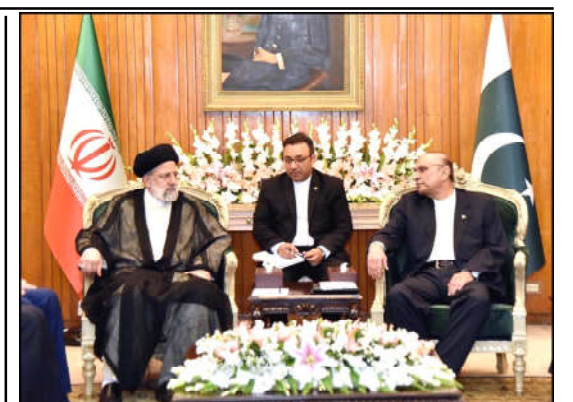
ISLAMABAD: President Asif Ali Zardari and the Iranian President, Dr. Seyyed Ebrahim Raisi, held a meeting, at Aiwan-e-Sadr.

ISLAMABAD (APP): Pakistan and Iran on Monday decided in principle to ban terrorist organizations in their respective countries. The decision to the effect was taken in a meeting between Minister for Interior Mohsin Naqvi, and his Iranian counterpart Dr Ahmad Vahidi and Law Minister Amin Hussain Rahimi. The two sides agreed on a joint plan of action to deal with the menace of terrorism being a common problem, with further improving mutual support and exchange of intelligence information. It was decided to sign a security agreement in that regard at the earliest. It was also decided to provide all possible facilities to the Pakistani pilgrims on the occasion of Arba'een. The Iranian Interior Minister extended an invitation to his Pakistani counterpart to visit Iran in that regard where the Iraqi counterpart would also be invited. The two sides observed that joint initiatives would help ensure the provision of best facilities to the pilgrims. Interior Minister Naqvi thanked his counterpart for the invitation to visit Iran.