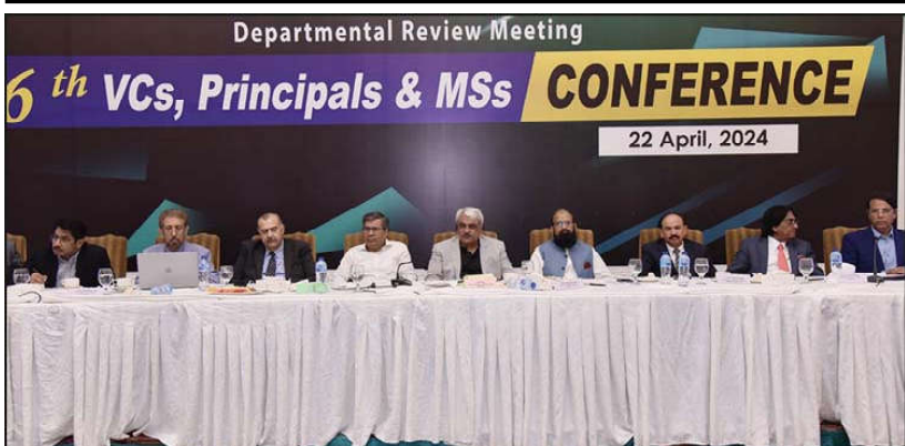
LAHORE: Provincial Minister for Health and Emergency Services Punjab Khawaja Salman Rafique addressing the participants of 6 th VCs, Principals and MSs conference.