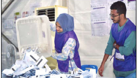
Officials count votes during the parliamentary elections, at a polling station in Maldives's capital Male.

during an Israeli raid on a refugee camp in the occupied West Bank. The Israeli army said it killed 10 people during the operation at Nur Shams camp. "Inside the Nasser Medical Complex there are mass graves dug by the Israeli occupation... we were shocked by the presence of bodies of 50 martyrs in one of the pits yesterday," said Mahmud Bassal, spokesman for the Gaza civil defence agency. "We are continuing the search operation today and are waiting for all graves to be exhumed in order to give a final number of martyrs." He said some of those killed had been tortured. "There were no clothes on some bodies, which certainly indicates (the victims) faced torture and abuse," Mr Bassal said.