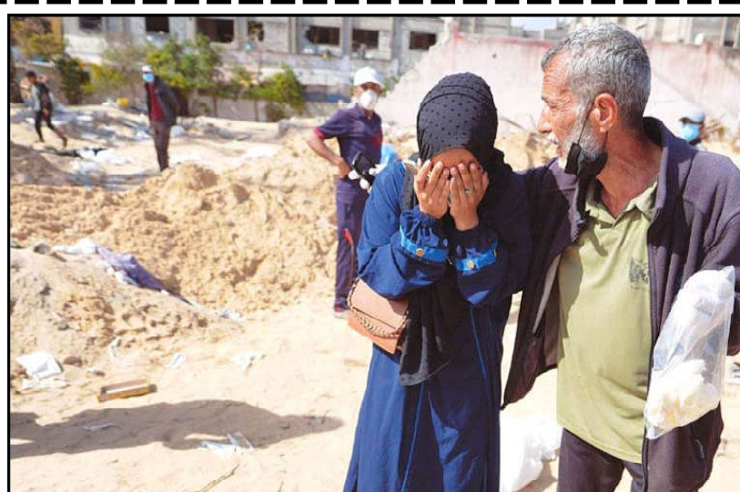
A grieving woman is consoled by a man after the body of her relative was discovered, buried by Israeli forces in a mass grave in the Nasser hospital compound in Khan Younis.

Greece will create two marine parks for the protection of sea mammals and birds — one in the Ionian Sea in western Greece and one in the central Aegean — has angered Turkey. Omer Celik, spokesman for Erdogan's ruling party, said last week that Ankara considers the creation of the marine parks "a step that sabotages the normalization process" in relations, and said Turkey would "in no way allow actions toward the declaration of marine parks in the Aegean Sea." Mitsotakis, speaking last week after a meeting of European leaders in Brussels, expressed surprise at what he described as "Turkey's totally unjustified reaction to an initiative which at the end of the day is of an environmental nature."