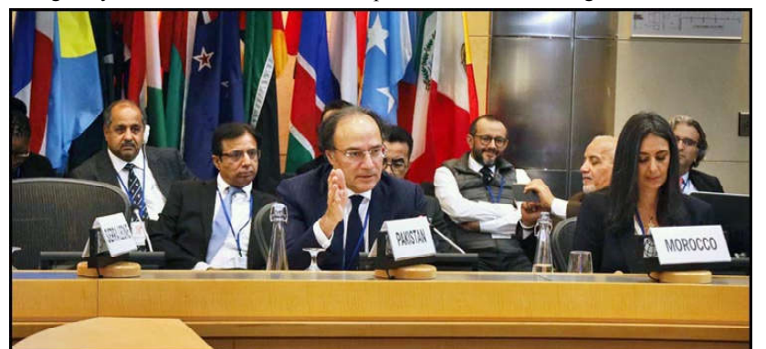
WASHINGTON: Finance Minister, Muhammad Aurangzeb attending the "Roundtable on Implementing for Faster Results and Greater Impact" organized by the World Bank.

He expressed these views while attending the "Roundtable on Implementing for Faster Results and Greater Impact," organized by the financial institution on the sidelines of the World Bank Group-IMF Spring Meetings in Washington D.C.