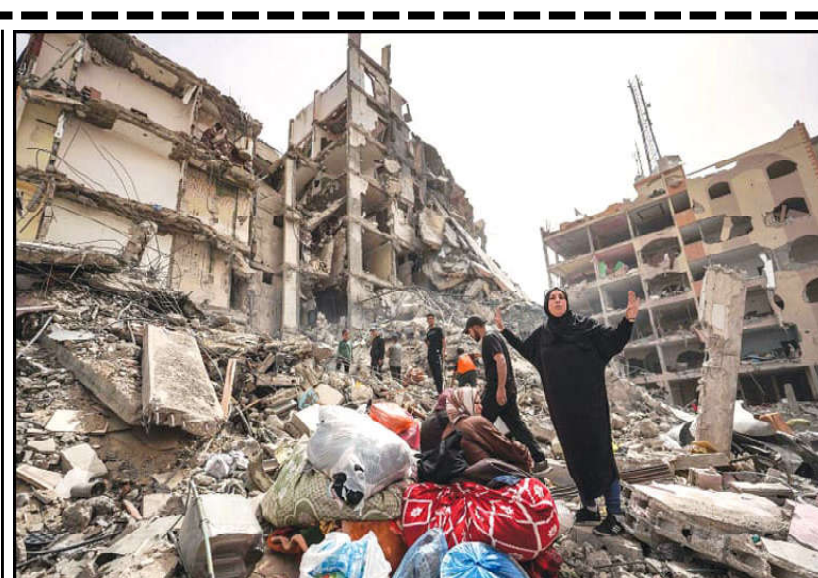
Palestinians attempt to salvage their belongings from the rubble of a damaged building in the city of Nuseirat, in central Gaza Strip.