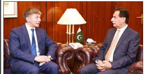
ISLAMABAD: Ambassador of the Republic of Kazakhstan Yerzhan Kistafin called on Speaker National Assembly Sardar Ayaz Sadiq at Parliament House.

Raisani urged the Balochistan Chief Minister to give clear instructions to his new cabinet to keep its doors open for the people for providing relief to them.