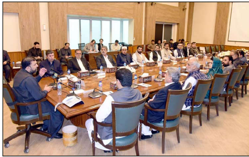
QUETTA: Chief Minister Balochistan Mir Sarfraz Ahmed Bugti presiding over introductory meeting of Provincial Cabinet.

The event was conducted by Colonel Taimur Rahat, Army and Air Adviser at Pakistan High Commission London. He spoke on the achievements of the Staff College and informed the audience of the value that Staff College beholds for the training and grooming of officers from 1905 onwards. Col Taimur gave various examples of how command and staff echelons in all major battles fought by the British Army from 1900s.