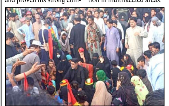
KHUZDAR: President Balochistan National Party Sardar Akhtar Jan Mengal holding protest sit-in in front of DC office

He lauded the UAE President, who had once again demonstrated his outstanding leadership qualities and proven his strong com-