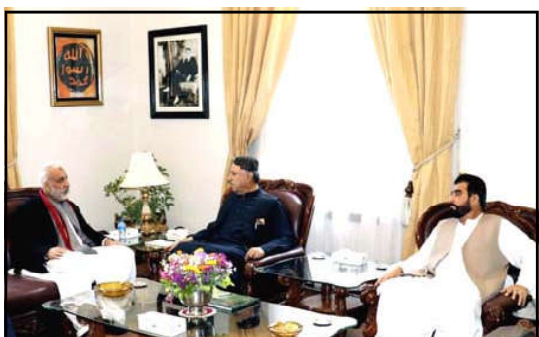
QUETTA: New appointed provincial minister Sardar Abdul Rehman Khetran and Mir Asim Kurd Gailo meeting with Governor Balochistan Malik Abdul Wali Khan Kakar

In this context, concrete proposals were deliberated by the forum to meet tangible objectives within specific timelines.