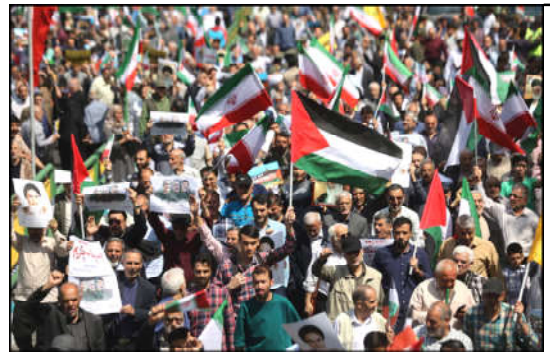
Iranians attend an anti-Israel rally in Tehran, Iran.

Monitoring Desk WASHINGTON: US Defense Secretary Lloyd Austin on Thursday spoke with Israeli Defense Minister Yoav Gallant to discuss Iran's actions in the Middle East, other regional threats and aid into Gaza, the Pentagon said in a statement. Austin discussed "the importance of increasing and sustaining" the flow of humanitarian aid to civilians in Gaza, including via a new route from Ashdod Port in Israel, the Pentagon said. Israel recently reopened the Erez crossing into northern Gaza and allowed the temporary use of Ashdod port in southern Israel after US President Joe Biden threatened to impose conditions on support for Israel unless it took steps to alleviate the humanitarian crisis in Gaza. Israel has faced growing international calls to do more to help civilians in Gaza, where nearly all of the 2.3 million population is displaced and enclave also suffers widespread hunger. The Israeli military said on Wednesday food trucks entered the blockaded Gaza Strip from Ashdod Port for the first time since the government approved the opening of the port to aid shipments. The Pentagon said Austin and Gallant discussed what it called "destabilizing actions" from Iran in the Middle East. Over the weekend, Iran launched hundreds of drones and missiles in a retaliatory strike against a suspected Israeli strike on its embassy compound in Syria. Most of the drones and missiles were downed before reaching Israeli territory.