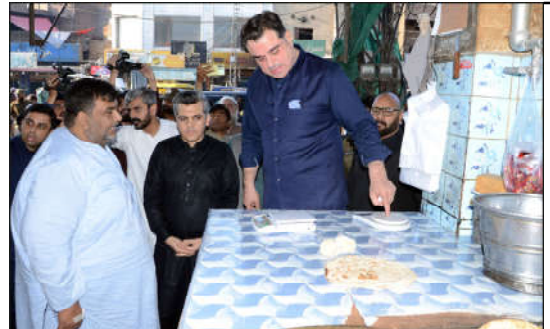
FAISALABAD: Provincial Minister of Punjab for Food Bilal Yasin inspection for bread (Roti) at a Tandoor during visit and checking rate list and Roti weight, in the city.

mechanism amongst all the stakeholders in order to achieve the desired targets of polio eradication campaigns, and said that we can make these efforts successful only through an effective and better team work. He further directed them to have special focus on addressing the issues of refusal cases in addition to making operational affairs of polio eradication campaigns better. "We need to have targeted approach in order to convince the parents who are reluctant to administer anti polio drops to their children", he remarked and directed that Ulema-e-Kiram, Social mobilizers and elected public representatives be involved for this purpose.