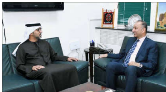
ISLAMABAD: Ambassador of UAE Hamad Obaid AlZaabi called on Federal Minister for Petroleum Dr. Musadik Malik.

The delegation thanked the prime minister for the warm welcome.