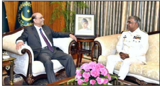
ISLAMABAD: Chief of the Naval Staff, Admiral Naveed Ashraf meeting with President Asif Ali Zardari at Aiwan-e-Sadr.

Besides he also asked to expedite the work for opening roads that had been closed due to rains and landsliding.