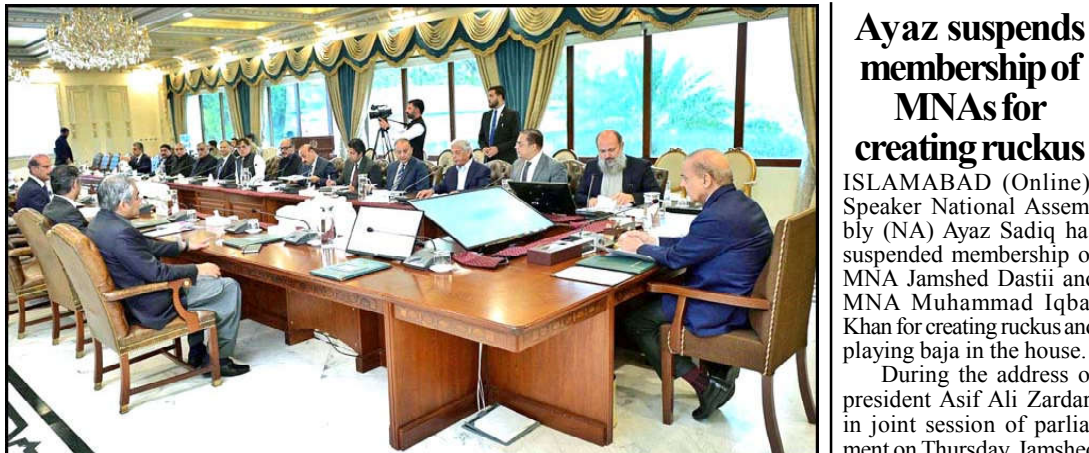
ISLAMABAD: Prime Minister Muhammad Shehbaz Sharif chairs a meeting regarding country wide Anti-smuggling drive.

In its maiden meeting, the cabinet members observed that all those assassinated the innocent people in Noshki were terrorists while those who were martyred were Pakistanis. The cabinet members also offered fatiha for the departed souls of those martyred in different incidents of terrorism and lawlessness in the province. The members of cabinet also offered fatiha for the departed souls of those died in floods and other natural disasters in the province.