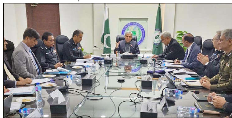
ISLAMABAD: Interior Minister Mohsin Naqvi chairing the meeting of National Action Plan Coordination Committee at NACTA Headquarters.

Meanwhile, Deputy Commissioner Chaman exhorted the doctors and other medical staff of all hospitals and BHUs of Chaman to remain alert and present at their respective places of duty.