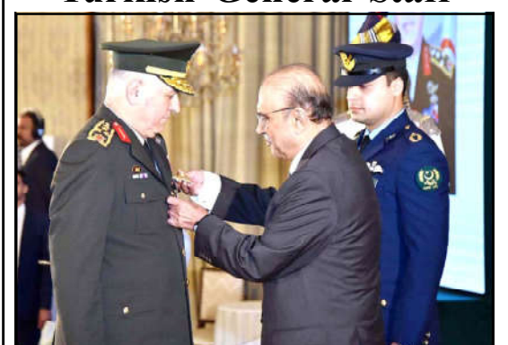
ISLAMABAD (APP): President Asif Ali Zardari on Friday conferred the Nishan-i-Imtiaz (Military) award on Chief of Turkish General Staff, General Metin Gurak in recognition of his illustrious services and contribution to strengthening Pakistan-Turkiye defence relations.

The award was conferred at a special investiture ceremony held at the Aiwan-e-Sadr and attended by services chiefs and parliamentarians.