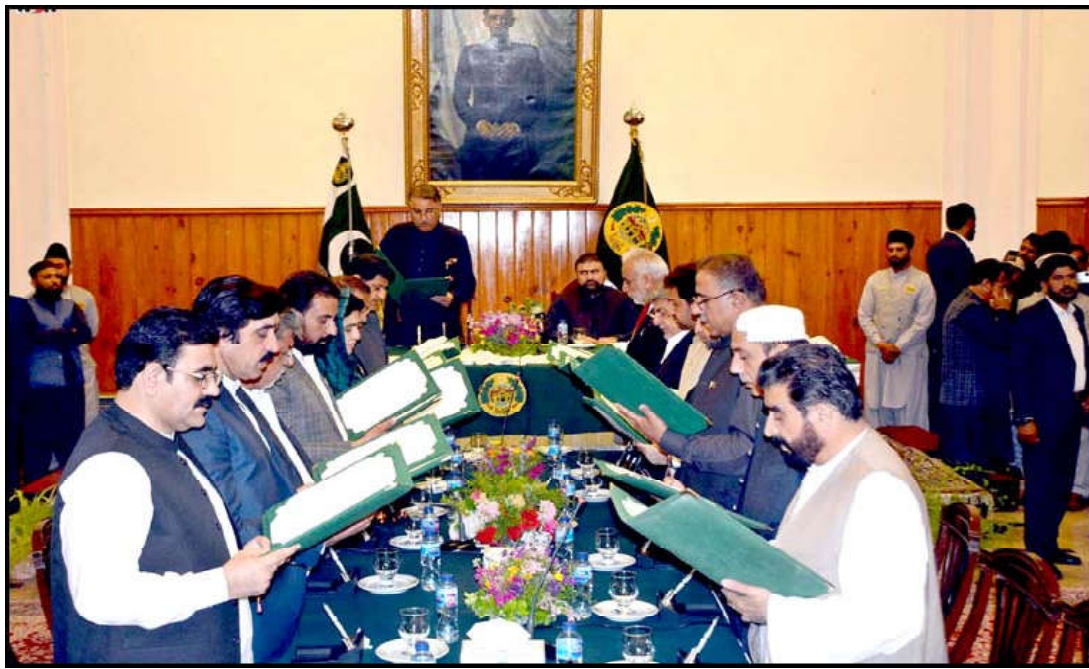
QUETTA: Governor Balochistan Abdul Wali Kakar administering oath to 14-members Provincial Cabinet.

The top brass after detailed brainstorming, decided to conduct a joint operation in the Kacha area with full force and close coordination between the provinces and all stakeholders to clear the area from dacoits.