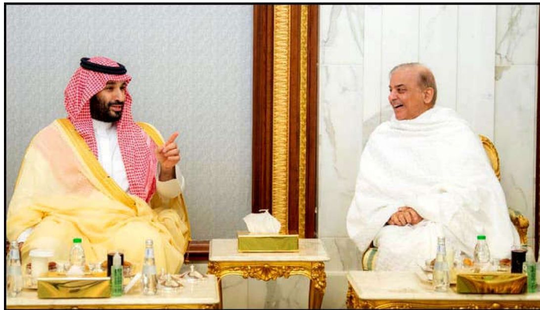
MAKKAH: Prime Minister Shehbaz Sharif meeting with Crown Prince Mohammed Bin Salman at Al-Safa Palace