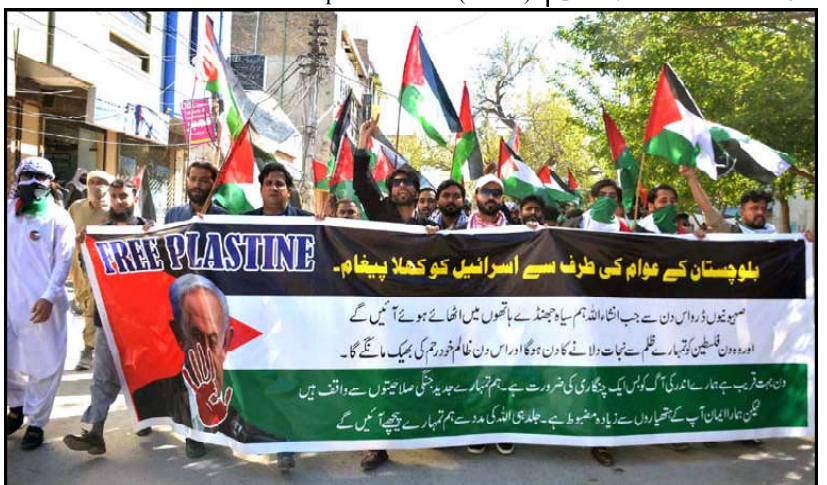
QUETTA: Members of Civil Society Balochistan are holding protest demonstration against Israeli cruel and inhumane acts and express unity with the innocent people of Palestine, at Quetta press club.