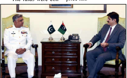
KARACHI: The Chief of Naval Staff Admiral Naveed Ashraf called on the Sindh Chief Minister Syed Murad Ali Shah at Chief Minister House.

QUETTA: The Quetta district administration continued crackdown against the profiteers in the provincial metropolises. According to an official hand out issued here, some 41 shopkeepers were arrested on charge of violating the official price list. Moreover, three shops were sealed on the violation while 111 shopkeepers were issued stern warning during the crackdown. The raids were conducted by different teams of the administration deputed to monitor the implementation on the official price list by the shopkeepers in different parts of the city. Meanwhile, the district administration has warned that action would remain continued against the profiteering. It was also warned that stern action would be taken against those involved in profiteering and that violation of official price list.