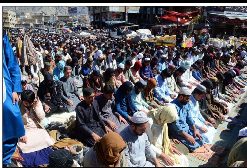
QUETTA: A large number of faithful offering Namaz-e-Jumma Tul Wida during Holy Fasting Month of Ramzanul Mubarak at Meezan Chowk.