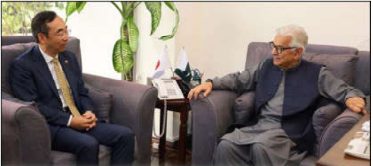
ISLAMABAD: H.E. Wada Mitsuhiro, Ambassador of Japan called on Minister for Defence, Khawaja Muhammad Asif.