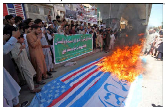
LAHORE: A large number of people participating in Al-Quds rally to express solidarity with the people of Palestine at Mall Road.

He added that the ultimate goal is to put this important department on modern lines, and all possible steps would be taken in this regard. He was presiding over a meeting of the Excise and Taxation department, held here at Chief Minister's House.