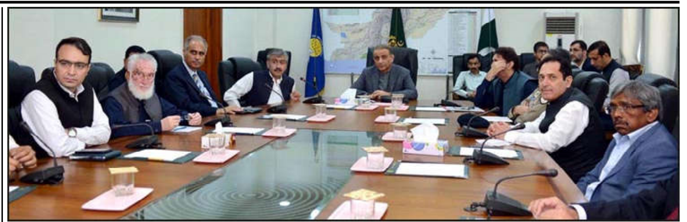
Federal Minister for Communications, Mr. Abdul Aleem Khan, on assuming charge of Ministry, is being briefed on functioning of Ministry of Communications and its attached departments by Federal Secretary communications Mr. Ali Sher Mehsood in Islamabad.

Year-on-year inflation in the Philippines rose to 3.7 percent in March due to higher food prices, including rice and meat, the Philippine Statistics Authority said on Friday.