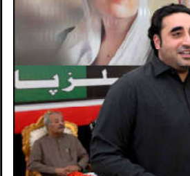
LARKANA: Chairman PPP Bilawal Bhutto Zardari addressing the Iftar organized in honor of Polling Agents, Polling Incharge and Constituency dignitaries of NA 194 Provincial Constituency PS 11 at Bhutto House Naudero.

Moreover, CTD investigators have obtained CCTV footage from the sub-divisional post office of the Satellite Town, capturing potential suspects near the letter boxes from where the letters were potentially posted to the judges. Utilizing advanced identification methods, the National Database and Registration Authority (NADRA) is actively engaged in identifying individuals featured in the footage. In light of these developments, the CTD has initiated investigations targeting individuals deemed suspicious based on the CCTV footage.