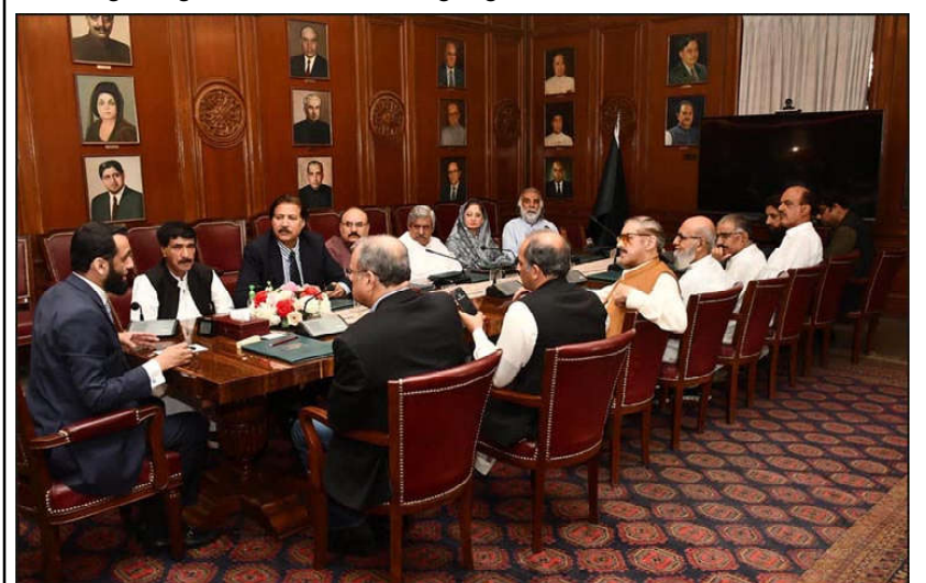
KARACHI: Mr. Attaullah Tarar, Federal Minister for Information and Broadcasting in a meeting with a delegation of CPNE.

to expedite efforts towards achieving a ceasefire. They demanded the United Nations to enforce Security Council resolutions, urging Israel to immediately terminate its occupation of Palestinian territories and its "illegal blockade" of the Gaza Strip. Moreover, they emphasized the necessity for United Nations member states to cease the sale and transfer of weapons, explosives, and other military equipment to Israel. The religious leaders underscored the resilience of the Palestinian cause against decades of suppression by the United States and Israel. They hailed the recent resolution passed against Israel in the United Nations Security Council as a significant achievement for the Muslim Ummah, stressing the imperative for its immediate implementation to halt the ongoing atrocities