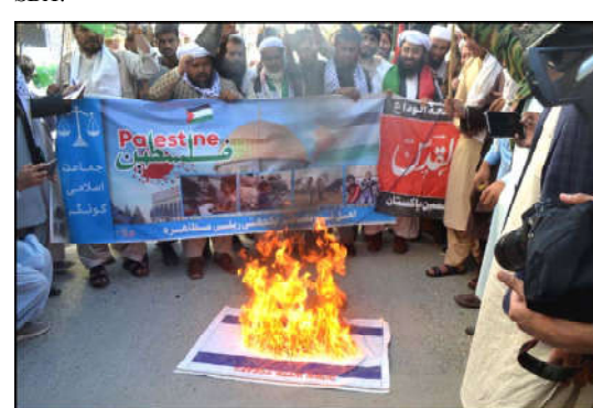
QUETTA: Participants are holding demonstration against USA and Israel as they are marking Yomun-Quds to show solidarity with people of Palestine, organized by Jamat-e-Islami (JI), in Quetta.

The IMF spokeswoman said that of course, IMF stands ready to engage in program discussions in the coming months. The spokeswoman of the international lender gave an overview of rounds held between Pakistan and IMF and said: "So, on March 19, IMF staff and the Pakistani authorities reached staff-level agreement on the second and final review under Pakistan's Stand-By Arrangement, SBA."