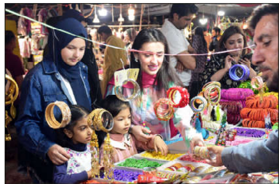
ISLAMABAD: Women busy in shopping for upcoming Eid ul Fitr Festival at a local market, in Federal Capital.

About Eid Shopping trends, Noori also revealed a dilemma that customers,