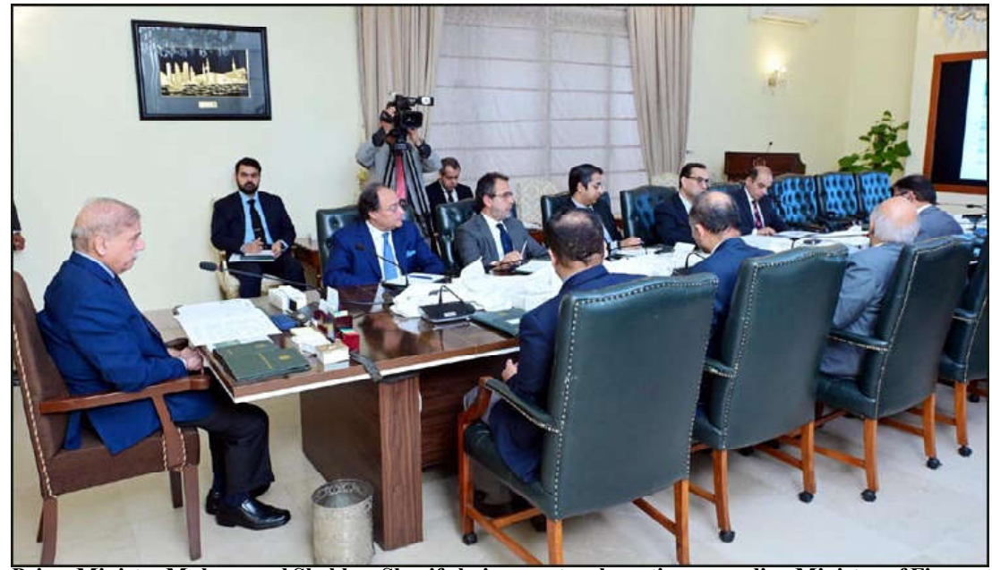
Prime Minister Muhammad Shehbaz Sharif chairs a sectoral meeting regarding Ministry of Finance in Islamabad.