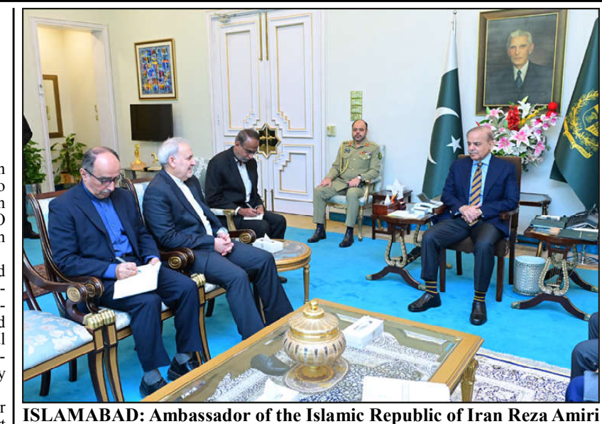
Moghadam calls on Prime Minister Muhammad Shehbaz Sharif.