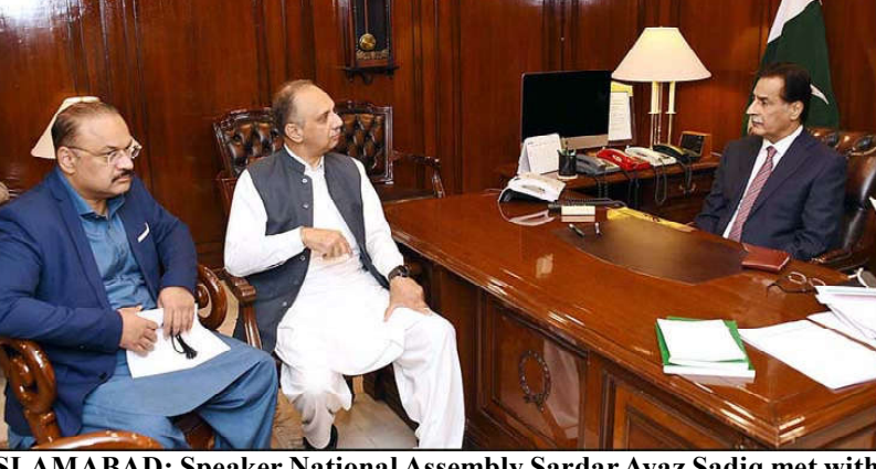
ISLAMABAD: Speaker National Assembly Sardar Ayaz Sadiq met with Leaders of Opposition Parties in National Assembly at Parliament House.

missiles, conventional and other destabilizing weapons," he said, noting It has adopted war-fighting doctrinessuch as 'Cold Start', envismate cause of a regional and aging a surprise attack on global catastrophe," he Pakistan, and a 'limited war added.