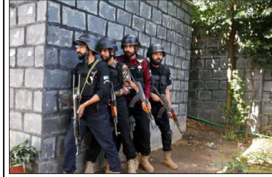
ABBOTTABAD: Police Rapid Response Force officials are taking part in mock exercise as a practice to defend in perception of any terrorist attack, held in Abbottabad.

During the meeting discussions were held regarding the installation of prepaid electric meters at Lady Reading Hospital doctor's hostel and concerns of medical education, and 136 on officers regarding this matter.