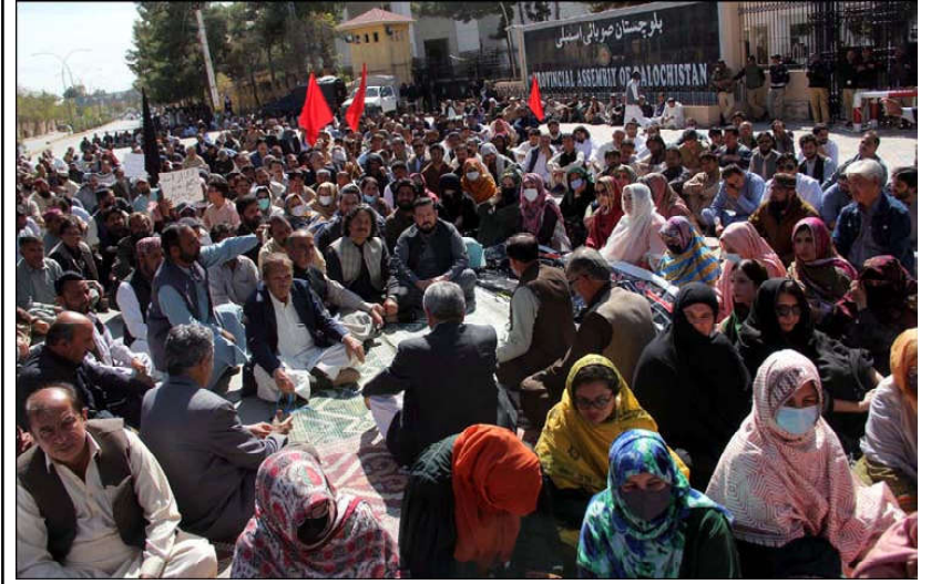
QUETTA: Teachers of Balochistan University are holding protest demonstration against non-payment of their salaries, outside Balochistan Assembly in Quetta.

Also, 20 of the 33 candidates of the Senate had withdrawn their nomination papers, while two contenders stepped down in favour of their opposing candidates, the ECP confirmed.