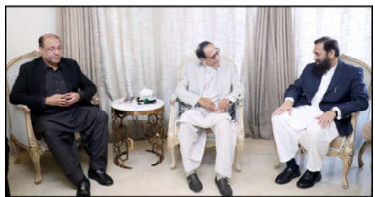
LAHORE: Governor Punjab Muhammad Balighur Rehman meeting with Chaudhry Shujaat Hussain at his resident. Provincial Minister Chaudhry Shafay Hussain is also present