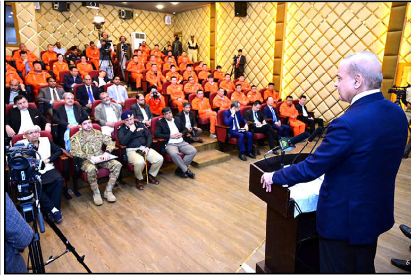
DAASU: Prime Minister Muhammad Shehbaz Sharif addresses the Chinese Engineers and government officials at Kass camp of China Gezhouba Group Company (CGGC).

The court suspended the sentence of PTI founder and Bushra Bibi in Toshakhana case.