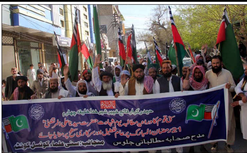
QUETTA: Members of Sunni Ulema Council (SUC) are holding protest demonstration for demanding public holiday on the occasion of Youm-e-Ali (A.S.), the day of martyrdom 21st Ramadan-ul-Mubarak, at Quetta Press Club.

He stated, "Recognizing the growing importance of ensuring the authenticity of educational documents, the Inter Boards Coordination Commission (IBCC) has taken a significant step towards streamlining the verification process for students seeking attestation of their academic certificates. Through this initiative, the Board(s) of Intermediate and Second-