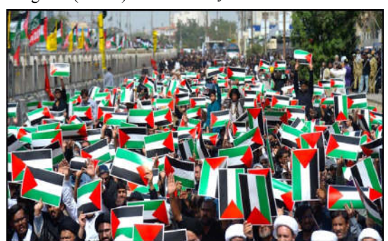
KARACHI: Participants hold Palestine flag during procession on occasion of youm-e-Ali.

Speaker Provincial Assembly Cap @ Abdul Khaliq Achakzai underscored the importance of collaborative efforts towards peace and understanding. He emphasized the pivotal role played by collaborative efforts like this in fostering unity and harmony, further underscoring the government's dedication to collective action in building a more inclusive and peaceful society.