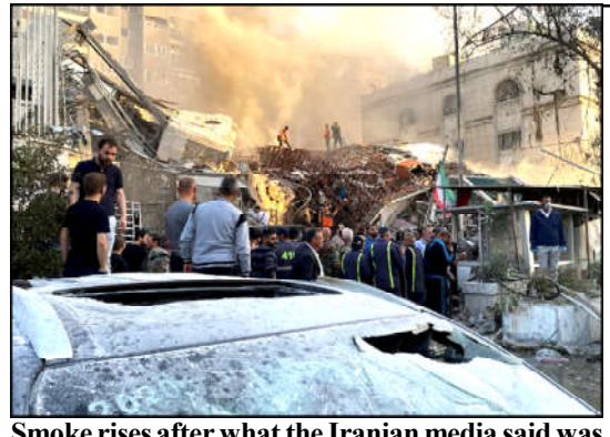
Smoke rises after what the Iranian media said was an Israeli strike on a building close to the Iranian embassy in Damascus, Syria.

Also on Sunday, another child died and five other people were wounded when unexploded ordnance went off in Herat province, local police said on social media platform X.