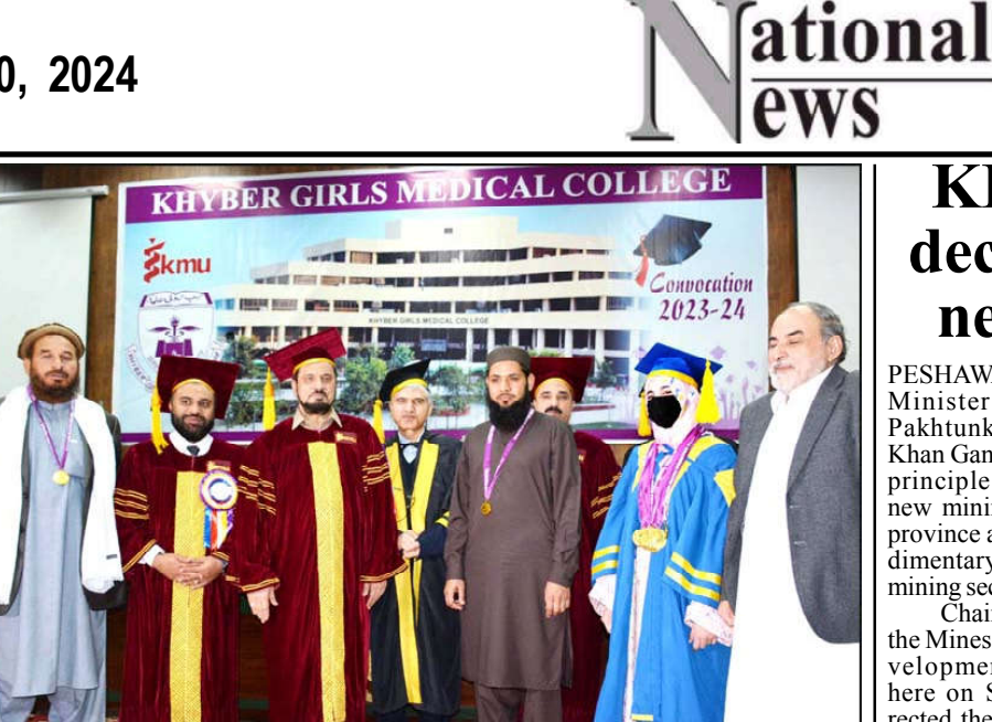
PESHAWAR Governor Khyber Pakhtunkhwa, Haji Ghulam Ali in a group photo with position holders during 5th convocation of Khyber Girls Medical College.