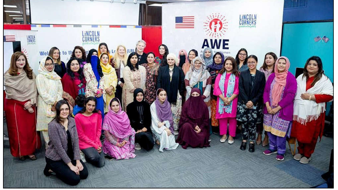
ISLAMABAD: Group photo of the participants during launch of the fourth Pakistan cohort of "Academy for Women Entrepreneurs" (AWE) program at the Lincoln Reading Lounge at National Library.