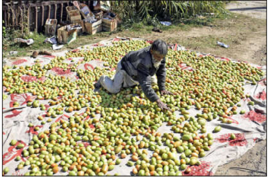
LAHORE: A vendor is displaying Jujube (Bair) attraction for customer alongside a road, in the Provincial Capital.

Pakistan are working accelerate closely together to further gender equality.