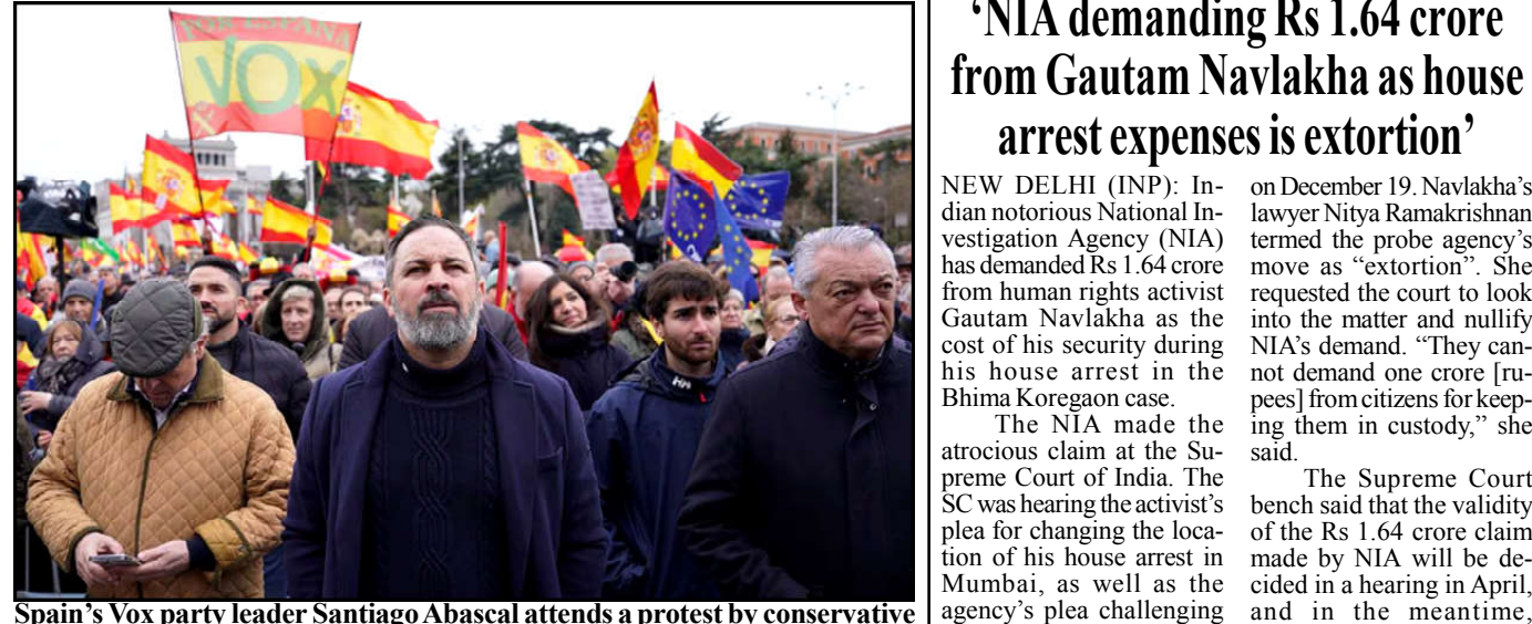
Spain's Vox party leader Santiago Abascal attends a protest by conservative and far-right parties and civil society organizations against Prime Minister Pedro Sanchez at Cibeles Sqaure in Madrid, Spain.

Local media said the two people killed in the