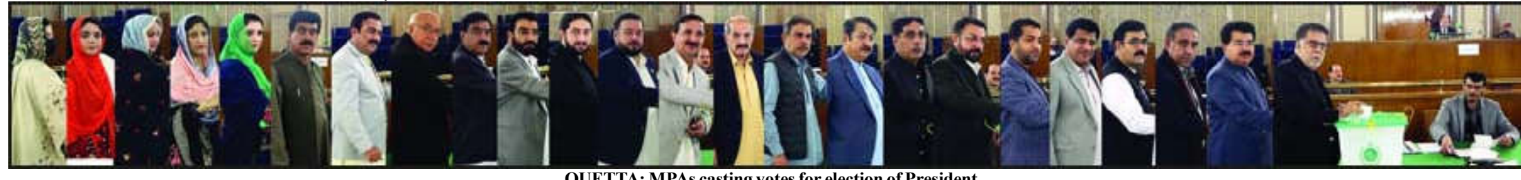
QUETTA: MPAs casting votes for election of President

He announced that 12 sembly session. members belonging to JUI