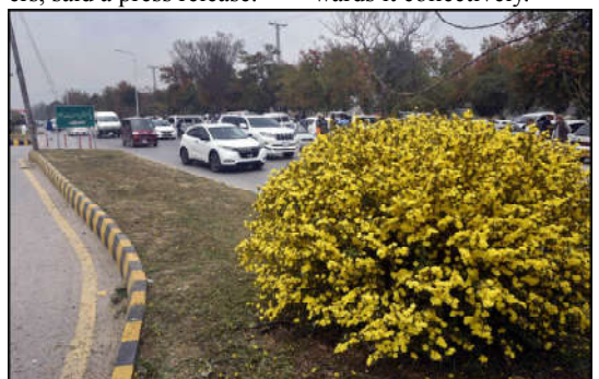
ISLAMABAD: A beautiful view of flower blooming on greenbelt along the roadside in the Federal Capital.