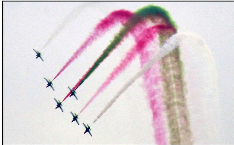
ISLAMABAD: Sherdils demonstrating their skills during rehearsal ahead of the Pakistan Day parade on 23rd March.

The enquiry was initiated based on a complaint filed by Reckitt Benckiser Pakistan Limited.