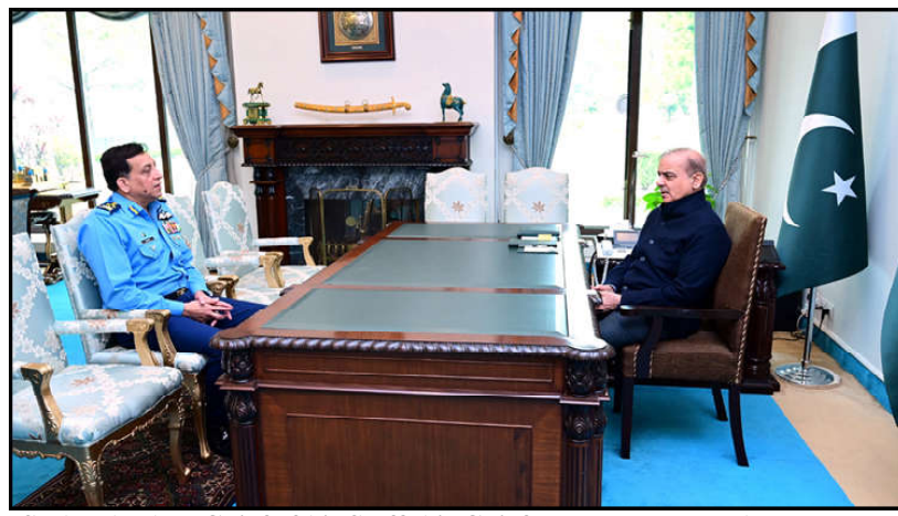
ISLAMABAD: Chief of Air Staff, Air Chief Marshal Zabeed Ahmed Babar Sidhu calls on Prime Minister Muhammad Shehbaz Sharif.