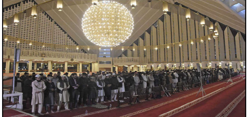
People offering Namaz-e-Taraweeh of first ramadan at Faisal Mosque in the Federal Capital.

On the occasion, AC warned that as the holy month of Ramadan is approaching and the district administration would leave no stone unturned to facilitate the masses in city while strict action would be continued against the violators.