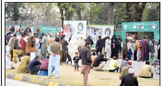
ISLAMABAD: A large number of peoples waiting for their turn for collecting Benazir Income Support Program Cash outside Benazir One Window Center at Sector g-7 in the Federal Capital.

The Senate of Pakistan also takes pride in its active engagement with international delegations and the initiation of Parliamentary Diplomacy initiatives, contributing to fostering diplomatic relations and promoting collaboration on global issues.