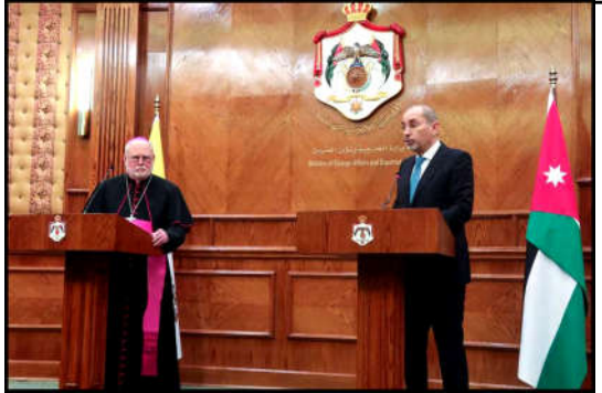
Jordan's Foreign Minister Ayman Safadi speaks during a joint press conference with Archbishop Paul Richard Gallagher, the Vatican Secretary for Relations with States, in Amman, Jordan.

leading housing reforms that transformed China into a nation of homeowners. The nearly 3,000-member National People's Congress approved a revised State Council law that directs China's version of the cabinet to follow Xi's vision. The vote was 2,883 to eight, with nine abstentions. Other measures passed by similarly wide margins. The most nays were recorded for the annual report of the supreme court, which was approved by a 2,834 to 44 vote. In brief closing remarks, Zhao Leji, the legislature's top official, urged the people to unite more closely under the Communist Party's leadership "with comrade Xi Jinping at its core." The party leaders who run the State Council used to have a much freer hand in setting economic policy. Neil Thomas, a Chinese politics fellow at the Asia Society Policy Institute, said in an emailed comment.