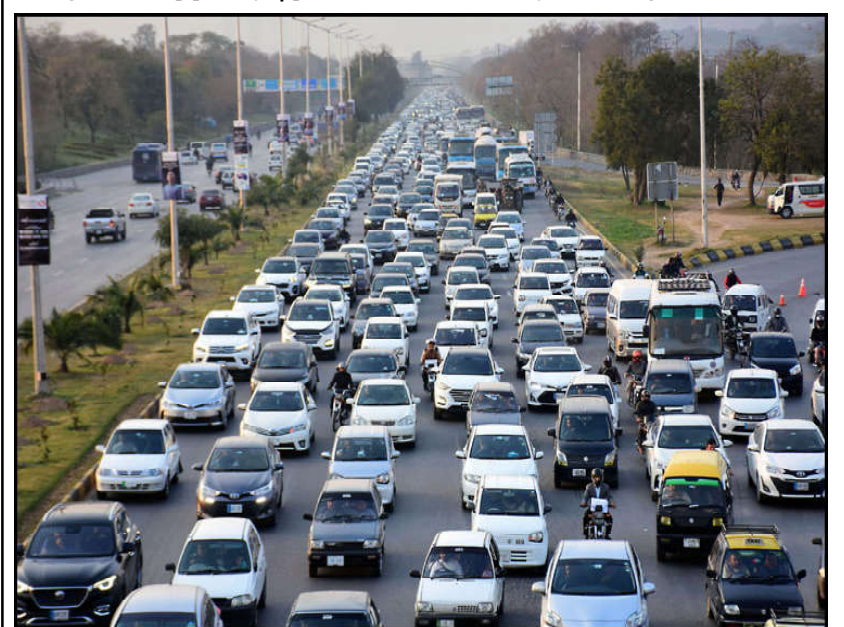
ISLAMABAD: A view of massive traffic jams at Islamabad expressway in evening hours, in the Federal Capital.

The CDA Chairman on the occasion said that welfare of employees would remain management's top priority.