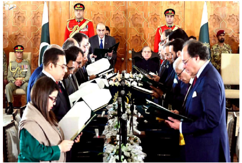
ISLAMABAD: President Asif Ali Zardari administering oath of office to members of Federal Cabinet at Aiwan-e-Sadr. Prime Minister Muhammad Shehbaz Sharif was also present on the occasion.

choices; either to sit as silent spectators or be counted, at that time they had decided to take responsibility of the country. Then the interim government followed them but the economic situation in the country was stable and did not worsen, he opined. The prime minister said that once more, they took the responsibility of steering the country out of the huge challenges and without wasting time, they should tread upon that path leading to destination.