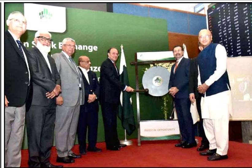
ISLAMABAD: Federal Minister for Finance and Revenue, Muhammad Aurangzeb in a meeting with Governor SBP and CEOs of all leading Banks, at SBP headquarters, during his visit.