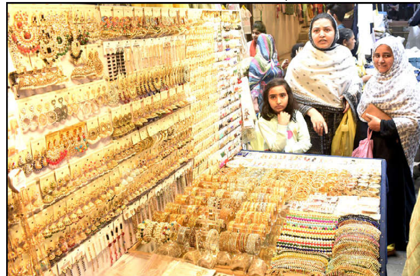
LAHORE: Women busy in shopping ahead of Eid-ul-Fitr in the Ichhra Shopping Center of the Provincial Capital.

one of the most complex restructuring exercise undertaken to prepare PIACL for privatization. This arrangement will help make a viable business case for private sector investment in the national carrier. The domestic banks and financial institutions demonstrated firm commitment to the government's privatization initiative and extended their full co-operation in finalising the arrangement for PIACL's commercial domestic debt. Under the arrangement, PIACL's Commercial domestic debt will be moved to PIA Holding Company Ltd., established by the federal government as part of PIACL's legal restructuring. The term sheet covering mutually agreed commercial aspects of loan transfer was signed yesterday between PIACL, PIA Holding Company and lender banks.