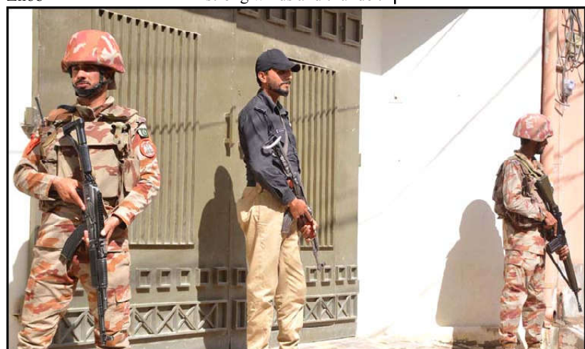
QUETTA: Security personal stand alert during Good Friday service at Bethel Memorial Methodist Church.

According to the Meteorological Department, Quetta, Loralai, Barkhan, Musa Khel, Shirani, Zhob, Qila Saifullah, Pashin, Qila Abdullah, Mastung, Hamai, Sibi and Jhal Magsi received heavy rain with strong winds and thunder.