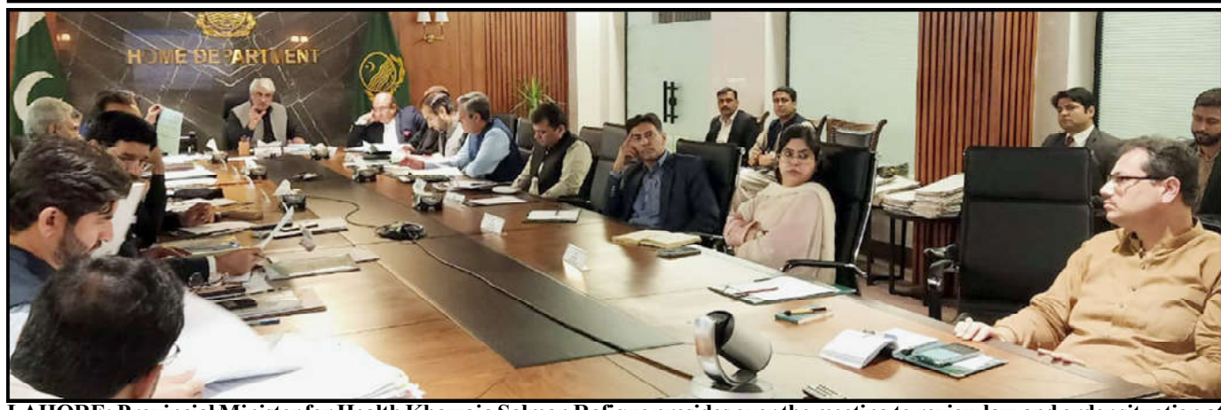
LAHORE: Provincial Minister for Health Khawaja Salman Rafique presides over the meeting to review law and order situation at Home Ministry