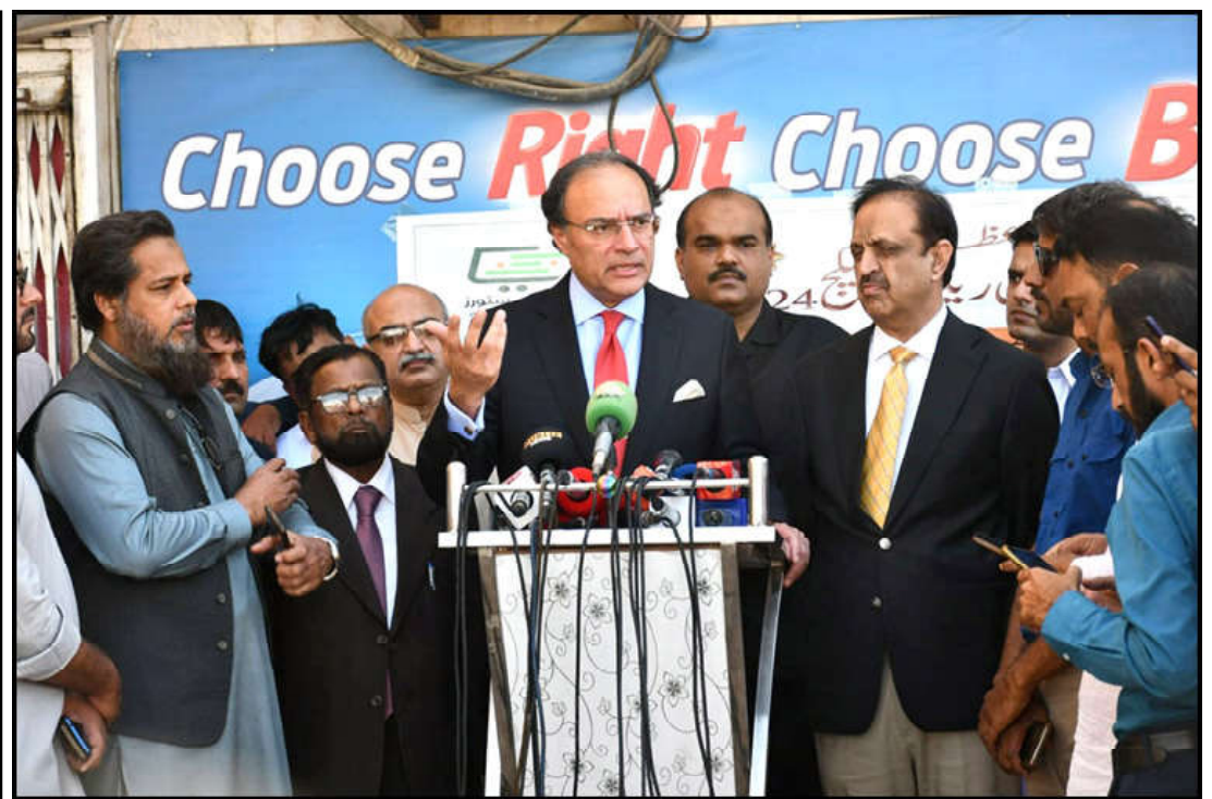
KARACHI: Federal Minister for Finance & Revenue, Muhammad Aurangzeb talking to media during his visit to Utility Stores Corporation to oversee the implementation of the enhanced Ramadan Relief Package.

country had to face loss of around Rs 400 to 500 billion annually in term of power theft, whereas leakages, transmission losses and line losses of electricity were other than that. As regards tax revenues, he said the government's target this year was Rs 9 trillion. But it has the potential of collecting Rs 4 trillion extra revenues by streamlining the tax system and by curbing corruption and tax evasion. He said a tax amount of Rs 2.7 trillion was still under litigation either in tribunals or in appellate courts. The government, he said would try its best to recover this amount. Appreciating the efforts of Chief of Army Staff in curbing smuggling and power theft, the prime minister said during the nine months of interim government, an amount of Rs 58 billion was saved in power sector. Similarly, a significant improvement was witnessed in smuggling in the country due to the commitment, will to do, and cooperation of all provinces, and the personal commitment and interest of the Chief of Army Staff, the prime minister added. Besides initiating reforms in certain sectors, he said the government was also committed to promote industry and agriculture sector in the country. He informed that the government had chalked out a plan to fully digitize the system of Federal Board of Revenue (FBR) to boost the tax revenues in the country.