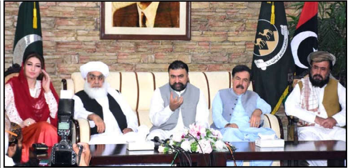
ISLAMABAD: Chief Minister Balochistan Mir Sarfraz Ahmed Bugti addressing a press conference along with leaders of allied political parties

President Biden reaffirmed the joint commitment to upholding human rights and promoting inclusive development, signaling a strengthened partnership between the United States and Pakistan.