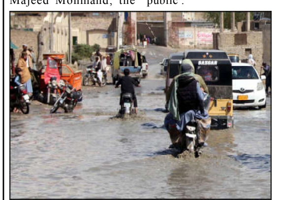
QUETTA: Commuters are facing difficulties in transportation due to stagnant rainwater caused by poor sewerage system, showing negligence of concerned authorities, in Quetta.

NHA staff deployed in the region worked tirelessly, around the clock, utilizing heavy machinery to effectively reopen the damaged road segments.