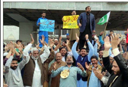
LAHORE: Members of Awami Rickshaw Union are holding protest demonstration against massive unemployment, increasing price of daily use products and inflation price hiking, in Lahore.

Independent Report LAHORE: At least six persons were killed and 1225 injured in 1106 road crashes in all 37 districts of Punjab during the last 24 hours. Out of these, 550 people with serious injuries were shifted to different hospitals, while 675 victims with minor injuries were treated at the incident site by Rescue Medical Teams thus reducing the burden of hospitals.