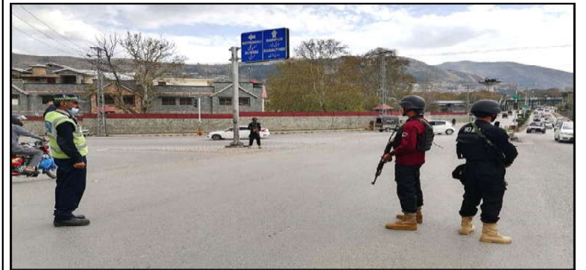
ABBOTTABAD: Security officials are standing high alert to avoid untoward incident as security has been high alert in city during the Holy Month of Ramadan-ul-Mubarak, in Abbottabad.