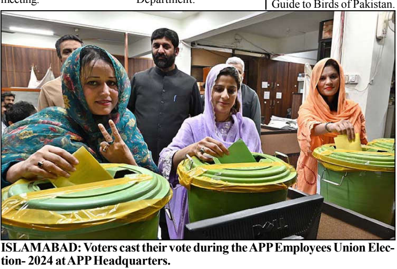
ISLAMABAD: Voters cast their vote during the APP Employees Union Election-2024 at APP Headquarters.