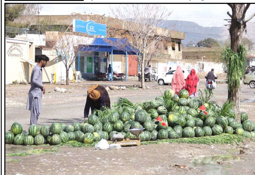
QUETTA: Vendor sells watermelons to earn his livelihood for support his family as demand of watermelons increased in city during the Holy Month of Ramadan-ul-Mubarak, at Samungli road in Quetta.