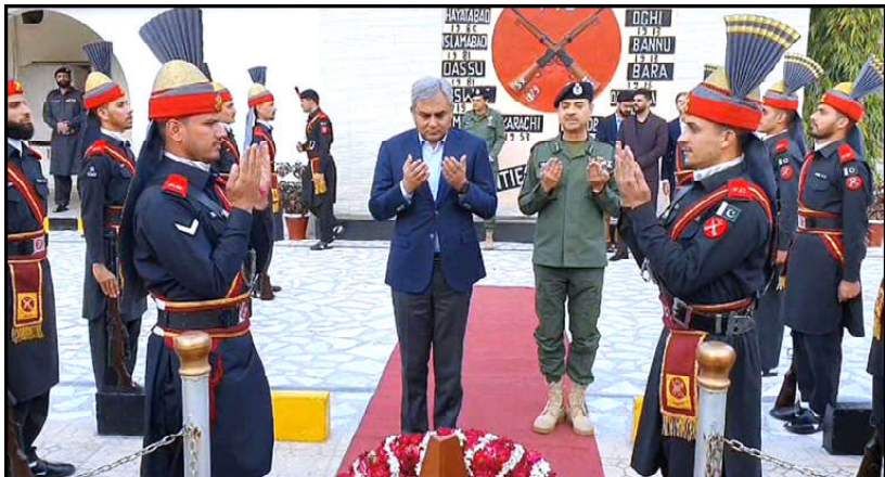
PESHAWAR: Federal Minister for Interior Mohsin Naqvi offering Dua at Martyrs Monument during his visit to Frontier Constabulary Headquarters.

He said that in the past, questions have been raised regarding the election of the Senate in Balochistan but this time, due to the efforts of Chief Minister Balochistan and other political leaders, Senate candidates were elected unopposed on 7 general seats, 2 technocrat seats and 2 women seats from Balochistan. He said that it has happened for the first time in the history of Balochistan that all the candidates have been elected unopposed on the 11 seats of the Senate from Balochistan after consultation with all the political parties. He said that all the political parties will continue to play their role in solving the problems of Balochistan by uniting like this.