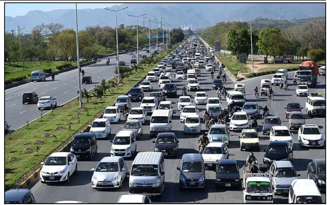
ISLAMABAD: A view of massive traffic on Expressway in the Federal Capital.

into a permanent state, the finance minister emphasized the synergy between the industrial sector and energy resources, alongside ongoing dialogues with the Ministry of Energy. He lauded the caretaker government for maintaining fiscal discipline and re-framed the "IMF program as Pakistan program" aimed at reinforcing Pakistan's economic foundation. He also called for proactive implementation and ownership of the reform agenda. The Minister stressed the importance of broadening the tax net to include under-taxed and untaxed sectors, particularly service providers, and addressed