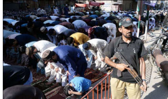
HYDERABAD: A large number of people offering Namaz-e-Jumma at Jamia Masjid city during Holy Fasting Month of Ramadan ul Mubarak

He expressed his happiness that PMDFC was the oldest company of the Punjab government which had been playing an important role in providing municipal services in different areas for last twenty five years. He said that it was gratifying that as a pilot project, re-tilational ponds in the selected villages were being cleaned using modern techniques. "Phase-wise cleaning of the polluted ponds is not only promoting aquatic life but also providing water for local agricultural purposes", he said. The minister emphasized measures to increase capacity building of municipal committees because the lack of efficiency of some municipal committees was hindering the timely completion of development schemes. He said that the problem of sewage needed more attention than solid waste management.