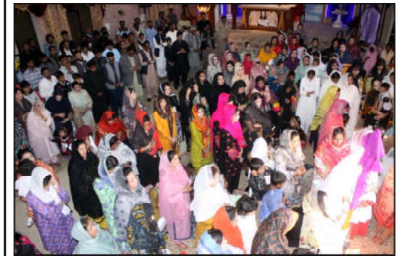
QUETTA: Members of Christian community engaging in services of Good Friday, at a Church.