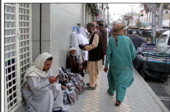
QUETTA: People are busy in Eid shopping ahead of Eid-ul-Fitar during the Holy Month of Ramadan-ul-Mubarak, at roadside stall located on Jinnah road in Quetta.

"This shift in rate cut expectations from the BOE is like a red flag to a bull, and markets have rallied sharply," she said. The Swiss National Bank on Thursday became the first major central bank to cut rates aimed at combating soaring inflation.