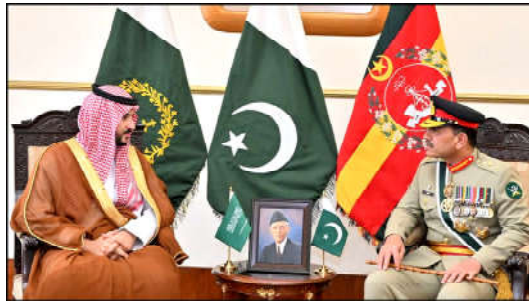
and thanked Army Chief, General Syed Asim Munir for inviting him as Guest of Honour at the occasion. The Minister of Defence of Saudi Arabia received a warm welcome on his arrival at Noor Khan Air Base specially participated in the Joint Services Pakistan Day Parade of the Armed Forces as Guest of Honour, an Inter Services Public Relations (ISPR) news release said.

RAWALPINDI (APP): Minister of Defence, Kingdom of Saudi Arabia Prince Khalid bin Salman bin Abdulaziz Al Saud on Saturday attended the Pakistan Day Parade