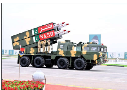
ISLAMABAD: Pakistan NASR missile contingent participate in Pakistan Day 2024 parade march past ceremony, at Shakarparian Parade Ground.

After the witnessing the Parade, Prince Khalid bin Salman bin Abdulaziz Al Saud met the Army Chief. In the meeting, matters of mutual interest, promotion of bilateral relations and increasing cooperation in various fields, especially defence were discussed.