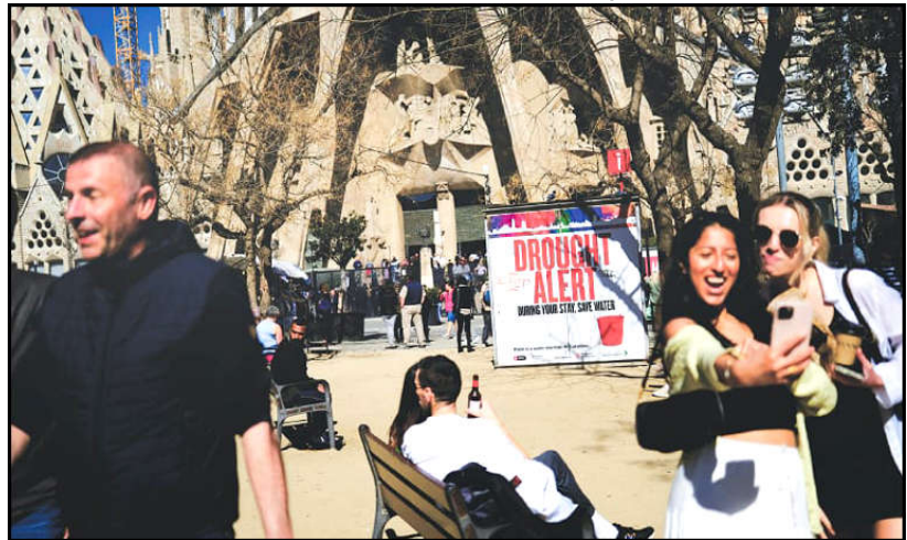
Tourists are seen next to a sign outside a church in Barcelona alerting them to severe drought in Spain's north-eastern region and urging them to save water due to low reservoir levels.