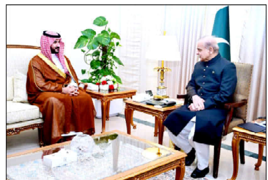
ISLAMABAD: Minister of Defense of Kingdom of Saudi Arabia His Royal Highness Prince Khalid bin Abdulaziz Al Saud calls on Prime Minister Muhammad Shehbaz Sharif

Sharif, federal cabinet members, services chiefs, diplomats, notables from different walks of life and a huge number of citizens attended the ceremony.