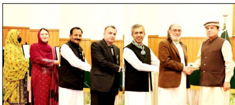
QUETTA: Acting Governor Balochistan Captain (retd) Abdul Khaliq Achakzai conferring Presidential Awards and Tamgha Imtiaz among the personalities for their services

ISLAMABAD (APP): Prime Minister Muhammad Shehbaz Sharif and Foreign Minister Ishaq Dar on Saturday strongly condemned the terrorist attack in Moscow, Russia, last night which resulted in loss of many lives and injuries to several others.