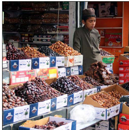
QUETTA: Dates are being selling on a shop as a demand of Dates increase on the arrival of the Holy Month of Ramadan-ul-Mubarak, located on Qandhari Bazar in Quetta.

However, the current predicament facing PCSIR employees paints a starkly different picture. Despite their invaluable contributions to scientific innovation, these diligent professionals are facing severe financial strain due to the prolonged delay in receiving their salaries.