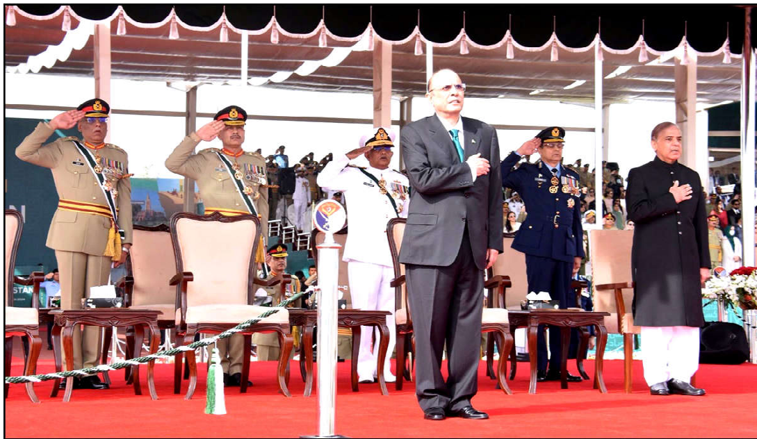
ISLAMABAD: President of Pakistan Asif Ali Zardari, Prime Minister Muhammad Shehbaz Sharif and Chairman Joint Chiefs of Staff Committee along with Tri-Services Chiefs at Pakistan Day Parade

ISLAMABAD (APP): Prince Khalid Bin Salman Bin Abdul Aziz Al Saud called on Prime Minister Shehbaz Sharif here at the Prime Minister House on Saturday and discussed in detail bilateral matters, regional peace, security and situation in the region.