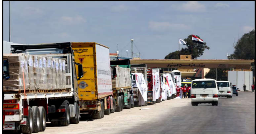
Vehicle line up, near the Rafah border crossing between Egypt and the Gaza Strip, amid the ongoing conflict between Israel and Palestinian Islamist group Hamas, in Rafah, Egypt.

We don't have enough modern air defence systems which, to be honest, requires enough political will to provide them," Zelenskiy said. "All our partners know what is needed and who can make truly life-saving decisions."