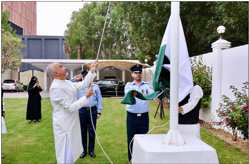
ABU DHABI: Ambassador Faisal Niaz Tirmizi, Pakistan's Envoy to the United Arab Emirates hoisting the national flag during the National Day event at the Embassy