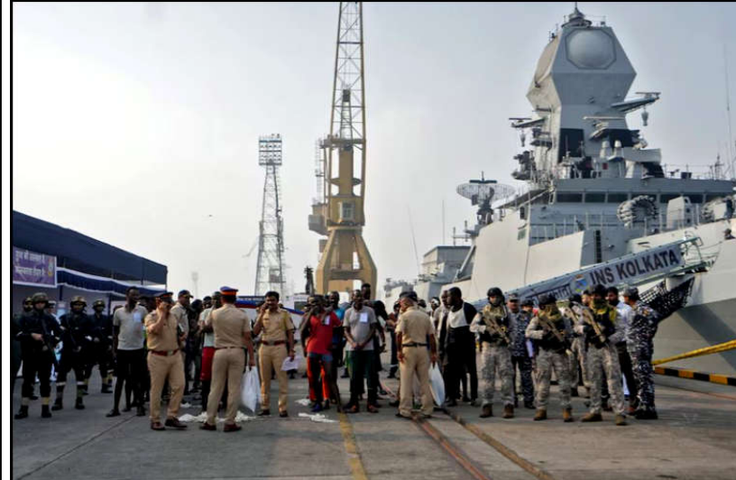
Indian soldiers stand guard next to captured Somali pirates after they were brought in for prosecution by the Indian Navy, at the Naval Dockyard in Mumbai, India.

Sudani's office said that the two would "discuss the future relationship" between Iraq and the United States following the fight against the extremists. Tensions soared amid the Israel-Hamas war with armed groups linked to Iran carrying out a slew of attacks on positions in the Middle East of the United States, the main ally of Israel.