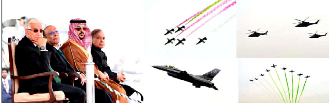
President Asif Ali Zardari, Prime Minister Muhammad Shehbaz Sharif, Minister of Defense of Kingdom of Saudi Arabia His Royal Highness Prince Khalid bin Abdulaziz Al Saud viewing the flypast of jets during the Pakistan Day Parade ceremony, at Shakarparian Parade Ground, Islamabad

ISLAMABAD (NNI): Prime Minister Shehbaz Sharif's decision to constitute various committees with an aim to revamp economy is a positive step to boost country's economic condition.