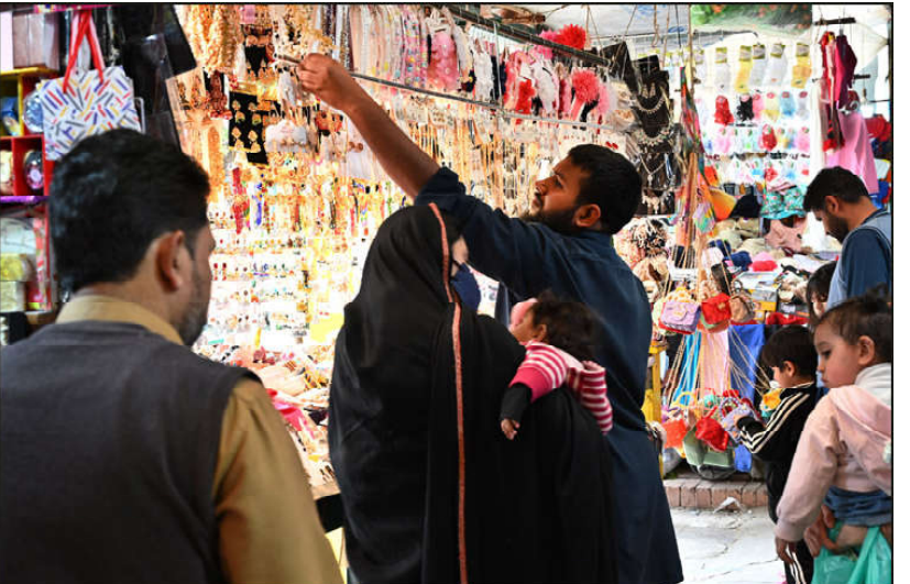
ISLAMABAD: Families shopping for upcoming Eid al-Fitr celebrations in Karachi Company Market.