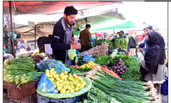
ISLAMABAD: People are buying vegetables in a Sunday weekly bazaar, in the Federal Capital.