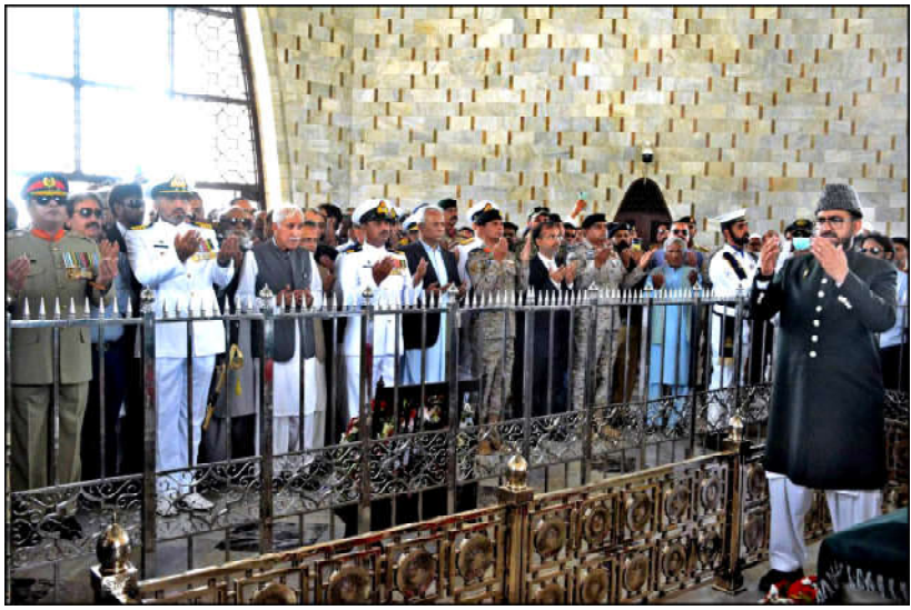
KARACHI: Federal Minister for Maritime Affairs, Qaiser Ahmed Sheikh offers fetea at the mausoleum of Quaid-e-Azam Muhammad Ali Jinnah on the occasion of Pakistan Day celebrations.