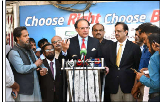
KARACHI: Federal Minister for Finance & Revenue, Muhammad Aurangzeb talking to media during his visit to Utility Stores Corporation to oversee the implementation of the enhanced Ramadan Relief Package.

The Indian diplomats did not even respond to the Iftar dinner invitation.