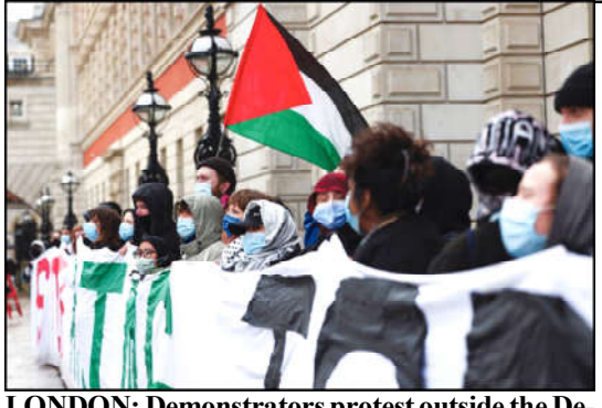
LONDON: Demonstrators protest outside the Department for Business and Trade in support of Palestinians.