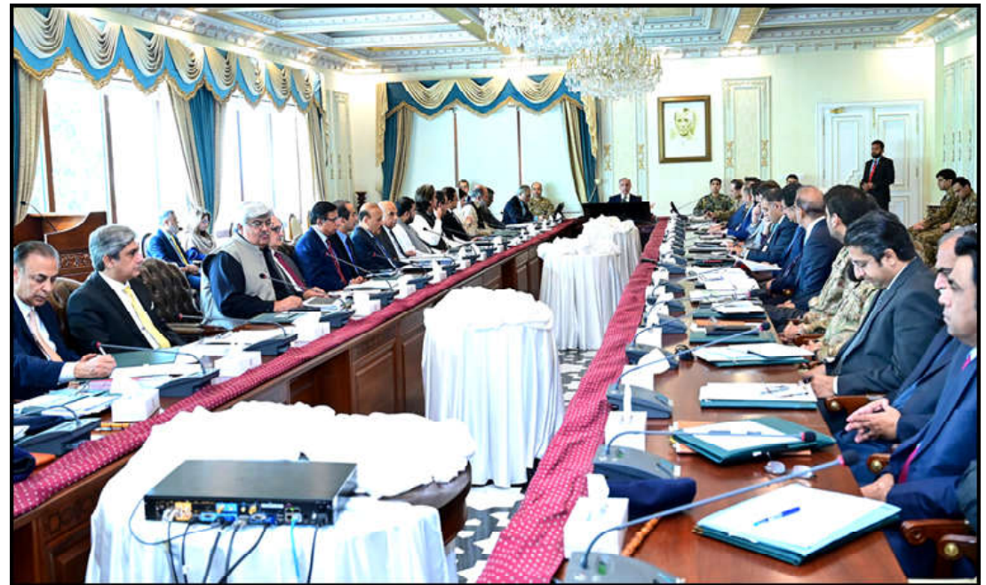
ISLAMABAD: Prime Minister Muhammad Shehbaz Sharif chairs a meeting on measures against the spectrum of illegal activities.

"The close relations established between the people of the two countries will further strengthen," the president added.