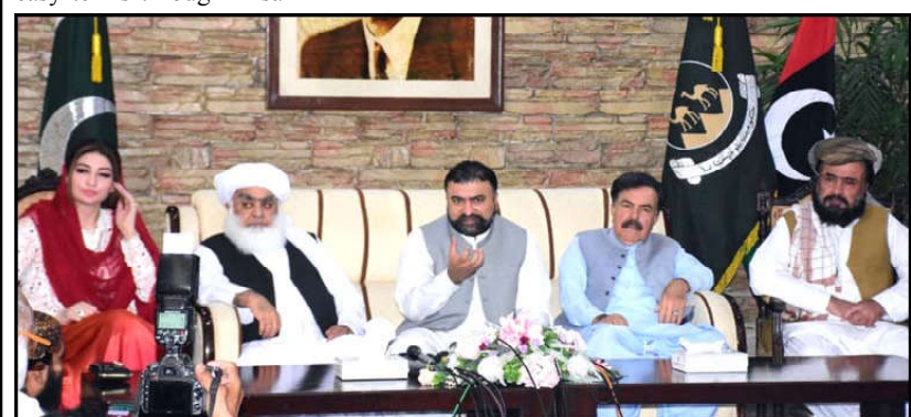
ISLAMABAD: Chief Minister Balochistan Mir Sarfraz Ahmed Bugti addressing a press conference along with leaders of allied political parties

It was approved in the meeting to control the administrative affairs of the center of excellence through a board and to link the research center with regional universities.