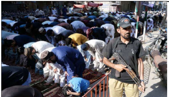
HYDERABAD: A large number of people offering Namaz-e-Jumma at Jamia Masjid city during Holy Fasting Month of Ramzan ul Mubarak