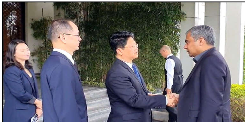
ISLAMABAD: Interior Minister Mohsin Naqvi meeting with Chinese officials at Chinese Embassy.

promote the good governance as the beneficiary of such governance was common people of the province, who is main victim of bad governance. He mentioned that all parties were actively involved in providing relief to the common men of the province. He said that for the first time in history, Senators have been elected from the province unopposed.