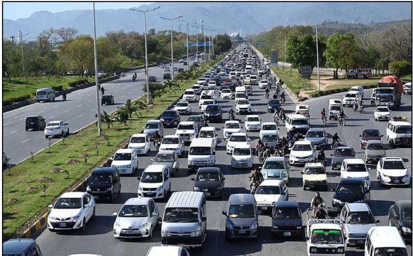
ISLAMABAD: A view of massive traffic on Expressway in the Federal Capital.

During the meeting, the DC directed the magistrates and Excise & Taxation officers to launch a crackdown against tinted glasses and fancy number plates. He urged the citizens of the federal capital to remove tinted glasses and fancy number plates from their vehicles and use only approved number plates issued by the Excise and Taxation Department to avoid any action. It is pertinent to mention here that the joint operation of the Excise and Taxation Department.