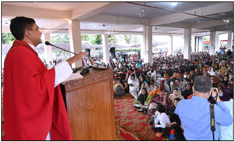
ISLAMABAD: Bishop of Fatima Church addresses on Good Friday Day.

The minister said privatisation of power distribution companies or disco was next on the card after selling off the PIA.