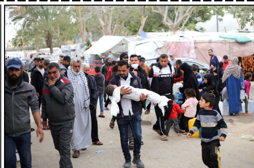
A mourner carries the body of a Palestinian child killed in an Israeli strike, amid the ongoing conflict between Israel and Hamas, in Khan Younis in the southern Gaza Strip.

At the ICJ, South Africa has charged that Israel is perpetrating a genocide in Gaza, an accusation strongly denied by Israel. Pretoria dragged Israel before the court, saying it was in breach of its obligations under the 1948 UN Genocide Convention, and urging the court to order a ceasefire. In a ruling in mid-January that made headlines worldwide, the ICJ ordered Israel to do everything it could to prevent genocide during its Gaza offensive. The court also ruled that Israel must allow aid into Gaza to ease the desperate humanitarian situation there. South Africa followed up with a request for fresh measures a few weeks later, citing an announced incursion into the city of Rafah, but the court declined to impose