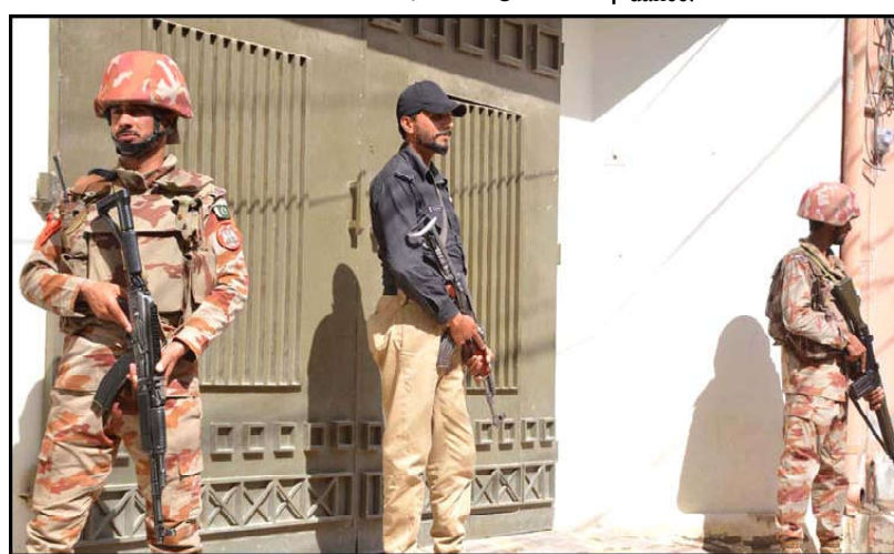
QUETTA: Security personal stand alert during Good Friday service at Bethel Memorial Methodist Church.