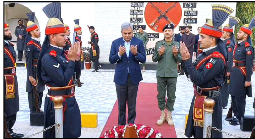
PESHAWAR: Federal Minister for Interior Mohsin Naqvi offering Dua at Martyrs Monument during his visit to Frontier Constabulary Headquarters.

He also conveyed the warm regards of the Palestinian President Mahmoud Abbas and thanked the government and the people of Pakistan for their consistent support and solidarity with the Palestinian people.