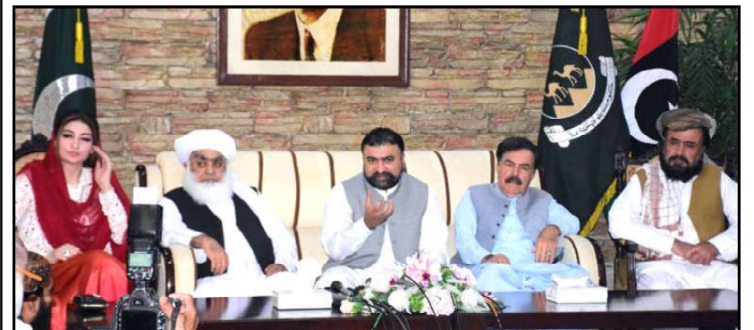
ISLAMABAD: Chief Minister Balochistan Mir Sarfraz Ahmed Bugti addressing a press conference along with leaders of allied political parties

Paying tribute to the security forces for foiling terrorist attacks in Gwadar and Turbat, the Chief Minister said the vigilant jawans thwarted the terrorist attack in Gwadar by killing the suicide bombers within a period of only twenty minutes.