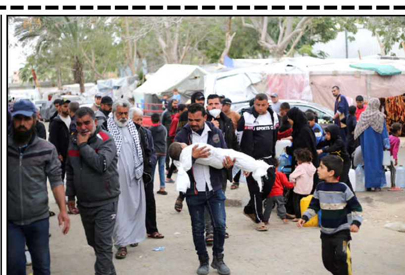
A mourner carries the body of a Palestinian child killed in an Israeli strike, amid the ongoing conflict between Israel and Hamas, in Khan Younis in the southern Gaza Strip.

"India and Ukraine have been traditional friends, but I think there is much more that we can do and should do, not only in the interests of our nations, but also in the interest of global development and security architecture," Kuleba said Friday. "We will be looking forward to restoring what had existed before the large scale invasion of Russia in Ukraine began."