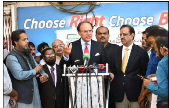
KARACHI: Federal Minister for Finance & Revenue, Muhammad Aurangzeb talking to media during his visit to Utility Stores Corporation to oversee the implementation of the enhanced Ramadan Relief Package.

people at their respective areas. He said there will be no compromise on the quality of the food items being sold through the Utility Stores. Responding to a suggestion regarding donations from philanthropists to Utility Stores Corporation, the Minister termed it a good proposal and said as philanthropists of this city always generously helped the poor people and they must donate money to Utility Stores for the purpose. Aurangzeb said there was a wrong impression that IMF was against the subsidies but the fact is that International Monetary Fund is against un-targeted subsidies while it wants the targeted subsidies be enhanced.