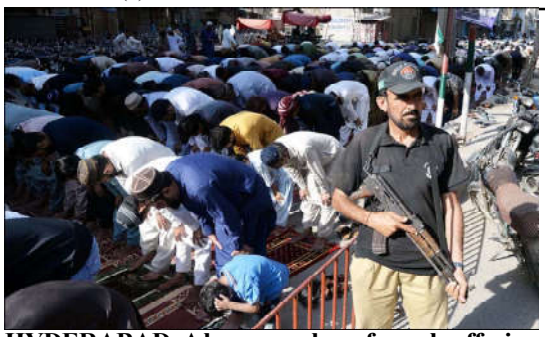
HYDERABAD: A large number of people offering Namaz-e-Jumma at Jamia Masjid city during Holy Fasting Month of Ramzan ul Mubarak