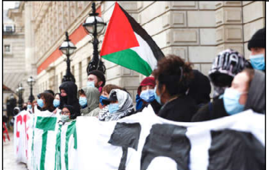
LONDON: Demonstrators protest outside the Department for Business and Trade in support of Palestinians.

"The fact that Palestinian deaths are not solely caused by bombardment and ground attacks, but also by disease and starvation, indicates a need to protect the group's right to exist," it said in a statement. The MSF medical charity said there was no change on the ground since the Security Council resolution.