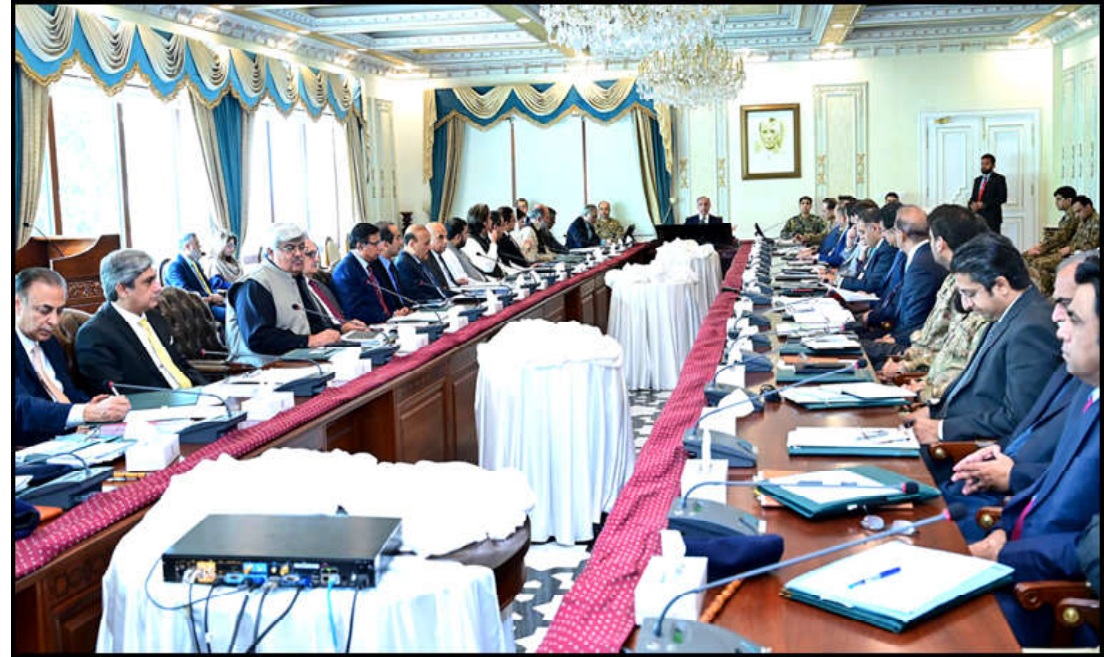
ISLAMABAD: Prime Minister Muhammad Shehbaz Sharif chairs a meeting on measures against the spectrum of illegal activities.

"The close relations established between the people of the two countries will further strengthen," the president added.