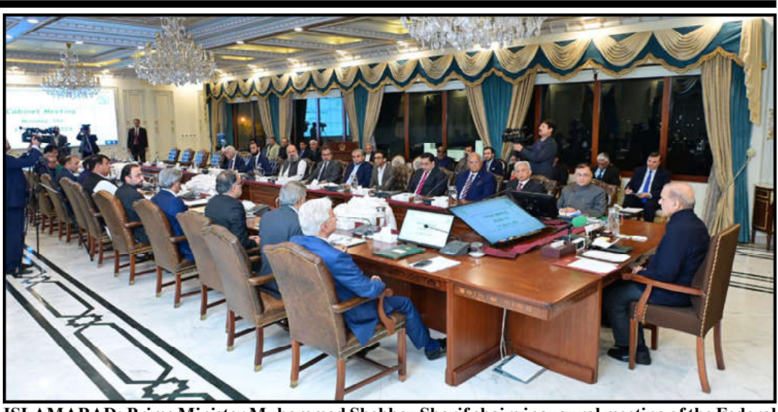
ISLAMABAD: Prime Minister Muhammad Shehbaz Sharif chairs inaugural meeting of the Federal