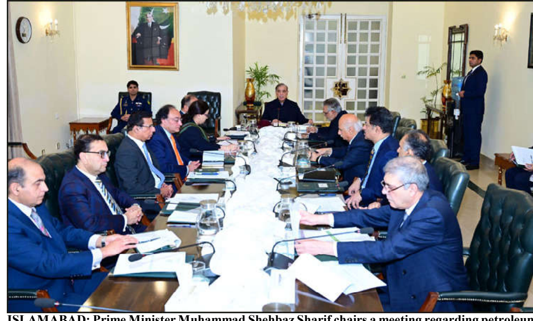
ISLAMABAD: Prime Minister Muhammad Shehbaz Sharif chairs a meeting regarding petroleum sector in Federal Capital.