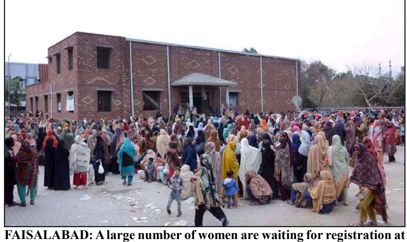
Salimi Chowk Al Fateh Sports Complex to get the Ramadan package.

The primary purpose the camp was to maintain a blood reserve for patients suffering from diseases like Thalassemia, Hemophilia, and Leukemia, to meet their blood requirements