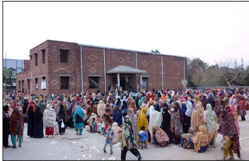
FAISALABAD: A large number of women are waiting for registration at Salimi Chowk Al Fateh Sports Complex to get the Ramadan package.

soon as possible. He termed the timely completion of ongoing Hydel Power Development Projects as of vital importance and directed the authorities concerned to ensure that the projects are completed within the stipulated timelines. He further directed them to fix the priorities in this regard and added that revenue generating projects be funded on priority basis. Meanwhile, chairing a meeting of the Local Government Department, the Chief Minister directed the concerned authorities to release special funds for the payment of salaries and pensions to the employees of financially weak Tehsil Municipal Administrations.