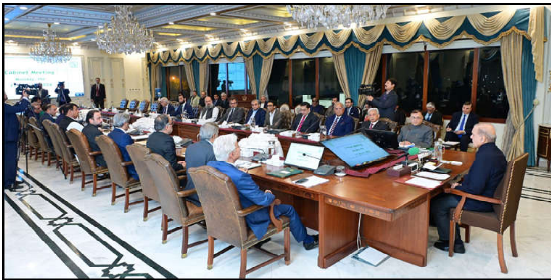
ISLAMABAD: Prime Minister Muhammad Shehbaz Sharif chairs inaugural meeting of the Federal Cabinet.