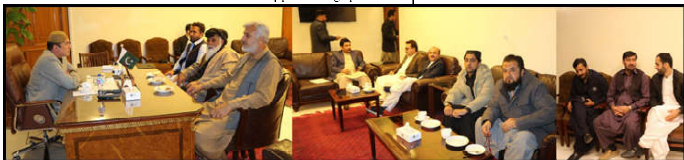
QUETTA: A delegation of Chaman meeting with Speaker Balochistan Assembly Captain (Retd) Abdul Khaliq Achakzai.