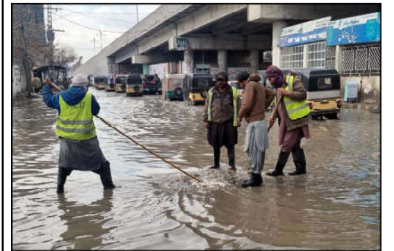
QUETTA: Workers of Quetta Metropolitan Corporation (QMC) are busy in cleaning and draining the stagnant rainwater after heavy downpour of winter season.

ISLAMABAD (APP): To measure the performance and quality of Cellular Mobile Operators' (CMOs) services being provided to customers, the Pakistan Telecommunication Authority (PTA) carried out an Independent Quality of Service (QoS) Survey in 17 cities of Khyber Pakhtunkhwa, Punjab, Sindh, Balochistan and three cities of Azad Jammu & Kashmir (AJK). Survey routes were selected to cover main roads, service roads, and key sectors/colonies, totalling 14,000 kilometres in 79 days to cover the maximum area said a news release. Mobile handsets, set to technology auto-detect and 3G locked modes, were employed for Voice Calls, SMS, and Mobile Broadband/Data sessions, especially in AJ&K cities. The survey included 0.25 million tests for Data, 45,000 for Voice & SMS, and 0.13 million tests in Okla, utilizing automated QoS Monitoring & Benchmarking Tools to ascertain compliance with Next Generation Mobile Service (NGMS) licenses as well as Cellular Mobile Network Quality of Service (QoS) Regulations 2021.