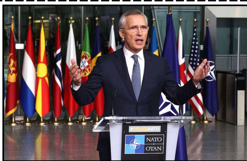
NATO Secretary General Jens Stoltenberg gestures as he attends a press conference on the day of a flag-raising ceremony at NATO headquarters following the accession of Sweden to the alliance, in Brussels, Belgium.

Biden to his predecessor and aspiring successor Donald Trump, a remark widely interpreted to mean exactly the opposite, as the former KGB man hopes his notoriety will boost the Republican mogul. Trump has voiced admiration for Putin, raged against NATO, the alliance founded to defend against Moscow, and boasted that he within one day would end the war in Ukraine, which Russia invaded two years ago. Trump supporters in Congress, seizing on an unrelated dispute over migration, have held up approval of $60 billion in military aid for Ukraine, whose troops have faced the first battlefield setbacks in months as ammunition runs scarce.