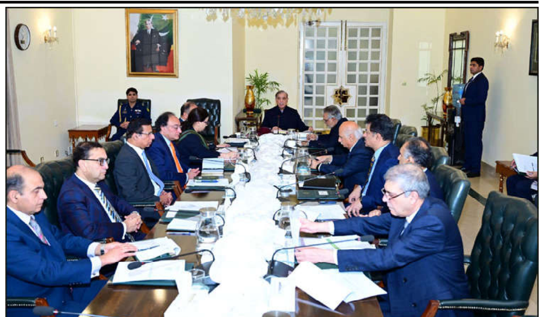
ISLAMABAD: Prime Minister Muhammad Shehbaz Sharif chairs a meeting regarding petroleum sector in Federal Capital.

Firstly, Yan suggested to promote China-Pakistan joint energy exploration and development cooperation.