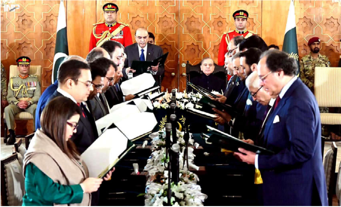
ISLAMABAD: President Asif Ali Zardari administering oath of office to members of Federal Cabinet at Aiwan-e-Sadr. Prime Minister Muhammad Shehbaz Sharif was also present on the occasion.

Ph: 2841470/2841473 Vol: XIX No. 267, Ramzan 01, 1445 AH Tuesday March 12, 2024, Pages 04, Price Rs.15