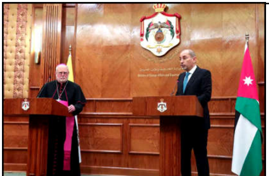
Jordan's Foreign Minister Ayman Safadi speaks during a joint press conference with Archbishop Paul Richard Gallagher, the Vatican Secretary for Relations with States, in Amman, Jordan.

leading housing reforms that transformed China into a nation of homeowners. The nearly 3,000-member National People's Congress approved a revised State Council law that directs China's version of the cabinet to follow Xi's vision. The vote was 2,883 to eight, with nine abstentions. Other measures passed by similarly wide margins. The most notable were recorded for the annual report of the supreme court, which was approved by a 2,834 to 44 vote. In brief closing remarks, Zhao Leji, the legislature's top official, urged the people to unite more closely under the Communist Party's leadership "with comrade Xi Jinping at its core." The party leaders who run the State Council used to have a much freer hand in setting economic policy. Neil Thomas, a Chinese politics fellow at the Asia Society Policy Institute, said in an emailed comment.