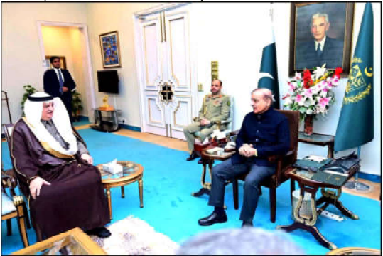
ISLAMABAD: H.E. Nawaf bin Saeed Ahmad Al-Malki, Ambassador of the Kingdom of Saudi Arabia to Pakistan calls on Prime Minister Muhammad Shehbaz Sharif.

Pakistani Hajj pilgrims. He thanked the Custodian of the Two Holy Mosques, King Salman bin Abdul Aziz, and Crown Prince Muhammad bin Salman, for their kind wishes on his re-election as prime minister. Given the special fraternal relationship between Pakistan and Saudi Arabia, the prime minister said the Saudi ambassador was the first envoy he received after assumption of office. Extending an invitation to the prime minister to visit Saudi Arabia, the ambassador assured him of the Saudi leadership's full support.