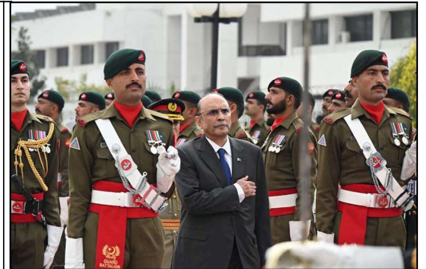
ISLAMABAD: President Asif Ali Zardari inspecting the Guard of Honour, at Aiwan-e-Sadr.