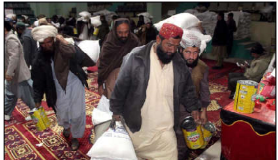
QUETTA: People hold ration bags given by Qatar charity during Holy month of Ramadan shopping.