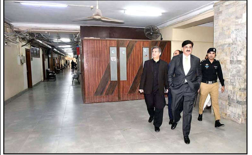
KARACHI: Sindh Chief Minister Syed Murad Ali Shah pays a surprise visit to the New Secretariat.