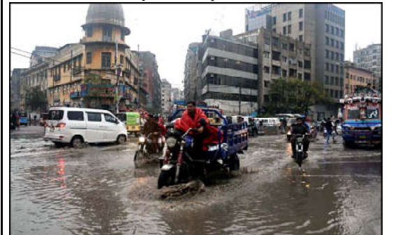
KARACHI: Motorists and pedestrians wade through a street after heavy monsoon rains in the port city of Karachi.

HYDERABAD (INP): The Deputy Commissioner Hyderabad Tariq Qureshi has directed the relevant departments to take immediate action to remove heavy signboards and billboards from the city. According to a handout issued on Friday, a letter has also been written by the Deputy Commissioner to the concerned departments in this regard. This action was deemed necessary as the meteorological department has forecasted heavy rains in Hyderabad, and in such circumstances, it is crucial to undertake the mentioned operation to prevent any untoward incidents. On the other hand, Deputy Commissioner Tariq Qureshi and Additional Deputy Commissioner Hyderabad Najeeb-ur-Rehman Jamali visited various areas and pumping stations of Hyderabad and directed the concerned officers to assess the situation by visiting their respective areas.