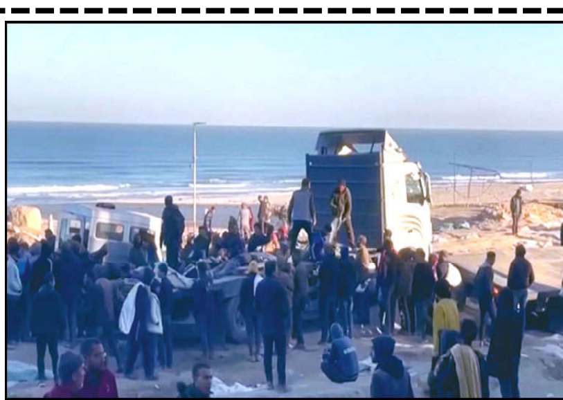
Palestinians transport casualties following Israeli fire on people waiting for aid in Gaza City.

metres apart, in the first of which dozens were killed or injured as they tried to take aid from the trucks and were trampled or run over. He said there was a second, subsequent incident as the trucks moved off. Some people in the crowd approached troops who felt under threat and opened fire, killing an unknown number in a "limited response", he said. He dismissed the casualty toll given by Gaza authorities but gave no figure himself. In a later briefing, Israel Defense Forces spokesman Rear Admiral Daniel Hagari also said dozens had been trampled to death or injured in a fight to take supplies off the trucks.