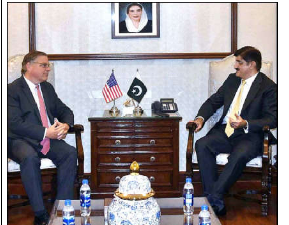
KARACHI: Sindh Chief Minister Syed Murad Ali Shah meets American Ambassador Donald Blome at CM House.

KARACHI: Sindh Chief Minister Syed Murad Ali Shah says complete restoration of peace, provision of potable drinking water in Karachi and further improving transport and infrastructure of the province are the top priorities of his government. He was talking to US Ambassador Donald Blome in Karachi today.