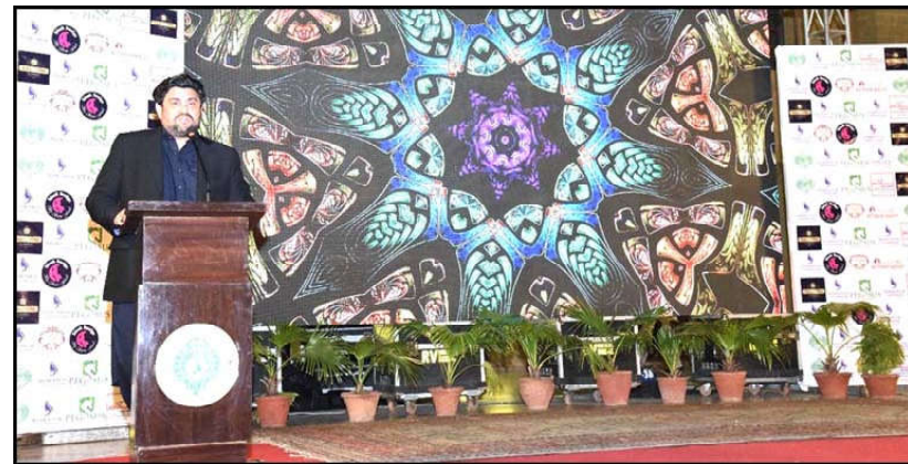
KARACHI: Governor Sindh Kamran Khan Tessori addressing during launch ceremony of Womentum Organization at Governor House.

Gandapur, a PTI leader who contested the polls as an independent candidate from KP, was elected as the province's new chief minister after voting concluded in the KP Assembly. Gandapur defeated Pakistan Muslim League-Nawaz (PML-N) candidate Dr Ibadullah Khan after securing 90 votes compared to the latter's 16.