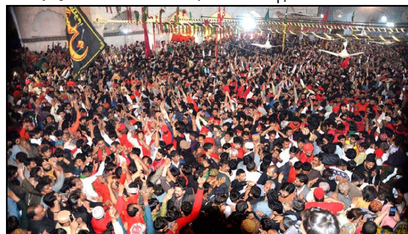
SEHWAN: A large number of devotee attending 772nd Urs of Hazrat Lal Shabbaz Qalandar.

PML-N leader Ahsan Iqbal also told media that MQM-P and PML-N are allies and all matters solved between both sides.