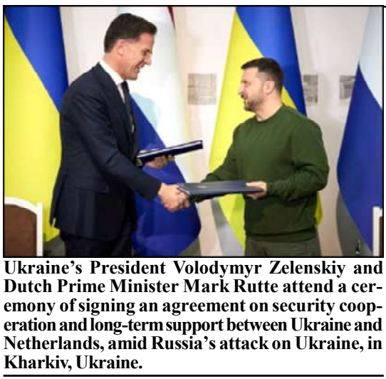
Ukraine's President Volodymyr Zelenskiy and Dutch Prime Minister Mark Rutte attend a ceremony of signing an agreement on security cooperation and long-term support between Ukraine and Netherlands, amid Russia's attack on Ukraine, in Kharkiv, Ukraine.

Monitoring Desk DHAKA: A massive fire in Bangladesh that raged through a six-storey building home to restaurants where many families with children were dining has killed at least 46 people and injured dozens, the health minister said on Friday. Fire authorities said a gas leak or a stove could have caused Thursday's blaze in the capital, which spread quickly after breaking out in a biryani restaurant, and was only brought under control following two hours of effort by 13 units of firefighters. Hospitals were treating 22 people with burns, Health Minister Samanta Lal Sen told reporters. "All 22 people [...] are in critical condition," Sen, himself a well-known physician, said after a visit to the Dhaka Medical College Hospital. "We are trying our best to save their lives," he said. Prime Minister Sheikh Hasina expressed shock and sorrow at the incident, ordering swift treatment for the injured. She urged adherence to construction rules and regulations, including requirements for essential safety features such as fire exits and ventilation systems to prevent such tragedies in the future. One survivor, Mohammad Altaf, recounted his narrow escape from the blaze that killed two colleagues. "I went to the kitchen, broke a window and jumped to save myself," he told reporters, adding that a cashier and server who urged people to leave during the first moments had died later.