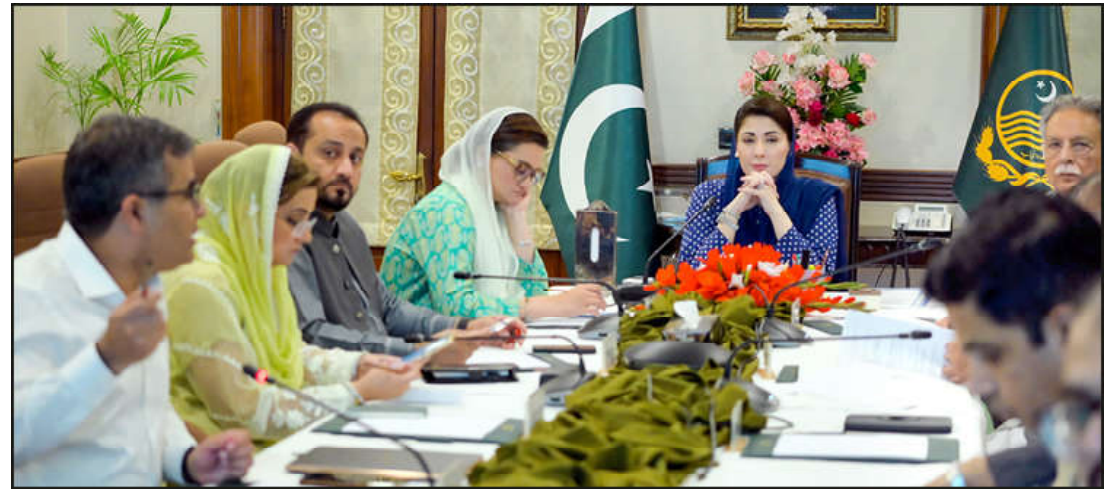
LAHORE: Punjab Chief Minister Maryam Nawaz Sharif presides over the special meeting regarding Health Reforms in province.

available in such areas. Ultrasound, laboratory test, medicines, initial medical check-up, examination of mother & child facilities would be available in the field hospitals. CM apprised that launching of 32 field hospitals would be undertaken next month. 200 clinic on wheels would be established for the residents of semi urban and katchhi abadies.