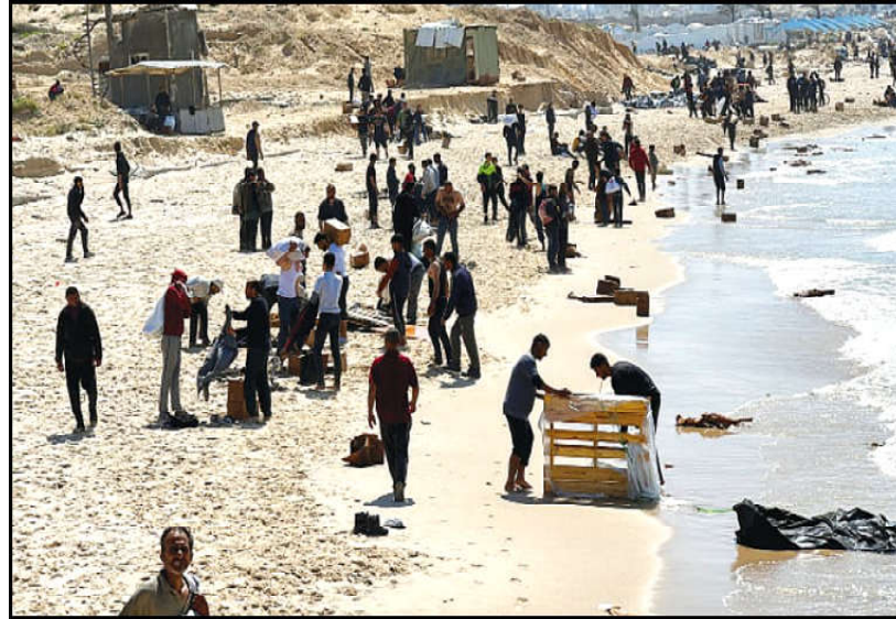
Palestinians gather on a beach as they collect aid dropped by an airplane, amid the ongoing Israeli bombardment of the northern Gaza Strip.

He was speaking at the start of a meeting with Israel Defense Minister Yoav Gallant at the Pentagon as relations between US President Joe Biden and Israeli Prime Minister Benjamin Netanyahu sank to a wartime low.