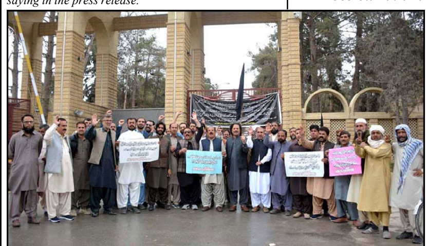
QUETTA: Activities of joint action committee hold protest outside University of Balochistan.

Pakistan signed the hosting rights agreement with the ICC in December to hold the tournament. There had been doubts about whether Pakistan would stay as the host country for the Champions Trophy after India had forced the PCB into hosting most of the matches of September's Asia Cup in Sri Lanka. It will be the first major global cricket tournament to be played in Pakistan since 1996 when it hosted the Men's Cricket World Cup alongside India and Sri Lanka. According to a press release issued by the board today, the meeting discussed the "lead-up to and successful conduct" of the event next year. PCB Chairman Mohsin Naqvi said it is an absolute pleasure and welcome development for the board and the fans across the country. "The PCB will arrange top-notch facilities as per the stature of this historic tournament," he was quoted as saying in the press release.