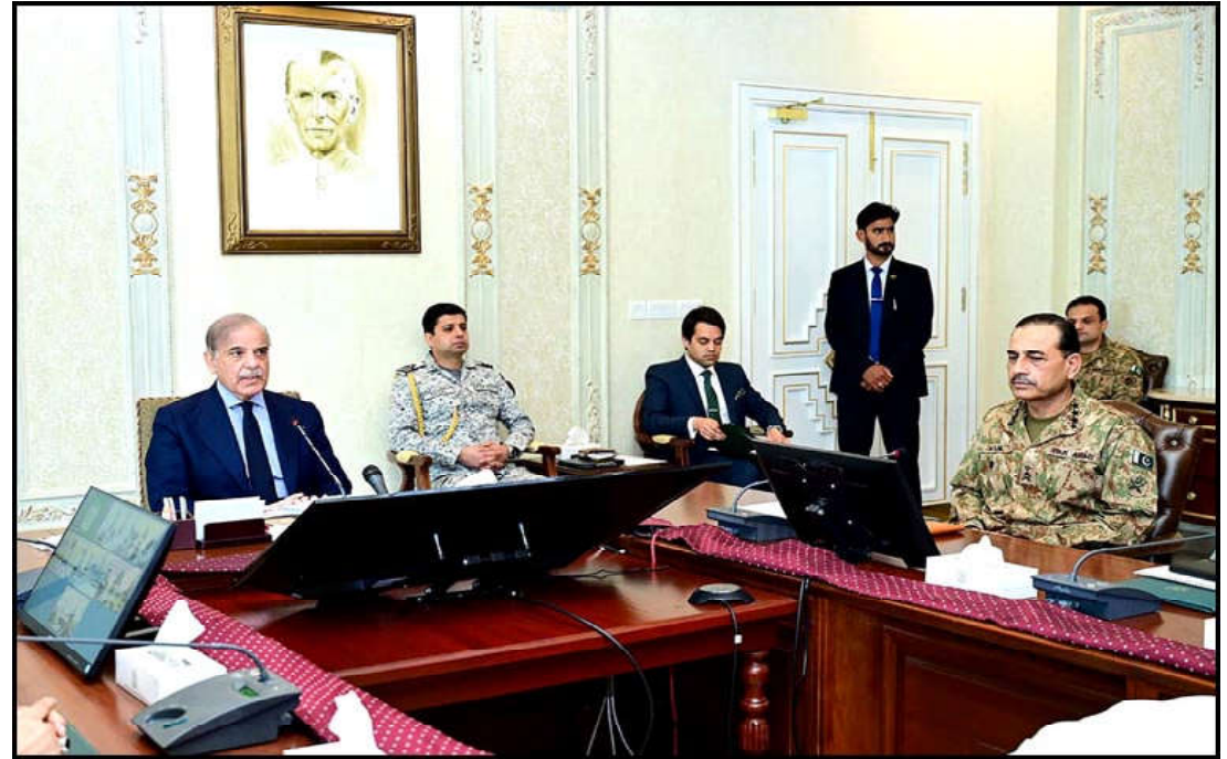
ISLAMABAD: Prime Minister Muhammad Shehbaz Sharif chairs a high level security meeting.