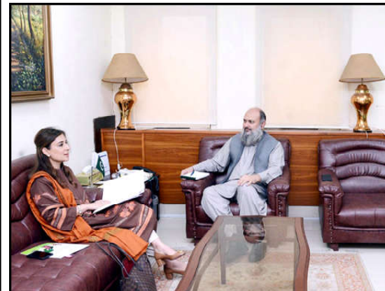
ISLAMABAD: NCRC Chairperson collaborates with Federal Minister for Commerce, Jam Kamal Khan to elevate child rights agenda and boost Pakistan's Global Image.