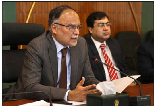
ISLAMABAD: Federal Minister for Planning, Development & Special Initiatives, Professor Ahsan Iqbal chairs the first Steering Committee meeting to implement 5Es development framework.

ISLAMABAD (APP): Empowerment. The National Economic Council (NEC) approved the framework last year in June, following which the Planning Ministry expedited its implementation, the formation of a Steering Committee. "Engagement with all ministries is a part of the exercise which has been started on the directions of Planning Minister Ahsan Iqbal," it added. In the one-day workshop, all the stakeholders and experts from various fields including academia and industry will be invited and their proposals to be considered before finalizing the action plan to implement the 5Es framework. Chairing the meeting, the minister directed all the ministries to come up with solid proposals with their respective Es in the workshop. "The plans should be holistic with inputs and outputs so that its implementation can be ensured. The 5Es framework is centred on five key pillars including Exports, E-Pakistan, Environment and Climate Change, Energy and Infrastructure, Equity and