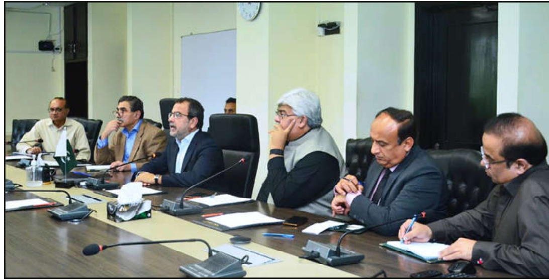
ISLAMABAD: Federal Minister for Power, Sardar Awais Ahmad Khan Leghari addresses the CEOs and Chairmen of DISCOS via video link.

The minister also sought a report on enrollment declining trend in the mechanical technology course. Practical procedures were very important along with the theoretical course, therefore, the relevant laboratories were being upgraded, he said and asserted that enrollment rate could be increased by improving practical system and more skilled manpower could be sent abroad by improving the quality of technical education. The PBTE chairman said that the Punjab Board of Technical Education was ISO certified and conducted examinations for 884 courses, besides providing online services and conducting online exams.