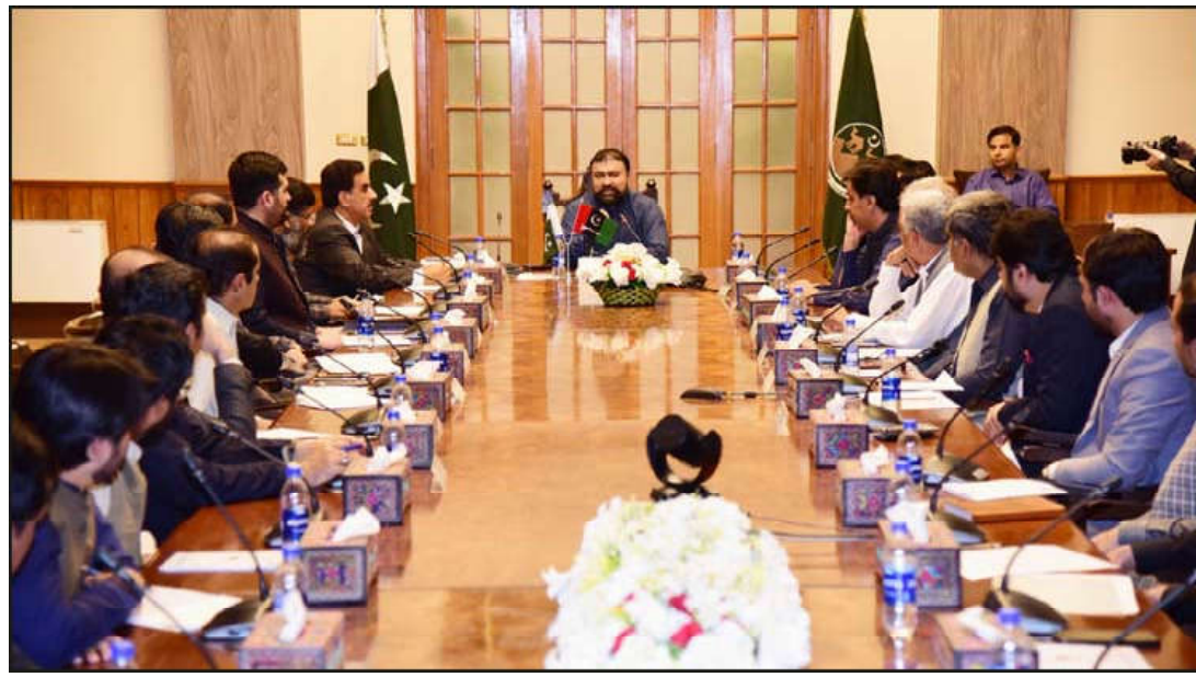
QUETTA: A representative delegation of doctors organizations meeting with Chief Minister Balochistan Mir Sarfaraz Ahmed Bugti.

Quetta metropolitan Corporation. With its 900 stores and 63 buildings, the Corporation may bring in Rs 300 million a month in revenue. Conversely, he expressed regret that only a small amount, measured in thousands, is gathered. Due to their inability to simplify and bring amendment in the revenue generation method, QMC is now liable for Rs 1.05 billion. He was afraid that the amount would double the following year if it wasn't paid to the contractors and other parties. Expressing his regret over the apathy of the occupants of the government-leased properties, he said there are 20 shops and leased properties that did not pay a single penny