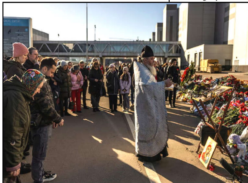
A priest conducts a service near the Crocus City Hall following a deadly attack on the concert venue in the Moscow Region, Russia.

IOM's data showed that the deadliest year for migrants in the last decade was 2023, when it recorded 8,541 deaths in part due to a sharp increase of fatalities in the Mediterranean.