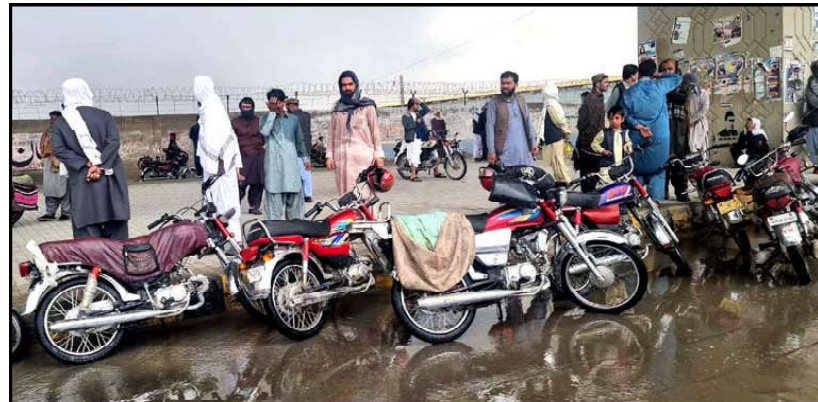
QUETTA: Motorists are standing under the shade of flyover to protect themselves from rain, at Koyla Phattak in Quetta.

eliminate the scourge of terrorism afflicting the country. COAS stated that the nation had steadfastly fought the war on terror for the last two decades and had defeated the nefarious designs of Pakistan's adversaries. Noting the recent surge in terrorist incidents, COAS remarked that the enemies of Pakistan had once again underestimated the resilience and grit of the State and the people of Pakistan. He said, "we shall fight terrorism till every terrorist casting an evil eye on Pakistan, its people and their guests, is eliminated; we shall not leave any stone unturned to ensure that every foreign citizen, especially the Chinese nationals, contributing to the prosperity of Pakistan, is safe and secure in Pakistan. We shall fight terrorism with all our might, to the very end." The meeting concluded with the participants reiterating resolve to comprehensively combat terrorism employing all resources available to the state.