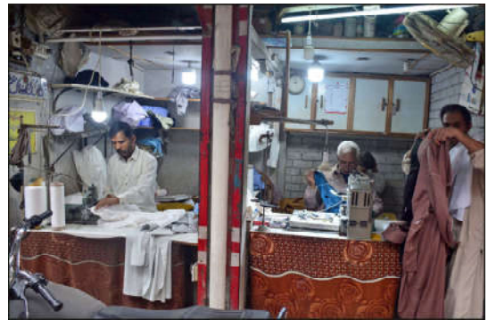
RAWALPINDI: Tailors sew clothes at their shop in Dhok Khaba ahead of Eid al-Adha, in the city.

On a month-on-month basis, the imports from US into the country witnessed an increase of 12.34 per cent during February 2024.