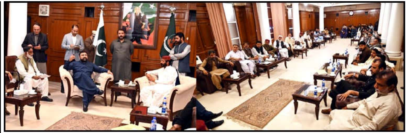
QUETTA: Elites and public representative delegations meeting with Chief Minister Balochistan Mir Safaraz Ahmed Bugti

and expressed Iran's commitment to connecting Chabahar port with the Zahidan railway network, potentially extending connectivity to Russia and Central Asia countries. The Gabd-Rimdan border crossing was identified as a more viable option than Quetta-Taftan, given its proximity to Gwadar and Chabahar. Ahsan Iqbal proposed adopting Iran's vocational and technical training mechanism to empower unemployed youth in Balochistan. During the meeting, both sides agreed that strengthened bilateral ties could contribute to reducing tendencies of terrorism and extremism in the region.