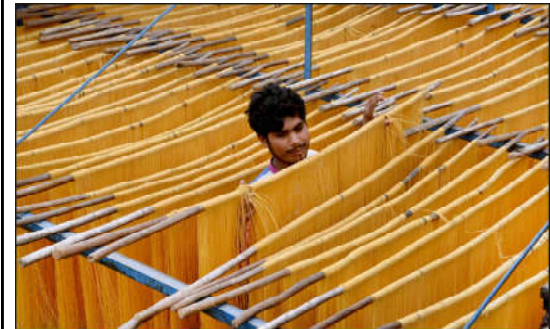
LAHORE: A worker preparing vermicelli as per increased demand of customers to be used during Eid-ul-Fitr celebrations.

He said that Brazil was part of various economic and trade integration forums in the world and South, South Cooperation were very important from which Pakistan can take full benefits.