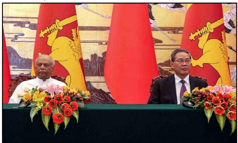
Sri Lanka's Prime Minister Dinesh Gunawardena and China's Premier Li Qiang during bilateral talks in Beijing.

Magyar, 43, a lawyer formerly close to the government, plans to launch a new party to challenge Orban. "Hungarians thank you ... for coming in the thousands tonight ... to tell those in power that we have had enough."