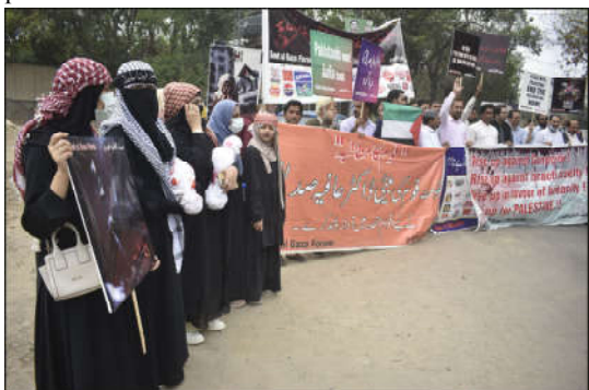
LAHORE: Members of civil society are protesting against Israel's aggression on Palestine.

Special Secretary directed that two members from the SNG should be included in the Technical Working Group. She expressed satisfaction that the financial management system has been successfully implemented in local governments with the technical support of SNG.