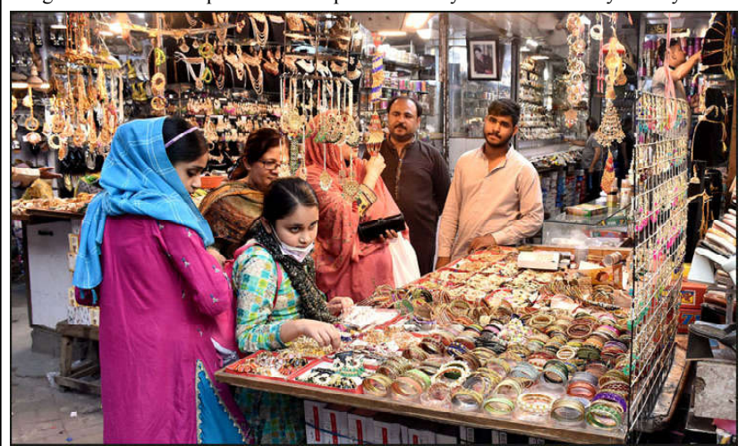
LAHORE: Women busy in shopping for upcoming Eid ulFitr festival.

Pakistan and Turkey have a long history of warm friendship, and both countries have stood by each other during disasters, such as floods and earthquakes. The minister appreciated the support extended by Turkey.