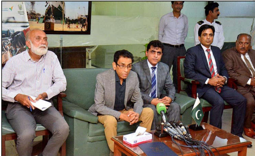
KARACHI: Dr. Khalid Maqbool Siddiqui Federal Minister for Education and Professional Training addressing Press Conference at NAVTTC Regional office Sindh.