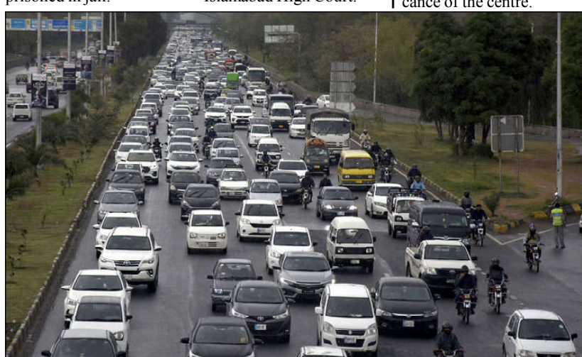
ISLAMABAD: A view of massive traffic jam at Islamabad Expressway during rain in the Federal Capital.

The state counsel told Additional Advocate General Punjab Baligh uz Zaman has informed Islamabad High Court.