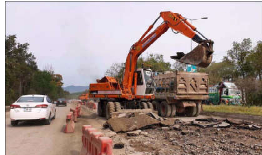
ISLAMABAD: Heavy machinery being used to expand a road at Chak Shahzad in the Federal Capital.

The meeting, graced by a multitude of officials and stakeholders, witnessed a thorough briefing session by Assistant Commissioners regarding their operational endeavors.