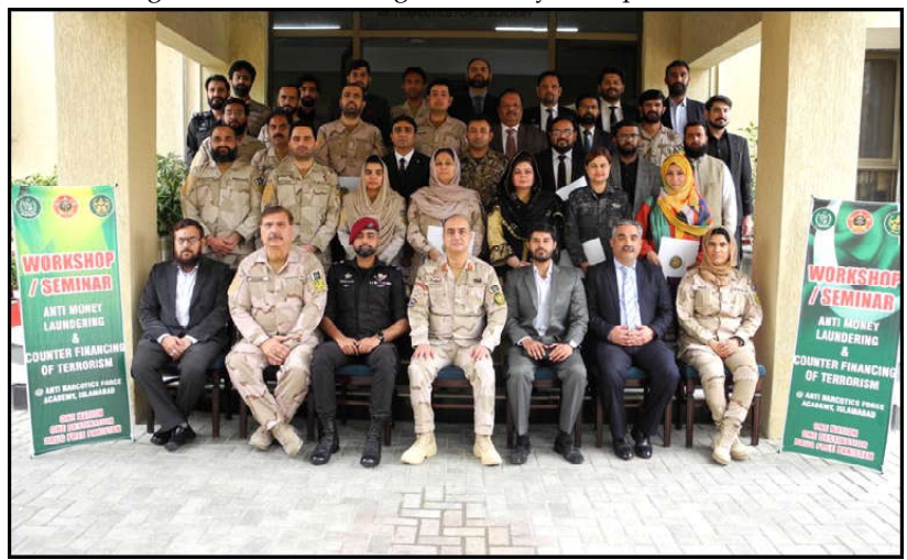
Counter Financing of Terrorism.

sectoral endeavor, ANF is actively engaged with all stakeholders namely MoI, NACTA, FATF Secretariat, FMU, Police, FIA, NAB, CTD and FBR for information sharing, cooperation and provision of data