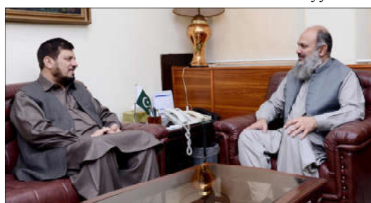
ISLAMABAD: Governor KPK, Haji Ghulam Ali calls on Federal Minister for Commerce, Jam Kamal Khan.

unity and closeness of the hearts of the Islamic Ummah. In the exhibition, along with Quranic manuscripts, calligraphy panels and works of art have been presented and placed before the public. These Qur'ans are written in beautiful Nastaliq, Thulth Naskh calligraphy, and some of them are decorated with gold water and other colors and patterns of flowers and shrubs. The exhibition includes dozens of original manuscripts of the Quran, some of which are accompanied by Persian translations. The organizer said the existence of 800-year-old copies of the Holy Qur'an is an emphasis on the historical status of the legacy of the Prophet Hazrat Muhammad Sallallahu Alaihe wa Alihe Wasallam Khatam-un-Nabiyyeen.