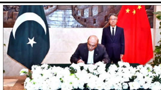
ISLAMABAD: President Asif Ali Zardari registering his condolence remarks in the visitor's book, at the Chinese Embassy.

Mesmerizing cultural dances of Punjab, Sindh, Khyber-Pakhtunkhwa, Gilgit-Baltistan and Balochistan were presented by Pakistani youth which earned deep praise from the audience.