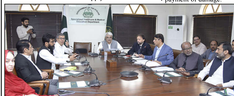
LAHORE: Provincial Minister for Health Khawaja Salman Rafique presides over the meeting regarding Health Insurance Program working group at Department of Specialized Healthcare & Medical Education.

A comprehensive briefing was given on the agenda by the representatives of the agencies and the departments concerned, in which the root causes of the problem and the gaps in the implementation of the policy were highlighted, while at the same time, the ways forward were also discussed. ANF presented a comprehensive plan for drug-free educational institutions which was discussed in the meeting. All the stakeholders agreed that concerted efforts should be made and a collective campaign should be launched to deal with the issue. The meeting also discussed several aspects including reduction in drug supply and demand.