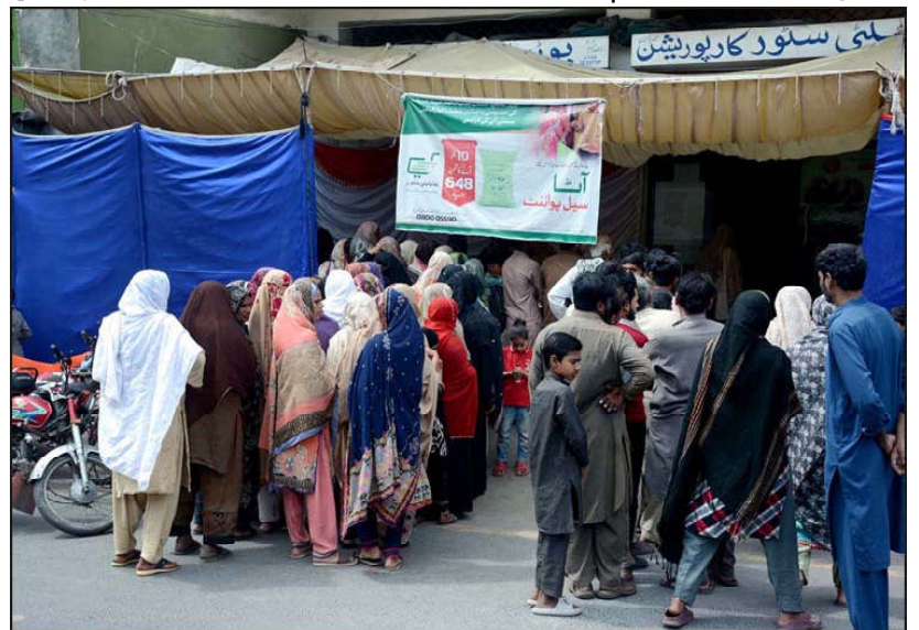
FAISALABAD: People standing in a queue waiting their turn outside Utility Store to buy flour at Government subsidized rates.