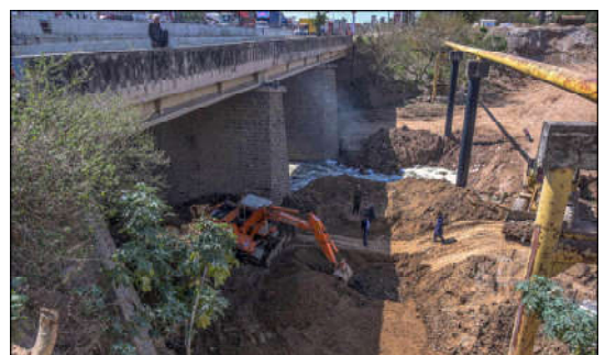
ISLAMABAD: Heavy machinery being used for construction under the bridge at IJP Road in the Federal Capital.

Adiala jail authorities filed their reply and technical report in the court in connection with contempt of court notice.