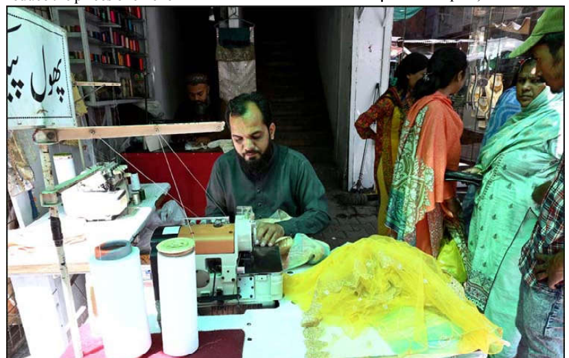
ISLAMABAD: Tailors busy stitching clothes for upcoming Eid ul Fitr festival at Aabpara.

Investment Facilitation Council (SIFC) which was poised to promote investment in the country. The PM also understands the importance of cordial relations between the center and provinces and with neighboring countries and he was aware of the impact of inflation and people's worries, he added. The business leader said that PM Shehbaz Sharif also knows that running the country was impossible without painful reforms and improving infrastructure. He said, "The PM is making serious efforts to bring investment into the country while increasing the tax base."