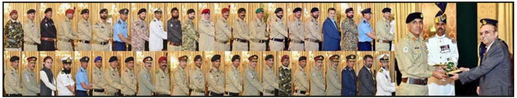
ISLAMABAD: President Asif Ali Zardari distributing commendation shields among military and civil officers who successfully organized Pakistan Day Parade, in a shield distribution ceremony held at Aiwan-i-Sadr.