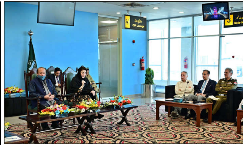
FAISALABAD: Chief Minister Punjab Maryam Nawaz and PMLN Supremo Nawaz Sharif are addressing a meeting of local parliamentarians and PMLN leaders at Faisalabad Airport.

participated through video link. Officials briefed the meeting that 6,132 person were arrested and 2109 cases were registered in the crackdown over profiteers in Ramzan, and the price magistrates checked nine hundred thousand places and imposed fines of Rs. 75 million over violations. The Chief Secretary said that the delivery of ration bags at doorsteps under the Ramzan package was a big challenge, adding that the role of administrative officers in the successful implementation of the program was commendable. He also praised the Punjab Information Technology Board for ensuring transparency in the Ramzan package through digital monitoring. The meeting decided that certificates of appreciation