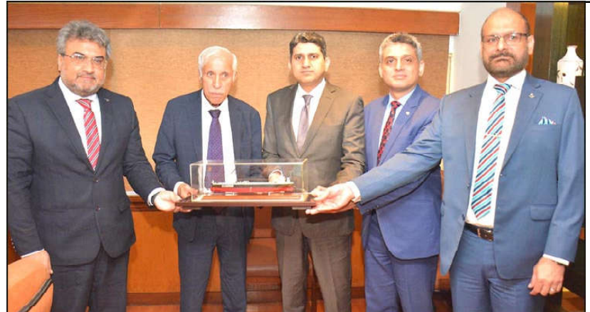
KARACHI: Federal Minister for Maritime Affairs Qaiser Ahmed Sheikh is presented with memento during his visit Pakistan National Shipping Corporation.