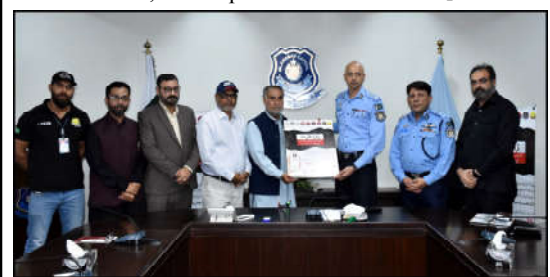
Representatives of social organization Roshni were present at the occasion.

While utilizing this new digital platform, resolving the issues of missing and abducted children is among the top priorities of Islamabad Capital Police. In this regard, Islamabad Capital Police will take effective measures to combat crimes against children and ensure that those involved are brought to justice.