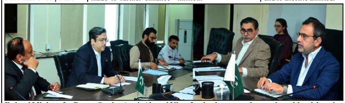
Federal Minister for Power, Sardar Awais Ahmad Khan Leghari, convened a meeting with a delegation from the National Energy Efficiency & Conservation Authority (NEECA) in Islamabad.

ISLAMABAD (APP): Pakistani Rupee on Monday gained 01 paisa against the US dollar in the interbank trading and closed at Rs278.12 against the previous day's closing of Rs278.13. However, according to the Forex Association of Pakistan (FAP), the buying and selling rates of the dollar in the open market stood at Rs278.25 and Rs281, respectively. The price of the Euro decreased by 19 paisa to close at Rs300.84 against the last-day closing of Rs301.03, according to the State Bank of Pakistan (SBP). The Japanese Yen remained unchanged and closed at Rs1.83, whereas a decrease of 06 paisa.