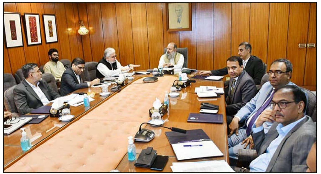
KARACHI: Federal Minister for Commerce Jam Kamal Khan Chairing a meeting at Trade Development Authority of Pakistan (TDAP).

Health activists have rallied behind the IMF's stance, emphasizing the need for restructuring tobacco taxation in Pakistan. At a recent event organized by the Society for the Protection of the Rights of the Child (SPARC), activists urged the Government of Pakistan to transition to a Single Tier Tobacco Taxation System, thereby eliminating the existing dual-tier system.