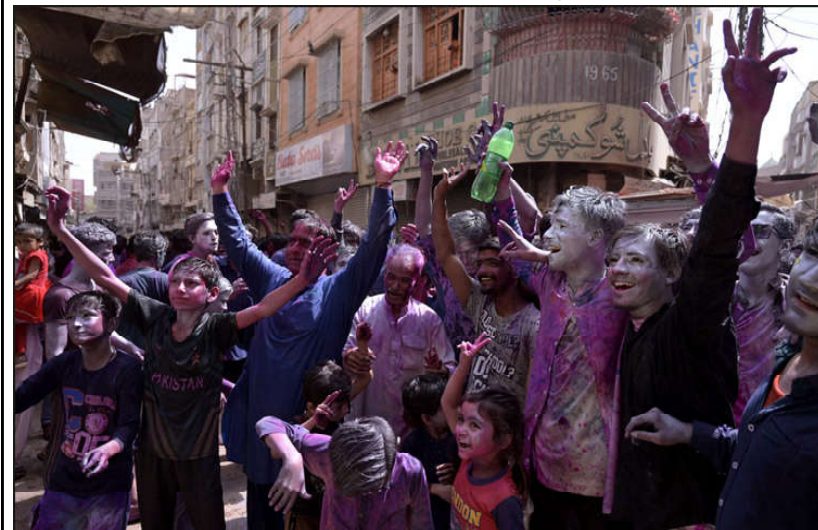
HYDERABAD: Holi celebrations in full swing as the Hindu community gathers at Sir-e-Ghat.

Independent Report RAWALPINDI (APP): Anti-Narcotics Force (ANF) in its ongoing operation against drug trafficking managed to recover over 44 kg drugs in 13 operations and arrested 13 suspects, said an ANF Headquarters spokesman here on Monday. He said that 1.8 kg Ice and 1 kg heroin were recovered from a passenger going to Dubai at Islamabad Airport. In another operation at Islamabad Airport, 1.8 kg heroin was recovered from a passenger going to Qatar. In third operation, 1 kg heroin was recovered from a parcel sent to UK at a courier office in Rawalpindi. In another operation at Islamabad Airport, 135 heroin-filled capsules were recovered from the possession of two passengers going to Sharjah.