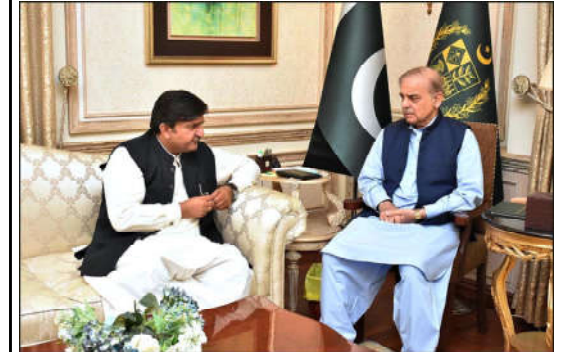
LAHORE: Speaker of the Punjab Assembly Malik Muhammad Ahmad Khan calls on Prime Minister Muhammad Shehbaz Sharif.

in providing treatment to patients visiting government hospitals was unacceptable. He urged hospital heads to actively contribute to the expedited completion of the revamping endeavors. Khawaja Salman Rafique reiterated the government's zero-tolerance policy towards negligence in patient care, inadequate sanitation facilities, medication shortages, and doctor absence. He pledged to personally oversee the implementation of the revamping plans across all government hospitals and directed the special secretary to ensure daily monitoring of the projects.