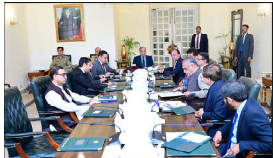
ISLAMABAD: Prime Minister Muhammad Shehbaz Sharif chairs a meeting regarding implementation of Track and Trace System.

He further directed that all those factories that resisted the implementation of track and trace system should be immediately sealed.