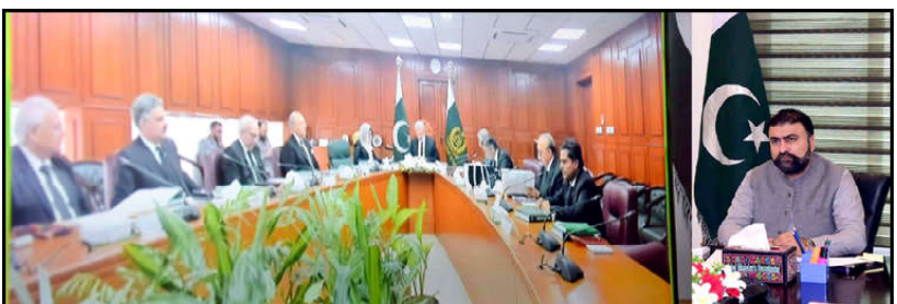
QUETTA: Chief Minister Balochistan Mir Sarfaraz Ahmed Bugti attending meeting of Judicial Commission through video link