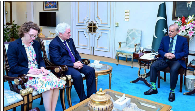
ISLAMABAD: Ambassador of Federal Republic of Germany to Pakistan, Alfred Grannas calls on Prime Minister Muhammad Shehbaz Sharif.

With the impending realization of the IT Park in Islamabad's G-10 sector, Pakistan stands on the cusp of a transformative era in its tech evolution, poised to harness the boundless potential of the digital age for the betterment of its people and economy.