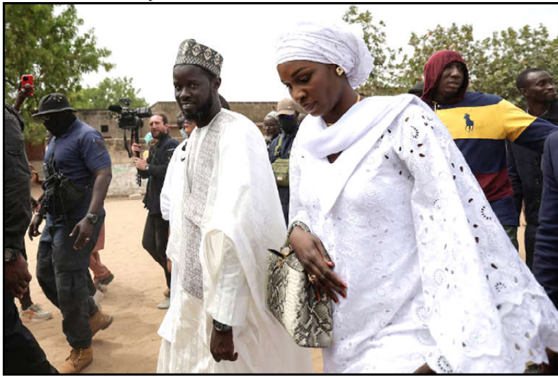
Presidential candidate Bassirou Diomaye Faye, who is backed by Senegalese opposition leader Ousmane Sonko, walks with one of his wives after casting his vote at the polling station at Ndiaganio in Mbour, Senegal.