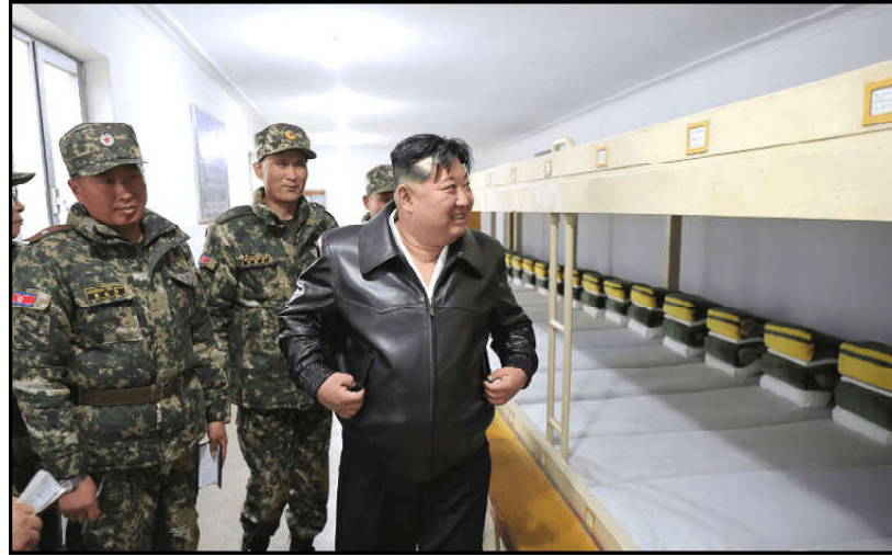
North Korean leader Kim Jong Un (C) inspecting the First Tank Armored Infantry Regiment, which is under the direct control of the Seoul Ryu Kyong Su Guards 105th Tank Division of the Korean People's Army (KPA) at an undisclosed location in North Korea.