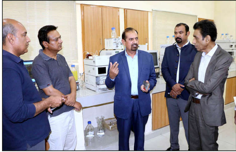
KARACHI: Federal Minister for Science and Technology Dr. Khalid Maqbool Siddiqui visits PCSIR Laboratories Complex.

while 3,000 motorbikes would be provided to male and female students in each district. She said that students would also be given laptops and iPads whereas a comprehensive system of solid waste collection was being implemented in 36 districts. The government has also set a target to introduce waste management system on PP mode in all districts of the Punjab including its rural areas within next 3 months, she added. She also condemned the killing of a youth with kite string and said that this incident was very painful which could not be ignored rather its responsible would be taken to task.