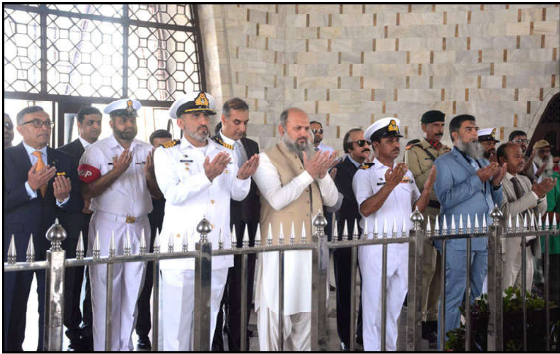
KARACHI: Federal Minister for Commerce Jam Kamal Khan offering Fataha at the Mausoleum of Father of the Nation Quaid-e-Azam Mohammed Ali Jinnah.