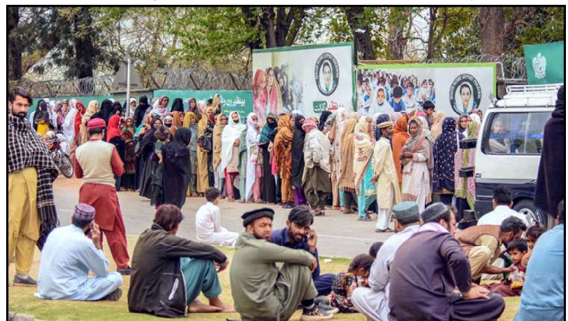
ISLAMABAD: Women queuing up outside Benazir income support centre to receive cash money at Sitara Market.