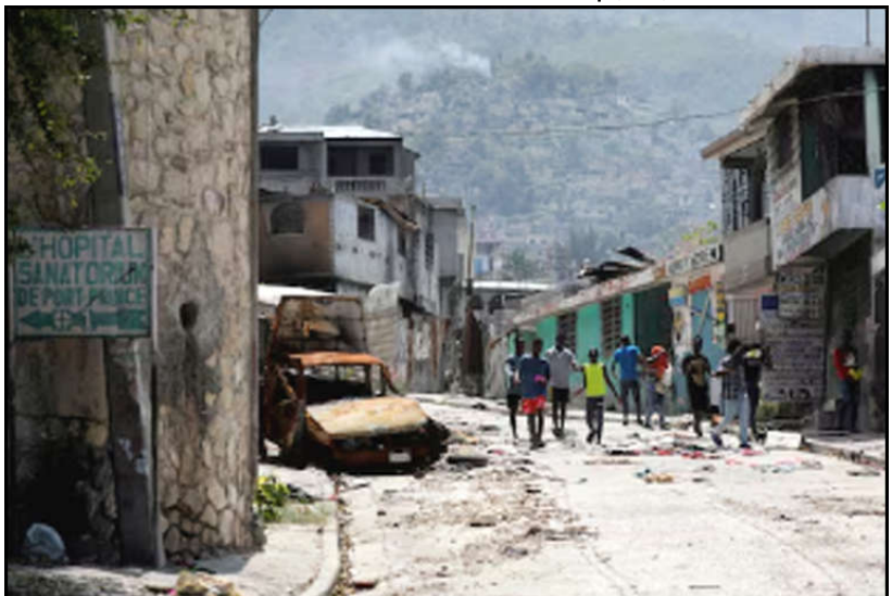
People walk past a damaged car in the Carrefour Feuilles neighborhood, which was deserted due to gang violence, in Port-au-Prince, Haiti

Attorney General Tarek William Saab has described the plots variously as aimed at attacking military installations, killing Maduro and other officials and de-stabilizing the country. He has publicly presented alleged confessions, planning documents, laptops and other items he has characterized as evidence.