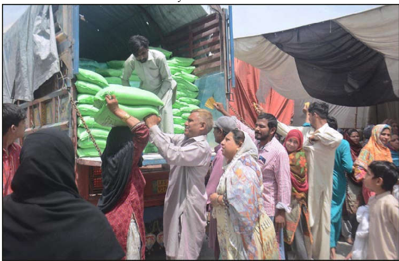
LAHORE: A large number of women standing in a long queue and waiting for their turn to purchase wheat flour on subsidized price provided by government in the city.

second review of International Monetary Fund (IMF) under the Standby Arrangement (SBA) and reiterated Pakistan's commitment to implement prudent fiscal policies and structural reforms in various sectors to enhance economic resilience and attract investments. Ambassador Alfred Grannas appreciated Pakistan's commitment to economic reforms and expressed Germany's continued support for Pakistan's development initiatives. Ambassador Grannas also highlighted the importance of mutual cooperation in various sectors and reiterated Germany's commitment to further strengthen the economic ties with Pakistan. They also reaffirmed their commitment to deepen bilateral cooperation and foster stronger economic ties between Pakistan and Germany.