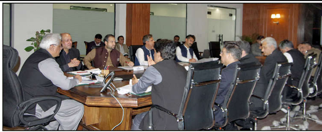
LAHORE: Provincial Minister for Health Khawaja Suleman Rafique presides over the meeting to review law and order situation at Home Ministry.