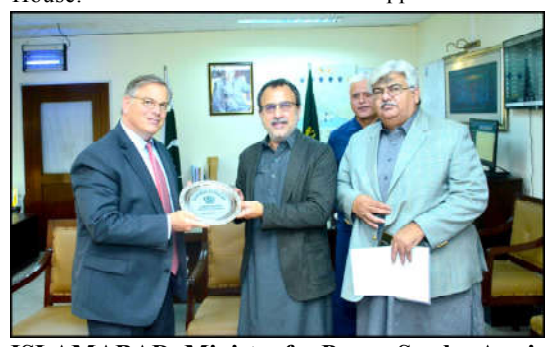
ISLAMABAD: Minister for Power Sardar Awas Ahmad Khan Leghari, presenting shield to the US Ambassador Donald Blome.

In a statement on Friday, he said that late Begum Nusrat Bhutto epitomized nobility and unwavering dedication to the cause of democracy. Her life stands as a testament to patience, perseverance, and boundless sacrifices for the betterment of the nation, said a press release issued by the Media Cell Bilawal House.