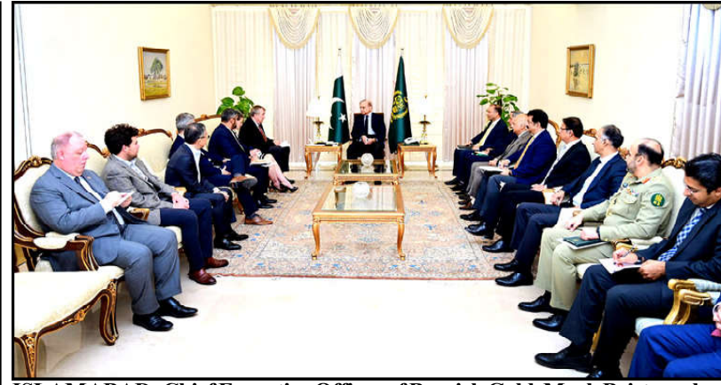
ISLAMABAD: Chief Executive Officer of Barrick Gold, Mark Bristow along with a delegation calls on Prime Minister Muhammad Shehbaz Sharif.