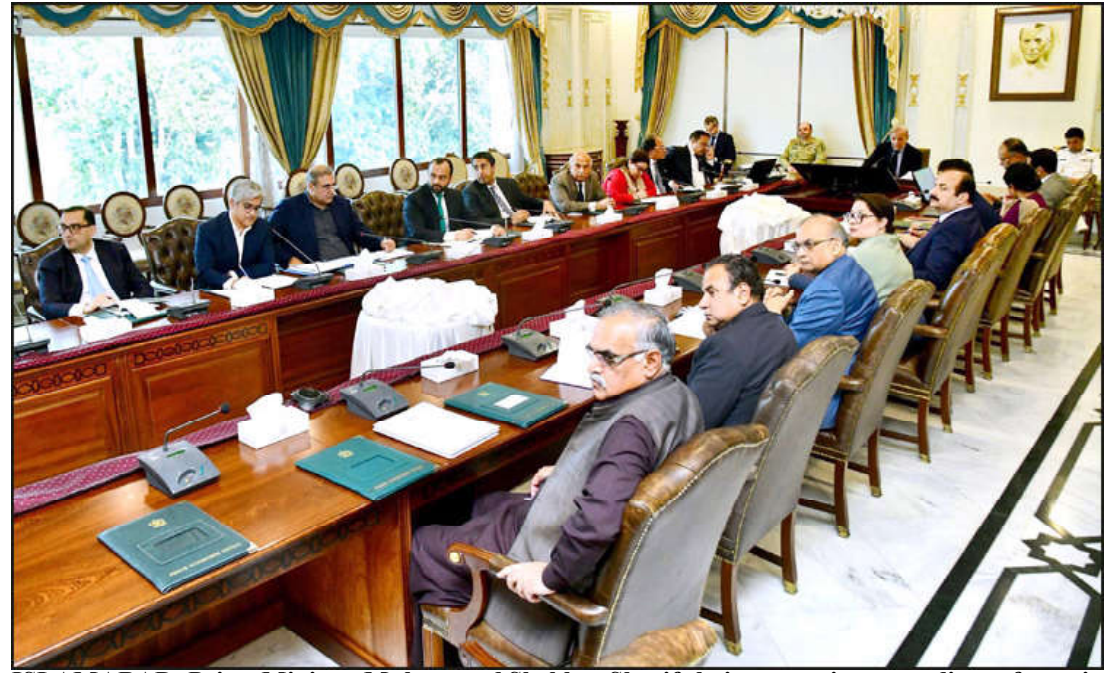
ISLAMABAD: Prime Minister Muhammad Shehbaz Sharif chairs a meeting regarding reforms in Pakistan's IT sector.

Fund (IMF) to help bolster the country's reserves right after the current bailout program ends in April. Bloomberg quoted IMF as having said earlier this week that Pakistan has expressed interest in a new medium-term program to improve its fiscal and external weaknesses and strengthen its economic recovery. According to report, Aurangzeb said Pakistan will seek a new loan program from the IMF of at least three years. Further details will be discussed after the Washington-based lender's annual spring meetings, he said.