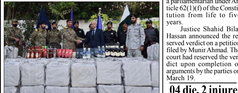
KARACHI: Pakistan Navy officials handing over seized liquor worth PKR 145.6 million to Pakistan Customs.

ISLAMABAD (INP): Recognizing the detrimental impact of proliferation in the number of institutions on the quality of education, the Vice Chancellors Committee has advocated for an immediate halt to the establishment of new universities. They also underscored the importance of consolidating existing institutions to enhance efficiency and optimize resource allocation. In a concerted effort to address the pressing challenges faced by the higher education sector, the Vice Chancellors' Committee was convened for a two-day meeting in Islamabad with the participation of more than 160 public and private universities from across the country. The gathering provided a platform for the university heads to engage in comprehensive discussions and formulate strategic initiatives to navigate the turbulent landscape of the country's tertiary education. The meeting was presided over by the Chairperson of VCs' Committee Dr. Iqar Ahmad Khan and was also attended by Chairman Higher Education Commission (HEC) Dr. Mukhtar Ahmad, Executive Director HEC Dr. Zia Ul-Qayyum and divisional heads of HEC.