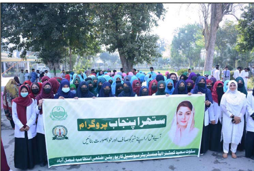
FAISALABAD: Students participating in a walk about 'Clean Punjab Campaign' at Zila Council organized by the District Administration.