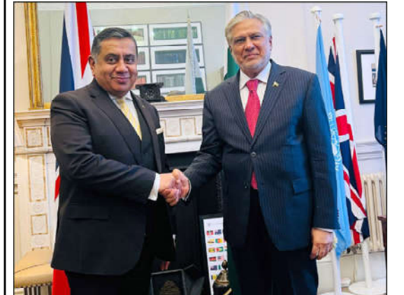
LONDON: Foreign Minister Mohammad Ishaq Dar shakes hand with UK Minister of State for South Asia and Commonwealth, Lord Tariq Ahmad.