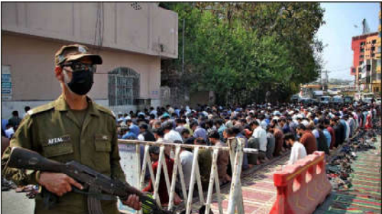
LAHORE: Police official stands high alert to avoid untoward incident during the congregational Friday prayers of the Holy Month of Ramadan-ul-Mubarak, at Shimla Hill in Lahore on Friday.