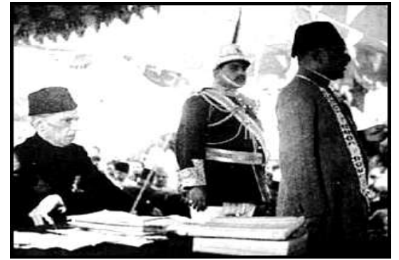
Muhammad Iqbal during historic Allahabad address in 1930.

Sir Syed's reforms had excelled Muslims in education, social, economic and political sciences, resultantly their voices have strongly been heard by the British rulers. The Muslims, under the flag of All India Muslim League (AIML) founded on December 30, 1906 at Dhaka, got united by giving new impetus to the independence movement. It witnessed further momentum after Quaid-i-Azam spearheaded independence movement after formally joining AIML in 1913 and outlining of an independent state for Muslims majority provinces in North West India by the great poet philosopher Dr. Allama