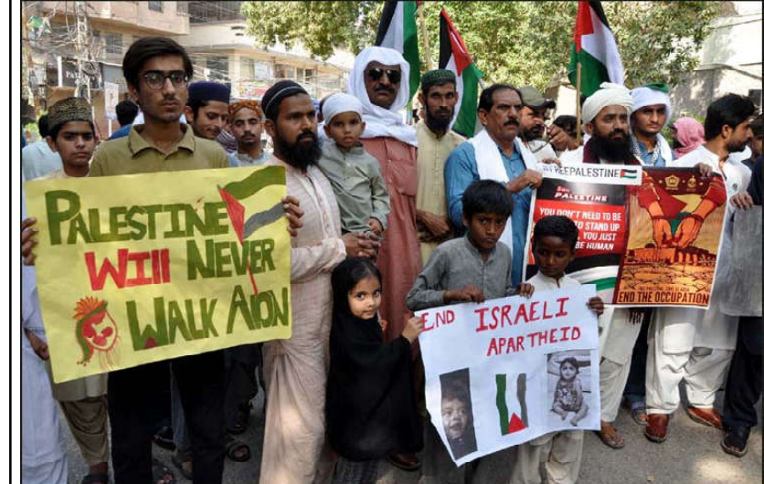
HYDERABAD: Residents of Kali Mori are holding protest demonstration against Israeli cruel and inhumane acts and express unity with the innocent people of Palestine, at Hyderabad press club.

restoration of sports and there is a dire need to take measures at a mega scale. The youths face a dearth of opportunities and are driven towards addiction. The sports infrastructure should be restored immediately for the youth and hockey competitions should be organized as it is our national sport." The proposal to constitute the Institute of Sports Sciences Punjab was reviewed during the meeting. The CM directed to include basketball in the talent hunt programme.