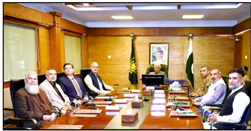
ISLAMABAD: Federal Minister for Defence Production, Khawaja Muhammad Asif chairs an introductory meeting on arrival in Ministry of Defence Production.

Foreign Minister Dar reiterated Pakistan's longstanding support for the One-China policy. He underscored that there was an absolute consensus in Pakistan on relations with China and Pakistan's strong commitment to the second phase of the China-Pakistan Economic Corridor (CPEC).