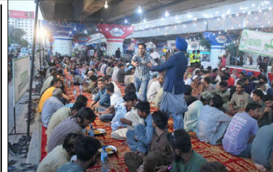
KARACHI: People break their fast during the Muslim's holy fasting month of Ramadan at a free meal distribution point run by a charity group, in Karachi, Pakistan.