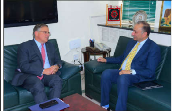
ISLAMABAD: Ambassador of the United States of America, Donald Blome calls on the newly appointed Federal Minister for Petroleum Dr Musadik Malik.

experts would be hired for advancement of the IT sector, he remarked. The meeting was informed that a strategy was being prepared for reforms in the information technology sector and digitisation. The strategy included increasing access of people to the internet, improvement of digital infrastructure, e-governance, training of youth in digital skills and increase of business opportunities in the IT sector.