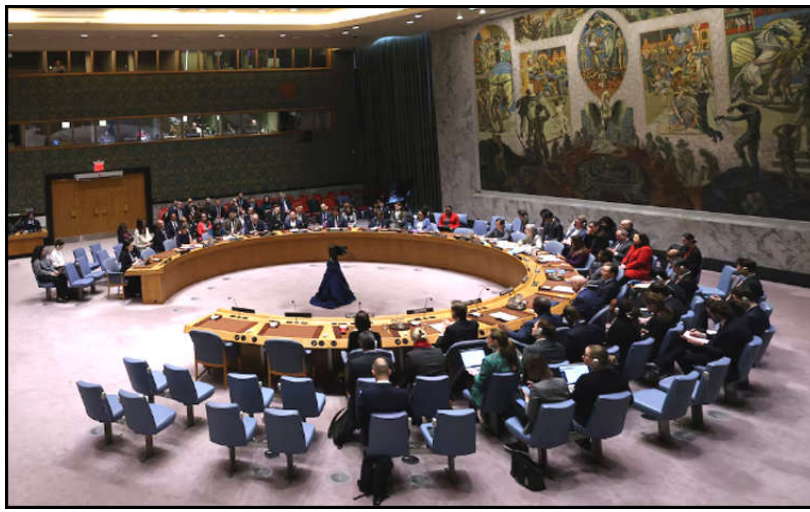
The United Nations Security Council meets to consider a United States-sponsored resolution calling for a ceasefire during the conflict between Israel and the Palestinian Islamist group Hamas, at U.N. headquarters in New York City, U.S.

The vote took place as Blinken, America's top diplomat, is on his sixth urgent mission to the Middle East since the Israel-Hamas war, discussing a deal for a cease-fire and hostage release.