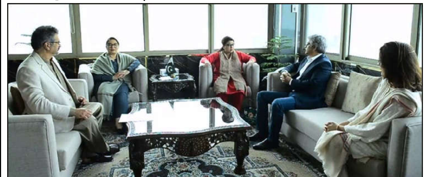
ISLAMABAD: Minister of State for IT and Telecommunication Shaza Fatima Khawaja in a meeting with Jazz delegation.

Dr Musadik, US Ambassador discuss investment opportunities