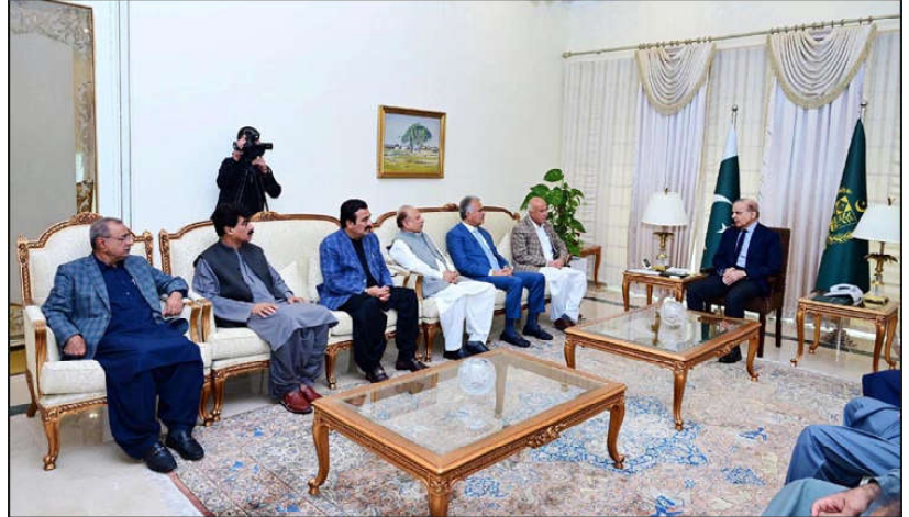
ISLAMABAD: A delegation of the National Party calls on Prime Minister Muhammad Shehbaz Sharif.