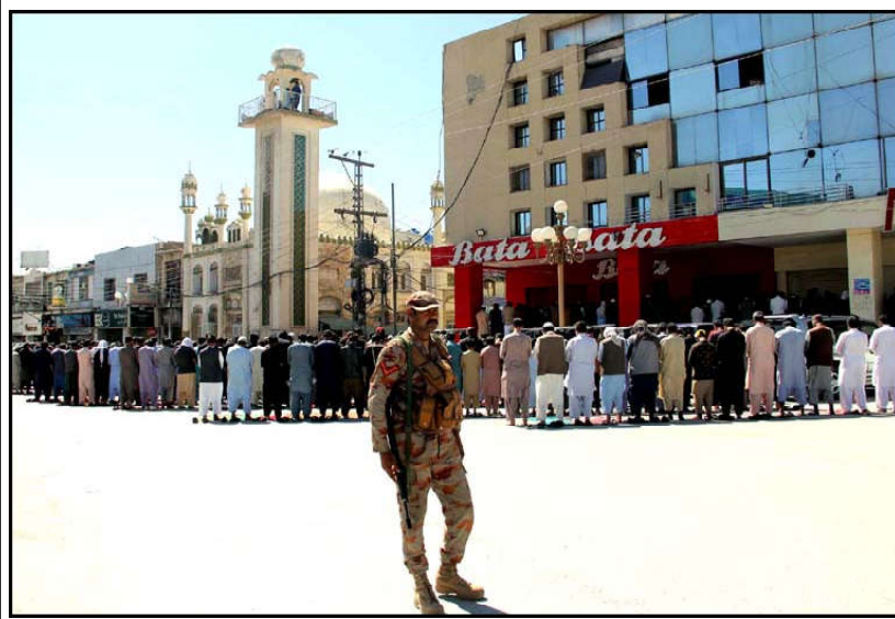
QUETTA: Security official stands high alert to avoid untoward incident during the congregational Friday prayers during the Holy Month of Ramadan-ul-Mubarak, in Quetta.

Speaking at the occasion, Ahsan Iqbal highlighted that in 2022, Pakistan faced unprecedented devastation due to torrential rains and flooding in most parts of the country, affecting 33 million people and causing economic losses worth $30 billion.