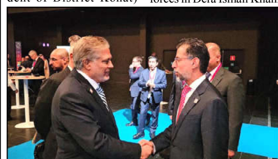
ISLAMABAD: Foreign Minister Mohammad Ishaq Dar meets with the UAE Minister of Energy and Infrastructure, Almazrouel Suhail on the margins of the Nuclear Energy Summit in Brussels.

Meanwhile Federal Minister for Information and Broadcasting Attaullah Tarar on Friday strongly condemned the suicide attack on the convoy of security forces in Dera Ismail Khan.