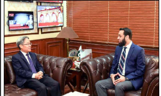
ISLAMABAD: Federal Minister for Information and Broadcasting, Attaullah Tarar exchanging views with Jiang Zaidong, Ambassador of the Peoples Republic of China during meeting held in Islamabad.