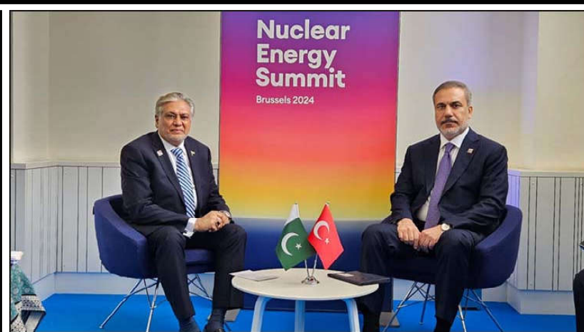
BRUSSELS: Foreign Minister Ishaq Dar meeting with Minister of Foreign Affairs of Türkiye Hakan Fidan on the sidelines of Nuclear Energy Summit 2024 in Brussels.

The Turkish Foreign Minister conveyed felicitations on behalf of the President of Turkiye to Prime Minister Shehbaz Sharif on successful elections. He highlighted that the two countries have immense potential given their strategic and geographic locations and underlined the importance of synchronizing their actions and policies for cooperation at global and regional level. The two Foreign Ministers noted with satisfaction the upwards trajectory of bilateral relations between Pakistan and Turkiye.