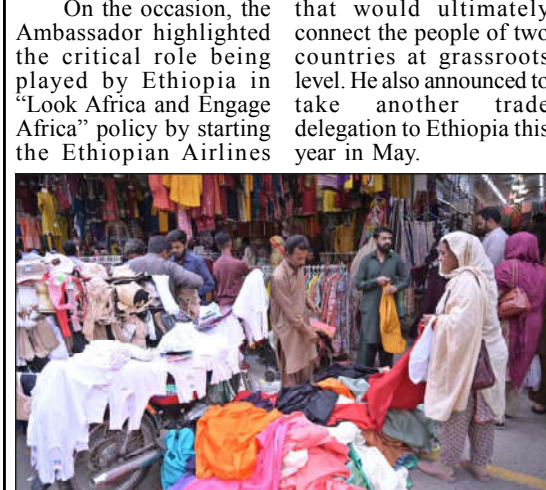
SARGODHA: Women buying clothes from the stalls in Urdu Bazaar.