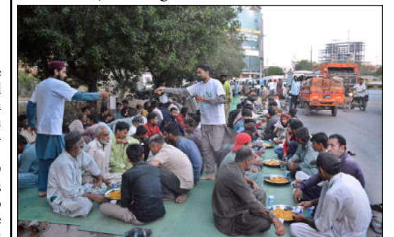
KARACHI: People break their fast during Iftar arranged by NGO during holy month of Ramazan at Press Club Chowrangi.

Ombudsman's commitment to expeditiously resolve such matters. The proactive intervention led to the disbursement of marriage grants, death grants, and farewell grants to 36 applicants, bringing long-awaited financial support to these individuals. This concerted effort involved various provincial departments, demonstrating a comprehensive approach to addressing the welfare needs of citizens.