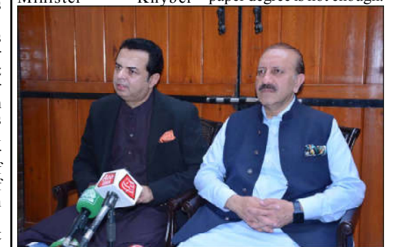
FAISALABAD: Former State Minister and central leader of Pakistan Muslim League-Nawaz (PMLN) Muhammad Talal Chaudhry addressing a press conference.

Speaking in the occasion, the Special Assistant instructed that in order to equip the youth in the province with employment and to take advantage of the abundant opportunities available for manpower in technical and professional fields in the country and abroad, he said equipping youth with market-oriented skills is essential. He said that for this purpose, acquiring a paper degree is not enough.