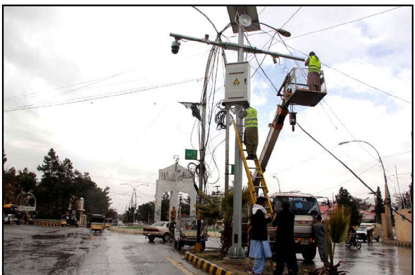
QUETTA: Technicians are busy in repairing of CCTV cameras to surveillance security check as the security measures high alert to avoid untoward incident, in Quetta.

tough decisions in the larger interest of the country by setting correct economic priorities. The former caretaker prime minister congratulated Prime Minister Shehbaz Sharif, Cabinet and Chief Ministers on assuming their responsibilities and wished good luck for dealing with economic challenges and transforming Pakistan as one of the top economies of the world. The Chief of Army Staff reassured the fullest support of Pakistan Armed Forces to speed up the economic initiatives of the present government besides ensuring the provision of safe, secure and conducive environment to nurture country's true economic potential. Prime Minister Shehbaz Sharif said that SIFC is the way forward under the challenging times and an iron resolve is needed to serve the country like never before. He urged the Federal Cabinet to join hands, keep political differences aside, and work as a cohesive team to keep the momentum of economic stability. He also thanked the caretaker government for continuation of larger national economic agenda in a befitting manner.