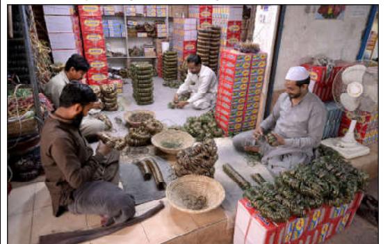
HYDERABAD: Workers sorting and packing bangles at their workplace in Bangles Market.

ISLAMABAD (APP): Despite a challenging macroeconomic environment, Jazz, Pakistan's leading digital operator, invested Rs. 37 billion in 2023, aimed at supporting Pakistan's growing data demand and strengthening the digital ecosystem in key areas including fintech, cloud services, and data analytics, bringing its overall investment in Pakistan to $10.6 billion. The digital operator witnessed a remarkable 20 percent year-on-year (YoY) growth in revenues in the local currency; however, Jazz's revenue declined by 12.9 percent in USD terms during the financial year 2023 primarily due to the devaluation of the Pakistani Rupee (PKR). Additionally, margins felt the impact of an unprecedented surge in business costs, amid record high interest rates and a substantial rise in network energy costs. The majority of its capital expenditure during the year was directed towards adding nearly 1,000 new 4G sites, showcasing the company's commitment to ensuring a consistent improvement in service quality for its customers. This network expansion played a pivotal role in increasing Jazz's 4G customer base to 43.9 million, while its overall subscriber base reached 70.6 million, as of Dec 2023. Moreover, with over 22 million Voice over LTE (VoLTE) daily active customers, Jazz has emerged as the largest VoLTE network in the region.