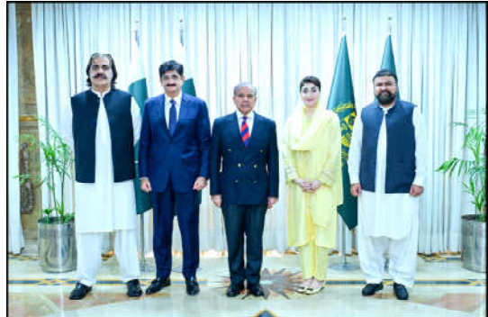
ISLAMABAD: Prime Minister Muhammad Shehbaz Sharif in a group photo with Chief Ministers of all the provinces.

"We cannot continue like this," he said, adding that Islamabad will be forced to retaliate if the TTP continues its attacks.