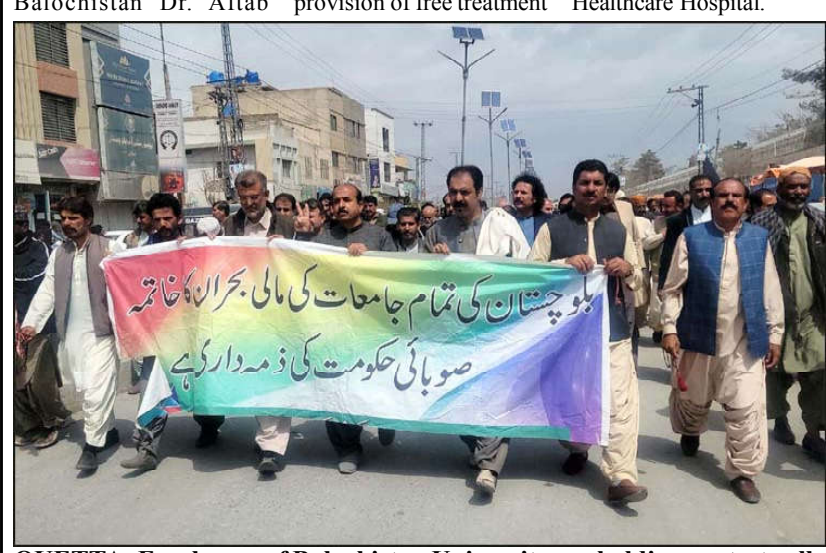
QUETTA: Employees of Balochistan University are holding protest rally against non-payment of their salaries, at Sariyab road in Quetta.