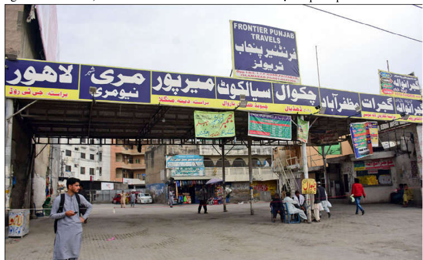
ISLAMABAD: Faizabad bus stands are deserted owing to Pakistan Day parade rehearsal, passengers suffering in the Federal Capital.

The police officials were further directed to ensure the data entry of all citizens entering the high security zone.