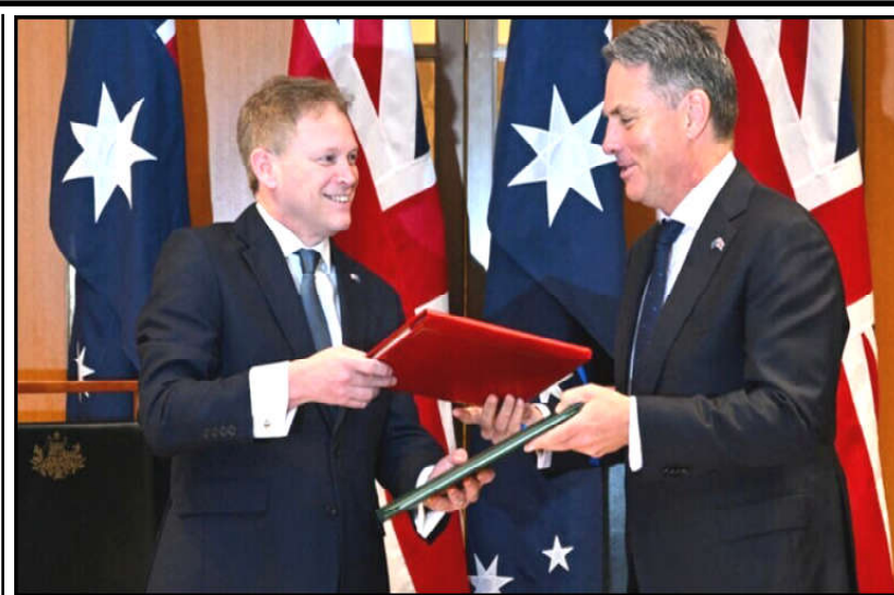
Secretary of State for Defence of the United Kingdom Grant Shapps and Australian Defence Minister Richard Marles exchange Defence Treaty documents during a meeting at Parliament House in Canberra.

From Saturday, English language requirements for student and graduate visas will be increased, while the government will get the power to suspend education providers from recruiting international students if they repeatedly break rules.