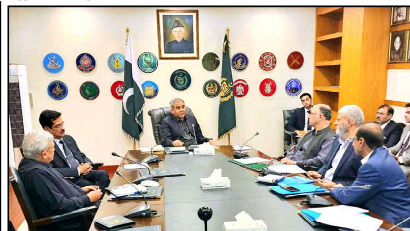
ISLAMABAD: Federal Minister for Interior Mohsin Naqvi chairing a meeting on matters related to Federal Investigation Agency.

Weapon and ammunition were also recovered from the killed terrorist, who remained actively involved in numerous terrorist activities.