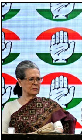
India's Congress party president Mallikarjun Kharge with party leaders Sonia Gandhi and Rahul Gandhi address a press conference at the Congress party headquarters in New Delhi, India.

General elections are scheduled to be held in seven phases starting next month, with most opinion polls predicting an easy win for Modi and his Bharatiya Janata Party (BJP). The Congress, which leads a rag-tag bunch of bickering opposition parties in alliance for the general elections, is seen as Modi's main challenger.