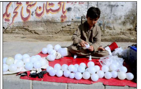
QUETTA: A teenager boy repairing LED bulbs at Joint Road to earn for livelihood.

ISLAMABAD (APP): Pakistani Rupee on Thursday gained 01 paise against the US dollar in the interbank trading and closed at Rs278.39 against the previous day's closing of Rs278.40. However, according to the Forex Association of Pakistan (FAP), the buying and selling rates of the dollar in the open market stood at Rs278.3 and Rs281.05, respectively. The price of the Euro increased by Rs1.83 to close.