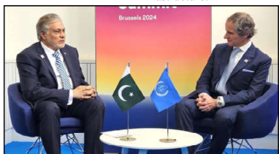
BRUSSELS: Foreign Minister Mohammad Ishaq Dar meeting with Director General, International Atomic Energy Agency (IAEA), Rafael Mariano Grossi, on the sidelines of the Nuclear Energy Summit in Brussels.

He revealed that nuclear energy constitutes around eight percent of our installed electric generation capacity as currently Pakistan has six operating nuclear power plants generating 3,530 MW of electricity. The Foreign Minister reaffirmed that Pakistan stands ready to share its experience and expertise in peaceful uses of nuclear technology with the world as country has fully trained human resource capable to support nuclear power infrastructure.