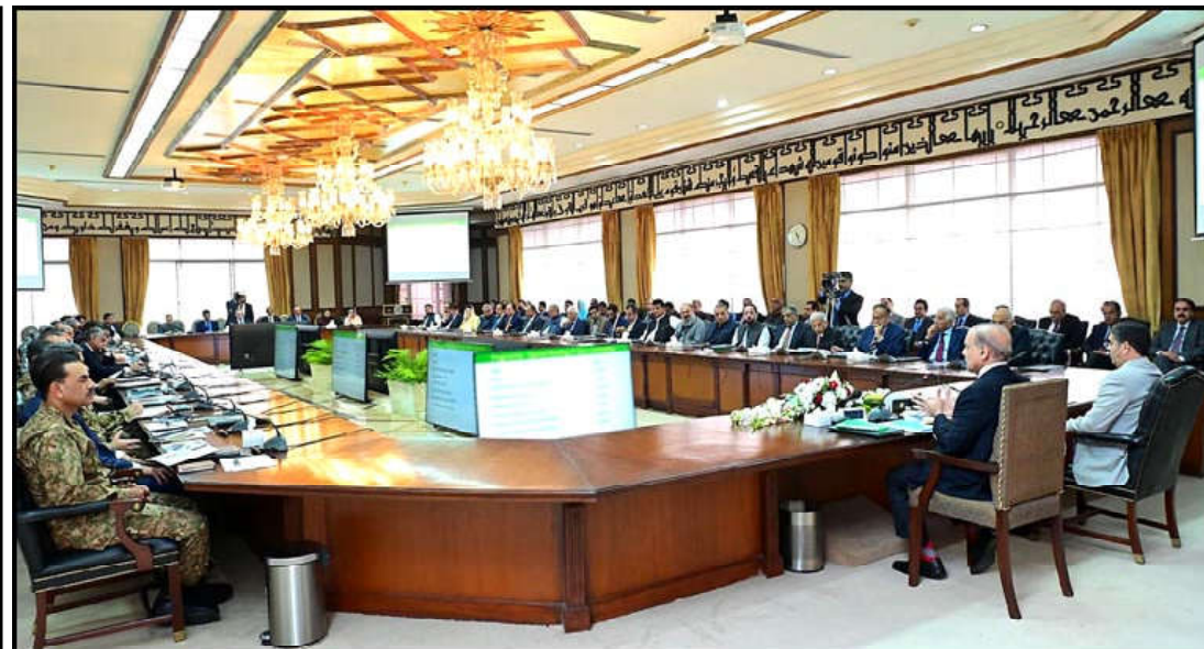
ISLAMABAD: Prime Minister Muhammad Shehbaz Sharif chairs special session of the Apex Committee of Special Investment Facilitation Council.

The politico demands a "clarification statement" from former Pakistani ambassador to the US Muhammad Asad Majeed after Lu's testimony in which the latter, once again, rejected former prime minister Khan's allegations that the United States engineered his ouster from power by supporting the then opposition's no-confidence motion in April 2022.