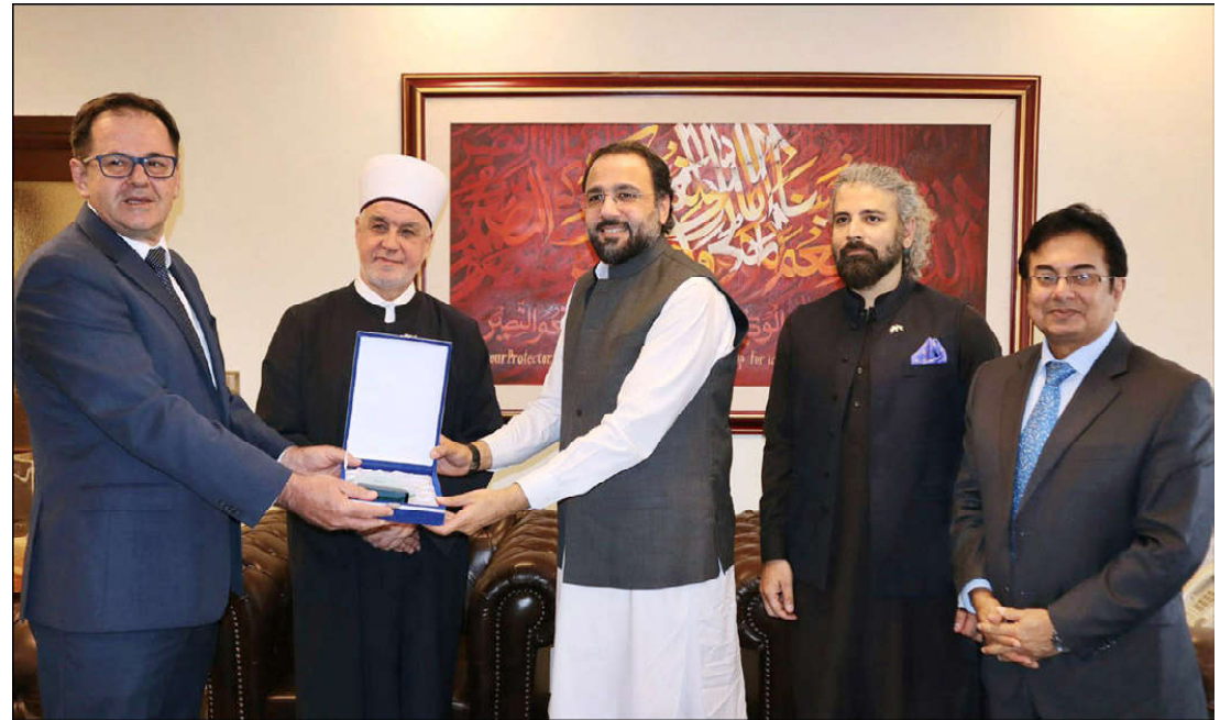
ISLAMABAD: Federal Minister for Overseas Pakistanis and Human Resource Development, Chaudhry Salik Hussain receiving souvenir from the Grand Mufti of the Islamic Community of Bosnia and Herzegovina, Dr. Husein of Kavazovic.

"Given the important role that forests play in the environment, let us resolve to protect and conserve them."