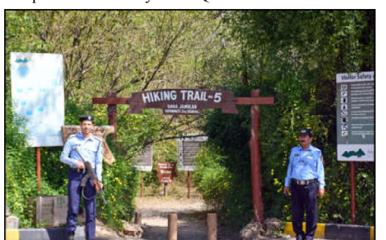
ISLAMABAD: Islamabad Police Personnel stand alert on the entrance of Hiking Trail 5 as the Trails 2, 3, 4, 5, 6 and 7 have been closed for the public from 19th March to 23rd March from 5AM to 5PM due to Parade preparations.