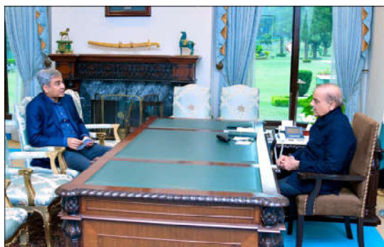
ISLAMABAD: Federal Minister for Interior, Narcotics Control and Chairperson Pakistan Cricket Board Syed Mohsin Raza Naqvi calls on Prime Minister Muhammad Shehbaz Sharif.

forms a source of peace and stability in the region and beyond. The China-Pakistan Economic Corridor (CPEC), a crown jewel of the Belt and Road Initiative (BRI), stands as a shining testament of win-win cooperation," he said.