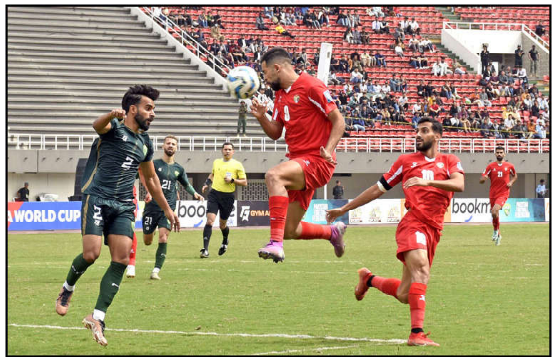
ISLAMABAD: Pakistan and Jordan's football team players are in action during FIFA World Cup qualifier Kickoff round match at the Jinnah Stadium, in the Federal Capital.

ISLAMABAD (APP): Minister for Commerce Jam Kamal Khan, and British High Commissioner to Pakistan, Ms. Jane Marriott, on Thursday outlined key strategies to bolster the already robust trade relations between Pakistan and the United Kingdom (UK). The minister emphasized the deep-rooted political and historical ties between the two nations, underscoring the significant strides in trade and commerce, said a news release here. The minister lauded the Developing Countries Trading Scheme (DCTS), initiated in June 2023, as a pivotal opportunity for Pakistan to amplify its trade volumes with the UK.