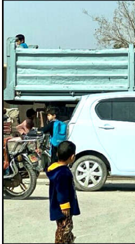
An Afghan security personnel checks a vehicle near the site of a suicide bomb attack in Kandahar.