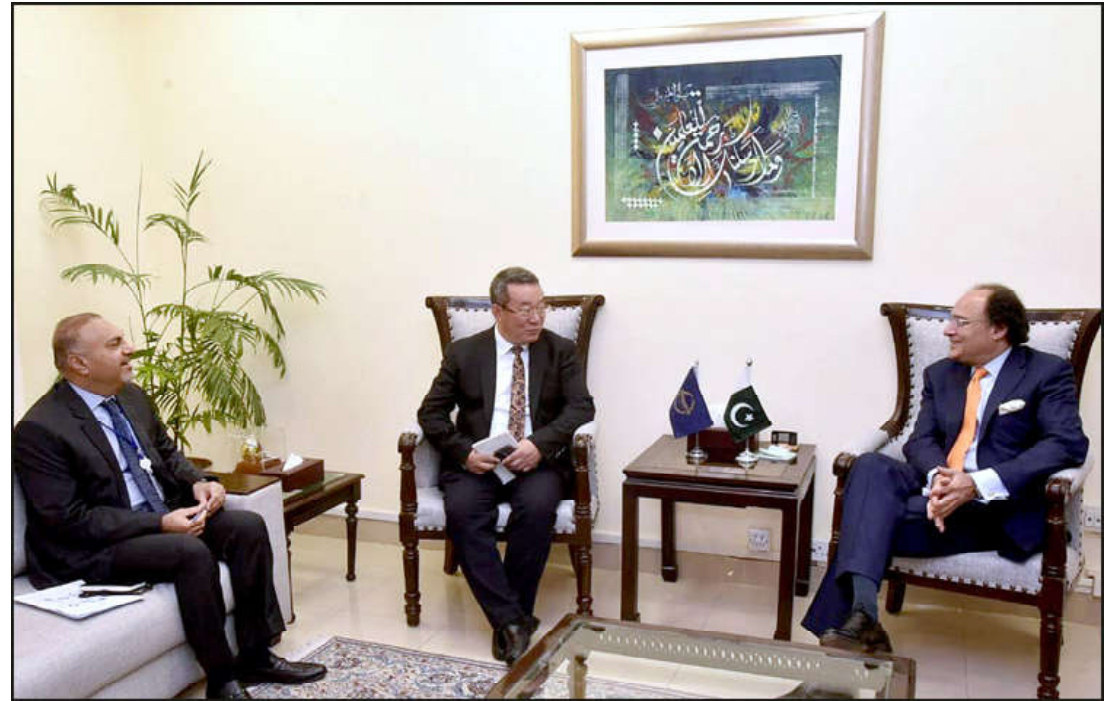
ISLAMABAD: Federal Minister for Finance and Revenue, Muhammad Aurangzeb calls on by Country Director of the Asian Development Bank (ADB), Young Ye.

ADB's pivotal role in promoting climate-conscious programs across Asia and the Pacific, the Minister emphasized the alignment of ADB's climate operations with Pakistan's own climate goals and commitments. The minister outlined government's priority areas for achieving macro-economic stability and sustainability, including measures to enhance revenue, SOEs reforms, privatization, and public-private partnerships.