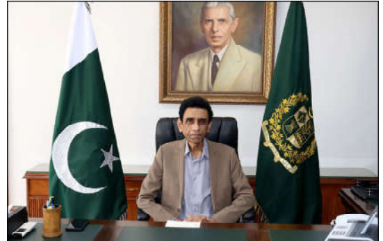
ISLAMABAD: Federal Minister for Education and Professional Training Dr. Khalid Maqbool Siddique officially assumed charge.