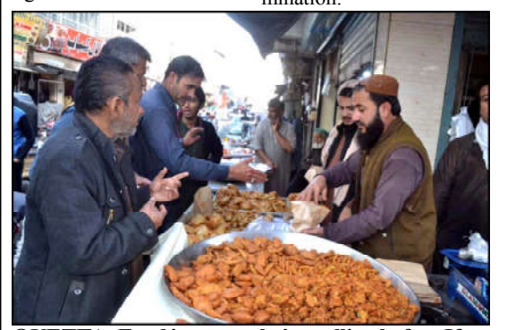
QUETTA: Food items are being selling before Ifar times (breaking fast meal), as demand of food items increased in city during the Holy Month of Ramadan-ul-Mubarak, at Prince road in Quetta.

"Progress made in diverse fields and ways and means to further enhance the bilateral ties were also discussed," it added. Separately, the US envoy also met President Asif Ali Zardari and underlined the need to enhance trade and investment relations with the USA, besides exploring collaborative opportunities in diverse sectors.