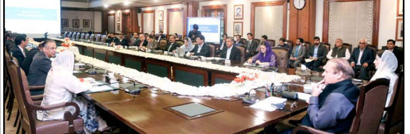
LAHORE: Punjab Chief Minister Maryam Nawaz Sharif and Quaid Muslim League-Nawaz Muhammad Nawaz Sharif chairing a meeting about transport

pected by Pakistan to the people of Afghanistan over the last several decades." She said, "We urge these elements in power to rethink the policy of siding with Khwarij terrorists shedding the blood of innocent Pakistanis and to make a clear choice to stand with the people of Pakistan." "Terrorist groups like TTP are a collective threat to regional peace and security. We fully realize the challenge Afghan authorities face in combating the threat posed by TTP. Pakistan would therefore continue to work towards finding joint solutions in countering terrorism and to prevent any terrorist organization from sabotaging bilateral relations with Afghanistan," she added.