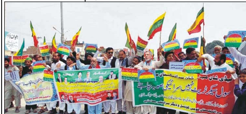
MULTAN: Members of Pakistan Saraiki Party are holding protest demonstration for acceptance of their demands, held in Multan.

upper house, six candidates file papers for women's two reserved seats, while five candidates have been fielded for technocrats two seats and three candidates filed papers for the minorities reserved seat. According to the election schedule appeals can be filed upto March 21 against approval or rejection of nomination papers. The election tribunals will decide appeals by March 25. A revised list of candidates will be released on March 26. Candidates can withdraw their nomination papers till March 27. The Senate election will be held in national and provincial assemblies will be held on April 02.