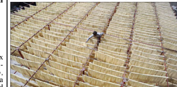
HYDERABAD: A worker is preparing vermicelli at a workshop, during the holy fasting month of Ramadan, which is a very popular food in the month of Ramadan.

During the period under review, the exports of fruits and vegetables grew by 13.89 per cent and 39.27 per cent respectively as 688,950 metric tons of fruits valued at $246.463 million and 724,252 metric tons of vegetables worth $277.064 million were exported. The other commodities that witnessed positive growth in their respective exports included pulses 268.68 per cent as pulses valued at $173,000, tobacco 32.09 per cent worth of $60.581 million and the exports of spices grew by 21.10 per cent and recorded at $78.107 million.