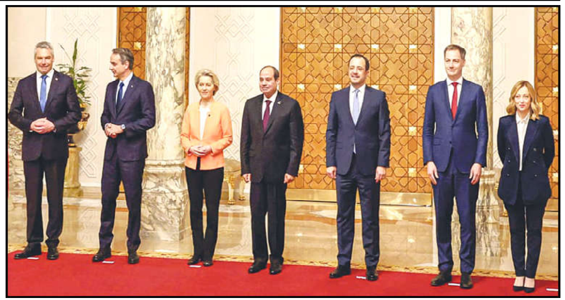
CAIRO: Austria's Chancellor Karl Nehammer, Greece's Prime Minister Kyriakos Mitsotakis, European Commission President Ursula von der Leyen, Egypt's President Abdel Fattah al-Sisi, Cyprus's President Nikos Christodoulidis, Belgium's Prime Minister Alexander De Croo, and Italy's Prime Minister Giorgia Meloni posing for a photograph during their summit.

consolidated — no matter who wants to intimidate us, suppress us — nobody has ever succeeded in history, they have not succeeded now, and they will not succeed ever in the future," said Putin. Supporters chanted "Putin, Putin, Putin" when he appeared on stage and "Russia, Russia, Russia" after he had delivered his acceptance speech. Inspired by opposition leader Alexei Navalny, who died in an Arctic prison last month, thousands of opponents protested at polling stations inside Russia and abroad.