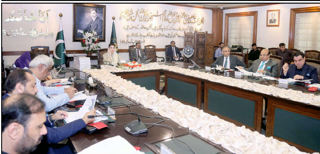
LAHORE: Punjab Chief Minister Maryam Nawaz Sharif presides over the 2 nd meeting of Provincial Cabinet.