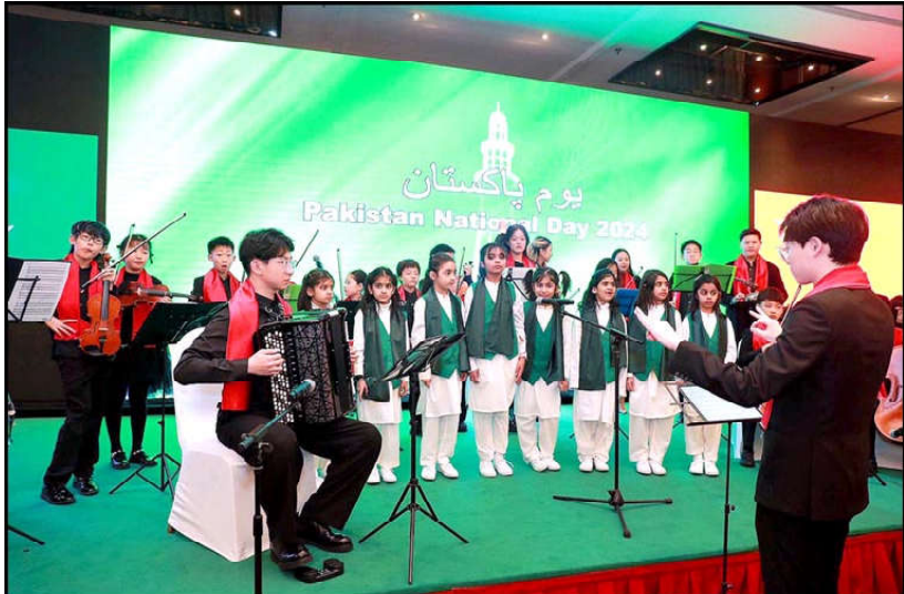
BEIJING: A troupe of Chinese and Pakistani children jointly perform at Pakistan National Day reception organised by Pakistan Embassy, symbolizing the enduring bonds of friendship between the two countries.

nated corneas; as a result, corneas must be imported from the USA and Sri Lanka. A cornea is one of the simplest tissues to transplant because the donor and recipient do not need to match. He said it is a bloodless tissue that absorbs oxygen straight from the atmosphere. He went on to say that corneas from the elderly can be removed and transplanted into the eyes of much younger people. According to Maj. Gen (Ret) Rehmat Khan, the Al-Shifa Trust has begun corneal transplants at its Sukkar hospital in addition to its Rawalpindi facility. In Sukkar Hospital, 50 corneal transplants have been completed successfully to date at no cost. Eighty percent of all surgeries performed at the Al-Shifa eye hospitals in Rawalpindi, Sukkur, Kohat, Muzaffarabad, and Chakwal are free of charge. So far, the trust has performed over one million different eye surgeries.