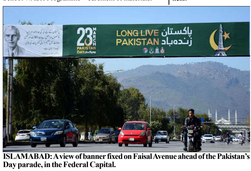
ISLAMABAD: A view of banner fixed on Faisal Avenue ahead of the Pakistan Day parade, in the Federal Capital.

ISLAMABAD (Online): The 11th death anniversary of 1965 War Hero Muhammad Mahmood Alam, popularly known as M M Alam was observed on Monday. Pakistan Air Force legendary war hero M M Alam, nicknamed while piloting an F-86 Sabre, shot down five Indian war planes in less than a minute during 1965 Pak-India war and altogether, downed nine war planes in the aerial fight. MM Alam was the first ever fighter pilot for PAF, listed on top in the hall of famers' list at the PAF Museum in Karachi. Alam is considered as a national hero for Pakistan, most significantly, for his remarkable show of brilliance in the war of 1965. He was awarded the 'Sitara-e-Jurat' and also the BAR medal. He died in Karachi on this day in 2013 at the age of 77 after a protracted illness.