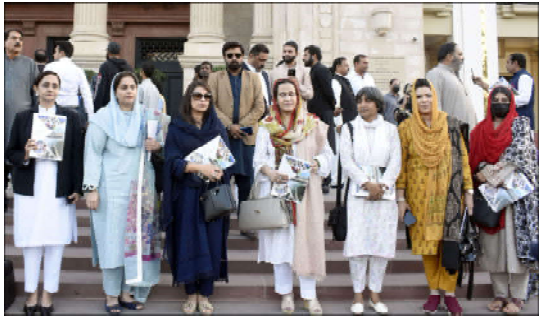
LAHORE: Members of Punjab Assembly leaving Punjab Assembly after attending Budget session, in the Provincial Capital.