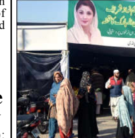
RAWALPINDI: People arrive Ramadan Bazaar to purchase Fruits and Vegetables on subsidized rates near Shamsabad.

Food Minister Punjab expressed concern over the recent rise in prices of chicken meat. He urged the representatives of the Poultry Association to bring down the prices substantially to ensure relief for the people during the holy month.