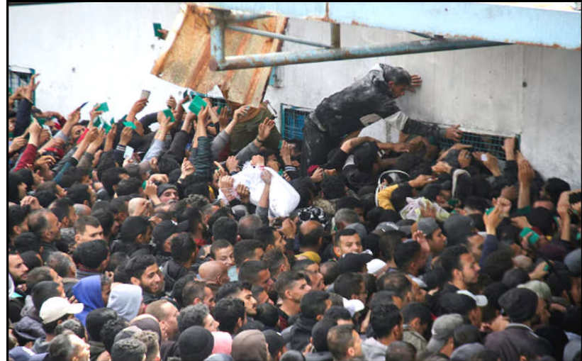
Palestinians gather to receive aid outside an UNRWA warehouse as Gaza residents face crisis levels of hunger, in Gaza City.