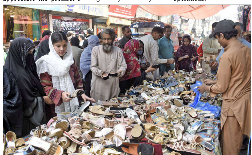
LAHORE: Women look at shoes at Anarkali Bazaar during shopping ahead of the upcoming festival of Eid al-Fitr in the Provincial Capital.