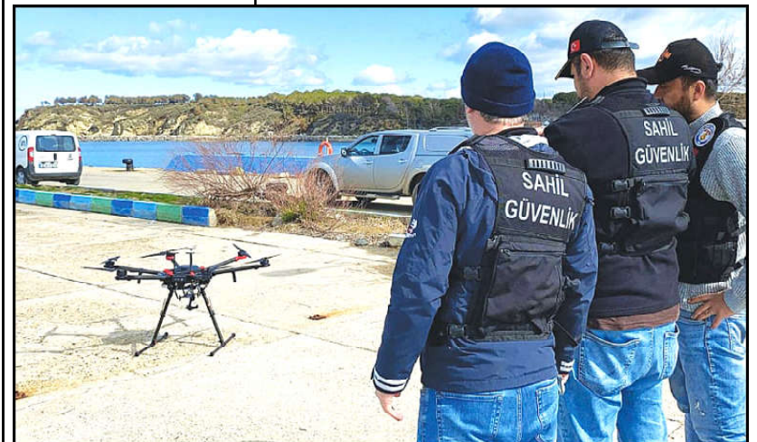
Turkiye's coast guard personnel operate a drone for victim search, after the boat accident in the Aegean Sea.

the third Summit for Democracy on Monday, an initiative of US President Joe Biden, which Seoul is hosting this week. The summit, which runs from March 18-20 will bring together government officials, NGOs and civil society members. Seoul is one of Washington's key regional allies.