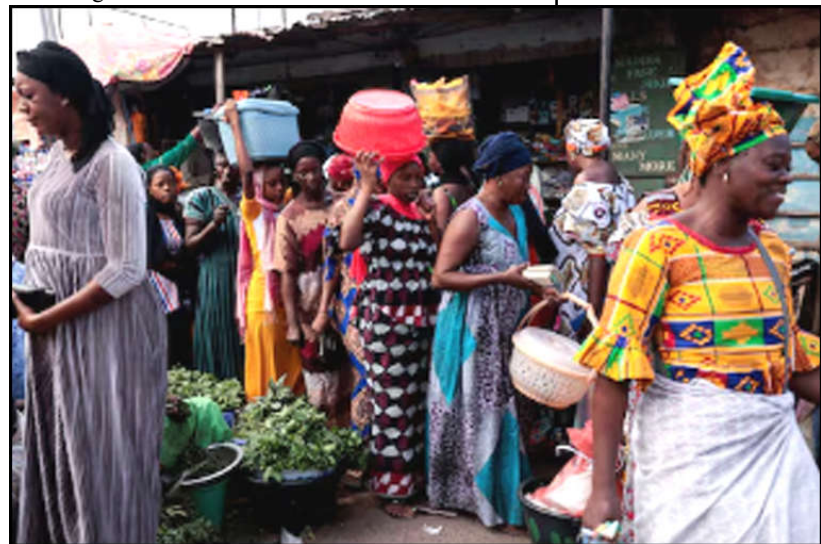
Women shop at a street market ahead of the presidential election in Banjul, Gambia.

An attack on another refinery, Novokuibyshevsky, on Saturday was thwarted, the local governor said. Both plants are owned by Rosneft and located in the Samara region southeast of Moscow, some 800 km (500 miles) from the nearest Ukrainian-controlled territory. A Ukrainian source told Reuters that Kyiv's SBU intelligence agency had struck three Samara region Rosneft refineries: Syzran, Novokuibyshevsky, and Kuibyshevsky. Russian media have not reported a strike on the Kuibyshevsky refinery, which is located in the city of Samara.