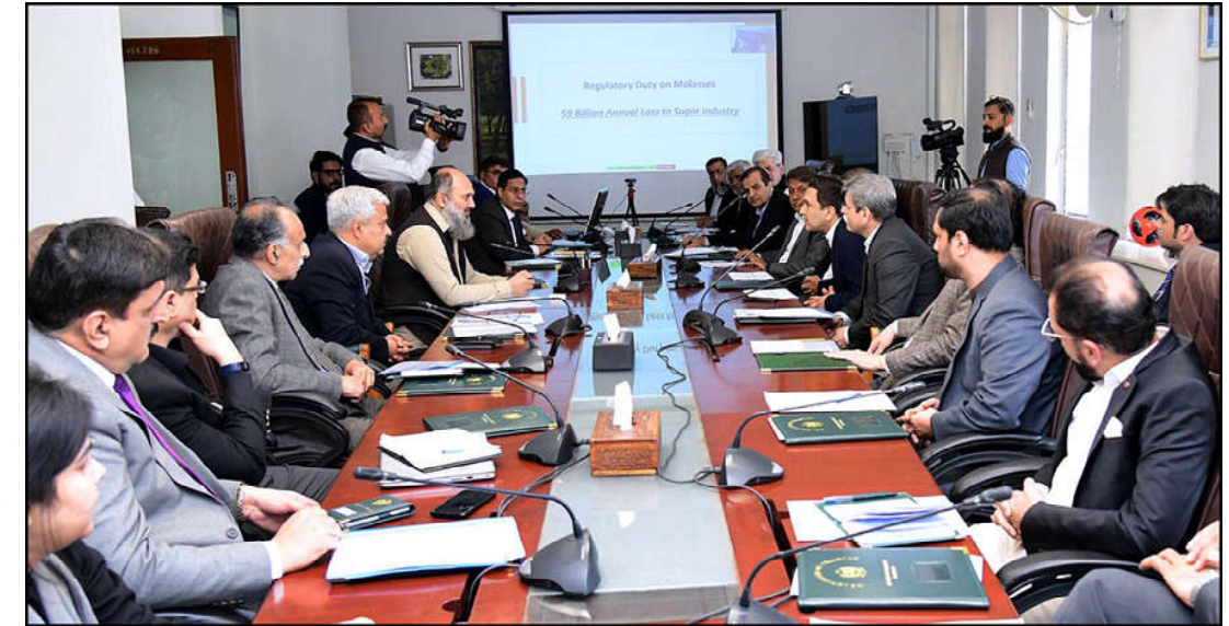
ISLAMABAD: Federal Minister for Commerce, Jam Kamal Khan, chairs significant meetings with representatives from the Sugar Mills Association and Ethanol Manufacturer Association to address pressing concerns affecting their industries.

They underscored the need for infrastructure improvements to enhance terminal capacity, facilitating greater access to international markets.