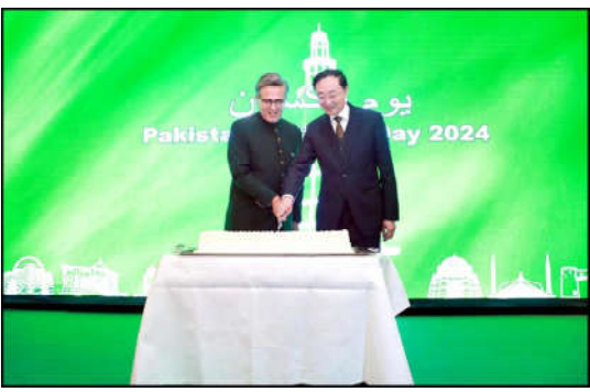
BEIJING: Ambassador of Pakistan to China, Khalil Hashmi and Vice Foreign Minister of the People's Republic of China, Sun Weidong cutting the cake in celebration of Pakistan National Day reception organised by Pakistan Embassy.

The information minister suggested that there should be a charter on "dos and don'ts of the red lines that should not be crossed", adding that political parties should discuss issues such as misogynistic abuse of women, cursing and mockery of martyrs, etc