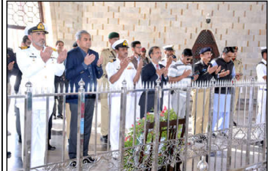
KARACHI: The Federal Minister for Interior Syed Mohsin Raza Naqvi offering فاتحہ at the mausoleum of father of the nation Quaid-e-Azam Mohammed Ali Jinnah during his first visit to the city.

PM Shehbaz further said that the entire nation including himself pay tributes to them. "The families of martyrs are a matter of pride for the entire nation", he remarked.