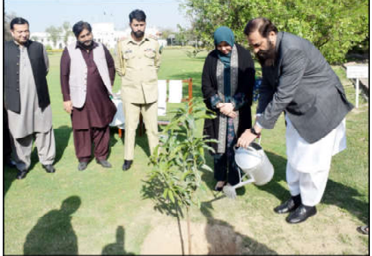
LAHORE: Punjab Governor Muhammad Balighur-Rehman along with his wife sapling a tree to inaugurate plantation campaign.

province. He said that people from all walks of life should actively participate in this campaign. Governor Punjab said that from the life and Aha Hadees of the Prophet, we get numerous examples about the importance of trees. Governor Punjab further said that according to experts, each tree provides enough oxygen in a day which is equal to meeting the oxygen requirement of forty people. Punjab Governor Muhammad Balighur Rahman said that we have to increase the number of trees and green areas in cities to eliminate the effects of environmental