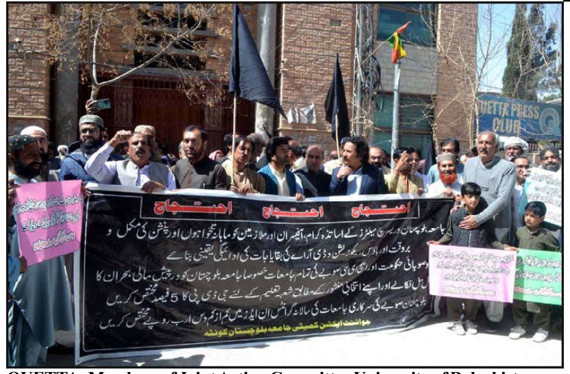
QUETTA: Members of Joint Action Committee University of Balochistan are holding protest demonstration against non-payment of their salaries.