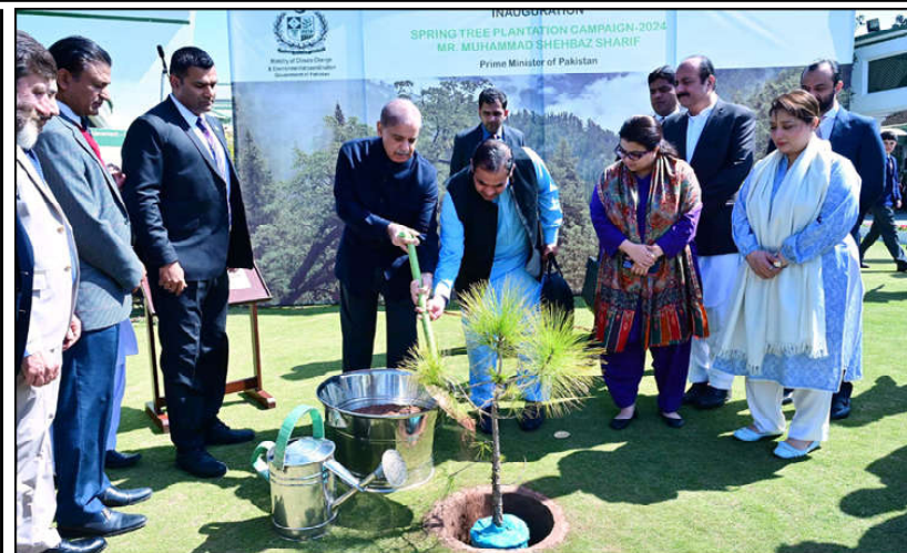
ISLAMABAD: Prime Minister Muhammad Shehbaz Sharif plants a sapling to launch the Spring Tree Plantation Campaign 2024 in the federal capital.

which 14.1 million saplings would be planted in Punjab, 11.72 million in Sindh, 5.71 million in Khyber Pakhtunkhwa, 3 million in Balochistan, 11.85 million in Azad Jammu and Kashmir (AJ&K), and 8 million saplings would be planted in Gilgit Baltistan. While during the Monsoon 2023 drive, a total of 49.02 saplings were planted across the country out of which 14.62 million saplings were planted in Punjab, 19 million in Sindh, 10.68 million in KP, 1.06 in Balochistan, 3.3 million in AJ&K and 0.36 million saplings were planted in GB. The major species to be planted in the spring drive include Timar, Kikar, Jand, Amaltas, Shisham, Sukh Chain, Simal, Farash, Phulai, Chir, Kail, Deodar, Peepal, Neem, Drekh, Beri, Imli, Jaman, Chiloza, Willow, Ailanthus, Sirus, and Poplar.