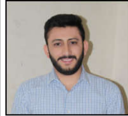
By Muhammad Tayyeb

Prioritizing Patient Safety: The Imperative of Infection Control Measures in Regional Anesthesia In the realm of modern medicine, where advancements are constantly pushing the boundaries of what is possible, one fundamental principle remains steadfast: patient safety. Nowhere is this commitment more critical than in the field of anesthesia, where meticulous attention to infection control measures is paramount to ensuring positive outcomes for patients undergoing regional anesthesia procedures. Regional anesthesia techniques, offering significant benefits such as targeted pain relief and reduced reliance on systemic medications. However, these pro-