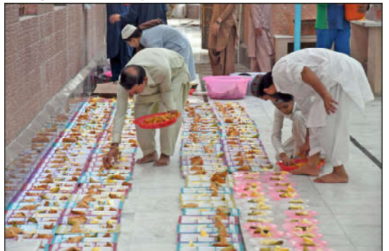
KARACHI: Devotees prepare meals before breaking fast during the holy month of Ramadan at the Khizra Mosque in Provincial Capital.

Independent Report LAHORE: In a bid to enhance healthcare services across the province, Punjab Minister for Specialized Healthcare and Medical Education Khawaja Salman Rafiq has announced the formation of a dedicated think tank. The initiative aims to revamp the health sector, with a focus on flagship programs at various levels of healthcare facilities. The inaugural meeting of the Health Advisory Committee, chaired by the minister alongside Primary and Secondary Healthcare Department Minister Khawaja Imran Nazir, marked a significant step towards this endeavor. Both ministers emphasized the government's commitment to leveraging the expertise of seasoned health professionals for system enhancement. During the meeting, Provincial Minister of Primary and Secondary Health Care Khawaja Imran Nazir expressed gratitude for Chief Minister Maryam Nawaz Sharif's dedication to improving healthcare.