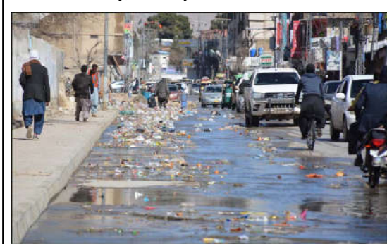
QUETTA: A view of accumulated sewage water on inmdad chowk crating problems for locals.

She further said that all over the world, the prices of essential items are reduced as soon as Ramadan comes, but in Pakistan, it has often been seen that the prices of essential items skyrocket with the arrival of this blessed month. She urged the district administration and concerned authorities to crack down on hoarders and sellers of expensive items and take necessary steps to provide cheap items to the people. Senator Samina Mumtaz Zehri said that Ramadan Mubarak was a holy and auspicious month. Allah Almighty blesses the sustenance of those who take legitimate profit during the month of fasting. Give full relief to the people in order to get the satisfaction of. Believe me, Allah will greatly bless and increase your sustenance with this action, she noted.