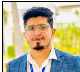
By Muhammad Nouman

Arterial lines, crucial for continuous monitoring of blood pressure and facilitating frequent blood sampling, are indispensable in critical care settings. However, their use comes with the risk of infection, which can lead to serious complications for patients. Implementing effective strategies for infection control in arterial line management is essential to mitigate this risk and ensure patient safety. One of the primary strategies for infection control in arterial line management is strict adherence to aseptic techniques during insertion and maintenance. Healthcare providers must meticulously clean their hands and wear appropriate personal protective equipment before handling arterial lines. Additionally, sterile barriers, such as sterile gloves, gowns, and drapes,