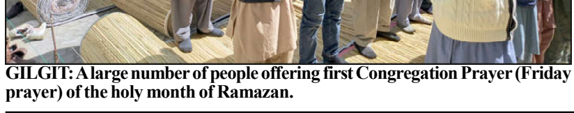
GILGIT: A large number of people offering first Congregation Prayer (Friday prayer) of the holy month of Ramadan.