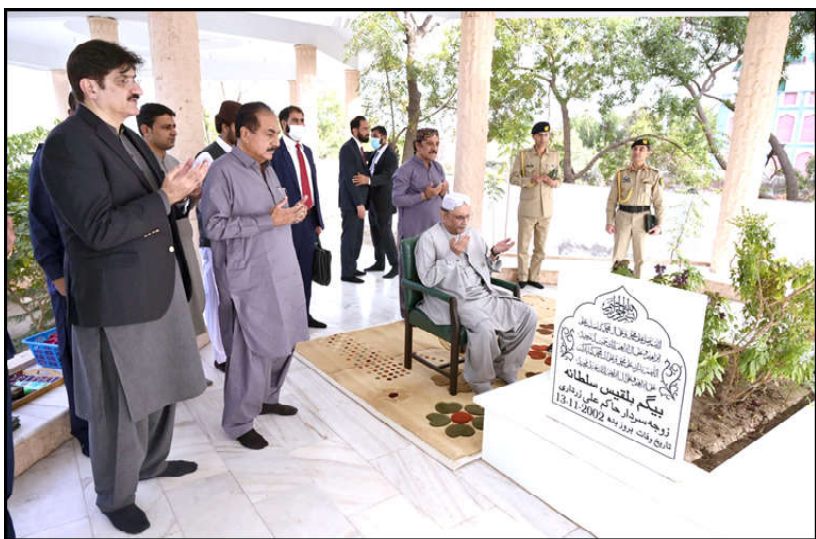
NAWABSHAH: President Asif Ali Zardari offers Fatha on his mother Begam Bilquees Sultana's grave.