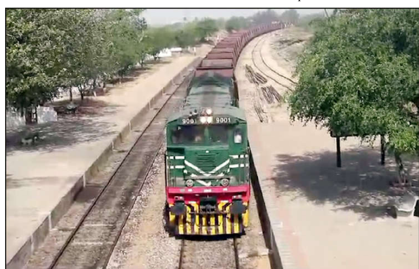
LAHORE: Pakistan Railway's longest freight train on way to its destination.

Moreover, he said the shift towards rail transport for freight purposes aligns with global efforts towards environmental preservation, as it effectively reduces pollution and carbon emissions associated with traditional road transport methods.