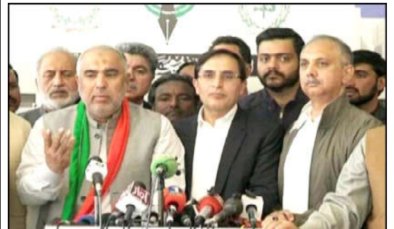
ISLAMABAD: PTI Secretary General and Leader of the Opposition in the National Assembly Omar Ayub, flanked by his party Chairman Barrister Gohar Ali and senior leader Asad Qaiser talking with mediemen.

people safe. In the area of virtually every market, marriage hall, school and even hospital there are SMGs on open display, including pickups with gun-toting men; the police look the other way and do not challenge when they are illegally double-parked. A great sense of insecurity must undoubtedly be felt by the majority of the law-abiding citizens, who are also intimidated by such offensive behaviour. This lawless state of affairs cannot be allowed to continue. "We are informed that licenses for prohibited bore weapons are issued 'for the purpose of protection or sports'. With regard to whether any other document or permit allowing possessing and carrying prohibited bore weapons the Ministry of Interior skirts the query; it does not provide an answer", it said.