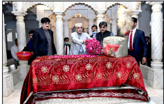
LARKANA: President Asif Ali Zardari showering flowers on the grave of Shaheed Zulfiqar Ali Bhutto at his mausoleum in Garhi Khuda Bakhsh Bhutto.

against terrorism. They also commended the dedication of the Pakistan Army in safeguarding the nation's territorial integrity and ensuring peace and stability. The Prime Minister said Pakistan is destined to rise and the role of the Armed Forces in ensuring peaceful rise of Pakistan cannot be over-emphasized. The COAS thanked the Prime Minister for the visit and reposing confidence in the Army. The COAS affirmed that Pakistan Army will continue to measure up to the nation's expectations and will resolutely support the Government in addressing the security challenges facing Pakistan.