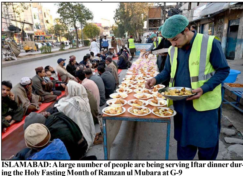
ISLAMABAD: A large number of people are being serving Iftar dinner during the Holy Fasting Month of Ramzan ul Mubara at G-9