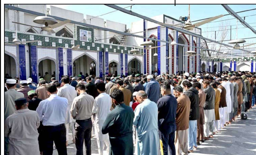
ISLAMABAD: People perform the first Friday prayer at a mosque during the holy month of Ramadan at G-7.

lution and myriad manifestations of Islamophobia in recent decades, he emphasized that Islamophobia was not just prevalent in some Western countries but in non-Western parts of the world as well, including in Pakistan's neighbourhood where it was growing in the wake of the 'Hindutva' ideology. Noting that the world was experiencing extreme levels of tumult, he stressed that this was the time to build bridges, not to accentuate religious or cultural fault-lines or create further divisions. People of goodwill in all faiths should come forward and play their part in forging greater mutual respect, understanding, and inter-faith harmony, he concluded. A special video message by Secretary General of the Organisation of Islamic Cooperation (OIC), Hissein Brahim Taha for the occasion was shared.