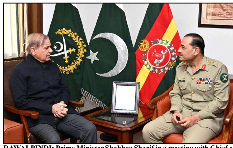
RAWALPINDI: Prime Minister Shahbaz Sharif in a meeting with Chief of the Army Staff General Asim Munir during his visit to GHQ.