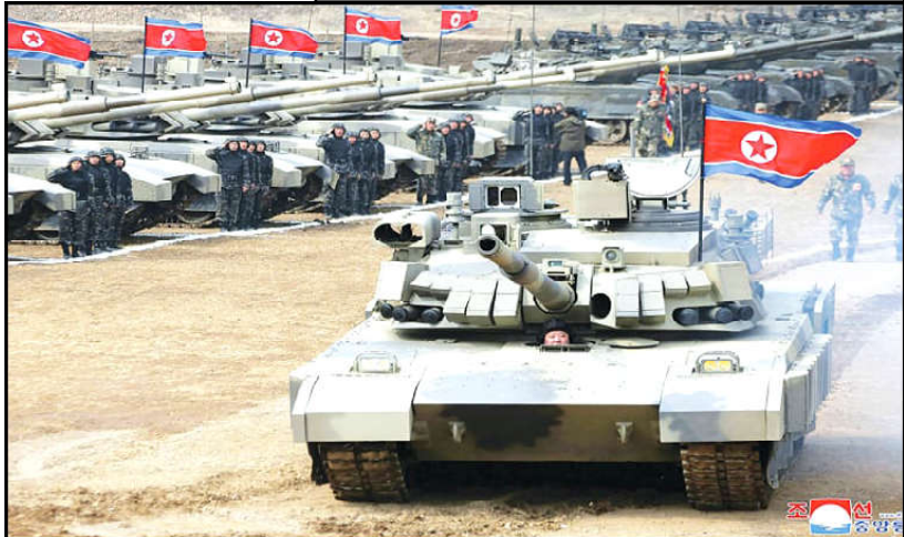
PYONGYANG: North Korean leader Kim Jong Un in the driver's seat of a new main battle tank after a training exercise for tank crews at an undisclosed location.