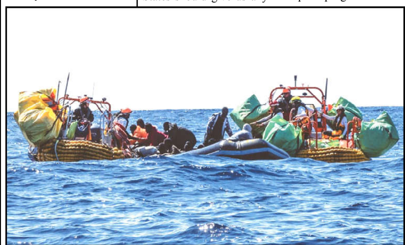
Crew members of a rescue ship pick migrants during an operation in the Mediterranean Sea.

Monitoring Desk RAMALLAH: Palestinian president Mahmud Abbas has appointed Mohammed Mustafa, a long-trusted adviser on economic affairs, as prime minister, the official Wafa news agency said on Thursday. Mustafa's appointment comes less than three weeks after his predecessor, Mohammed Shtayeh, resigned, citing the need for change after the Hamas attack of October 7 triggered war with Israel in Gaza. The 69-year-old now faces the task of forming a new government for the Palestinian Authority, which has limited powers in parts of the Israeli-occupied West Bank. Mustafa, who studied at George Washington University in Washington, is an independent executive committee member of the Palestine Liberation Organisation—dominated by the ruling Fatah movement. He has served as deputy prime minister for economic affairs, held a board seat on the Palestine Investment Fund and worked in a number of senior positions at the World Bank. He has also advised the Kuwaiti government and the sovereign wealth fund of Saudi Arabia, the Public Investment Fund. Since 2007, control of the Palestinian territories has been divided between Abbas's Palestinian Authority in the West Bank and Hamas in the Gaza Strip.