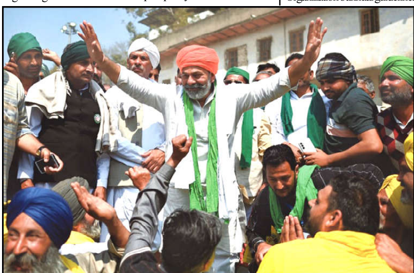
Spokesperson for the Bharatiya Kisan Union Rakesh Tikait speaks with farmers during a sit-in at New Delhi's Ramlila ground.

Monitoring Desk CHIANG MAI: Thai tourist hotspot Chiang Mai was blanketed by hazy smog Friday, as residents and visitors to the usually picturesque northern city were left wheezing in the toxic air. The city topped air monitoring website IQAir's table of the world's most polluted cities early Friday. Levels of PM2.5 pollutants—causing microparticles small enough to enter the bloodstream through the lungs—were classified as "very unhealthy" and hit more than 35 times the World Health Organization's annual guideline.