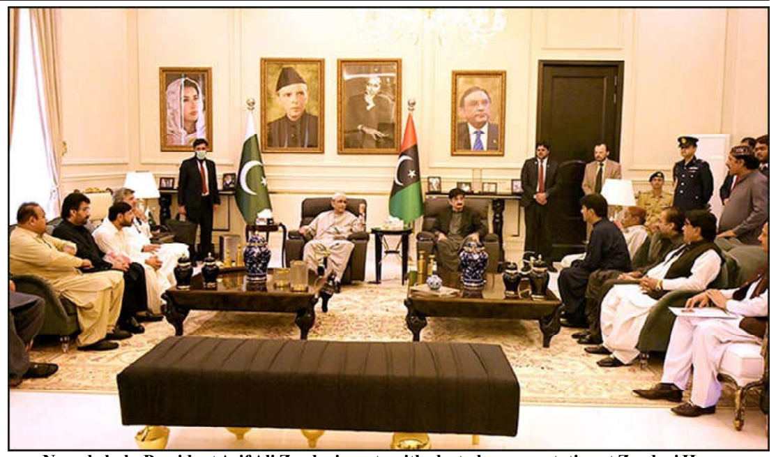
Nawabshah: President Asif Ali Zardari meets with elected representative at Zardari House.