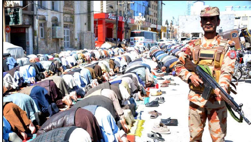
QUETTA: Security personal stan alert while Muslims offering first Friday prayers during the Muslim's holy month of Ramadan.

to mention here is that it is first case of polio reported from Chaman and second one from Pakistan. Prior to this, no polio case had been reported during last three years in the province. Meanwhile, after reporting of new polio cases from the province, a special polio immunization campaign has been planned in nine districts of the province. The campaign would be run in Kech, Khuzdar, Lasbela, Hub, Dera Bugti, Sibi, Naseerabad, Usta Muhammad and Jaffarabad.