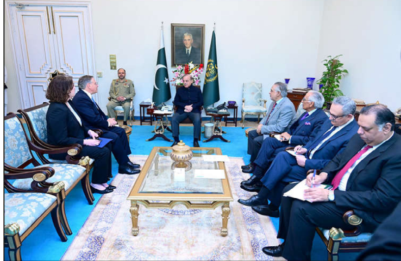
ISLAMABAD: Ambassador Donald Blome, Ambassador of the United States of America to Pakistan calls on Prime Minister Muhammad Shehbaz Sharif.