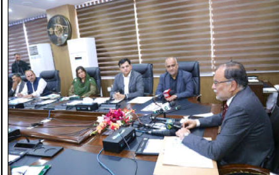
ISLAMABAD: Federal Minister for Planning Development & Special Initiatives Ahsan Iqbal, receives comprehensive briefing at Pakistan Bureau of Statistics.

The prime minister said that his government would focus on macro-economic reforms to stabilize the economy and attract foreign investment. In this