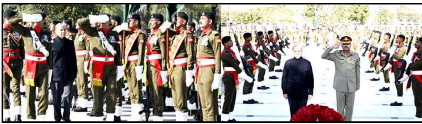
Prime Minister Shehbaz Sharif inspecting Guard of Honour during his visit to GHQ. PM also lays Floral wreath at Yadgar-e-Shuhada. Chief of the Army Staff General Asim Munir is also present