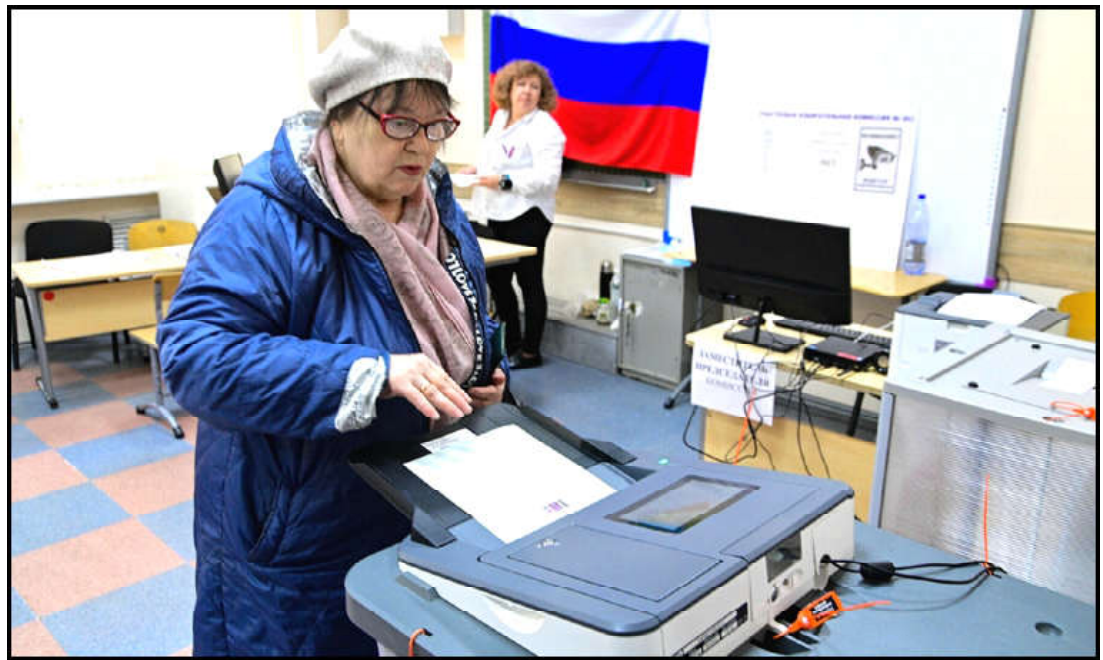
A woman votes in Russia's presidential election in the far eastern city of Vladivostok.

exercise your right to vote," Putin, 71 and in power as president or prime minister since 2000, faces three challengers in three days of voting beginning on Friday. None of the challengers has criticised him. Opinion polls show he is supported by a majority of Russians, with one survey last month giving him 75% support. Two candidates who had hoped to run on a platform of calling for an end to the war in Ukraine, officially described by Russia as a "special military operation," were ruled ineligible.