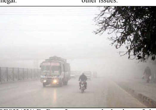
PESHAWAR: Deep fog covers the horizon of city creating problems for commuters and which cause increasing cold waves during the winter season, at GT road in Peshawar.

The Chief Minister was given a detailed briefing on department's should be higher than the administrative matters, performance, targets and