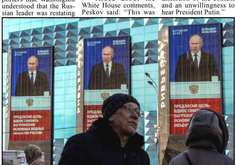
People wait for a bus next to electronic screens on the facade of a building showing an image of Russian President Vladimir Putin and a quote from his address to the Federal Assembly, in Moscow, Russia.

Then the rumor mill began spinning even faster after the princess declared in a statement that, whoops, she had edited the photograph - without disclosing the reasons for doing so or what she had edited out.