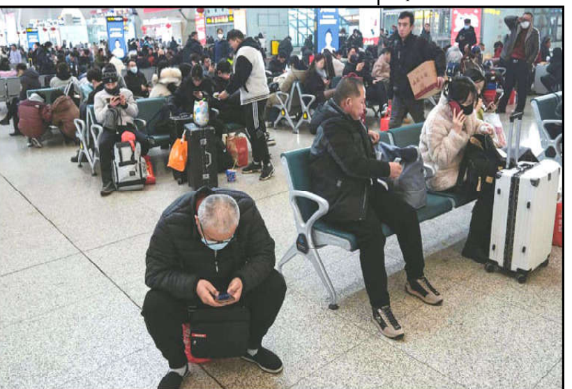
People wait for trains at a station in Shijiazhuang.