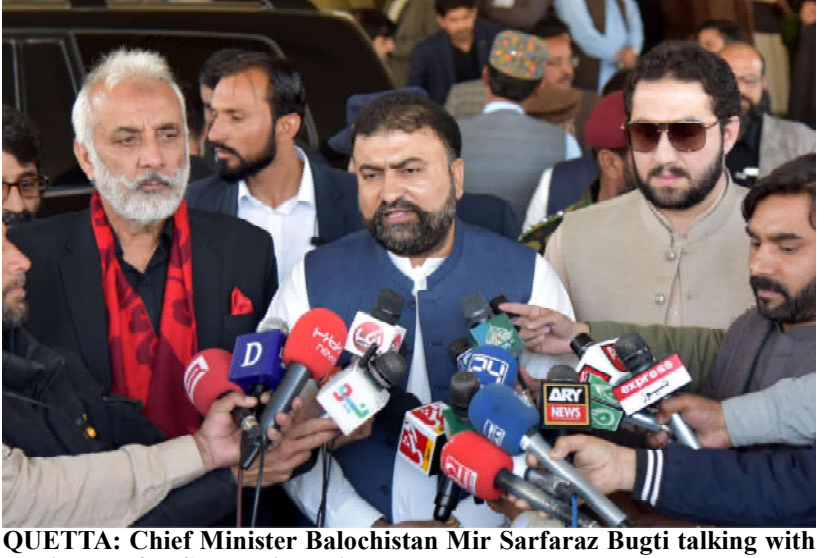
mediamen after Senate bi-elections

Talking about the IMF programme, he said that there would be a flood of inflation in the country and poor people would become poorer.