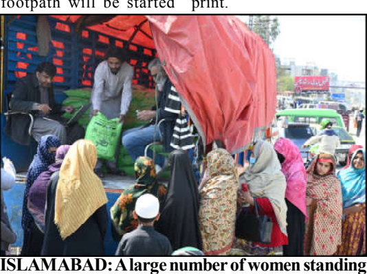
in a long queue and waiting for their turn to purchase wheat flour on subsidized price provided by government in the city.

On this occasion, the Chairman Capital Development Authority (CDA) while issuing instructions to the officers of the concerned departments, said that such footpaths, which are dilapidated, should be repaired as soon as pos-