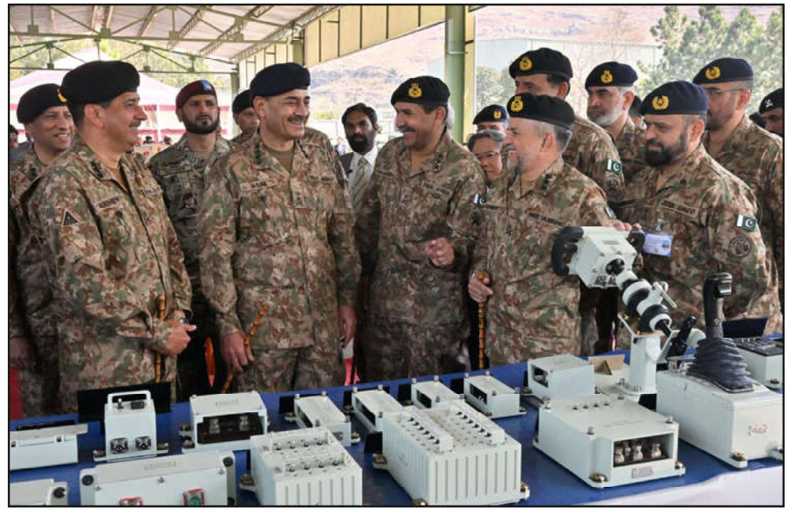
TAXILA: General Syed Asim Munir, NI (M), Chief of Army Staff (COAS), visited Heavy Industries Taxila (HIT) as chief guest at the rollout ceremony of HAIDER tank (Pilot Project).