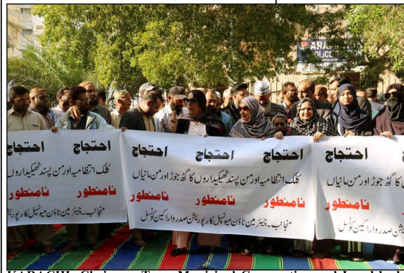
KARACHI: Chairmen Town Municipal Corporation and Local body representatives are holding protest demonstration against Competitive and Livable City of Karachi administration, held outside CLICK Office in Karachi.

Independent Report LAHORE: At least seven people were killed and 1,365 others injured in 1,312 road accidents in Punjab during the last 24 hours. As many as 592 seriously injured people were shifted to different hospitals, while 773 others with minor injuries were treated at the incident site by the rescue medical teams. The data analysis showed those 743 drivers, 53 underage drivers, 187 pedestrians, and 442 passengers were among the victims of road accidents. The statistics show that 266 accidents were reported in Lahore, which affected 296 people, placing the provincial capital at top of the list, followed by Faisalabad with 87 accidents and 90 victims.