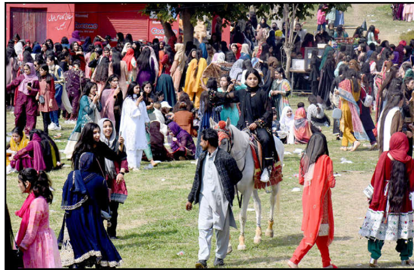
ISLAMABAD: Students enjoy horse ride during Annual Funfair at Model College G10/4.