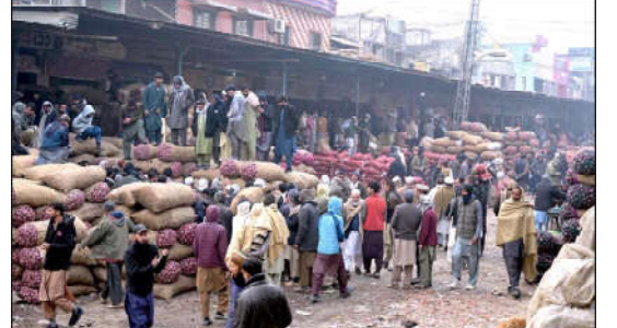
ISLAMABAD: A large number of people purchasing onion at Vegetable and Fruits Market.