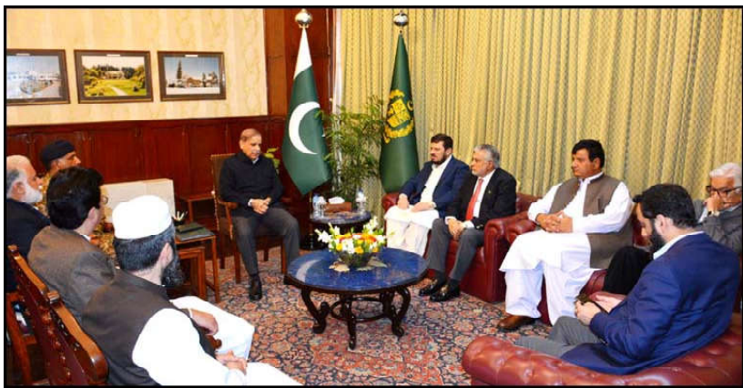
PESHAWAR: Prime Minister Shabaz Sharif meeting with Governor Khyber Pakhtoonkhwa Haji Ghulam Ali