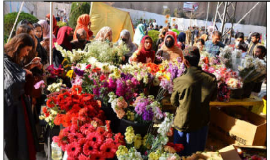
FAISALABAD: Visitors keenly visiting the flowers exhibition on the occasion of Jashn-e-Baharan at University of Agriculture, Faisalabad.

Individuals placed high-priced orders and traded with one another to artificially raise the share prices of specific stocks. They also placed fake buy orders and then cancelled a large number of these transactions, resulting in fictitious quotations to deceive potential investors. The accused also fraudulently misused clients' accounts to place large orders.