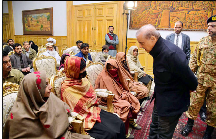
PESHAWAR: Prime Minister Muhammad Shehbaz Sharif interacting with the families of the deceased and injured in the wake of recent torrential rains and heavy snowfall.