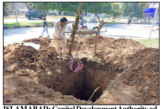
ISLAMABAD: Capital Development Authority administration is digging a drain gutter to open blocked sewage lines G-7 in the Federal Capital.

ISLAMABAD (APP): Federal Board of Intermediate and Secondary Education (FBISE), has launched a fully automated public service system to facilitate the students. According to the details given by the federal board, this initiative offers important services to the students. The students can benefit from the facilities including Online issuance of Migration/NOC certificate, result verification, and duplicate result card.