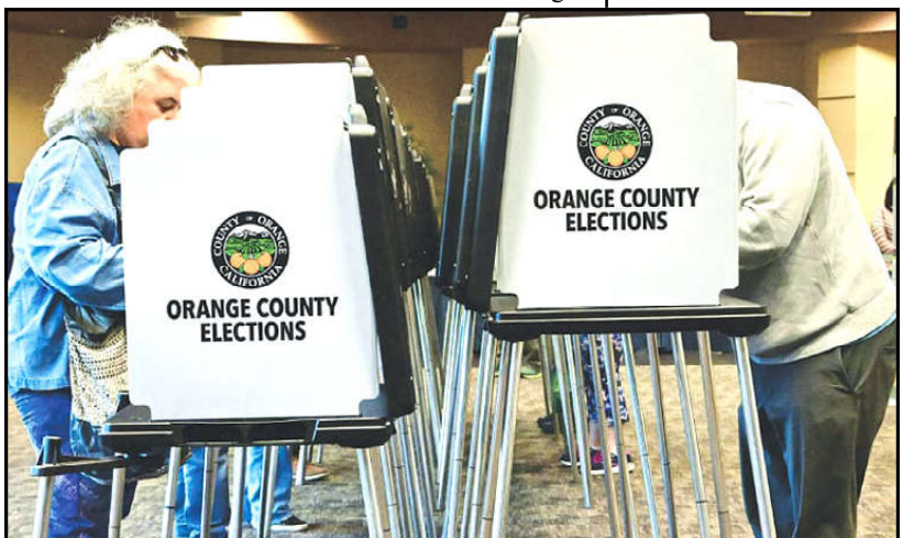
People vote on 'Super Tuesday,' at the Central Library in Huntington Beach, California.