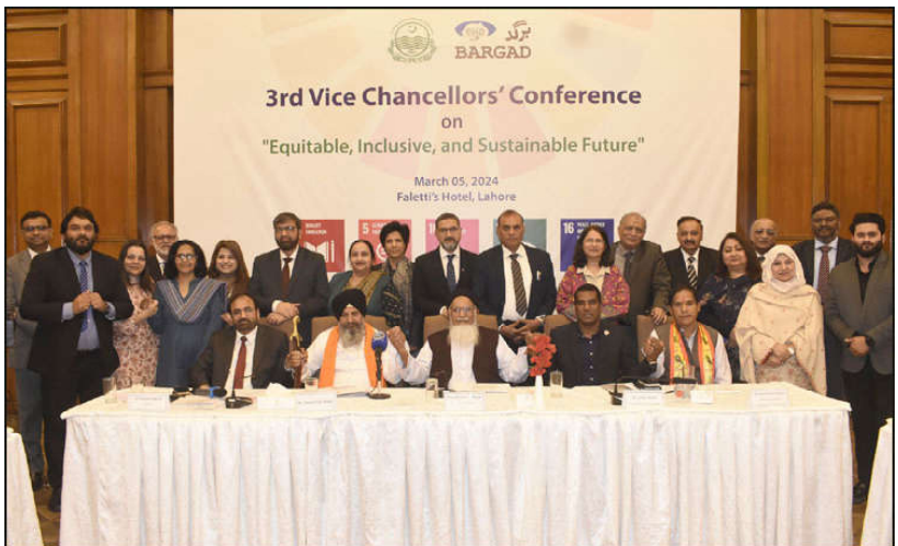
LAHORE: Vice-Chancellors, leaders of different religions expressing solidarity by putting their hands in their hands, on the occasion of the closing ceremony of the Vice-Chancellors' Conference on Equality, Comprehensive and Sustainable Development organized by the Punjab Higher Education Commission at a local hotel in the Provincial Capital.