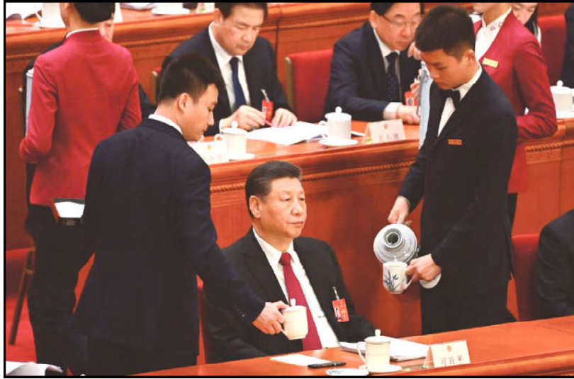
BEIJING: Workers replenish Chinese President Xi Jinping's teacups during the opening session of the National People's Congress at the Great Hall of the People.