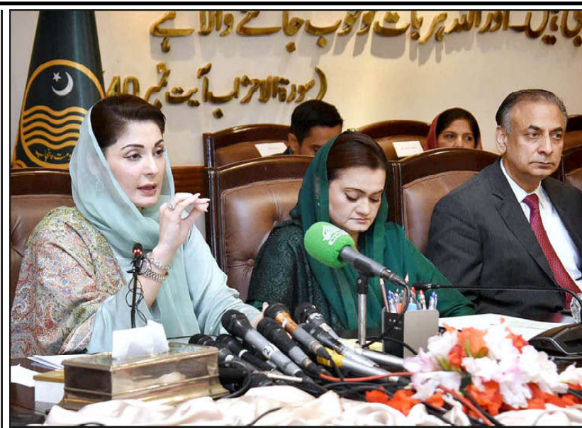
LAHORE: Chief Minister Punjab, Maryam Nawaz announcing the Ramadan Package in a press conference at Chief Minister House.

LAHORE (APP): Punjab Chief Minister Maryam Nawaz Sharif has announced the commencement of the largest-ever Ramadan Nigahban Package in Punjab, fulfilling her promises made in her maiden assembly speech. Addressing a press conference at CM's Office here on Wednesday, she said the Ramadan package, prepared in just nine days, would reach people's doorsteps and benefit them without any botheration. She said that package was aimed at providing swift relief to deserving individuals during the holy month under PML-N Quaid Muhammad Nawaz Sharif's guidance. "My mission is to provide relief to people at their doorsteps," she added. The chief minister said the initiative involves distributing 65,000 bags with QR codes, benefiting over 30 million people in Punjab. Beneficiaries' data from the Benazir Income Support Programme (BISP) and National Database and Registration Authority (NADRA) was being merged for saving time, Maryam said and added that the upcoming Punjab Socio-Economic Registry Project would gather comprehensive data for future government interventions. Detailing the Ramadan relief package items including flour, ghee, sugar, rice, and gram flour, the CM directed the district administrations and the Punjab Food Authority to ensure quality of food items. Random checks on hamper content and digitalised delivery mechanisms with the PITB-developed applications would enhance transparency, she added. Maryam Nawaz said that a digitalised record of distribution of 6.5 million