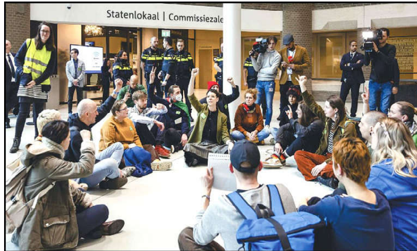
THE HAGUE: Protesters take part in a demonstration in support of Palestinians outside the Netherlands House of Representatives. Question time in the house was briefly interrupted three times by them.

Monitoring Desk MANILA: A dramatic stand-off with Beijing in the South China Sea this week was the most serious incident yet for the Philippines, its top security officials said on Wednesday, vowing not to back down in asserting the country's sovereign rights. The Philippines has been incensed by what it calls repeated aggressive conduct by China's coastguard, accusing its ships of using water cannons and blocking and harassing a Philippine resupply mission on Tuesday for troops stationed at the disputed Second Thomas Shoal. The Philippines' South China Sea task force said a top admiral was on board a vessel that was water cannoned by China's coastguard, shattering its windshield and wounding four navy personnel.