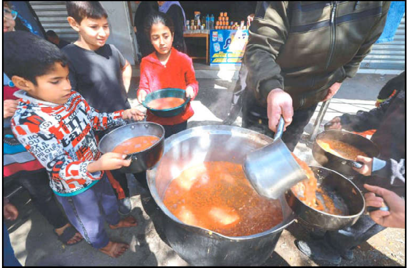
RAFAH: Palestinian children receive cooked food rations as part of a volunteer youth initiative in the southern Gaza Strip.

LONDON (Online): Children in the besieged Palestinian enclave of Gaza may not be able to survive a famine there, the head of the World Health Organization (WHO) said on Wednesday. "Children who survived bombardment but may not survive a famine," Tedros Adhanom Ghebreyesus wrote on X. He called for allowing more humanitarian aid into the Gaza Strip as well as a cease-fire there. Israel has waged a deadly military offensive on the Gaza Strip since an Oct. 7, 2023 attack by the Palestinian group Hamas, which Tel Aviv says killed nearly 1,200 people. More than 30,700 Palestinians have since been killed and 72,156 others injured amid mass destruction and shortages of necessities. Israel has also imposed a crippling blockade on the Gaza Strip, leaving its population, particularly residents of northern Gaza, on the verge of starvation. The Israeli war has pushed 85% of Gaza's population into internal displacement amid acute shortages of food, clean water, and medicine, while 60% of the enclave's infrastructure has been damaged or destroyed, according to the UN. Israel stands accused of genocide at the International Court of Justice. An interim ruling in January ordered Tel Aviv to stop genocidal acts and take measures to guarantee that humanitarian assistance is provided to civilians in Gaza.