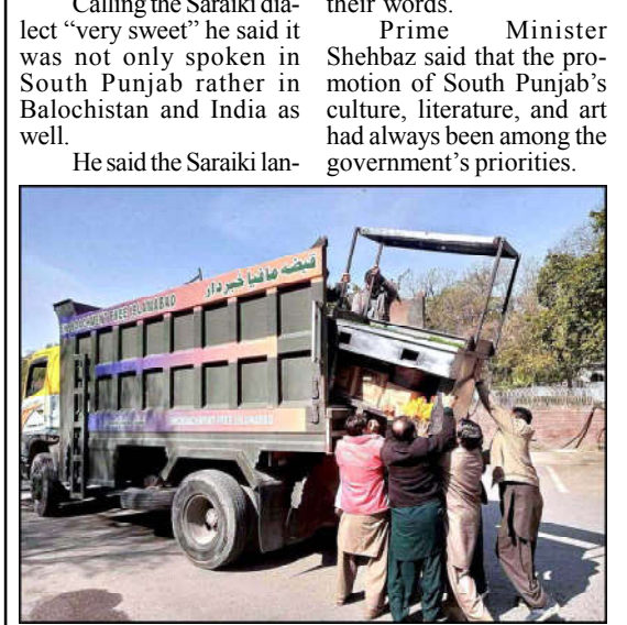
ISLAMABAD: CDA workers lift ups vendor's setup during an anti-encroachment campaign at F-7 Markaz.

guage and the Saraiki writers had immense contributions to literature, poetry, and music. The prime minister said that Saraiki culture was rooted in the thousands of years old Indus Valley Civilisation. He said that the saints like Hazrat Bahauddin Zakaria, Hazrat Shah Ruknuddin Alam, Khawaja Ghulam Fareed, Salman Taunsvi, Sakhi Sarwar Shah and Shams Tabraiz also enriched the Saraiki language through their words. Prime Minister Shehbaz said that the promotion of South Punjab's culture, literature, and art had always been among the government's priorities.