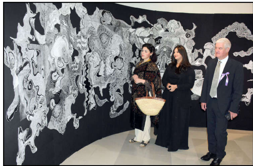
ISLAMABAD: Portuguese Ambassador in Islamabad, Frederico Silva visiting an exhibition by women artists from all over Pakistan to Commemorate Women's Day 2024 at PNCA, in Federal Capital.