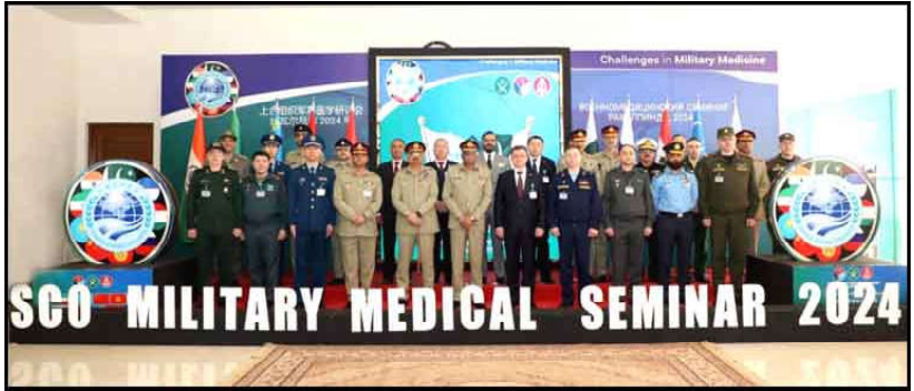
Chiefs of Staff Committee (JCSC), Tuesday attended the opening session of theme of "Challenges in Military Medicines". The Chairman JCSC

RAWALPINDI (Online): SCO Members States Seminar being hosted by Pakistan at Rawalpindi on in his address highlighted that emergence of new and complex healthcare chal-