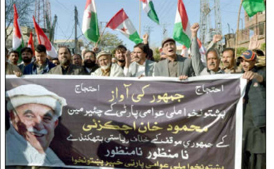
PESHAWAR: Activists of Pashtunkhwa Milli Awami Party (PKMAP) are holding protest rally against the raid on the house of Mahmood Khan Achakzai, Chairman of the PKMAP, at Peshawar press club.

people who love to read books. He further said that one should strive for continuous improvement in life. He added that book reading broadens the vision of a person and develops positive character traits in him. He said that many people are doing good work in the society, they should be encouraged so that the process of improvement in life continues. He said that today's programme is also held to appreciate the literary contribution of Jameel Jalbi. Governor Punjab said that Dr. Jameel Jalbi was a well-known intellectual,