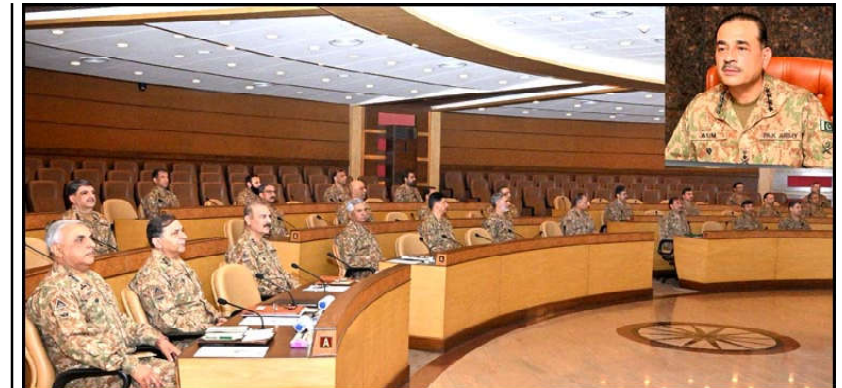
RAWALPINDI: Chief of Army Staff (COAS) General Syed Asim Munir, NI (M), presided over the 263rd Corps Commanders' Conference (CCC) held at GHQ