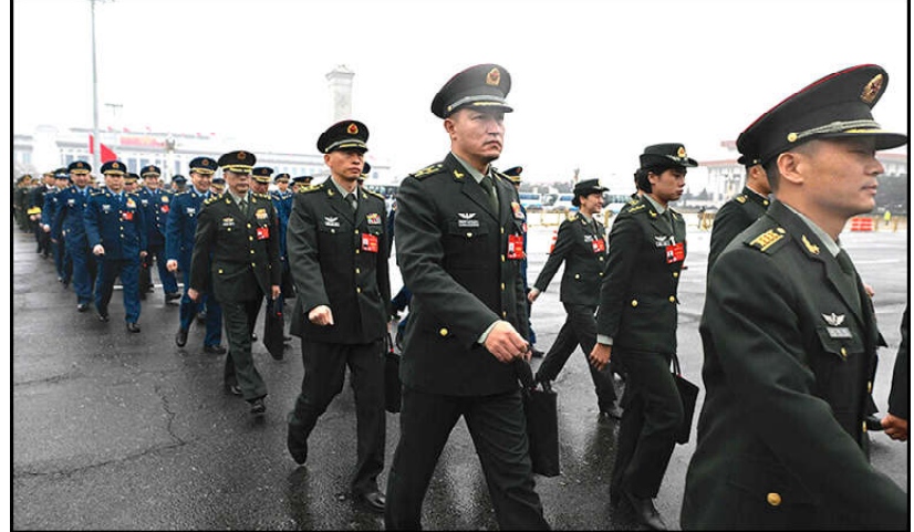
Military delegation arrive for the opening session of the National People's Congress (NPC) at the Great Hall of the People in Beijing.