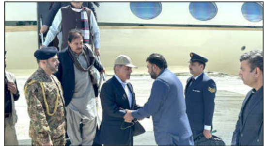
GWADAR: Chief Minister Balochistan, Mir Sarfraz Bugti receiving Prime Minister Muhammad Shehbaz Sharif upon his arrival.

"He is not to innovate at pleasure. He is not a knight errant, roaming at will in pursuit of his own ideal of beauty or of goodness. He is to draw his inspiration from consecrated principles. He is not to yield to spasmodic sentiment, to vague and unregulated benevolence. He is to exercise a discretion informed by tradition, methodized by analogy, disciplined by the system."