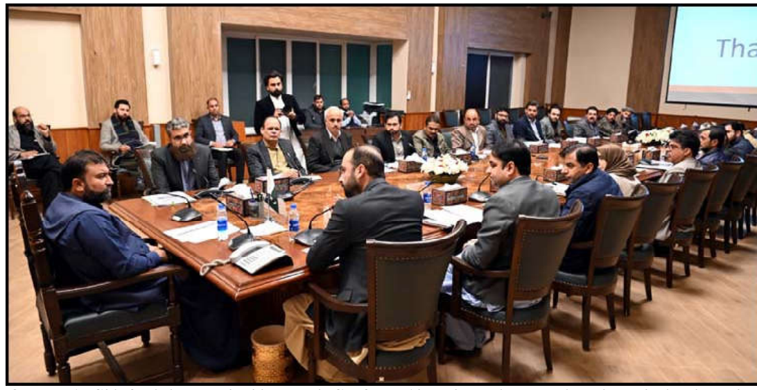
QUETTA: Chief Minister Balochistan Mir Sarfraz Ahmed Bugti expressing views during introductory meeting with the officers of Chief Minister Secretariat

Secretary Health also chaired a meeting regarding the provision of health facilities at GDA Hospital Gwadar. He also took round of various departments of the hospital.