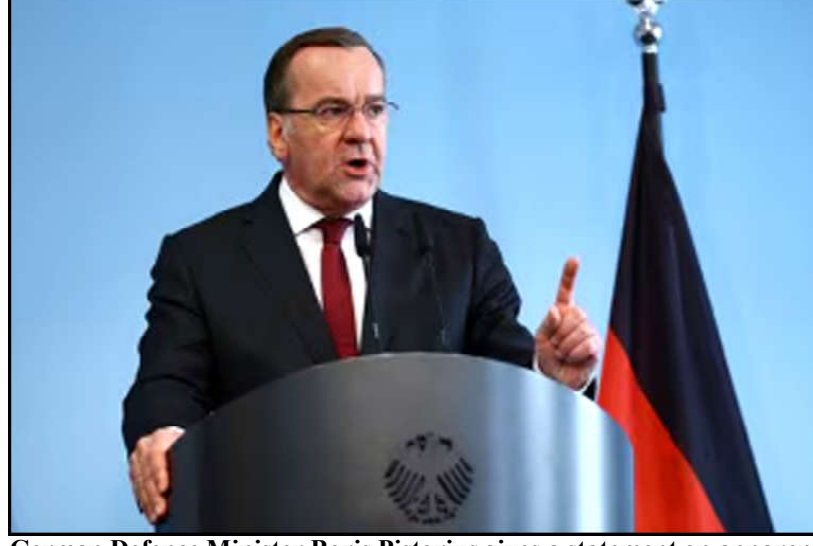
German Defence Minister Boris Pistorius gives a statement on apparent eavesdropping of German army Bundeswehr call at the defence ministry, in Berlin, Germany.

KENNEDY: Three American astronauts and a Russian cosmonaut blasted off on Sunday night from Florida for a six-month mission on the International Space Station. The SpaceX Falcon 9 rocket lifted off at 10:53pm from the Kennedy Space Center, lighting up the night sky with a long, bright plume of orange flame. Just minutes after the launch, as the rocket soared over the Atlantic, it was moving at a speed of 6,000 miles per hour, NASA TV commentators said. It took about nine minutes for the capsule to settle into orbit as it prepared to dock with the ISS and relieve four other crew members. A first attempt to launch the mission was scrubbed due to high winds. Endeavour.