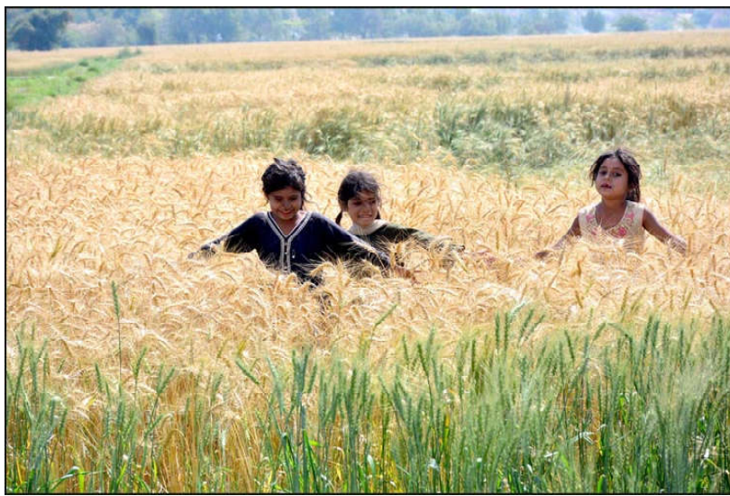
HYDERABAD: Village girls walking through wheat crop in the catchment area of the city.