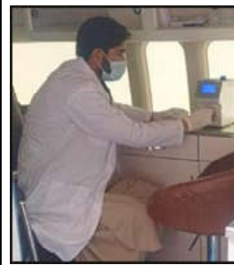
QUETTA: Teams of Balochistan Food Authority inspecting the various items and milk during their inspection in Quetta city.

Rafhan Maize Products Company Limited witnessed a maximum increase of Rs 252.16 per share price.