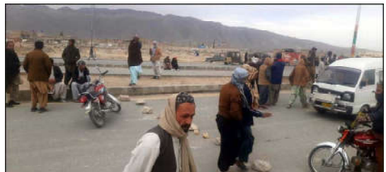
QUETTA: Residents of Sariab protesting against shortage of gas by blocking the Sariab Road.

The role of ZTBL in promotion of agriculture sector has helped agriculture sector of the country contributing 22.9% in GDP, employing nearly 37.4% of labor force and a base for other industries which is surely the backbone of country's economy. To serve the banking needs of farmers, ZTBL strategic presence is characterized at rural, under served and unbanked areas, covering 482 locations nationwide with branch network of 501 branches. On advisory front, ZTBL reaches at doorstep of farmers through its Mobile Van Service and arrangement of Zarai Baithaks. Meanwhile, the bank has introduced financing schemes considering the needs of the subsistence farmers aiming to their empowerment which will result.