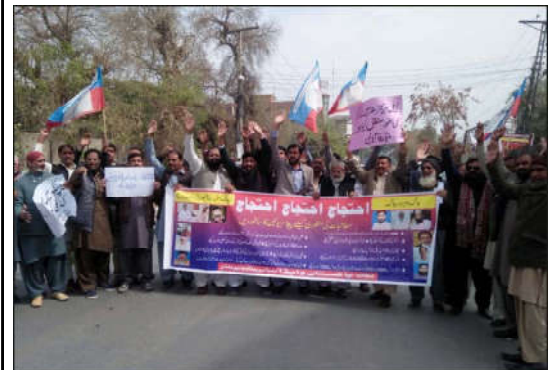
MULTAN: Members of Pakistan Wapda Employees Pegham Union are holding protest demonstration for acceptance of their demands, at Multan press club.

the business community is facing problems like rupee devaluation, inflationary pressure, high policy rate and high cost of doing business, high energy prices, repeated increase in POL (Petroleum, Oil and Lubricants) prices, MDI charges on closed industrial units, reduction in axle load limit, hike in cargo delivery charges and non-opening of LCs (Letters of Credit). "Settling down all these problems will definitely spur socio-economic development," he remarked.