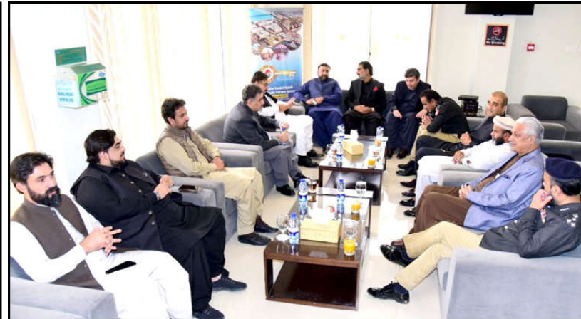
GWADAR: Chief Minister Balochistan Mir Sarfraz Ahmed Bugti presiding over a meeting to review situation arises after recent rains and rehabilitation activities

"Meta platforms including Facebook, Instagram, Messenger and Threads are currently experiencing outages related to login sessions in multiple countries; incident not related to country-level internet disruptions or filtering," NetBlocks wrote on X, formerly Twitter.