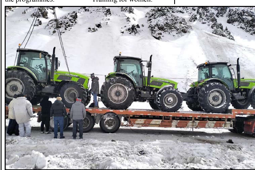
ISLAMABAD: National Logistics Corporation (NLC) in coordination with local administration recovered the last Chinese vehicle that overturned due to heavy snowfall at Khunjerab pass