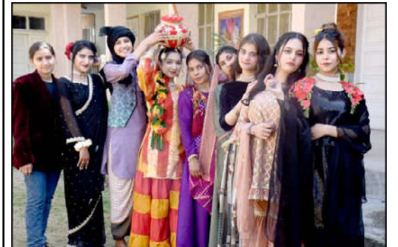
ISLAMABAD: Participants of singing competition pose for group photo at IMCG F11/3.