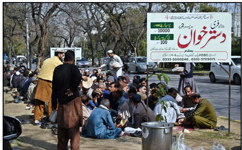
ISLAMABAD: Volunteers distribute free food among deserving people at Jannah Super area.