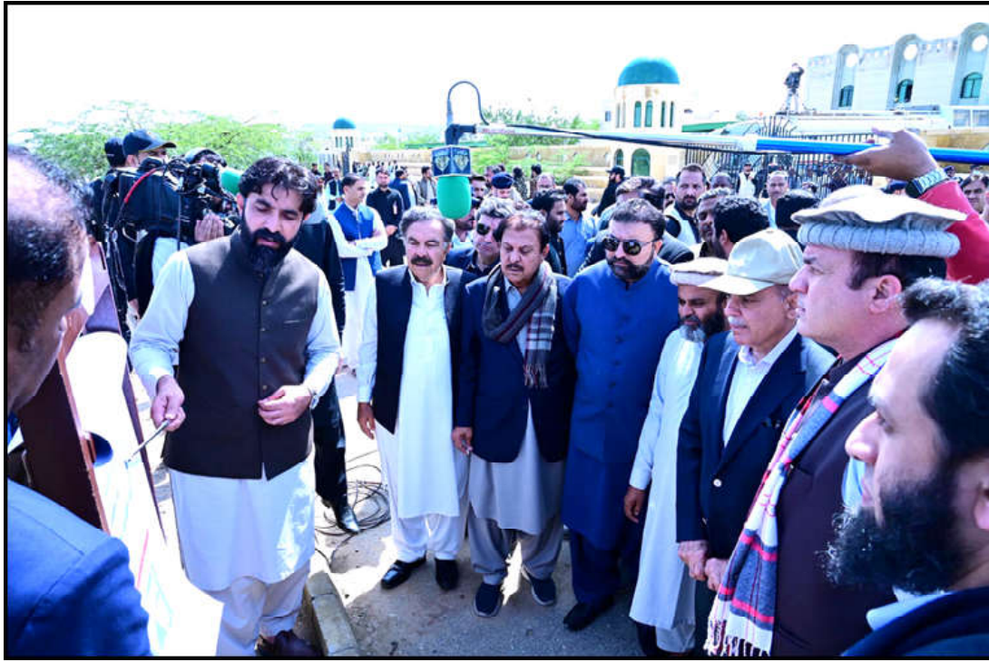
GWADAR: Prime Minister Muhammad Shehbaz Sharif being briefed regarding the damages caused by the recent torrential rains and the relief and rescue operations carried out by the local authorities

Ph: 2841470/2841473 REG.No.EC-116 B/ID-445 V&amp; XXV No 196, Shaban 24, 1445 AH Wednesday March 06, 2024 Pages 08, Price Rs.15