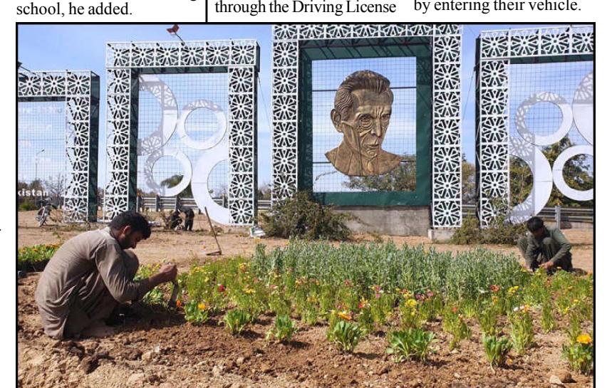
ISLAMABAD: CDA workers planting sepal of flowers on the green belt area at Shakarparian in the federal capital.

surgeries during a ten-day-long camp from March 01-10. Overall, more than 400 cataract surgeries will be performed, restoring vision and improving the lives of hundreds of people in Somalia. The free cataract eye surgery camp was announced by the OIC Ministerial Standing Committee on Scientific and Technological Cooperation (COMSTECH) in collaboration with Al-Shifa Trust Eye Hospital, Rawalpindi under the special instructions.