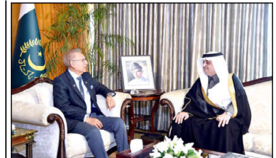
ISLAMABAD: The Kingdom of Saudi Arabia's Ambassador to Pakistan, Nawaf bin Said Al-Malki, call on President Dr Arif Alvi, at Aitwan-e-Sadr.

QUETTA: The Balochistan Assembly's session is expected to be held at 11:00 AM on March 8. This was announced in an official notification issued here by the Balochistan's Provincial Assembly secretariat on Tuesday. According to the notification, the newly elected members of assembly would take oath in the assembly's session.