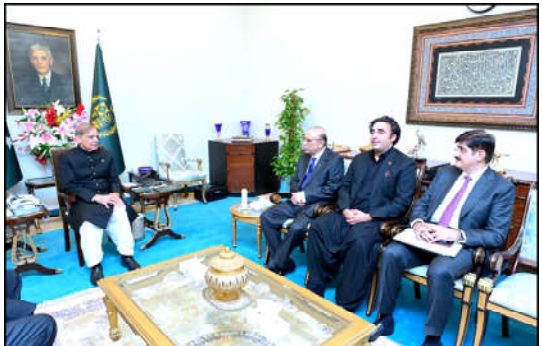
ISLAMABAD: Former President Asif Ali Zardari, Chairman Pakistan People's Party Bilawal Bhutto Zardari and Chief Minister Sindh Syed Murad Ali Shah call on Prime Minister Muhammad Shehbaz Sharif.

Senator Ishaq Dar, Senator Azam Nazeer Tarar and former Punjab Caretaker Chief Minister Syed Mohsin Naqvi also attended the meeting.