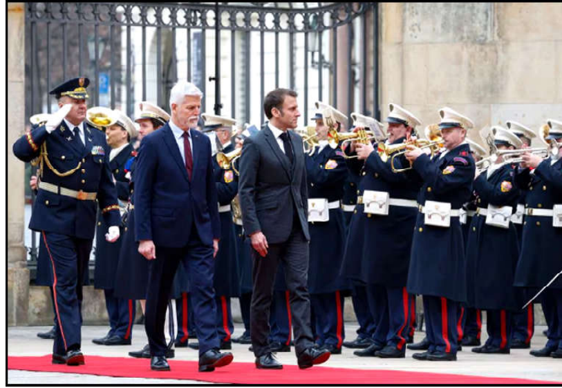
Czech Republic's President Petr Pavel and French President Emmanuel Macron walk past an honour guard at Prague Castle in Prague, Czech Republic.