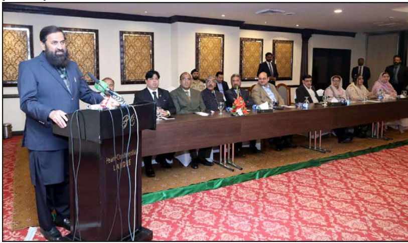
LAHORE: Governor Punjab Muhammad Balighur Rahman addressing a seminar on education and literature held at a local hotel.