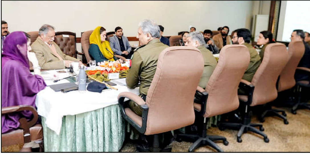
LAHORE: Chief Minister Punjab Maryam Nawaz presides over the meeting regarding Traffic Management.

contract employees have completed three-year period but the new appointments were stopped by election commission due to current general elections. Meeting approved six months extension of contract period and directed to ensure policy of merit while making new appointments. Addressing the meeting, the Governor directed UoM administration to reduce fees and stressed faculty to improve capacity of students keeping in view international standard of education. He said that education must be compatible to contemporary standard adding it would help students to effectively meet challenges of existing scenario.