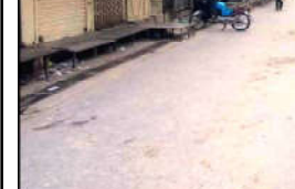
dence of the party's chairman and arrest of a gunman. Following strike, the flow of traffic also remained less in the main areas of Quetta city.

The call of shutter down strike was given by the PkMAP as a mark of protest against alleged raid at resi-