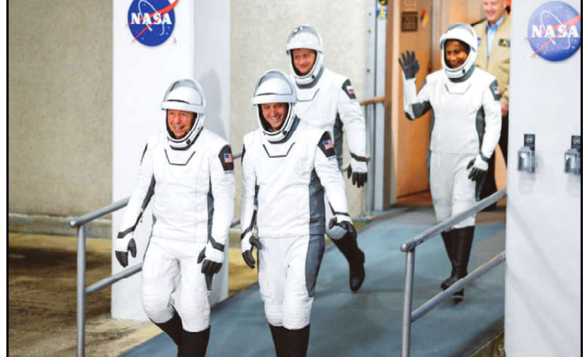
SpaceX astronauts Matthew Dominick, Michael Barratt, Jeanette Epps and Alexander Grebenkin leave their crew quarters for the launch pad at the Kennedy Space Centre.

SHAMBHU: They have been beaten with canes, doused in tear gas and blocked by concrete barricades and metal spikes but the thousands of farmers trying to march to India's capital to demand higher crop prices also face an invisible barrier — digital blackouts. As their caravan of tractors and trucks moved from the northern state of Punjab towards New Delhi, the farmers found their phones going dead as state authorities imposed temporary internet shutdowns. It is not the first time authorities have cut the internet — India imposed the highest number of internet shutdowns in the world in 2022 — and campaigners fear more digital crackdowns ahead of elections expected by May. Farm union leaders are seeking guarantees, backed by law, of more state support or a minimum purchase price for crops. Since Feb 12, Haryana state authorities have cut access to mobile internet services at regular intervals and for several days at a time. They said they did so to "stop the spread of misinformation and rumours" and to prevent the mobilisation of "mobs of agitators and demonstrators", according to local media. The farmers, many of whom are members of the Sikh religious minority from Punjab, say the shutdowns made it hard to get medical help for the injured and to source food. It also cut them off from their leaders, making coordination difficult. "We're already far away from home and the communication blackout adds to our miseries," he said.