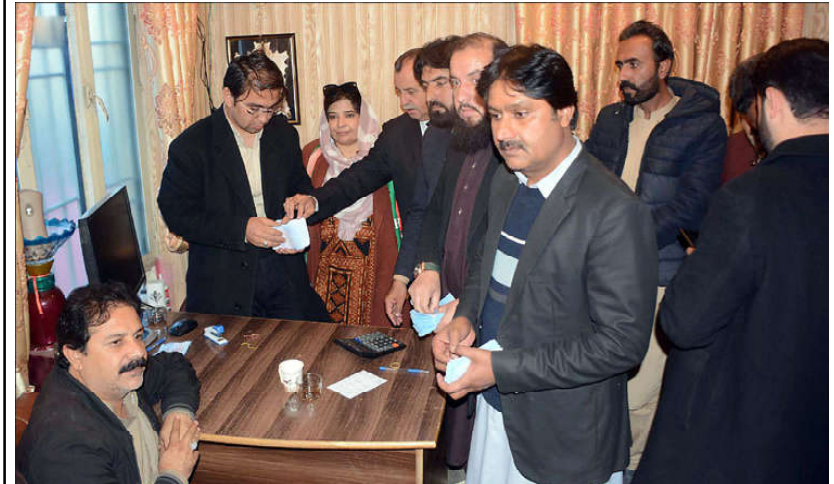
QUETTA: A view of counting of votes at the end of PTI inter-party election.

ISLAMABAD (Online): After the completion of the proceedings against Justice (retd) Mazahar Ali Akbar Naqvi in the Supreme Judicial Council (SJC), the opinion of the Council is likely to be sent to the relevant authorities this week. The proceedings were completed under the chairmanship of Chief Justice Qazi Faiz Esa. The statements of different witnesses were completed, while the retired judge refused to cross-examine the witnesses, the letter sent to the council on behalf of retired judges was made part of the record. Council Chairman Chief Justice Qazi Faiz Esa said that the Council will give its opinion.