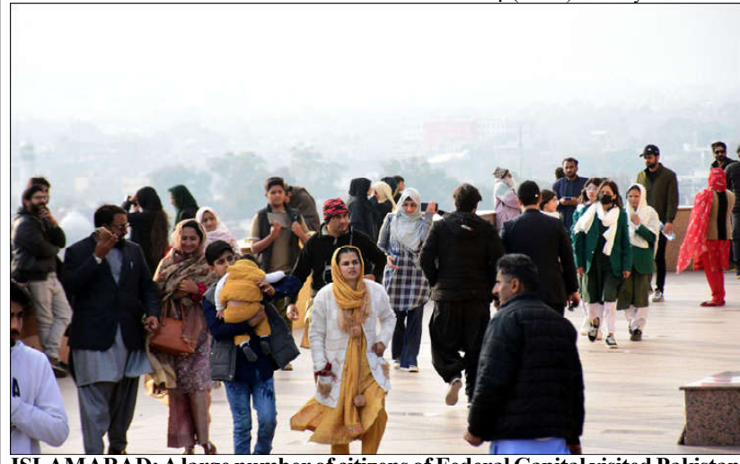
ISLAMABAD: A large number of citizens of Federal Capital visited Pakistan Monument for recreation, on a sunny Sunday after two rainy days.

ISLAMABAD (APP): Pakistan Muslim League-Nawaz (PML-N) leader, Dr Musadik Malik on Sunday said that Prime Minister Muhammad Shehbaz Sharif's address in the National Assembly would bring economic and social revolution to the country. Talking to the media at the Parliament House, he said that after the formation of the coalition government, revolutionary measures would be taken for the provision of maximum relief to the common man. He urged the National Bank of Pakistan (NBP) and other private banks to provide loans to talented youth to establish their small and medium businesses that would pave the way to create employment opportunities. Dr Musadik said the prime minister announced immense programmes to ensure economic stability, adding that the tax should be collected directly.