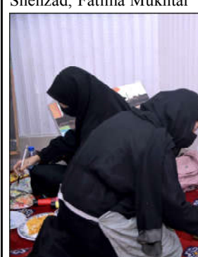
SARGODHA: Student giving final touch to painting during Punjab painting competitions organized by Sargodha Arts Council.

ATTOCK (APP): Two people, among them a teenage teacher of a private school were killed in two different incidents in various parts of Attock on Sunday, police and rescue sources said. In the first incident, a teenage teacher of a private school was going to her house when she reached Mohallah Subalan, she slipped and drowned in a drainage line in the limits of Fatehjang Police Station. Later, Rescue 1122 retrieved her body and shifted to the Tehsil Headquarters Hospital in Fatehjang, where she was declared dead. Separately, an employee of the Municipal Committee, Hassanabdal, lost his life while repairing a street light in Mohallah Shaheedabad.