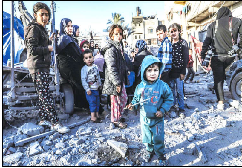
Children stand amid the rubble of a mosque and makeshift shelters that were destroyed in Israeli strikes in Deir El-Balah in central Gaza.