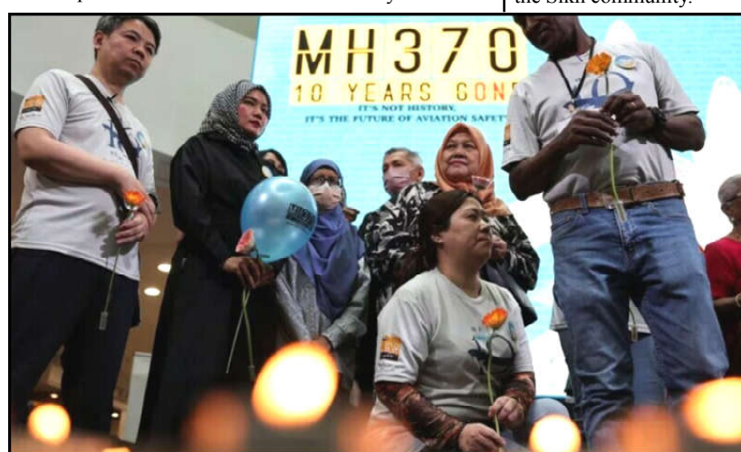
Families of passengers from both China and Malaysia, who were aboard the missing Malaysia Airlines flight MH370, are seen during a remembrance event commemorating the 10th anniversary of its disappearance, in Subang Jaya, Malaysia.