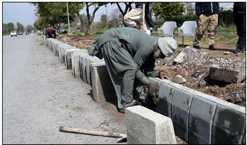
ISLAMABAD: Labourer busy in construction work of footpath at Club Road.