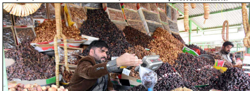
ISLAMABAD: Ahead of Ramadan, a Vendor in Sunday Bazar in Federal Capital decorating different kinds of dates for the customers.