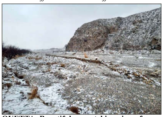
QUETTA: Beautiful eye catching view of snow covered area during the snowfall of winter season, which more decreases the temperature below in minus degree Celsius, at mountainous areas of Balochistan.

ISLAMABAD (APP): Minister for Religious Affairs and Interfaith Harmony, Aneeq Ahmed on Sunday said the selection of Moavineen-e-Hujjaj is being conducted for the first time in history through the National Testing Service (NTS) in a landmark move prioritizing transparency. He announced this milestone during his visit to the NTS center in the federal capital. During the visit, he oversaw the administration of written exams for the selection of Moavineen-e-Hujjaj and Hajj Medical Mission personnel for Hajj 2024. Emphasizing the significance of this development every year, Pakistani assistants and doctors are deployed for Hajj duties. Last year, he said there were 794 assistants, while this year, the number stands at 625. Similarly, the number of doctors remains consistent at 540, as it was in the previous year, he added. Aneeq further stated that this year, they pledge to serve the pilgrims diligently, and those selected through the written exam would demonstrate enhanced performance during the Hajj 2024.