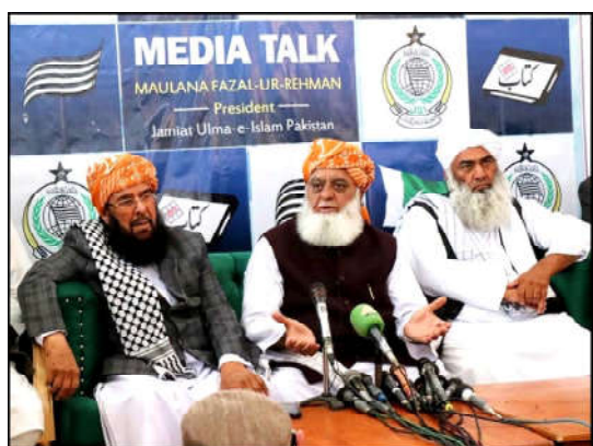
JUI-F chief Maulana Fazlur Rehman addressing a press conference in Karachi.