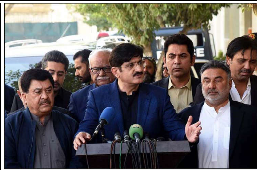
KARACHI: Sindh Chief Minister, Syed Murad Ali Shah talking to media persons, outside Election Commission Office in Karachi.

Assembly. The CM also expressed regret that amendments to the local bodies law could not be made by a political party as demanded by the MQM. Syed Murad Ali Shah said that he had talked to the MQM for the election of Speakers and Deputy Speaker of the Sindh Assembly. Presently, MQM leadership is in Islamabad for the Prime Minister's election and they would be approached for the presidential election, the CM said. Shah admitted that MQM and Sunni Ittehad Council have stakes in Sindh, therefore they would be consulted for legislation, and other concerned matters. "I want to take all the stakeholders together so that the issues of the province can be resolved with collective wisdom.