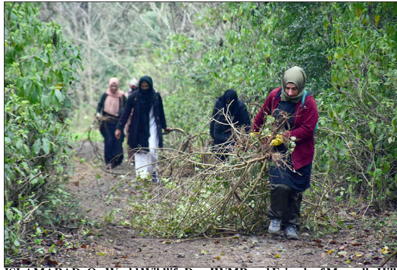
ISLAMABAD: On World Wildlife Day, IWMB and Friends of Margalla Hills along with university students busy in removing alien invasive plants like Lantana on Trail 4, Margalla Hills National Park in Federal Capital.