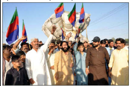
HYDERABAD: Members of Sindh Awami Forum are holding protest demonstration against high handedness of police, at Fateh Chowk in Hyderabad.