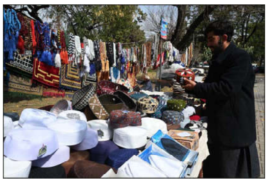
ISLAMABAD: A vendor displaying and selling caps to attract the customers at his roadside setup.

on the telecom sector for obvious reasons. Mobile phone operators also overcharge subscribers, who end up paying more money for less talk time, and other tactics were also employed to fleece consumers, he said, adding that one reason for this continued trend of economic crime was the lack of capacity of the tax collectors to monitor the cellular companies.