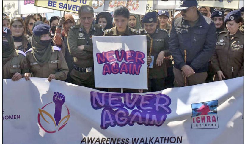
LAHORE: The brave Superintendent of Police (SP) Syeda Sheherbano Naqvi heading a walk in liberty Chowk organized by Punjab Police.