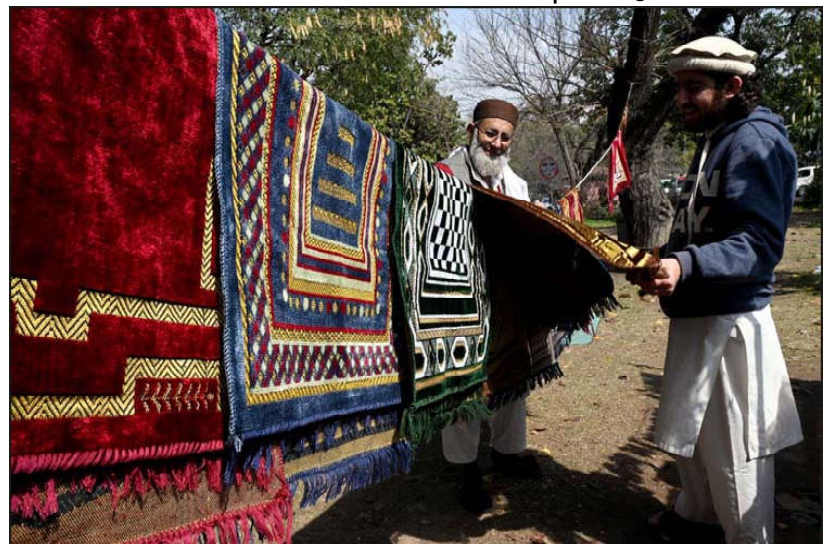
ISLAMABAD: A vendor displaying and selling Prayer mats to attract customers at Aabpara in the Federal Capital.

Ghakkhar and Okara grid stations. At the Ghakkhar station, a 160 MVA auto-transformer was replaced with a 250 MVA, 220/132 kV unit, while a new 160 MVA 220/132kV auto-transformer (T-3) was installed at the Okara grid station. These efforts have collectively added 570 MVA to the transmission capacity. These projects have been completed under National Transmission Modernization Project (NTMP-I), funded by the World Bank. This augmentation is poised to enhance the grid stations' capacity, catering to the growing demand from regions served by GEPCO, LESCO, PESCO, and FESCO. The increased capacity not only benefits industrial, agricultural, and domestic consumers but also improves the system reliability. The NTDC Managing Director Engr. Dr. Rana Abdul Jabbar Khan appreciated the Project Delivery.