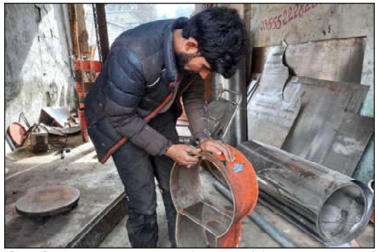
GILGIT: A vendor busy in compiling the parts of traditional fire stove at his workplace.