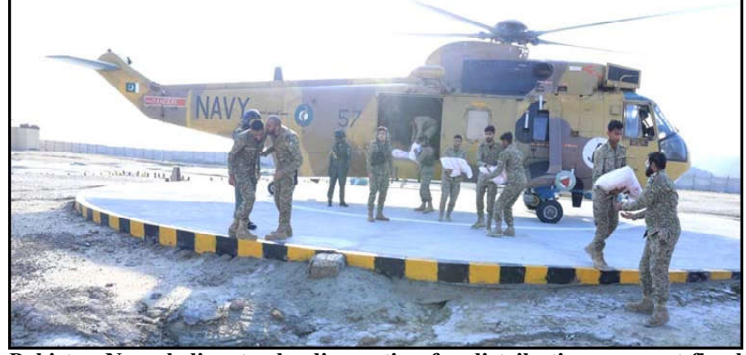
Pakistan Navy helicopter landing ration for distribution amongst flood affected of Gwadar district.