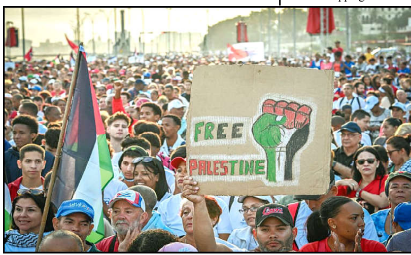
HAVANA: People take part in a demonstration in support of the Palestinians outside the US embassy in Cuba.

Monitoring Desk GAZA STRIP: Israel has “more or less accepted” a proposal for a six-week ceasefire in the Gaza Strip, a US official said on Saturday as Palestinian negotiators were expected in Cairo. Mediators have been scrambling to lock in a truce before Ramadan begins on March 10 or 11. The US official told reporters that “there’s a framework deal” for a ceasefire which “the Israelis have more or less accepted”. A source close to Hamas said a delegation from the group was headed from Qatar to Egypt on Saturday. Meanwhile, Israel’s top ally the United States began air-dropping aid into Gaza on Saturday, as the territory’s health ministry reported more than a dozen child malnutrition deaths. The start of the US relief operation came hours after President Joe Biden, who has pushed Israel to allow more aid in, announced the move and spoke of the “need to do more” after nearly five