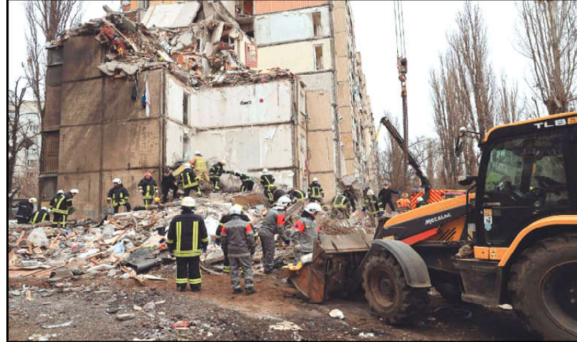
Rescuers work at the site of a heavily damaged apartment building in Odesa, following a Russian drone attack.