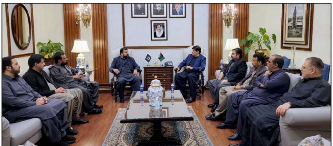
KARACHI: Chief Minister Balochistan Mir Sarfraz Ahmed Bugti meeting Chief Minister Sindh Syed Murad Ali Shah