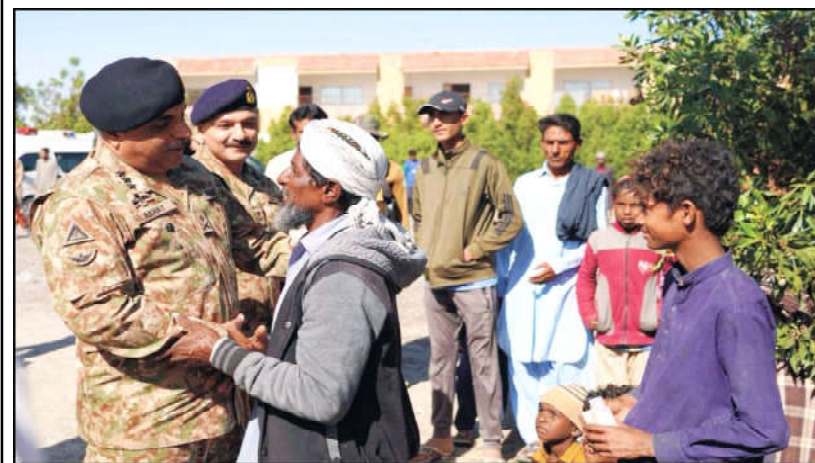
GWADAR: Corps Commander Balochistan Lt. General Rahat Naseem meeting with affectees during his visit to flood affected areas of Gwadar

our first priority is to rescue the affected people, then provide them and their rehabilitation. The Chief Minister mentioned that work is continued to drain out the rain water and restore routine life in the port city. He said that the dewatering process would be completed in Gwadar by Monday (today). He was highly appreciative of the role played by the Pak army, Provincial Disaster