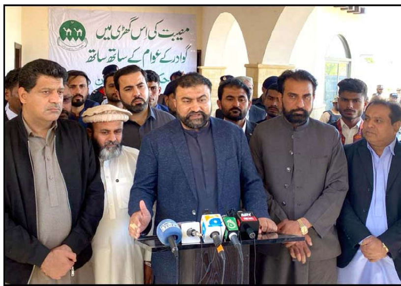
GWADAR: Chief Minister Balochistan Mir Sarfaraz Ahmed Bugti talking with mediamen