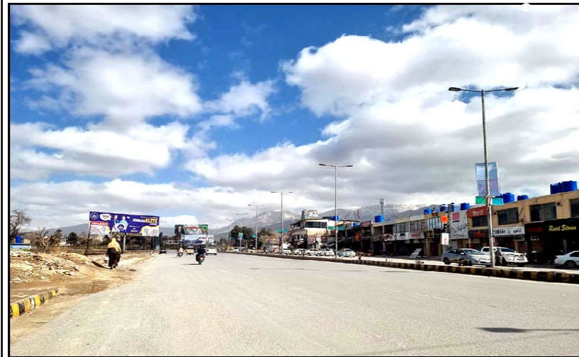
QUETTA: Beautiful eye catching view of dark clouds during cloudy weather of winter season, captured over the horizon of Quetta.