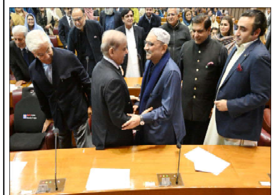
ISLAMABAD: Prime Minister Shahbaz Sharif hand shakes with PPP Leader Asif Ali Zardari after electing prime minister.