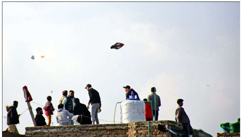
ISLAMABAD: Youth compete to catch abandoned kites jumping roof tops in Kachi Abadi in Sector G-7 during the Basant, kite flying festival.