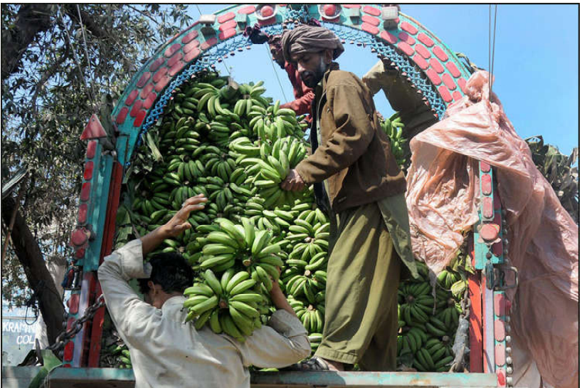
MULTAN: Laborers are busy unloading bunches of bananas from a delivery truck at Fruit market.

The "Algiers Declaration" highlighted several key points, including the sovereign rights of member countries over their natural gas resources, efficient management of natural gas resources to promote sustainable development, and cooperation to ensure balanced and reliable natural gas markets. Member countries expressed their commitment to innovation-led practices and collaboration in enhancing the role of natural gas in improving energy access and reducing energy poverty. They also welcomed the accession of new members, reaffirming the forum's commitment to fostering energy cooperation and dialogue on a global scale.