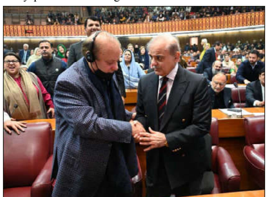
ISLAMABAD: Prime Minister Shabbaz Sharif hand shakes with Leader of Pakistan Muslim League N Mian Muhammad Nawaz Sharif after electing prime minister.

KARACHI (INP): Pakistan Navy continues to extended relief and rescue operations to various small coastal villages of Balochistan affected by recent flash flooding. To expedite rescue and relief operations in flood affected areas of district Gwadar, Pakistan Navy has stationed helicopters there. Pakistan Navy helicopters undertook multiple hops from Gwadar to the flood affected villages of Pishukan and Kappar. Relief teams delivered ration bags, clean drinking water and food items near people stranded in their villages. Moreover, ration and relief goods distribution conducted by Pakistan Navy personnel amongst flood affectees of Gwadar city. In addition, large numbers of medical supplies and ration bags have also been dispatched to different other flood-affected villages through road where land connectivity was restored. Further, in assistance to civil administration, Pakistan Navy troops were wholeheartedly undertaking rescue and relief operations utilizing all available equipment and resources. In this regard, de-flooding operations were being conducted on various localities of Gwadar city to clear flood water. Pakistan Navy was resolutely committed to supporting our flood-affected brethren during this difficult time.