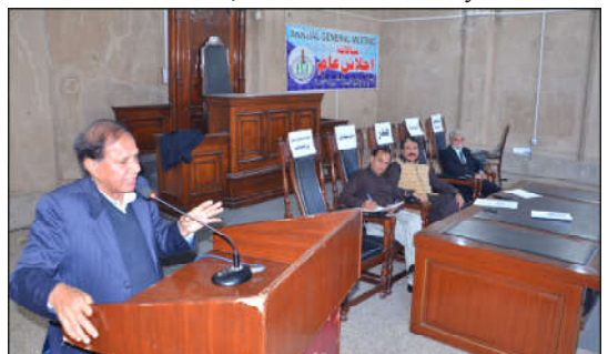
FAISALABAD: A speaker addressing an Annual General meeting of Faisalabad Union of Journalist (FUJ).