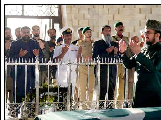
KARACHI: Chief Minister Balochistan Mir Sarfaraz Ahmed Bugti offering Fateha at Mazar-e-Quaid

He expressed hope that the new government of Pakistan will take steps towards the growth and prosperity of Pakistan and prayed to Almighty Allah for the success of the new government and the happiness and well-being of the honorable nation of Pakistan.