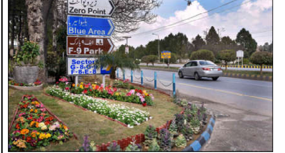
ISLAMABAD: A view of a blossoming and flourishing flowers on greenbelt at H-8 in the Federal Capital.