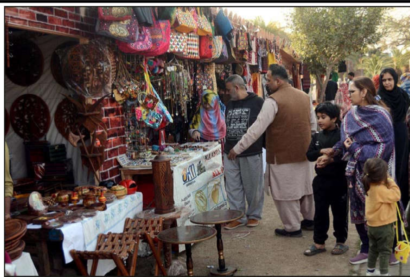
LAHORE: People visiting stalls during Jashan-e-Baharan Festival at Jilani Park organized by PHA.