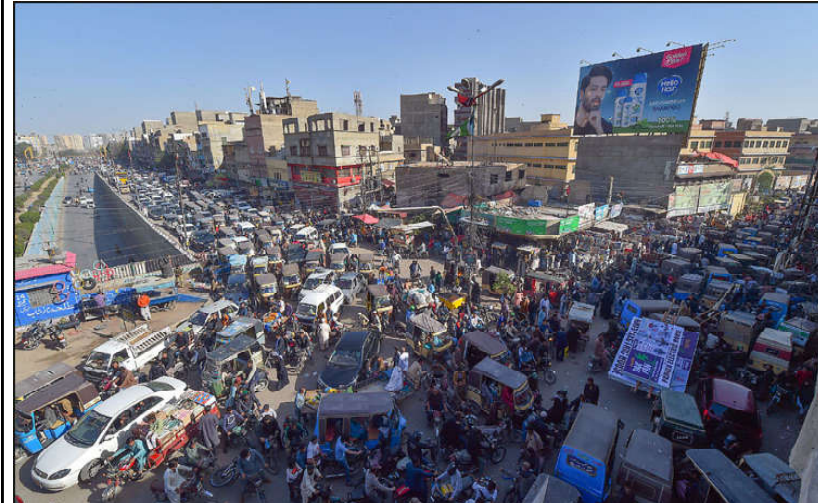
KARACHI: A view of the massive traffic jam at Liaqtabad.