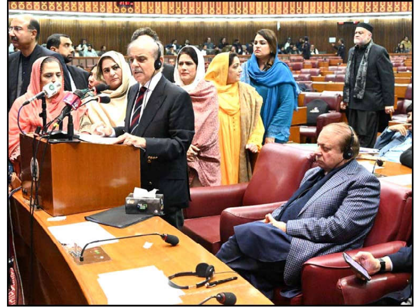
ISLAMABAD: Prime Minister Shahbaz Sharif address in the National Assembly after electing Prime Minister.

gaining 92 votes. "They put our leaders in jail, took our election symbol, rigged the elections, but we kept standing, and we will stand our ground," Omar Ayub Khan told parliament, Sharif, 72, first served as prime minister in 2022 at the head of a strikingly similar alliance which ousted Imran Khan, a former cricket star. Meanwhile Muhammad Shehbaz Sharif, the newly-