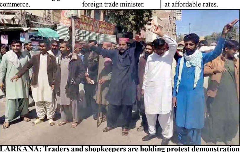
against the high handedness of Market Police Station, held in Larkana.