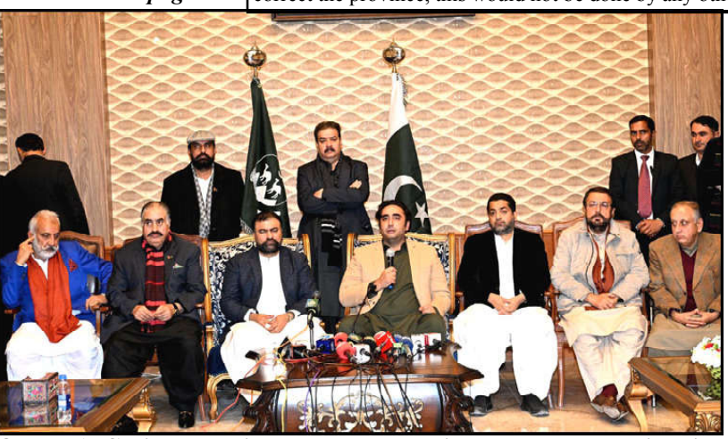
QUETTA: Chairman Pakistan Peoples Party Bilawal Bhutto Zardari talking to media persons during his visit to Quetta. Newly elected Chief Minister Balochistan Mir Sarfraz Bugti is also present on the occasion.