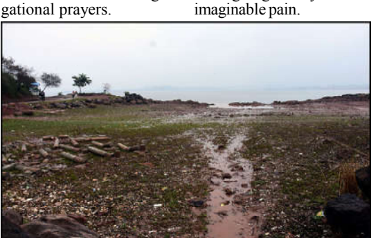
ISLAMABAD: A view of low water level of Rawal Dam after the heavy rains in Federal Capital.

urgent than ever. He said, "Muslims often raise their hands praying for cars, dollars and big houses, when misery and pain has gripped Muslims all over". He said Muslims must organize prayers for the entire community because whether in Gaza or anywhere else, Muslims are