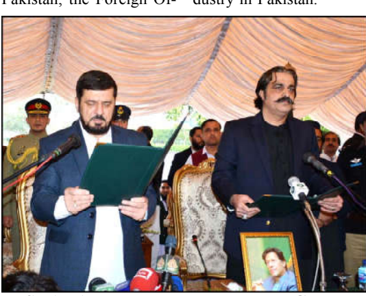
PESHAWAR: Khyber Pakhtunkhawa Governor Haji Ghulam Ali administering Oath from newly elected Chief Minister Khyber Pakhtunkhawa Ali Ameen Khan Gandapur at Governor House.

She said, "This is a simple case of import of a In response to the commercial lathe machine media questions regarding by a Karachi based commer-Indian seizure of commercial entity which supplies parts to the automobile incial equipment destined for Pakistan, the Foreign Of- dustry in Pakistan.