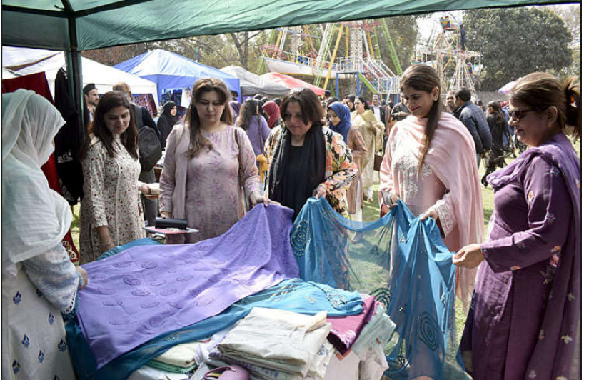
LAHORE: Women are looking handmade traditional cloths on a stall during a ceremony in connection with International Women Day, organized by All Pakistan Women Association, in the Provincial Capital.