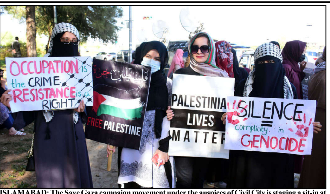
ISLAMABAD: The Save Gaza campaign movement under the auspices of Civil City is staging a sit-in at D Chowk in the Federal Capital on Sunday.