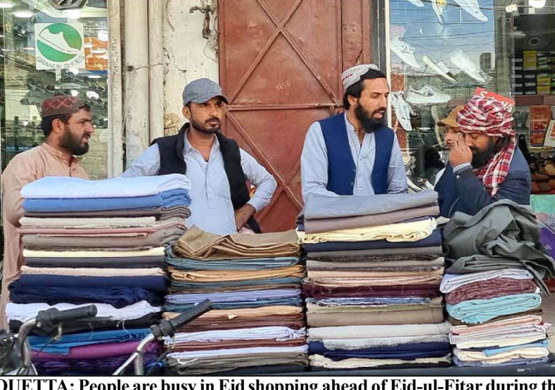
QUETTA: People are busy in Eid shopping ahead of Eid-ul-Fitar during the Holy Month of Ramadan-ul-Mubarak, at Qandhari Bazar in Quetta.

with FBR on the understanding of cross added