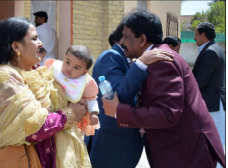
QUETTA: The Christian community member celebrated Easter with religious zest.

Three persons including a woman were injured and a house partially damaged in Peshawar and in Nowshera, three people were injured and several houses were partially damaged, the report said. One woman was killed and three houses were partially damaged in Mansehra and one house in Momand, three in Mardan and two in Waziristan were damaged.