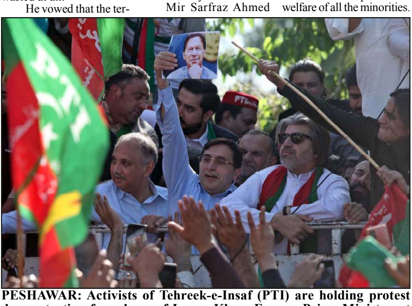
demonstration for release of Imran Khan, Former Prime Minister, at Peshawar press club.

The provincial government also ensures religious freedom and protection to all the minorities including Christian community in the province, he mentioned adding that on this day, we once again reiterates our resolve to work for social development and