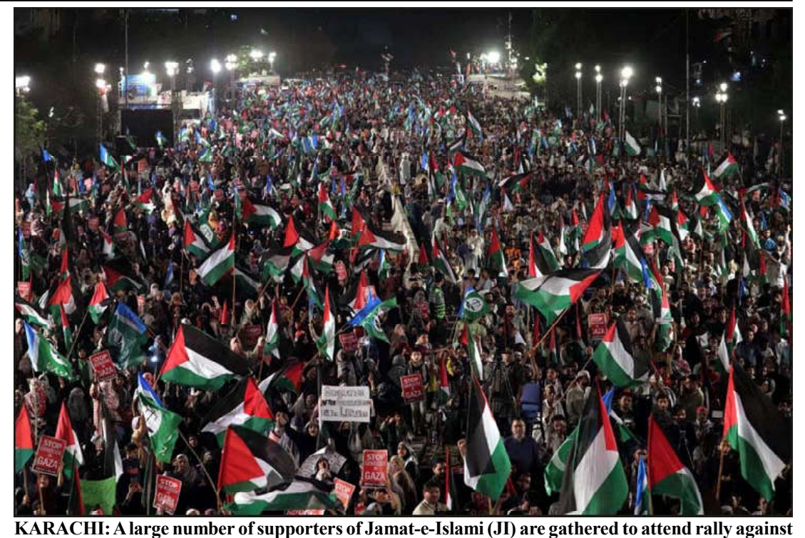
Israeli cruel and inhumane acts and express unity with the innocent people of Palestine, at Shahrah-e-Quaideen in Karachi.

"While we celebrate diversity of faiths as a source of strength and enrichment in our nation, let us join hands towards building a society that is tolerant and cohesive and together defeat the forces of discord that are trying to cause harm to the fabric of our society," PM Office Media Wing, in a press release, quoted the prime minister as saying.