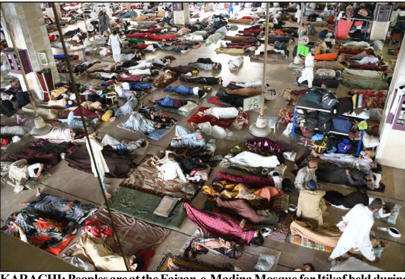
KARACHI: Peoples are at the Faizan-e-Madina Mosque for Itikaf held during the last ten days of fasting month of Ramadan in Provincial Capital.