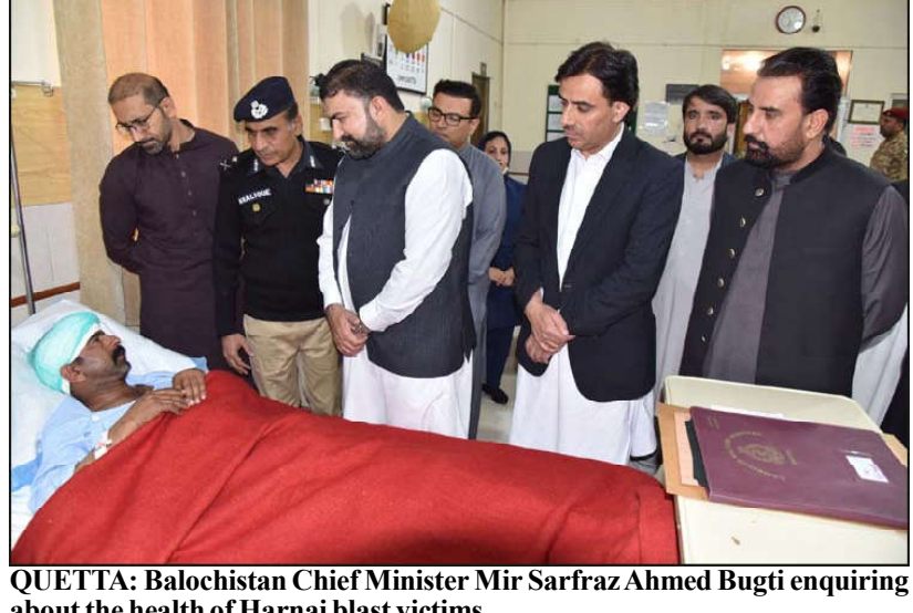
about the health of Harnai blast victims.

Meanwhile. people belonging to Christian community including people exchanged greetings of Easter with each other.