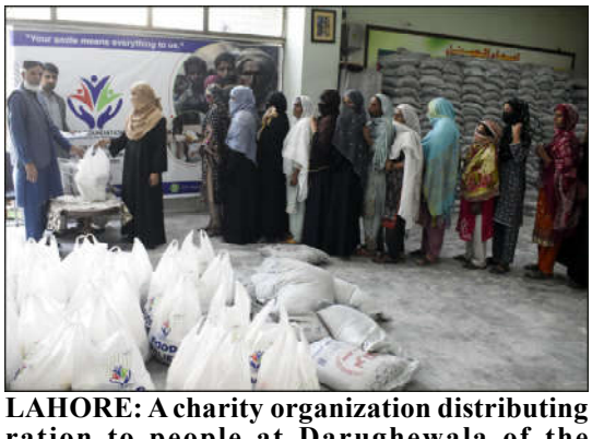
ration to people at Darughewala of the Provincial Capital.

cleaning campaign and move forward. "Punjab's population of more than 127 million creates 57,500 tonnes of waste every day. We are able to dispose of only eighteen thousand 438 tons of garbage. This means that the load of forty-nine thousand tons of waste is increasing every day," he pointed out.