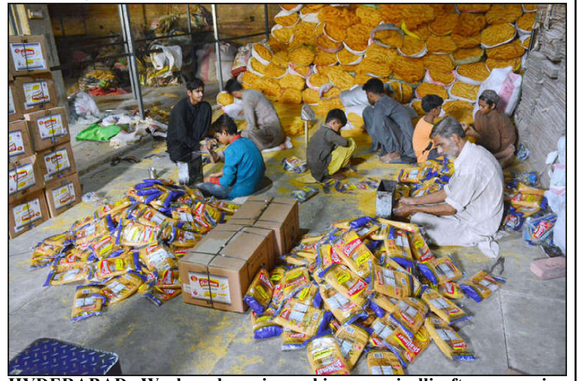
HYDERABAD: Workers busy in packing vermicelli after preparing vermicelli as per increased demand of customers to be used at upcoming Eidul-Fitr festival.