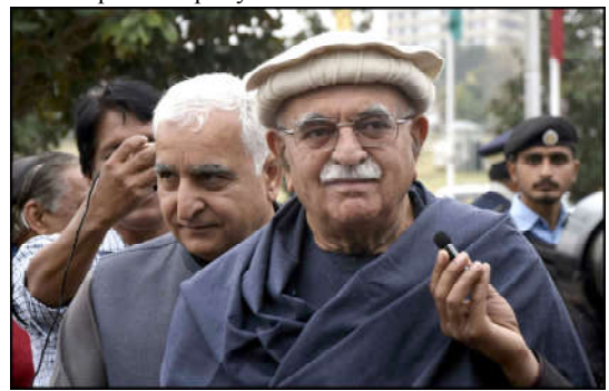
ISLAMABAD: Leader of Pashtunkhwa Milli Awami Party, Mahmood Khan Achakzai, arriving before the start of the inaugural session of the National Assembly, at the parliament house building in the Federal Capital.

ISLAMABAD (INP): MQM Pakistan rejected the offer to be part of the federal cabinet. MQM decided to give Prime Minister vote to PML-N candidate but refused to join the federal cabinet. PML-N had offered federal ministries to MQM at the centre. According to sources, the party wanted support on the constitutional amendment to give financial and administrative autonomy to the local bodies across the country.