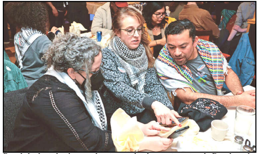
People look at election results at a monitoring centre set up in Dearborn by the Listen to Michigan watch party, a group which asked voters to vote 'uncommitted' instead of voting for President Joe Biden.