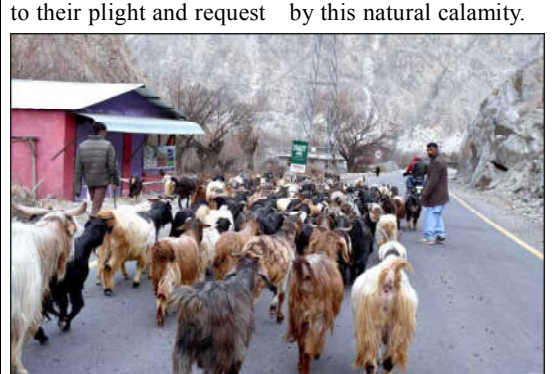
GILGIT: A shepherd guiding herd of goats heading towards grazing field near Nomal area.