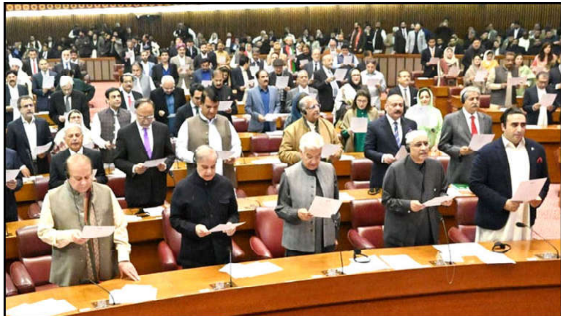
ISLAMABAD: The newly elected members of the National Assembly taking oath of their office during the inaugural session of the 16th National Assembly at the Parliament House.

Ph: 2841470/2841473 REG: No. BC-116 B/ID-445 Vt XXV N 191, Shaban 19, 1445 AH Friday March 01, 2024 Pages 08, Price Rs.15