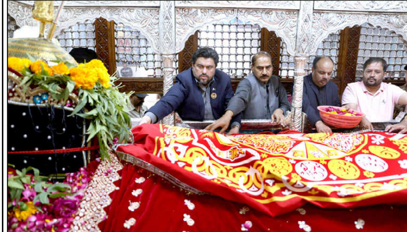
SEHWAN: Governor Sindh Kamran Khan Tessori laying wreath on the grave of Hazrat Lala Shahbaz Qalandar on the occasion of 772nd Urs celebration.