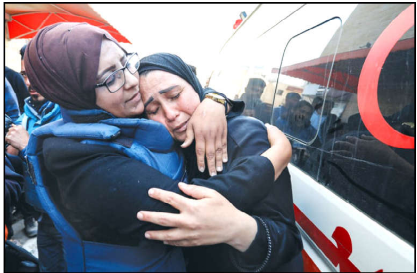
A member of the press consoles a woman outside Al-Aqsa hospital in Deir el-Balah.

Monitoring Desk MOSCOW: President Vladimir Putin told Western countries they risked provoking a nuclear war if they sent troops to fight in Ukraine, warning that Moscow had the weapons to strike targets in the West. The war in Ukraine has triggered the worst crisis in Moscow's relations with the West since the 1962 Cuban Missile Crisis. Putin has previously spoken of the dangers of a direct confrontation between Nato and Russia, but his nuclear warning on Thursday was one of his most explicit. Addressing lawmakers and other members of the country's elite, Putin, 71, repeated his accusation that the West was bent on weakening Russia, and he suggested Western leaders did not understand how dangerous their meddling could be in what he cast as Russia's internal affairs. He prefaced his nuclear warning with a specific reference to an idea, floated by French President Emmanuel Macron on Monday, of European Nato members sending ground troops to Ukraine—a suggestion that was quickly rejected by the United States, Germany, Britain and others. “(Western nations) must realise that we also have weapons that can hit targets on their territory. All this really threatens a conflict with the use of nuclear weapons and the destruction of civilisation. Don't they get that?!” said Putin.