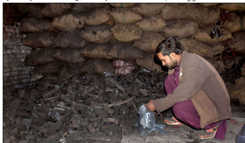
LAHORE: A vendor selling coal sacks as per increased demand in winter season.

Monitoring Desk BERLIN: Inflation in Germany weakened further in February, with the consumer price index (CPI) up an annual 2.5% this month compared to a 2.9% annual rise in January, according to preliminary data released by the Federal Statistical Office on Thursday. Economists expect inflation to fall further over the course of the year. However, the decline could lose pace due to an increase in the price of carbon dioxide, a key industrial ingredient, to €45 per ton from €30 ($33) per ton and a return of the regular value added tax rate on food in restaurants. Higher inflation rates reduce the purchasing power of consumers, resulting in many cutting back on expenditures. According to preliminary figures, household energy and fuel became 2.4% cheaper in February compared to the same month last year. Food cost 0.9%.