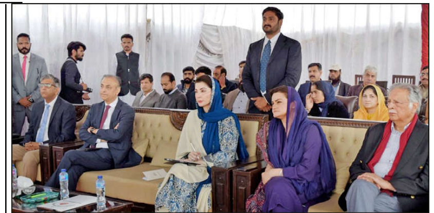
LAHORE: Punjab Chief Minister Maryam Nawaz being briefed about the Rawalpindi Ring Road Project.

PESHAWAR (Online) Khyber Pakhtunkhwa Provincial Disaster Management Authority (PDMA) has issued an alert about rains and snowfall in different parts of the province from today till Sunday. According to PDMA, all Deputy Commissioners have been advised to take precautionary measures to avoid any human and material losses during the forecast period. The control room of PDMA is operational round the clock and people can contact by dialing 1700 in case of any emergency. Sindh Chief Minister Syed Murad Ali Shah has also declared a rain emergency in the province. Chairing a meeting in Karachi today, provincial Chief Minister directed the concerned to remain high alert in wake of heavy rain forecast in the province. It was decided in the meeting that there will be half day duty in all public and private sector educational institutions in Karachi tomorrow.