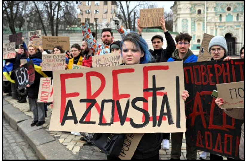
Relatives of the Azovstal defenders and other Ukrainian prisoners of war hold banners as they attend a rally calling for authorities to return their relatives from Russian captivity, on the second anniversary of Russia's invasion of Ukraine, Kyiv.