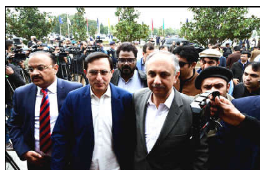
ISLAMABAD: Newly elected Members of National Assembly Omar Ayub Khan and Barrister Gohar Khan arrives to attend 1st session of 16th National Assembly at Parliament House.