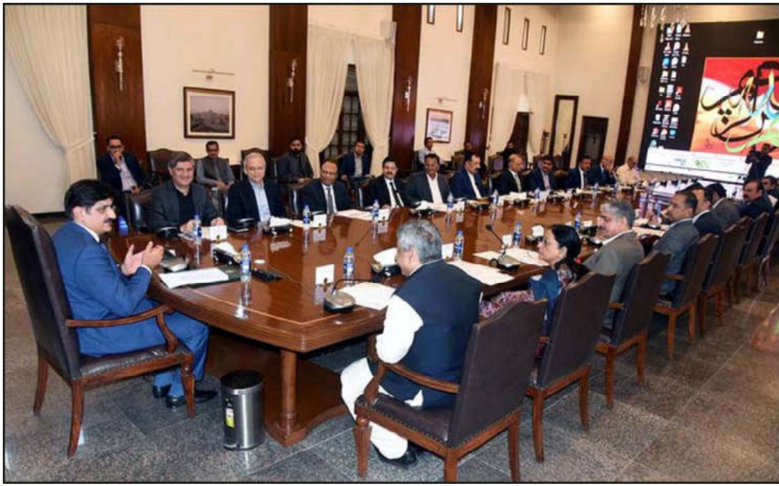
KARACHI: Sindh Chief Minister, Syed Murad Ali Shah presides over a meeting to review the progress of the projects launched for the rehabilitation of flood-affected infrastructure in the province, held at CM House in Karachi.