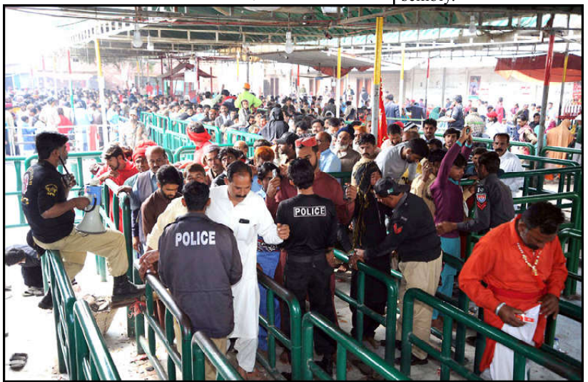
SEHWAN: Devotees arriving to attend annual Urs of Hazrat Lal Shahbaz Qalandar, at shrine of Sufi saint Hazrat Lal Shahbaz Qalandar, at Sehwan Sharif.