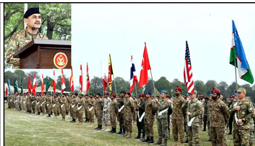
Chief of the Army Staff, General Syed Asim Munir addressing the closing ceremony of the Seventh Pakistan Army Team Spirit Exercise-2024 at Kharian.