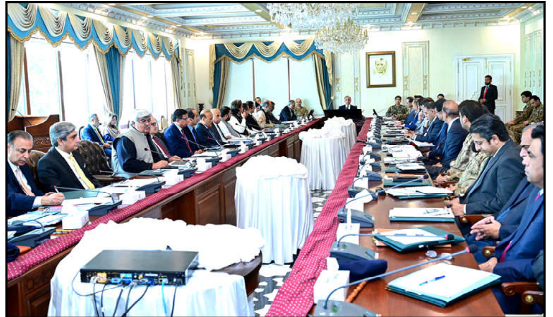
ISLAMABAD: Prime Minister Muhammad Shehbaz Sharif chairs a meeting on measures against the spectrum of illegal activities.

He also assured to continue support for Pakistan's endeavors in sustainable agriculture, water management, and recovery efforts following the devastating 2022 floods.