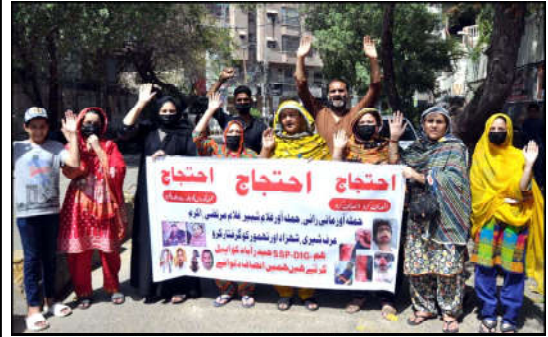
HYDERABAD: Residents of Khai road are holding protest demonstration for acceptance of their demands, at Hyderabad press club.

to the Supreme Judicial Council (SJC). In the missive, the judges revealed the coercive tactics employed by intelligence agencies to influence judges—revelations that sent shockwaves across the legal and political landscape. Addressing a press conference in Islamabad, PTI Spokesperson Raouf Hasan, along with other members of the party's legal team, emphasised the significance of the letter from six judges.