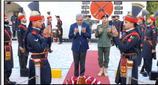
PESHAWAR: Federal Minister for Interior Mohsin Naqvi offering Dua at the Martyrs Monument during his visit to Frontier Constabulary Headquarters.