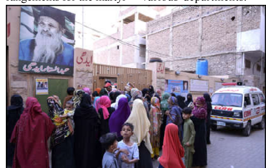
HYDERABAD: Edhi volunteers distribute Eid gift to deserving family at Edhi center.

dom anniversary of Hazrat Ali (R.A) which is to be observed on the 21 st of Ramadan. The meeting was attended by ADC-I, ADC-II, Assistant Commissioner Larkana, Officers of District Police Larkana, officials of Shahbaz Rangers, the Ulema various schools of thought, Municipal Commissioner and officers of various departments.