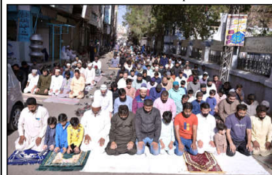
HYDERABAD: A large number of people offering Namaz-e-Juma (Friday Prayer) at Homestead Hall Road during the holy month of Ramadan.