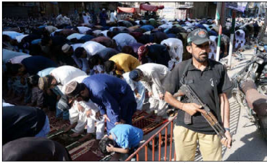
HYDERABAD: A large number of people offering Namaz-e-Jumma at Jamia Masjid city during Holy Fasting Month of Ramzan ul Mubarak