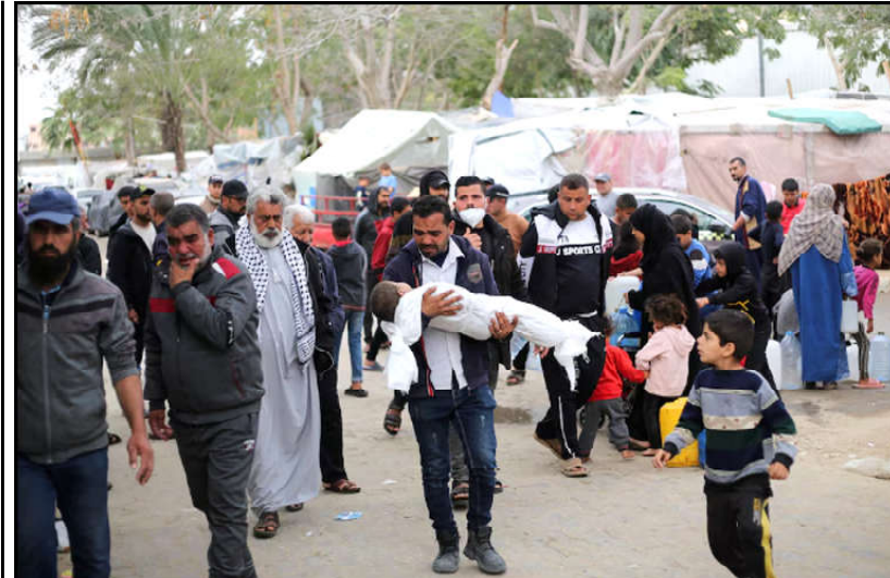
A mourner carries the body of a Palestinian child killed in an Israeli strike, amid the ongoing conflict between Israel and Hamas, in Khan Younis in the southern Gaza Strip.

"India and Ukraine have been traditional friends, but I think there is much more that we can do and should do, not only in the interests of our nations, but also in the interest of global development and security architecture," Kuleba said Friday. "We will be looking forward to restoring what had existed before the large scale invasion of Russia in Ukraine began."