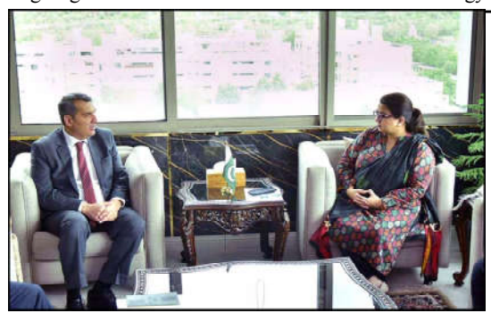
ISLAMABAD: Ambassador of Azerbaijan to Pakistan Khazar Farhadov calls on Minister of State for IT and Telecommunication Ms. Shaza Fatima Khawaja.

The Minister stressed the importance of broadening the tax net to include under-taxed and untaxed sectors, particularly service providers, and addressed the critical issue of energy theft, advocating for streamlined governance and eventual privatization of power distribution companies.