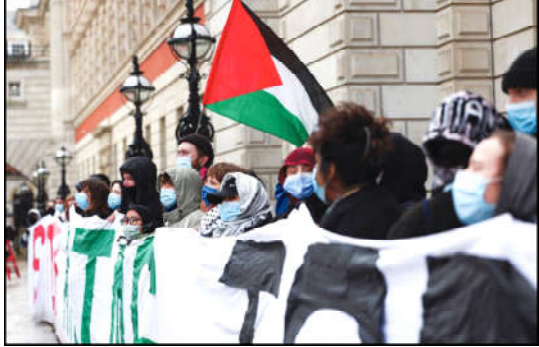
LONDON: Demonstrators protest outside the Department for Business and Trade in support of Palestinians.

Indian foreign minister Subrahmanyam Jaishankar said in a post on the social media platform X that he and Dmytro Kuleba discussed "the ongoing conflict and its wider ramifications," and said the two would work together to boost relations between their countries.