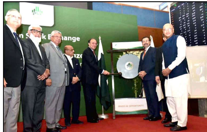
KARACHI: Federal Minister for Finance & Revenue, Muhammad Aurangzeb kickstarts business activity at the Pakistan Stock Exchange Gong Ceremony in Karachi as the Chief Guest, ringing the bell to symbolize the commencement of trading.