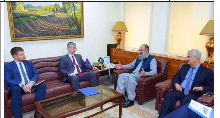
ISLAMABAD: Russian Ambassador to Pakistan, Albert Khorev, engages in discussions with Federal Minister for Commerce, Jam Kamal Khan, aiming to enhance trade connectivity and tap into the true potential of bilateral trade.

The minister said that Pakistan's IT professionals can serve as the premier choice for international companies and urged P@SHA to assist in bridging the demand-supply gap of IT professionals.