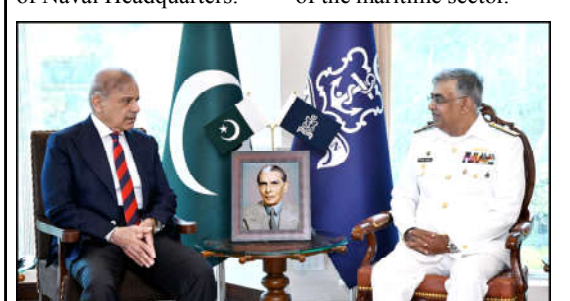
ISLAMABAD: Prime Minister of Pakistan, Muhammad Shehbaz Sharif exchanging views with Chief of the Naval Staff, Admiral Naveed Ashraf at Naval Headquarters.

He was also apprised of the measures to benefit from economic prospects of the maritime sector.