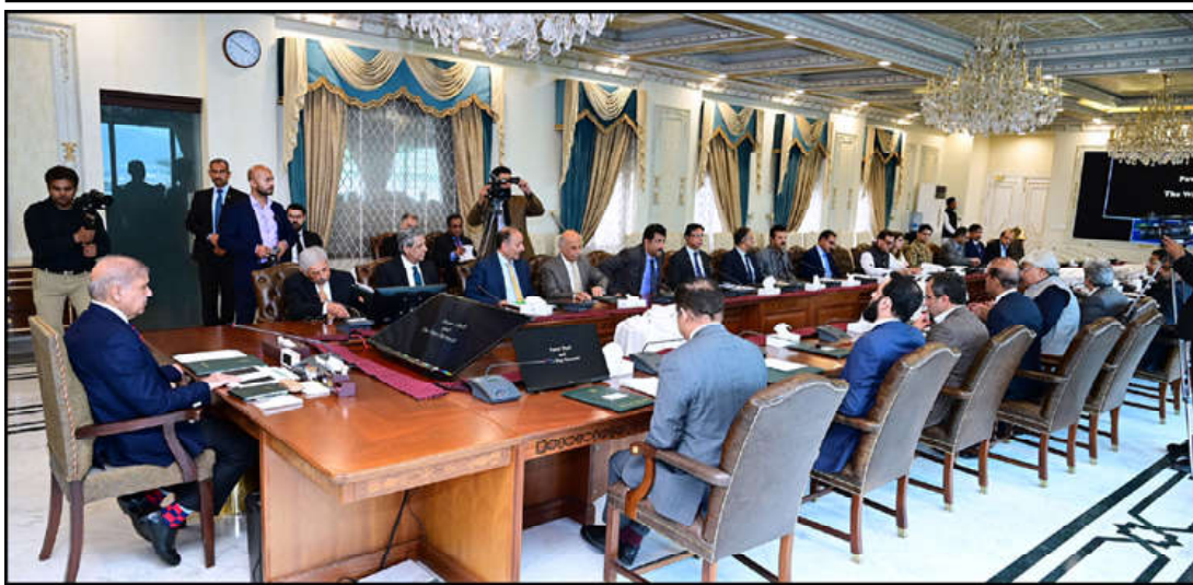
ISLAMABAD: Prime Minister Muhammad Shehbaz Sharif chairs a meeting on Anti-Power theft campaign.

ISLAMABAD (APP): Prime Minister Shehbaz Sharif Thursday chaired a high level meeting on stoppage of electricity theft and directed that immediate disciplinary action should be initiated against the officers and exemplary punishment should be given to them for abetting the crime and causing loss of billions of dollars. He said it was their responsibility to create a stable system by taking measures like launching a