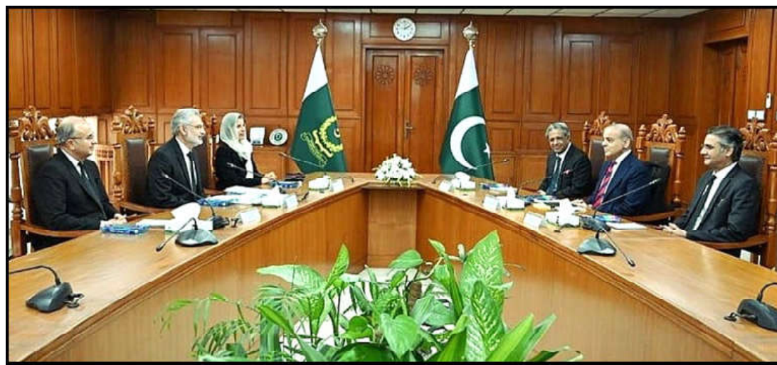
ISLAMABAD: Prime Minister Muhammad Shahbaz Sharif meeting with Chief Justice of Pakistan Justice Qazi Faez Issa.

The Sindh government has fixed wheat procurement target of 900,000 metric tons for crop season 2023-24 at a support price of Rs4000 per 40 kg.