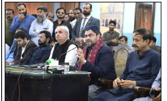
HYDERABAD: Governor Sindh Kamran Tessori addressing to media persons at press club.

He further stated that along with basic courses, the IT University will offer courses in Artificial Intelligence and upon completion, the qualified youth will be eligible to earn up to hundreds of thousands of rupees. He expressed confidence that those completing the courses can earn a monthly income up to 1.5 to 2 million rupees.