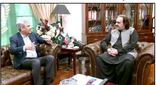
PESHAWAR: Federal Minister for Interior Mohsin Naqvi in a meeting with Chief Minister Khyber Pakhtunkhwa Ali Amin Khan Gandapur.