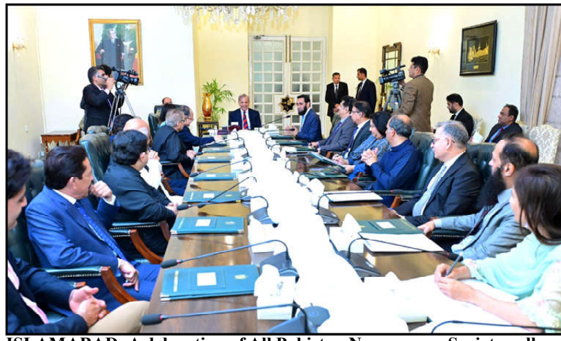
ISLAMABAD: A delegation of All Pakistan Newspapers Society calls on Prime Minister Muhammad Shehbaz Sharif.

"We hope that the journalist community will continue to play its role in the stability of democracy through responsible and impartial reporting."