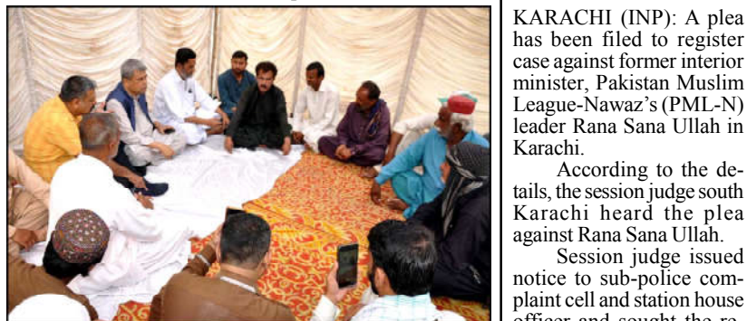
HYDERABAD: Members of HDA Mazdoor Union are holding protest demonstration against non-payment of their salaries, at Tulsi Das Pumping Station in Hyderabad.

He instructed the officials of the roads department to complete the development work on various roads in Larkana district immediately. He ordered the officials of the building department to provide neat and clean washroom. The officials of the public health department were given the responsibility of clean drinking water. He directed the officials of the health department to set up medical camps on the roads. He directed hospitals, basic health units and dispensaries to remain open twenty four hours. He also directed the Sukkur Electric Power Company (SEPCO) to ensure supply the electricity. Officials of all various departments participated in the meeting and assured the commissioner of their full cooperation.