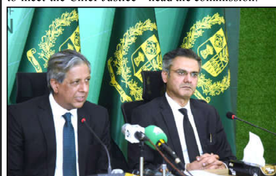
ISLAMABAD: Federal Minister for Law and Justice, Azam Nazeer Tarar and Attorney General of Pakistan, Mansoor Usman Awan, address an important press conference.

The minister said that the Prime Minister had said that he would go to meet the Chief Justice