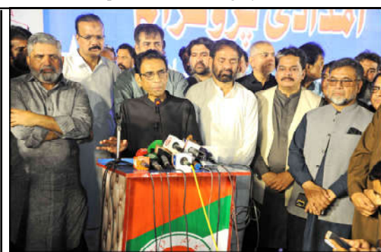
HYDERABAD: Federal Minister for Education and Professional Training Khalid Maqbool Siddiqui addressing during Rashan bags distribution by Khidmat-e-Khalak Foundation at KKF hospital.

According to the notification, all government offices, Autonomous bodies, Semi-Autonomous bodies, Corporations and Local Councils under the administrative control of the Sindh government, except essential services, will remain closed across the province on April 4, 2024.