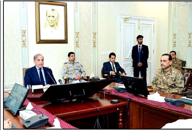
ISLAMABAD: Prime Minister Muhammad Shehbaz Sharif chairs a high level security meeting.

The participants expressed serious concerns over sanctuaries available to terrorists across the borders and emphasized upon the need for a regional approach for countering terrorism.