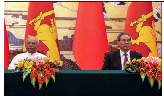
Sri Lanka's Prime Minister Dinesh Gunawardena and China's Premier Li Qiang during bilateral talks in Beijing.

helped prepare radicals at an unidentified location in the Middle East. When asked by Russian reporters if Ukraine and its allies, the United States and Britain, were involved in the attack on the concert hall, Bortnikov said: "We think that's the case. In any case, we are now talking about the texture that we have. This is general information." Bortnikov, 72, who has served as head of the FSB since 2008, said Russia had yet to identify those who specifically ordered the deadliest attack inside Russia for two decades, but said that retaliatory measures would be taken. He offered no specific evidence for the claims, which hardliners in Moscow could use to justify an escalation of the war in Ukraine and to explain how Russian security services failed to prevent the attack.