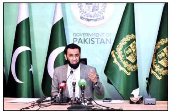
ISLAMABAD: Federal Minister for Information and Broadcasting, Attallah Tarar addressing a press conference.

consensus that an integrated strategy should be adopted to wipe out terrorism from this country. "A message of unity was given to the nation today that all units are on the same page with the Federation", he informed the media. All were on the same page on the integrity and national interest of Pakistan, he said adding, "We know how to defend ourselves and our old friends". He disclosed that regarding the investigation of the incident, there was also a consultation on the establishment of Joint Investigation Team. The minister said that morale of all participants was high in the meeting and they had a unity of thought on tackling the issue. He recalled that in 2018, the Pakistan Muslim League-N had left a peaceful Pakistan free from terrorism. He said yesterday's incident in Bisham resulted in loss of six precious lives including Chinese citizens.