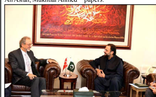
ISLAMABAD: Turkish Ambassador H.E. Dr. Mehmet Paçaycı called on Federal Minister for Overseas Pakistanis and Human Resource Development Chaudhry Salik Hussain.