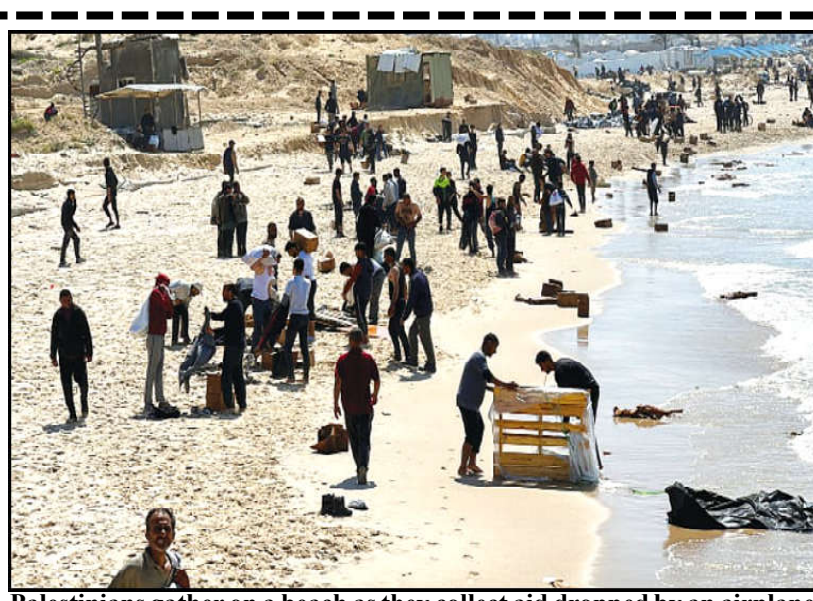
Palestinians gather on a beach as they collect aid dropped by an airplane, amid the ongoing Israeli bombardment of the northern Gaza Strip.

agency Unicef in Gaza, described seeing "paper thin" children in a hospital in northern Gaza and incubators full of underweight babies from malnourished mothers. "Tens of thousands of people crowd the streets," he told the same briefing, describing his latest visit to the north on Monday. "They make that universal signal of hand to mouth desperately asking and seeking for food." Life-saving aid is being obstructed. Lives are being lost. I saw children whose malnutrition state was so severe, skeletal," he said. Other aid agencies also deliver food parcels to northern Gaza, although UNRWA is the biggest provider.