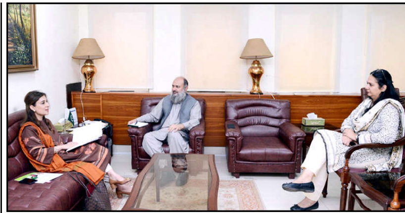
ISLAMABAD: NCRC Chairperson collaborates with Federal Minister for Commerce, Jam Kamal Khan to elevate child rights agenda and boost Pakistan's Global Image.

reaffirmed its support to global efforts for immediate ceasefire. About the holy month of Ramadan, he said that this month signified more than fasting and gave a message of sacrifice, discipline and warm hospitality, respect for all and embodied a spirit of compassion. He said besides, the month gave a powerful message of harmony, peace and tolerance, adding these qualities were required most in a world grappled with diverse challenges and divides. The prime minister said that they should make endeavours to spread the shared message of peace and equality and work collectively for 'an equitable and peaceful world order'. Earlier, speaking on the occasion, Foreign Minister Ishaq Dar said that the month of Ramadan was of special religious and social significance as it provided time for reflection, compassion and unity, showing unity among diverse cultures.