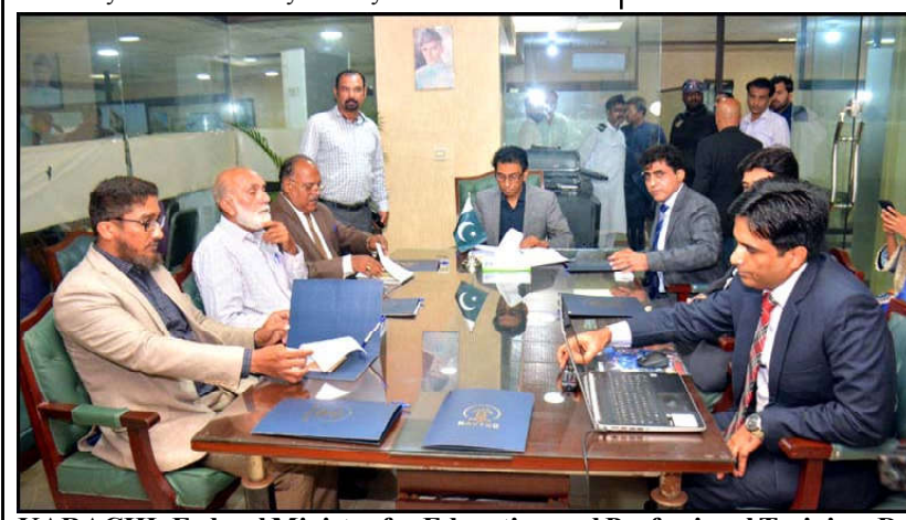
KARACHI: Federal Minister for Education and Professional Training, Dr. Khalid Maqbool Siddiqui is being briefed by the NAVTTC Regional Office Officials during his visit, in Karachi.

"A first information report (FIR) should be registered against the people involved in establishing illegally charged parking spots," he added.