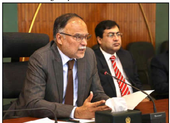
ISLAMABAD: Federal Minister for Planning, Development & Special Initiatives, Professor Ahsan Iqbal chairs the first Steering Committee meeting to implement 5Es development framework.

Bar associations of Sindh, Lahore, Islamabad and Khyber Pakhtunkhwa as well as senior lawyers condemned the alleged interference, urging the top judge to look into the matter.