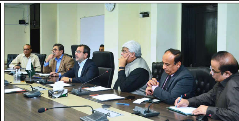
ISLAMABAD: Federal Minister for Power, Sardar Awais Ahmad Khan Leghari addresses the CEOs and Chairmen of DISCOS via video link.

He mandated the management of Distribution Companies (Discos) to maintain up-to-date financial records diligently and compile detailed information regarding the company's assets.