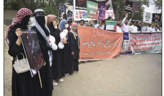
LAHORE: Members of civil society are protesting against Israel's aggression on Palestine.

donors and implementing partners with the Health Department would be convened soon to discuss future reforms in health and ongoing changes within the department. He emphasized that the doors of his office were always open for donors and partners. The delegation briefed the minister about ongoing projects in the province under UNICEF's cooperation. They briefed him about the support provided to the Health Department so far. It was informed that UNICEF is currently running two major health and nutrition programs in Khyber Pakhtunkhwa.