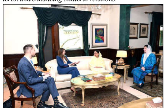
KARACHI: First Lady Aseefa Bhutto Zardari and Peoples Party (PPP Women Wing) Central President, Faryal Talpur exchanges views with British High Commissioner to Pakistan, Jane Marriott during meeting held at Bilawal House in Karachi.