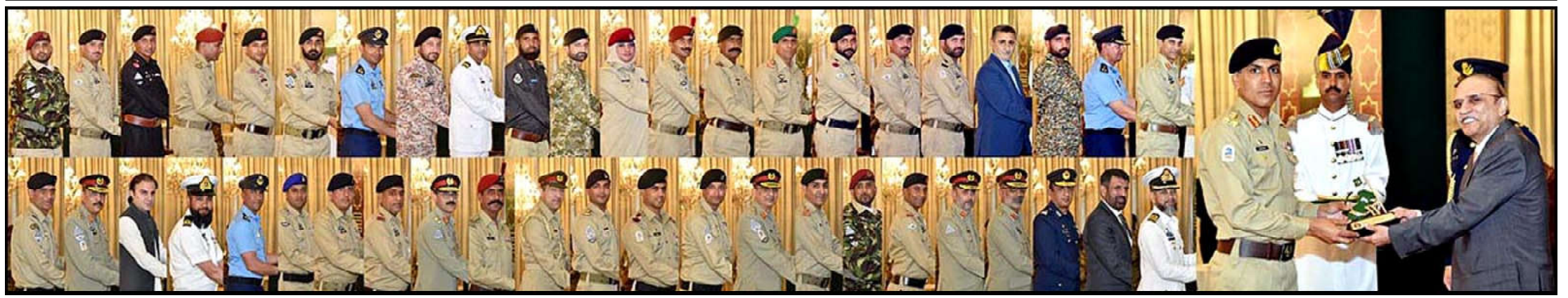
ISLAMABAD: President Asif Ali Zardari distributing commendation shields among military and civil officers who successfully organized Pakistan Day Parade, in a shield distribution ceremony held at, Aiwan-i-Sadr.