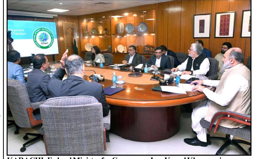
KARACHI: Federal Minister for Commerce, Jam Kamal Khan receives warm reception at TDAP, engages in discussions on promotional activities and exhibition schedules.

LAHORE (APP): Punjab Chief Minister Maryam Nawaz Sharif in a meeting with Federal Finance Minister Muhammad Aurangzeb discussed the country's economic challenges and vowed to pull Pakistan out of economic crisis through joint efforts. "Pakistan is a peaceful country that believes in dialogue for cooperation and understanding," he expressed while addressing the 148th IPU Assembly in Geneva on "Parliamentary diplomacy: building bridges for peace and understanding". The Speaker said that fostering bilateral and joint partnerships through the Parliamentary Friendship Groups among parliaments of the world would strengthen the parliament-to-parliament contacts, said a press release issued here Monday. While appreciating the IPU's efforts for peace and understanding across the globe, he has said the world is witnessing death and destruction in Gaza at an unimaginable scale as over 30,000 civilians have been killed, most of whom are women and children. He expressed his resolve that Pakistan would continue to raise grave concerns at the situation in Gaza where heart-rending images of death and destruction from Gaza are emerging. Ayaz Sadiq also said that Israel's actions violated all international humanitarian and human rights law deliberately attacking civilian targets and as such, constituted war crimes and crimes against humanity.