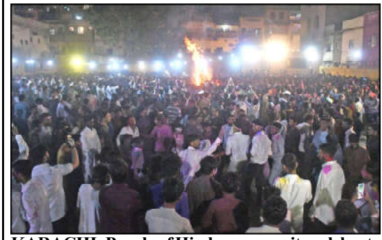
KARACHI: People of Hindu community celebrate Holi festival at a temple in the Provincial Capital.