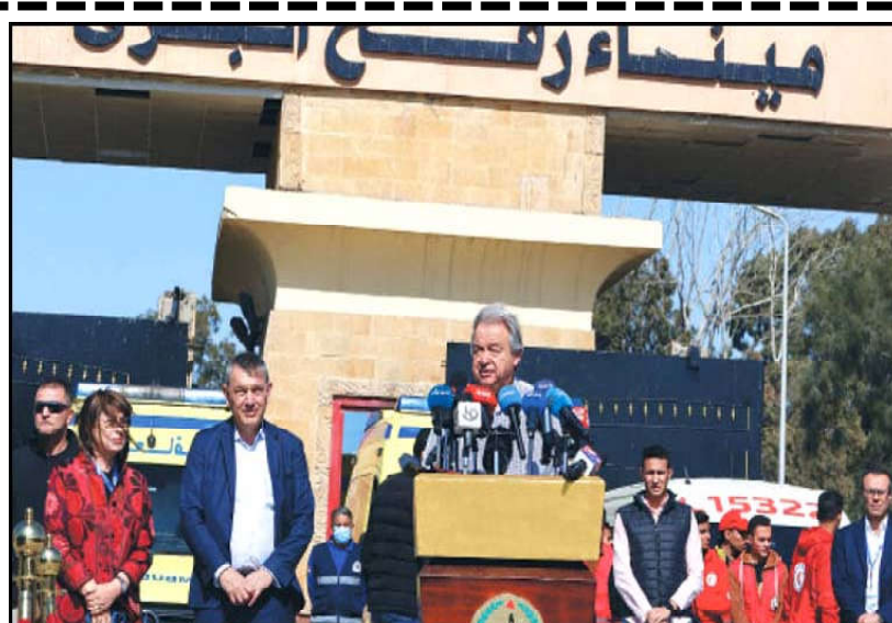
United Nations Secretary General Antonio Guterres talks to the media during a visit to the Rafah border crossing.