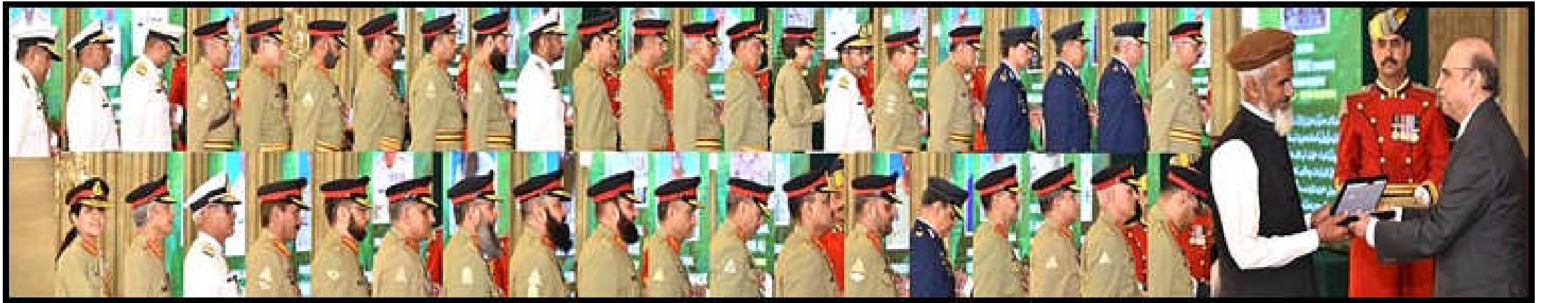
ISLAMABAD: President Asif Ali Zardari conferring the insignias of Hilal-i-Imtiaz (Military) upon officers of the Pakistan Armed Forces, at Aiwan-e-Sadr.

Ph: 0300-3898091 Vol: 06. No. 62 Ramazan 14, 1445 AH Monday March 25, 2024 Pages 04 Price Rs. 12.00