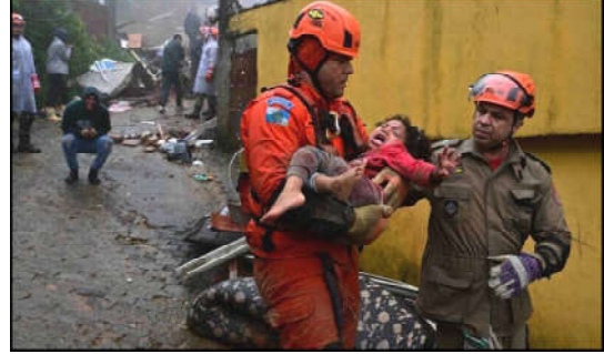
Members of the Civil Defense carry a girl, who remained more than 12 hours under the rubble of her house, which was destroyed by the heavy rains in Petropolis, Brazil.

were killed when camouflaged gunmen stormed the Crocus City Hall, in Moscow's northern suburb of Krasnogorsk, and then set fire to the building on Friday evening. The Islamic State group wrote on Telegram on Saturday that the attack was "carried out by four IS fighters armed with machine guns, a pistol, knives and firebombs," as part of "the raging war" with "countries fighting Islam". It is the deadliest attack in Russia for almost two decades. Russian officials expect the death toll to rise further, with more than 100 wounded in hospital. Russia's Investigative Committee, which probes major crimes, said rescue workers were still pulling bodies from the burnt-out building on Saturday.