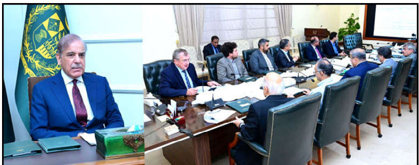
LAHORE: Prime Minister Muhammad Shehbaz Sharif chairs a meeting on Mines and Minerals of Balochistan with special context to Reko Diq Project.

Wherever new roads were being constructed, the pace of construction should be increased, he remarked.