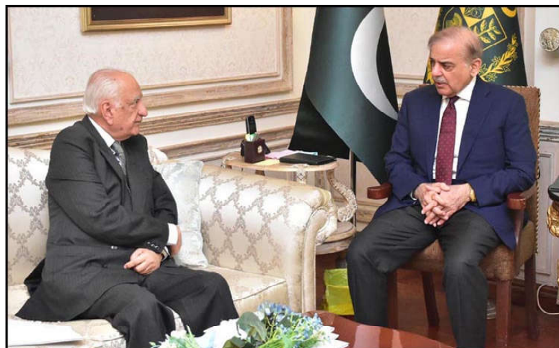
LAHORE: Former Governor of Punjab Mr. Shahid Hamid calls on Prime Minister Muhammad Shehbaz Sharif.

on a priority basis with sustainable solutions, assured Ali Amin Gandapur. The chief minister also emphasized the need to overhaul the city's sanitation system by shifting it underground. In order to enhance public services, in all autonomous institutions, the provincial government will appoint hardworking and professional individuals based on merit, CM reiterated. He made it clear that no political recommendations would be entertained in this process. He said that local governments will be empowered and strengthened to ensure that public issues are resolved at the grassroots level.