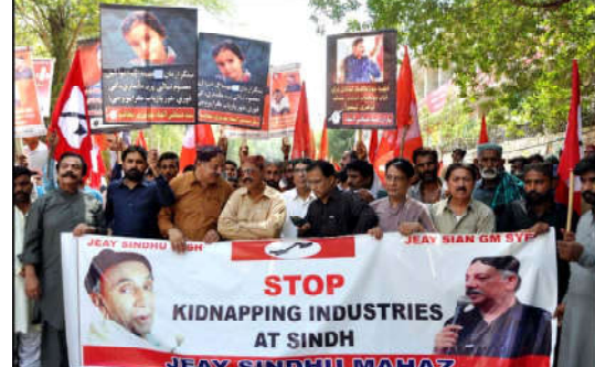
HYDERABAD: Members of Jeay Sindh Mahaz are holding protest demonstration for acceptance of their demands, held at Hyderabad press club.