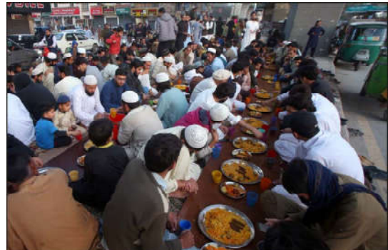
PESHAWAR: Faithful Muslims are breaking the fast (Iftar) under the supervision of charitable organization during the Holy month of Ramadan-Mubarak, at Stadium Chowk in Peshawar.

said that in addition to the new RCC drains in the sewage project in Daska of PCP, rehabilitation of 31,507 feet of old drains, 282 feet of drain culvert, remodeling of 4,739 feet of drains and de-silting of 36,000 feet of old drains of Municipal Committee Daska are also part of this project. He said that it is the responsibility of the Engineering Wing of Municipal Committee Daska to complete the project within the stipulated time and ensure quality. He said that delay in the completion of development projects will not be tolerated and projects of public welfare will be completed within the stipulated timeline.