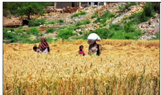
HYDERABAD: Wheat crop is ready for harvesting at Latifabad.