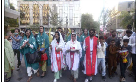
KARACHI: Members of Christian community participate in Palm Sunday procession held at Karachi press club.

LAHORE (APP): Minister of State for Information Technology Shaza Fatima has said that provision of maximum facilities to people is top priority of the government. She said this while visiting a Utility Store in Green Town as per the direction of Prime Minister Shehbaz Sharif here on Sunday. She said that government wanted to improve the system of utility stores. Punjab Chief Minister Maryam Nawaz had started Ramadan Nigehban package to facilitate deserving people in Punjab during the holy month of Ramadan, she said and appreciated the initiative. Shaza said that PM Shehbaz Sharif was working hard to control inflation, adding that no doubt country was facing economic challenges but soon with the grace of the Allah Almighty these challenges would be overcome. The state minister said that being a nation, it was a responsibility of the government to steer the country out of economic crises. To a question, she said that some complaints had been received regarding registration at utility stores, adding that "we are in touch with the Punjab government and complaints related to registration would be solved soon".