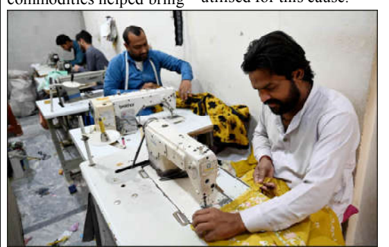
ISLAMABAD: Tailors busy stitching clothes for upcoming Eid ul Fitr festival.