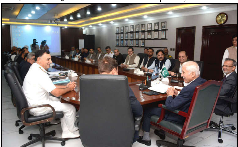
KARACHI: Federal Minister for Maritime Affairs Qaiser Ahmed Shaikh being briefed about the Port Qasim Authority (PQA) functions in a meeting.

As many as 95 million people are still below poverty line here in our country, he deplored. The minister informed the audience about the industrial zones being charted out in PQA where multinational companies can establish world class Industries.