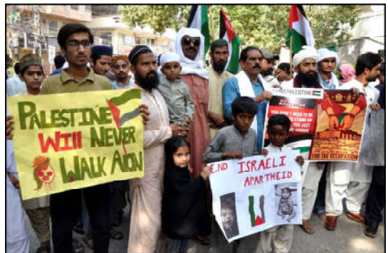
HYDERABAD: Residents of Kali Mori are holding protest demonstration against Israeli cruel and inhumane acts and express unity with the innocent people of Palestine, at Hyderabad press club.

About internal differences in the party, he PTI has 5 franchises today. He the statements of their own people were contradictory to each other. He said that the politics of lies should end now. The PPP leader said that political parties having reservations about the election, should go to the right forum.