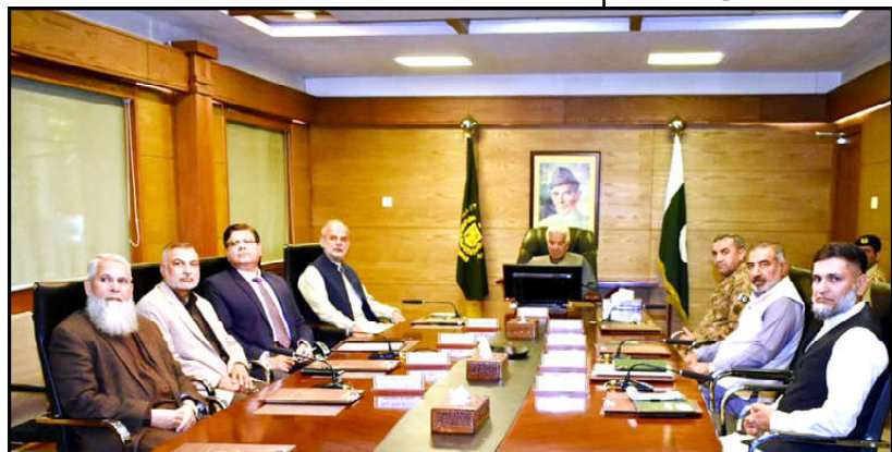
ISLAMABAD: Federal Minister for Defence Production, Khawaja Muhammad Asif chairs an introductory meeting on arrival in Ministry of Defence Production.