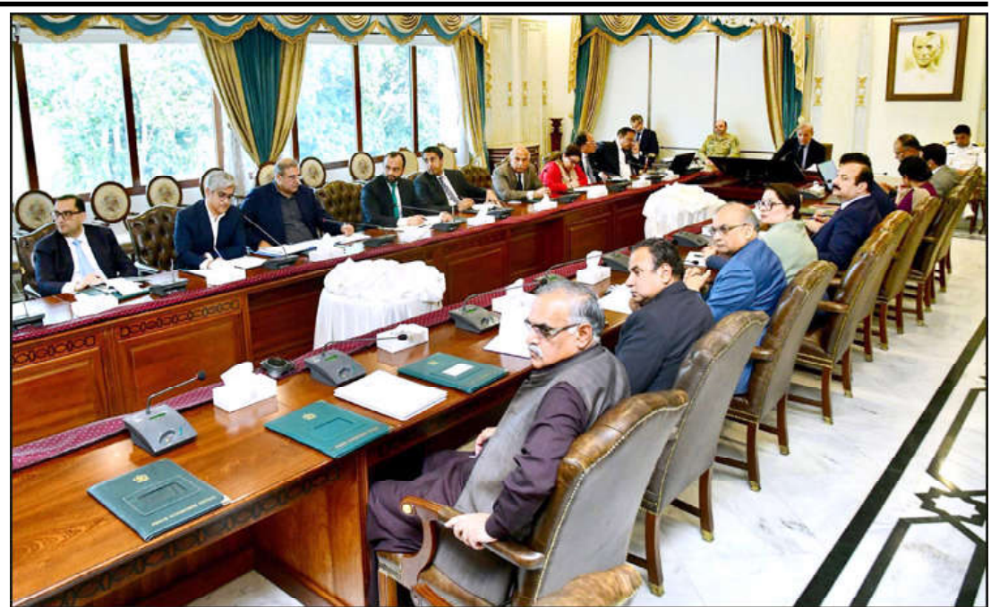
ISLAMABAD: Prime Minister Muhammad Shehbaz Sharif chairs a meeting regarding reforms in Pakistan's IT sector.

According to report, Aurangzeb said Pakistan will seek a new loan program from the IMF of at least three years. Further details will be discussed after the Washington-based lender's annual spring meetings, he said.