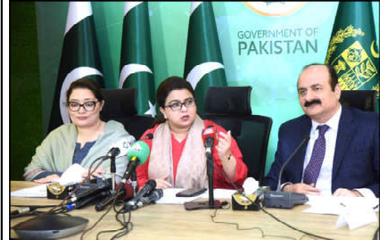
ISLAMABAD: Minister of State for IT and Telecommunication Shaza Fatima Khawaja addressing joint Press Conference.

The Commissioner Shaheed Benazirabad division Syed Muhammad Sajjad Haider informed the meeting that market visits were being conducted across all districts of the division to assess the prices of essential food items. So far, fines totaling Rs. 2,76,900 have been imposed on 261 profiteers, and three hotels have also been sealed.