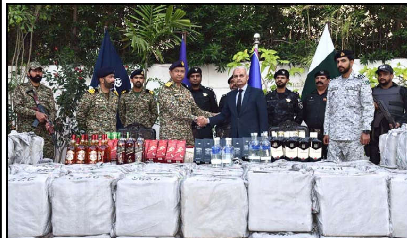
KARACHI: Pakistan Navy, officials handing over seized liquor worth PKR 145.6 million to Pakistan Customs.

The Prime Minister also appreciated the signing of Financial Agreements, early today, between SFD and the Government of Pakistan worth US$ 107 million for construction of Hydropower stations in AJK, which would not only provide clean energy but would also help eradicate the menace of deforestation, besides providing job opportunities to the local population.