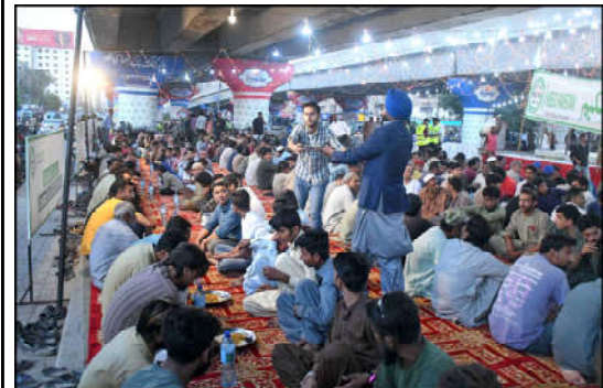
KARACHI: People break their fast during the Muslim's holy fasting month of Ramadan at a free meal distribution point run by a charity group, in Karachi, Pakistan.