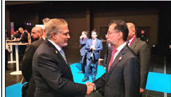
ISLAMABAD: Foreign Minister Mohammad Ishaq Dar meets with the UAE Minister of Energy and Infrastructure, Almazrouel Suhail on the margins of the Nuclear Energy Summit in Brussels.

"This framework will be aligned with the five new economic corridors to advance Pakistan's prosperity in each sector under the vision of Prime Minister Shehbaz Sharif," emphasized the Minister highlighting the importance of accelerating Pakistan's export capabilities through enterprise development and job creation.