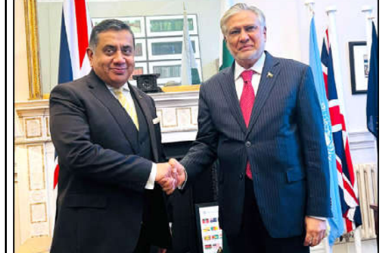
LONDON: Foreign Minister Mohammad Ishaq Dar shakes hand with UK Minister of State for South Asia and Commonwealth, Lord Tariq Ahmad.

ISLAMABAD (INP): The International Monetary Fund (IMF) has demanded Pakistan to implement 18 percent General Sales Tax (GST) on Petrol. As per details, the Monetary Fund has asked Pakistan to end sales tax relaxation on all items including petrol. The newly elected government of Pakistan should also implement sales tax on petroleum products along with a Rs 60 levy to increase the tax income. Earlier, the International Monetary Fund (IMF) recommended the government of Pakistan implement an 18 percent General Sales Tax (GST) on food, medicine, petroleum products, and stationery.