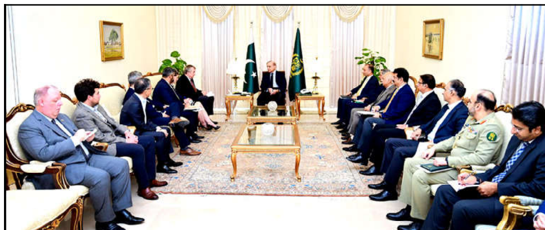
ISLAMABAD: Chief Executive Officer of Barrick Gold, Mark Bristow along with a delegation calls on Prime Minister Muhammad Shehbaz Sharif.