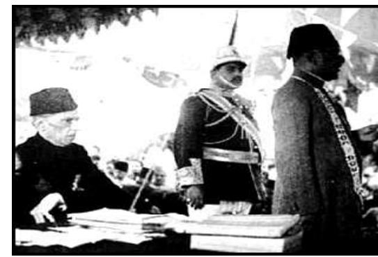
Muhammad Iqbal during historic Allahabad address in 1930.

Sir Syed's reforms had excelled Muslims in education, social, economic and political sciences, resultantly their voices have strongly been heard by the British rulers. The Muslims, under the flag of All India Muslim League (AIML) founded on December 30, 1906 at Dhaka, got united by giving new impetus to the independence movement. It witnessed further momentum after Quaid-i-Azam spearheaded independence movement after formally joining AIML in 1913 and outlining of an independent state for Muslims majority provinces in North West India by the great poet philosopher Dr. Allama