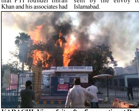
KARACHI: View of site after fire eruption at Dow University of Health Sciences Ojha Campus after a fire broken out incident as the fire brigade and rescue officials are busy in extinguishing fire during rescue operation, at Suparco road in Karachi.

document was distorted for political and personal interests, adding that the false cipher narrative of PTI will be remembered as the worst example of putting domestic and foreign interests at stake for achieving their petty political goals. US cipher Issue and Donald Lu Lu is the diplomat whose supposed warning to former Pakistan Ambassador to the US Asad Majeed was the subject of a cipher sent by the envoy to