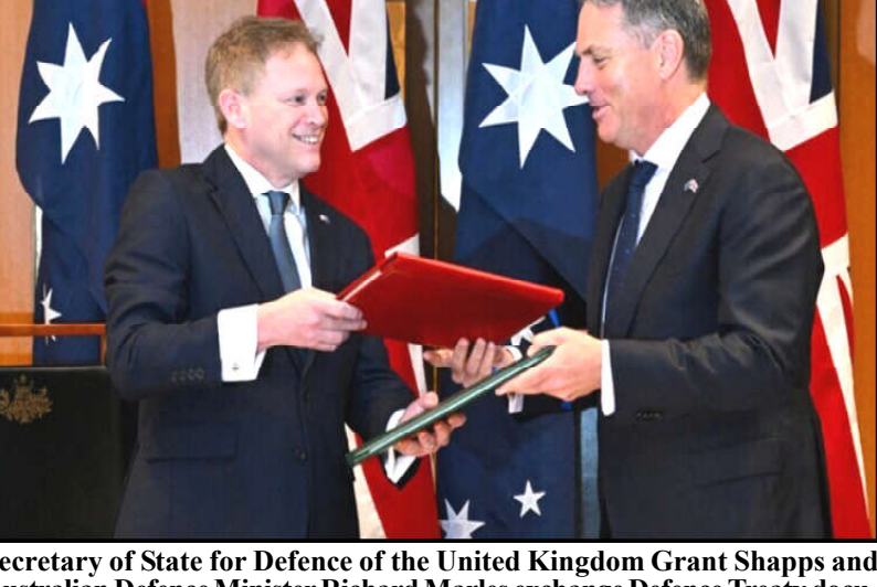
Secretary of State for Defence of the United Kingdom Grant Shapps and Australian Defence Minister Richard Marles exchange Defence Treaty documents during a meeting at Parliament House in Canberra.

On Wednesday, President Vo Van Thuong resigned due to unspecified violations that hurt the perception and reputation of the party and