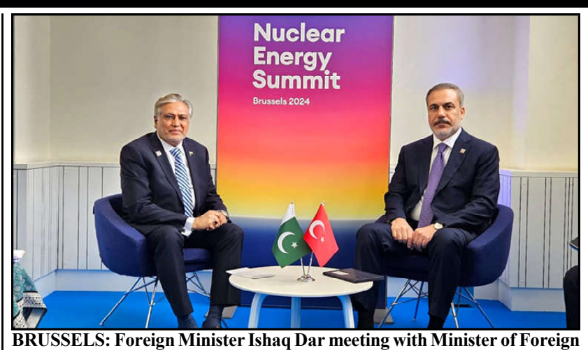
Affairs of Türkiye Hakan Fidan on the sidelines of Nuclear Energy Summit 2024 in Brussels.

the cash bag and escaped from the scene as the security guard looked away.