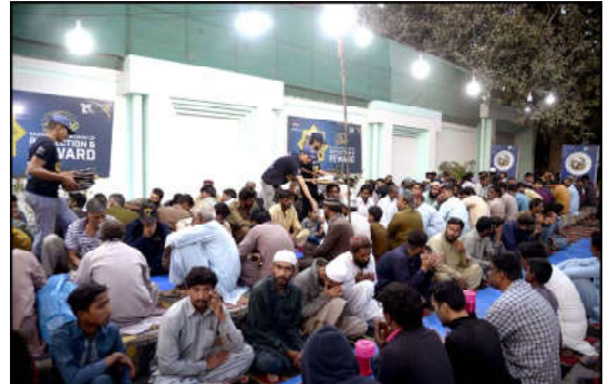
KARACHI: Faithful Muslims are breaking the fast (Iftar) under the supervision of charitable organization during the Holy month of Ramadan-ul-Mubarak, in Karachi.