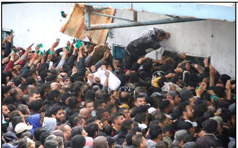
Palestinians gather to receive aid outside an UNRWA warehouse as Gaza residents face crisis levels of hunger, in Gaza City.