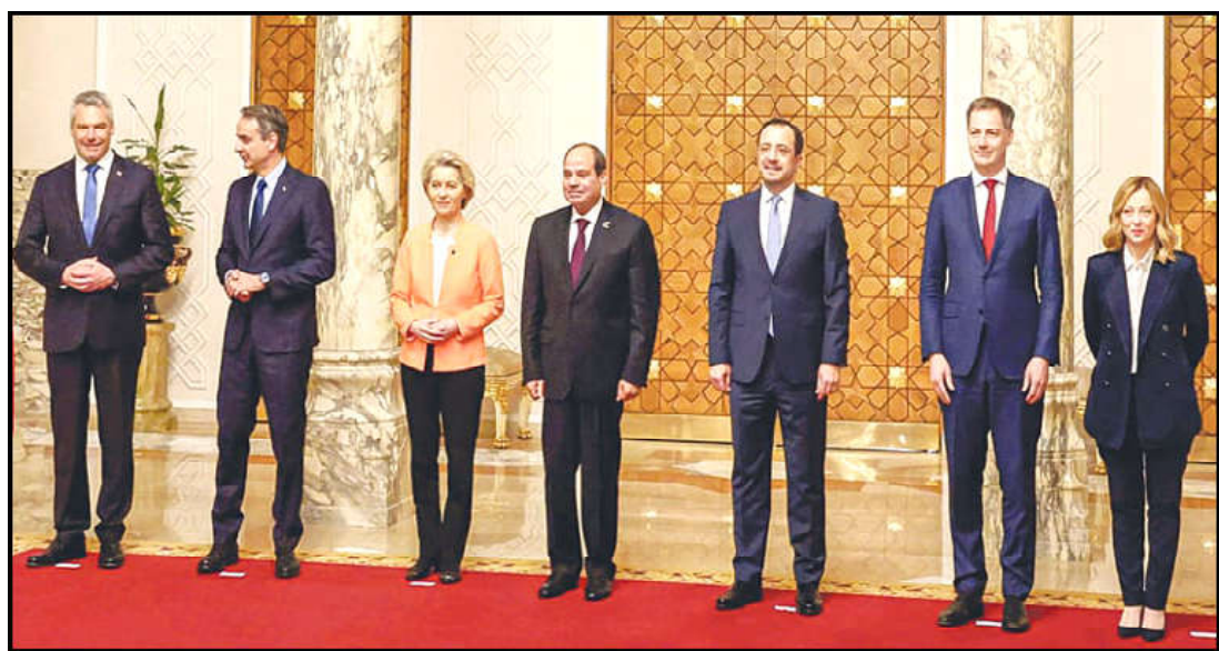
CAIRO: Austria's Chancellor Karl Nehammer, Greece's Prime Minister Kyriakos Mitsotakis, European Commission President Ursula von der Leyen, Egypt's President Abdel Fattah al-Sisi, Cyprus' President Nikos Christodoulides, Belgium's Prime Minister Alexander De Croo, and Italy's Prime Minister Giorgia Meloni posing for a photograph during their summit.

consolidated — no matter who wants to intimidate us, suppress us — nobody has ever succeeded in history, they have not succeeded now, and they will not succeed ever in the future," said Putin. Supporters chanted "Putin, Putin, Putin" when he appeared on stage and "Russia, Russia, Russia" after he had delivered his acceptance speech. Inspired by opposition leader Alexei Navalny, who died in an Arctic prison last month, thousands of opponents protested at noon against Putin at polling stations inside Russia and abroad.