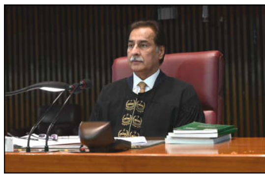
Sardar Ayaz Sadiq, Speaker of the National Assembly of Pakistan, addresses the audience during a formal event.

In a heartening display of international camaraderie, foreign dignitaries from across the globe have extended warm congratulations to Pakistan's newly elected Speaker of the National Assembly, Sardar Ayaz Sadiq. Sadiq's victory has not only resonated within the political corridors of Pakistan but has also garnered attention and felicitations from leaders worldwide.