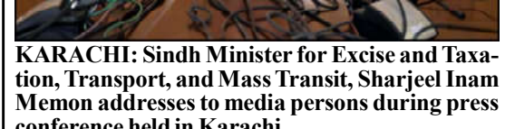
KARACHI: Sindh Minister for Excise and Taxation, Transport, and Mass Transit, Sharjeel Inam Memon addresses to media persons during press conference held in Karachi.

He underlined some one should accept mistake. What decision has been given by judiciary in Zulfiqar Ali Bhutto reference it has made an appreciable effort to set right history, he added. Justice is too right of Nawaz Sharif he said. Writing letter to IMF is tantamount to commit anti state act, he remarked. Including martyrs in differences over election is highly cheap act, he said adding a political party launched campaign against the martyrs on social media.