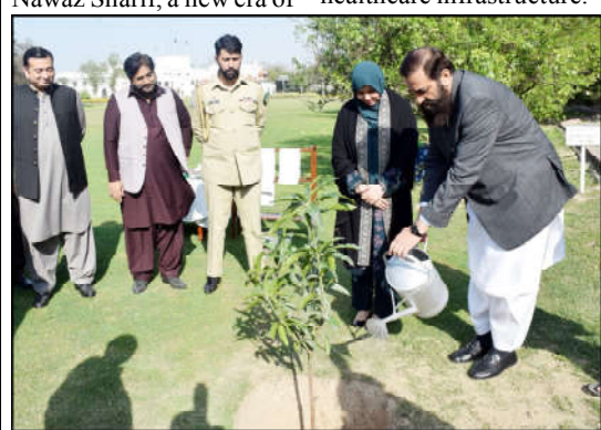
LAHORE: Punjab Governor Muhammad Balighur-Rehman along with his wife sapling a tree to inaugurate plantation campaign.