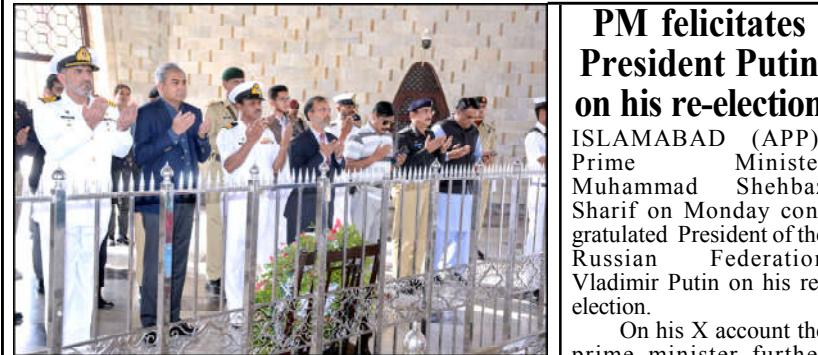
KARACHI: The Federal Minister for Interior Syed Moin Raza Naqvi offering Fataha at the mausoleum of father of the nation Quaid-e-Azam Mohammed Ali Jinnah during his first visit to the city.

Currently, the Turkish schools are operating in Karachi, Hyderabad and Mirpurkhas.