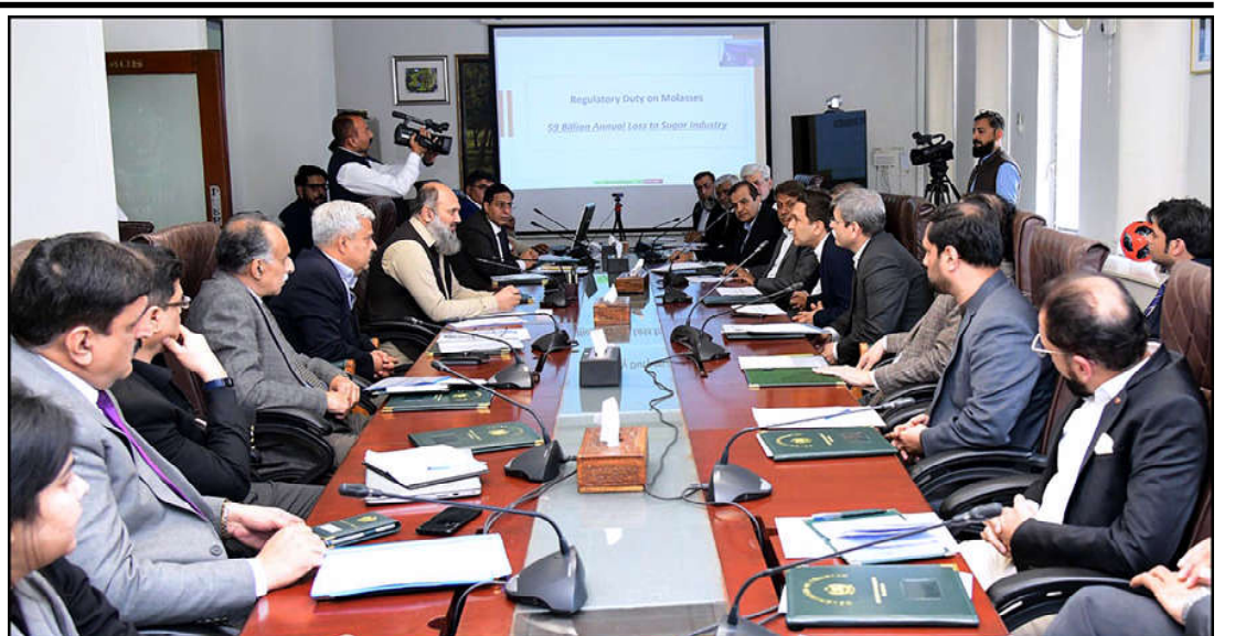
ISLAMABAD: Federal Minister for Commerce, Jam Kamal Khan, chairs significant meetings with representatives from the Sugar Mills Association and Ethanol Manufacturer Association to address pressing concerns affecting their industries.

ISLAMABAD (APP): Federal Minister for Commerce, Jam Kamal Khan here on Monday convened significant meetings with representatives of the Sugar Mills Association and Ethanol Manufacturer Association separately to address pressing concerns affecting their industries. The meetings, held in the Ministry of Commerce, aimed to foster dialogue and find feasible solutions to the challenges faced by these sectors. The associations appreciated the act of calling stakeholders before making any major decisions. During the discussions, Minister Jam Kamal assured the industrialists of his commitment to advocate for their interests and address their concerns to support the local industry while simultaneously enhancing export volume to increase foreign reserves. The Sugar Mills Association voiced apprehensions regarding the anticipated increase in tariffs for Molasses exports. Members of the association highlighted the importance of encouraging Molasses exports to bolster foreign reserves. They underscored the need for infrastructure improvements to enhance terminal capacity, facilitating greater access to international markets. Conversely, representatives from the Ethanol Manufacturer Association emphasized the necessity of long-term policy measures to sustain the domestic ethanol industry. They advocated against allowing excessive Molasses exports, citing the adverse impact on local production.