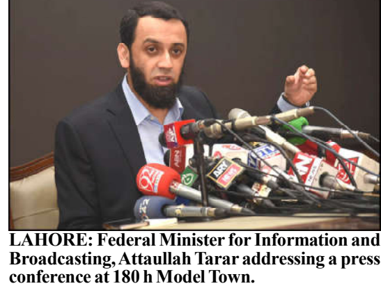
Thai CG attends

sewerage, street lights, bridges and flyovers, he said. He said that the 16000 road of Korangi was also built and the flyover at Korangi number 2 ½ was also built by the PPP government. Mayor Karachi said that Mehrun Nisaa Hospital Road UC-10 will also be constructed for which PC-1 has been prepared.