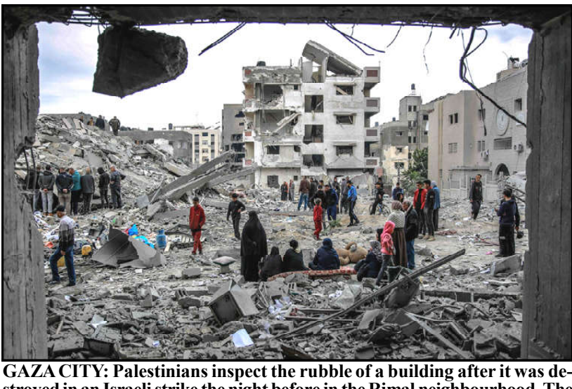
stroyed in an Israeli strike the night before in the Rimal neighbourhood. The head of Israeli intelligence is expected to lead ceasefire talks in Qatar in response to a new proposal from Hamas.

ters have been throwing about terms like "eco ter-rorists" and "Green Talibans" to describe nonviolent activists, he claimed, also blaming some media reporting for contributing to an increasingly hostile public attitude. "It creates a sort of chilling effect," warned Forst, an independent expert appointed under the UN's Aarhus Convention — a legally-binding text that provides for justice in environmental matters.