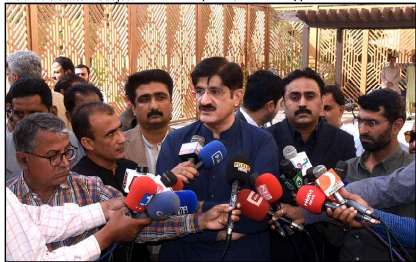
KARACHI: Sindh Chief Minister, Syed Murad Ali Shah talking to media persons, at Sindh Assembly in Karachi.