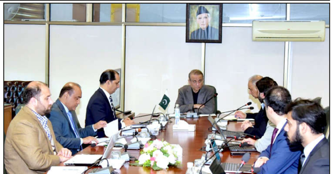
ISLAMABAD: Federal Minister for Privatisation, Abdul Aleem Khan chairing a meeting with the financial advisors for divestment of PIACL.