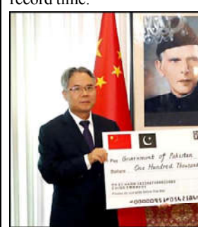
ISLAMABAD: Ambassador of the People's Republic of China Ambassador Jiang Zaidong handed USD 100,000 emergency cash assistance to the Foreign Secretary of Pakistan Mohamud Syrus Sajjad Qazi for rains affected areas in KP and Balochistan.

The ambassador appreciated the performance of Mohsin Naqvi for completing public projects in Punjab with exceptional speed and high quality in record time.