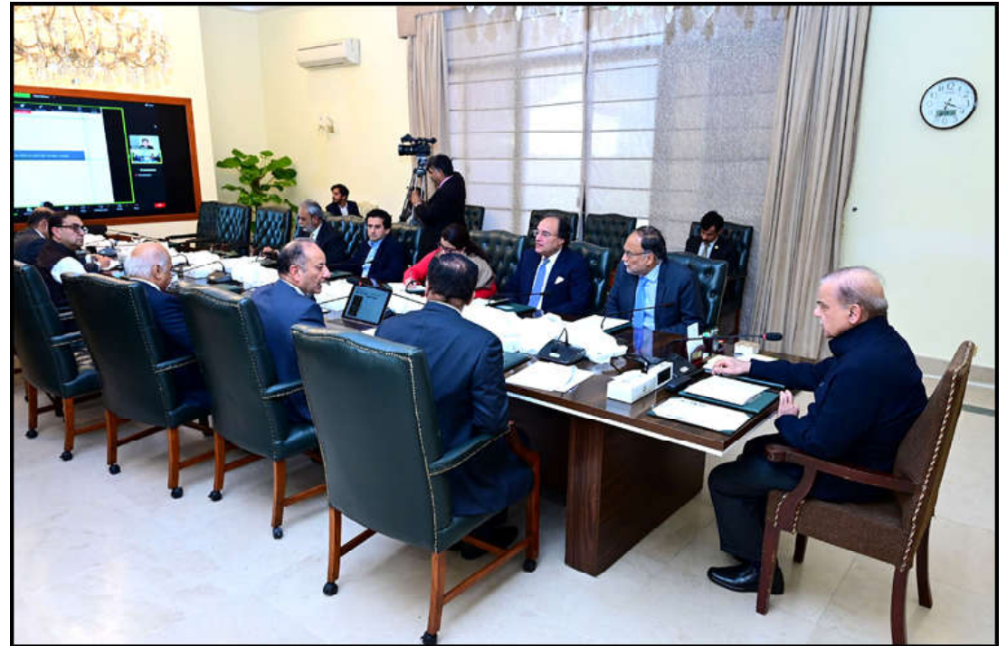
ISLAMABAD: Prime Minister Muhammad Shehbaz Sharif chairs a meeting regarding Economic Roadmap for next 5 years.