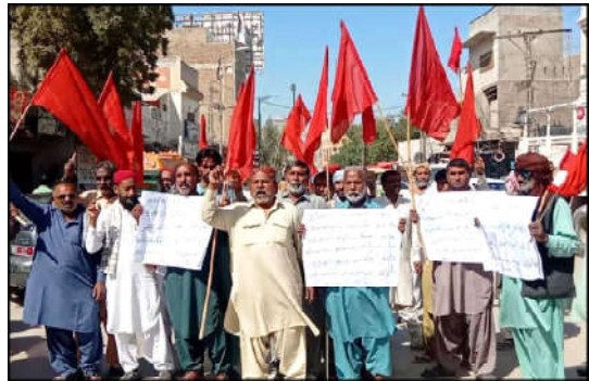
LARKANA: Members of Highways Workers Union are holding protest demonstration for acceptance of their demands, at Jinnah Bagh in Larkana.