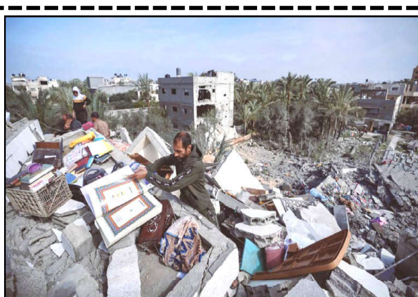
GAZASTRIP: A man salvages items from the rubble of the Al-Atrash family home, after it was destroyed in an Israeli strike in Deir el-Balah.