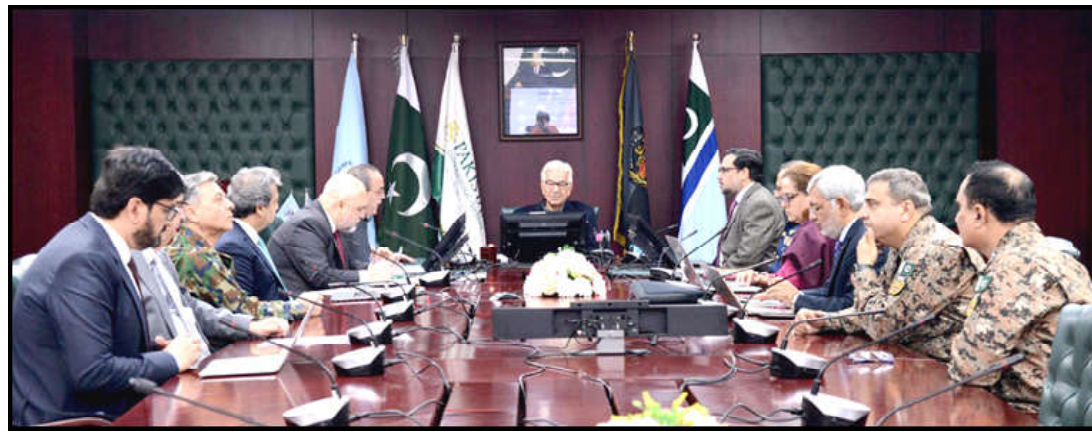
ISLAMABAD: Federal Minister Khawaja Muhammad Asif presided over meeting wherein he was given detailed briefing on role of Ministry of Aviation and its attached entities.