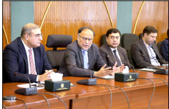
ISLAMABAD: Ahsan Iqbal, Federal Minister for Planning, Development & Special Initiatives, delivers a speech to the senior management at the Ministry of Planning.

Of particular contention was the provision of subsidised gas to fertilizer plants, with the IMF adamantly calling for its discontinuation. Concrete steps to combat electricity and gas theft were also underscored as non-negotiable requisites for the loan program.