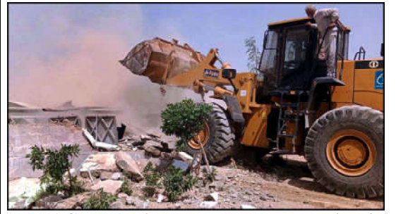
KARACHI: Anti encroachment operation in progress removed illegal encroachment during anti encroachment drive under the supervision of Karachi Development Authority (KDA), at Surjani Town Sector 13/7 in Karachi.

He directed the Assistant Commissioners (AC) to ensure sale of edible items