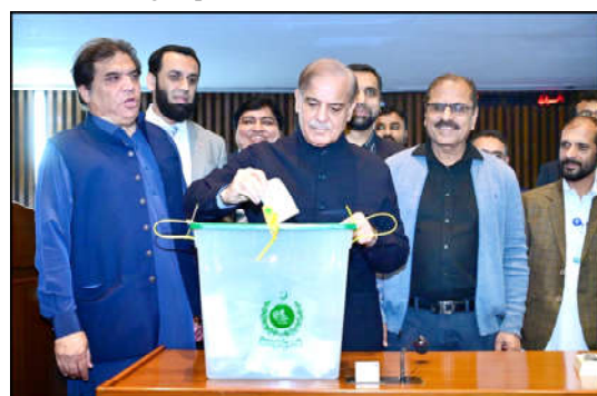
ISLAMABAD: Prime Minister Muhammad Shehbaz Sharif casts his vote in the Senate by-elections at the Parliament House.

The PM said tax revenue would be increased with digitalization and technology, while the per acre yield in the agriculture sector would also be increased with the use of technology. The loss-making government institutions would be privatized on priority basis, he added.