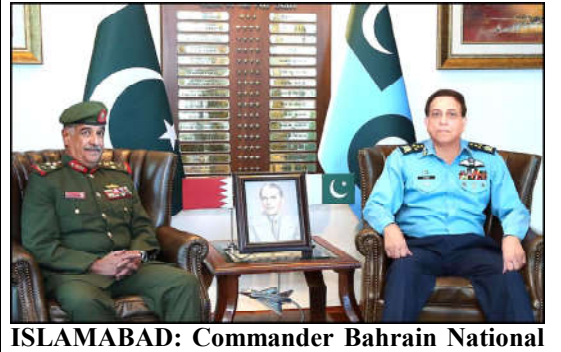
ISLAMABAD: Commander Bahrain National Guard, General Shaikh Mohammed Bin Isa Salman Al Khalifa called on Air Chief Marshal Zaheer Ahmad Baber Sidhu Chief of the Air Staff Pakistan Air Force at Air Headquarters.

The Federal Minister for Planning stressed the importance of networking so that the best abilities of the entire nation can be utilized. He instructed officials to ensure top-level efficiency.