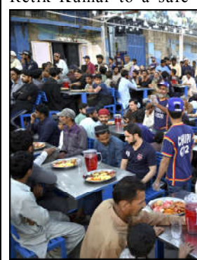
KARACHI: A large number of needy people are being served at Chhipa Head Office.